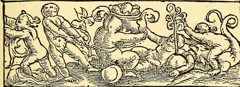
The Title-page of the Wittenberg Edition of the Farrago