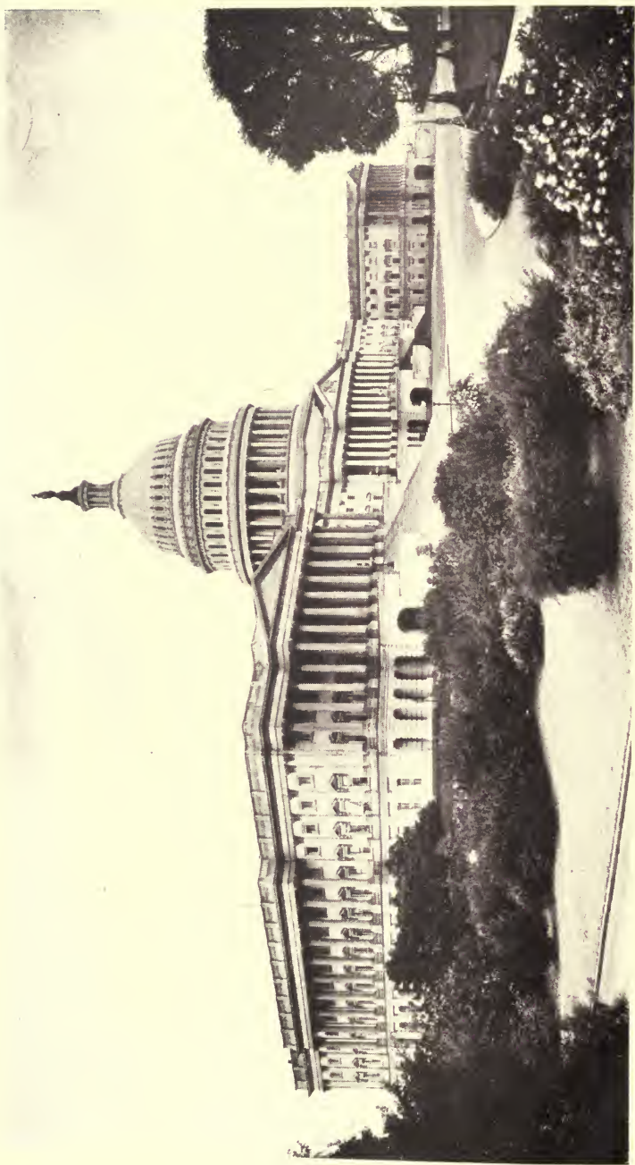
U.S. CAPITOL, WASHINGTON.