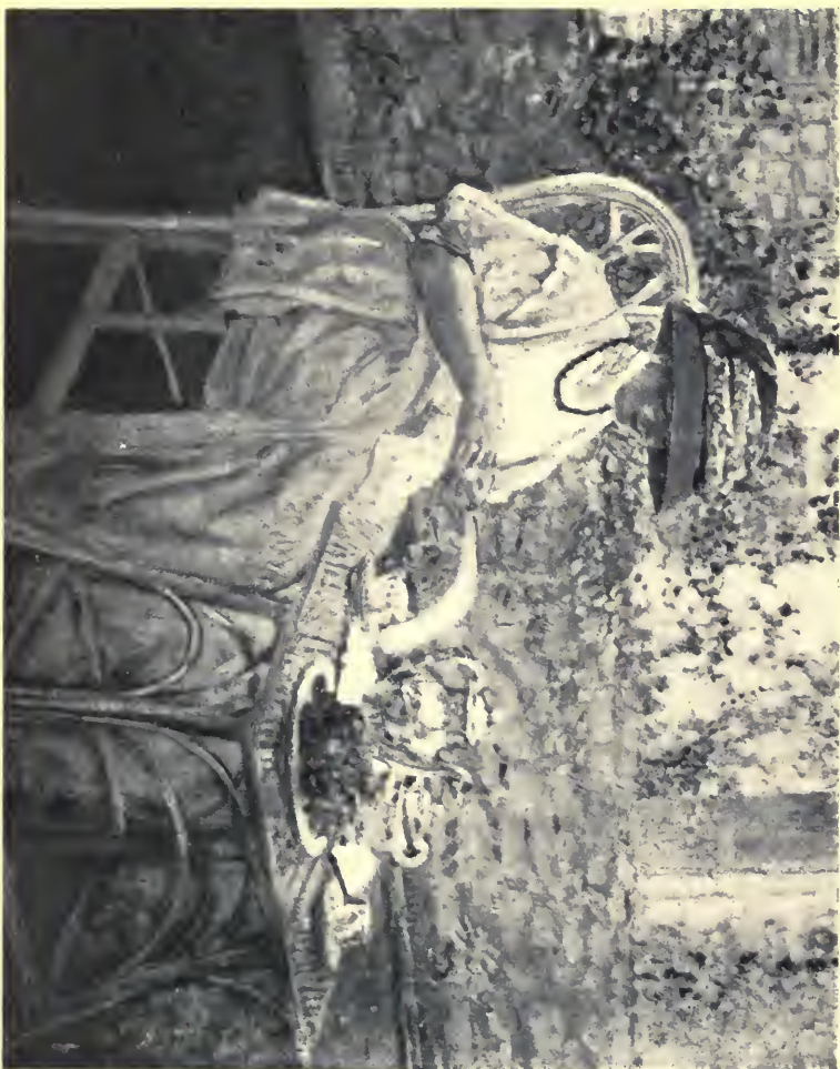
FREDERICK C. FRIESEKE