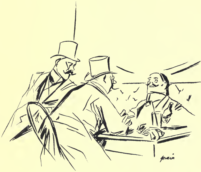
FORAIN Le Café