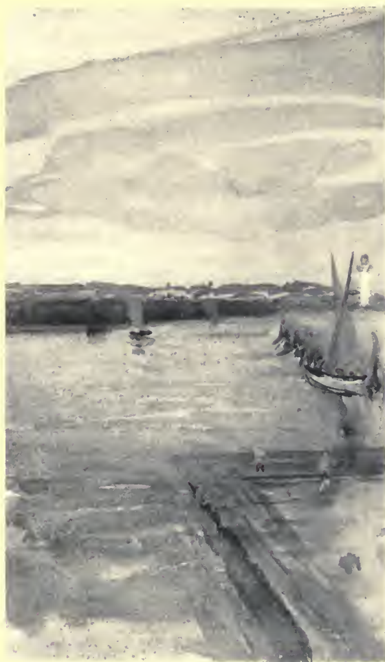
WHISTLER On the Mersey