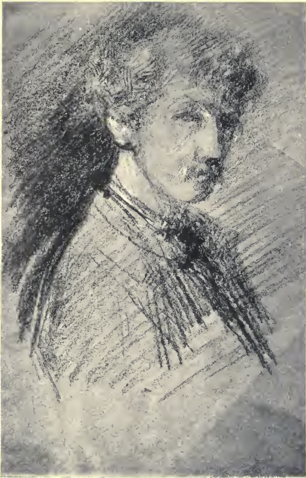
WHISTLER Portrait of the Artist