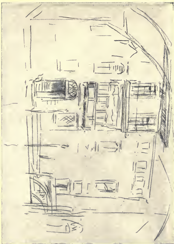
WHISTLER A Venetian Palace