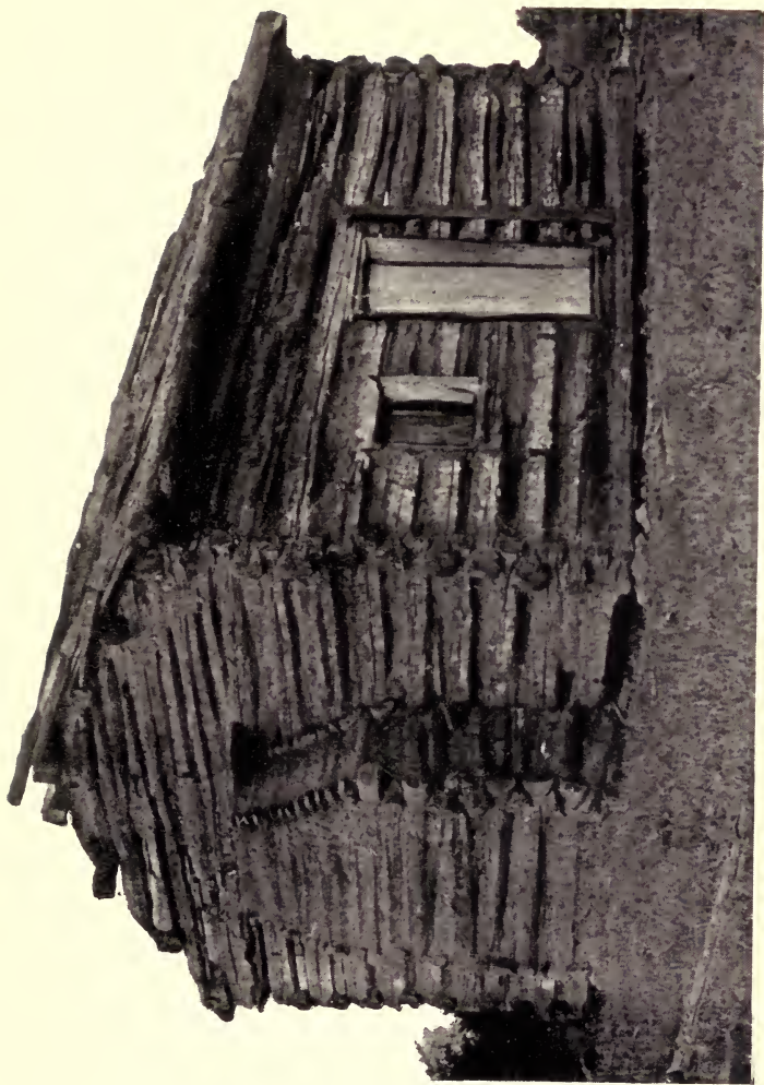
ABRAHAM LINCOLN'S BIRTHPLACE NEAR HODGENSVILLE, KENTUCKY