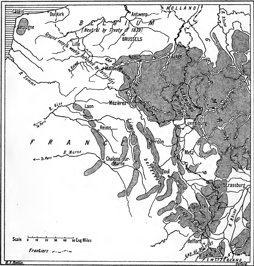
The shaded portions represent higher ground.