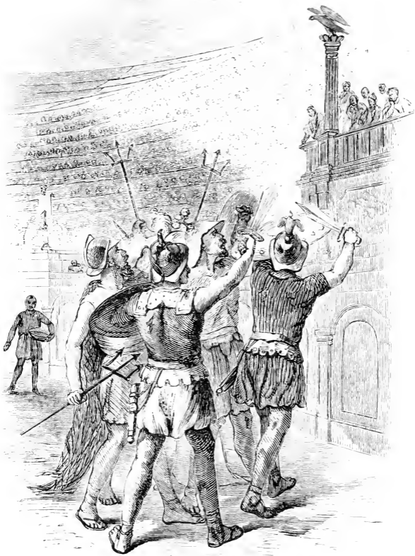
ROMAN GLADIATORS SALUTING THE EMPEROR.