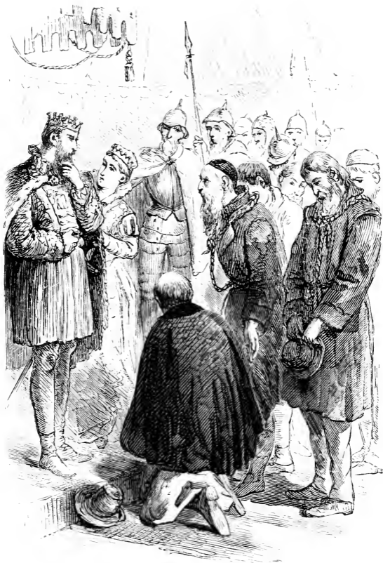
THE BURGHIERS OF CALAIS AND KING EDWARD III.