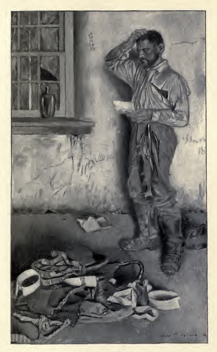
PERHAPS THE HOUSE HAD BEEN ROBBED