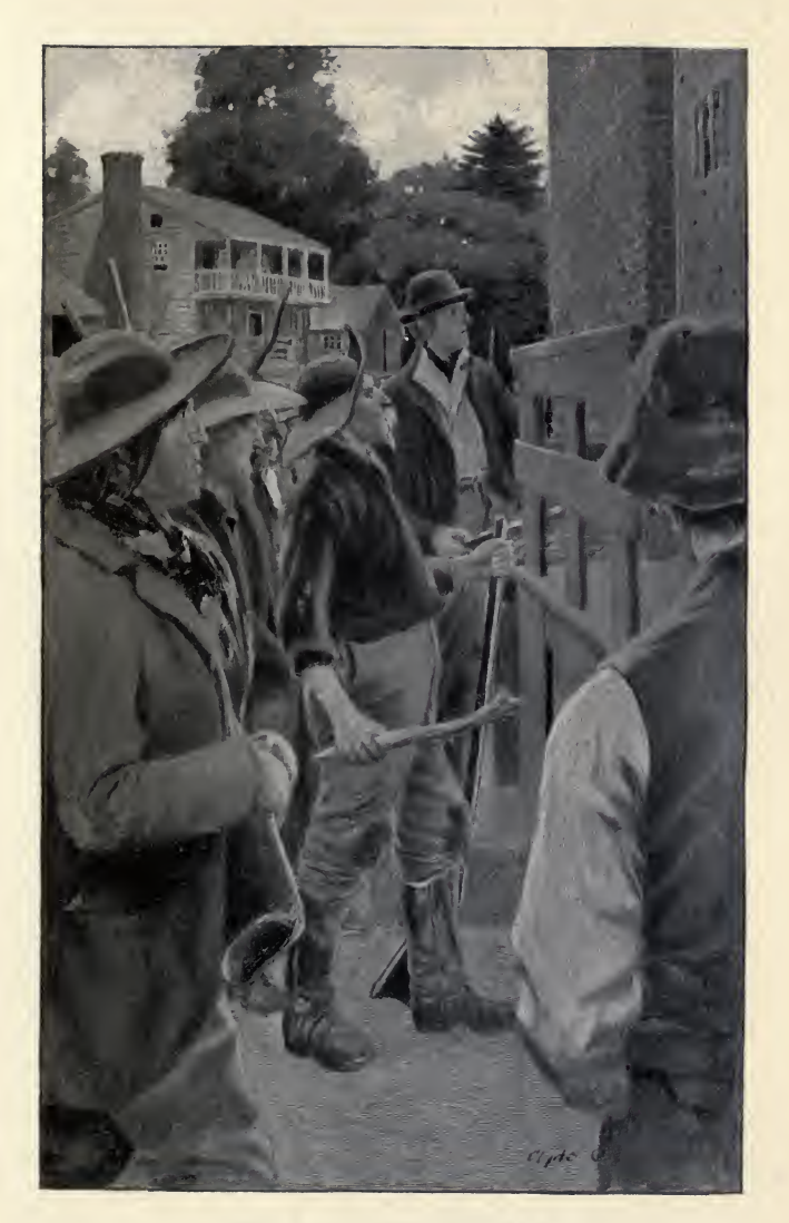
"WE'LL BU'S' THE DO' OPEN"