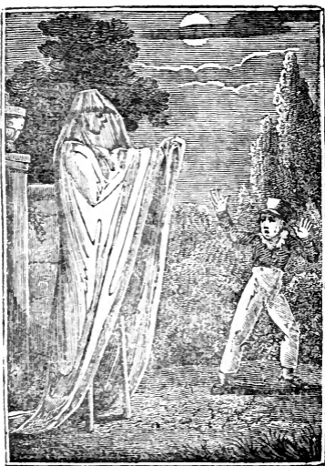
AUGUSTUS FRIGHTENING HIS BROTHER.