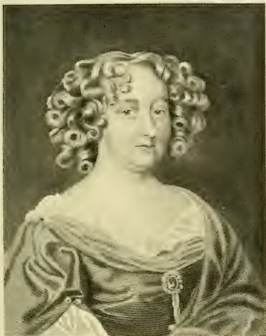
MARY RICH, COUNTESS OF WARWICK

Portrait by Sir Godfrey Kneller, 1670. Engraved by J. Smith, 1780.