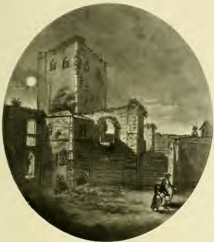
PORTCHESTER CASTLE (1799)