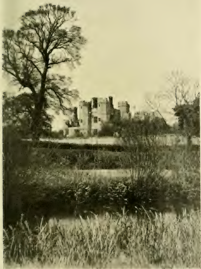
RUINS OF PLACE HOUSE, TITCHFIELD