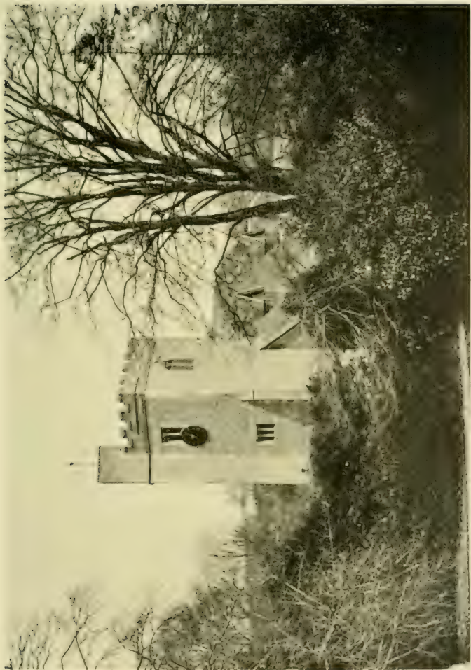
THE MANOR HOUSE, CHESHAM