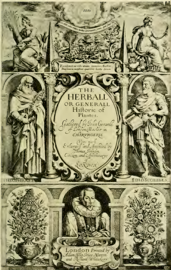
TITLE-PAGE OF GERARD'S "HERBAL"