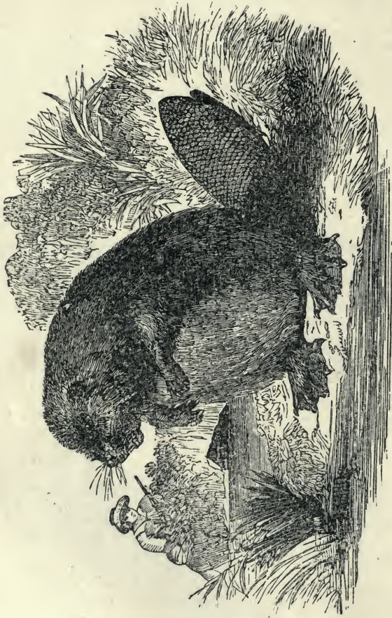
A BEAVER. — Page 239.