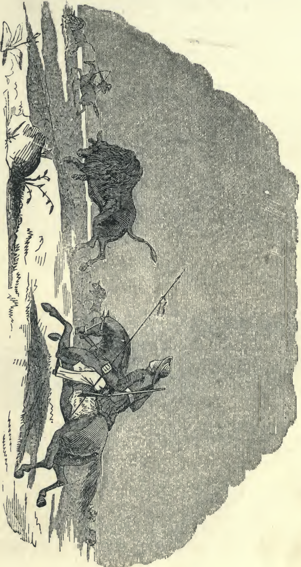
CHASING A BUFFALO.—Page 74.