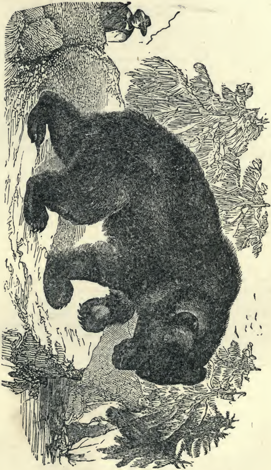
THE GRIZZLY BEAR.—Page 116.