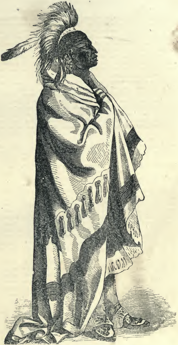
CHIEF OF THE BRULÉ SIOUX.—Page 56.