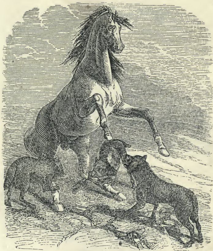
HORSE ATTACKED BY WOLVES.—Page 103.