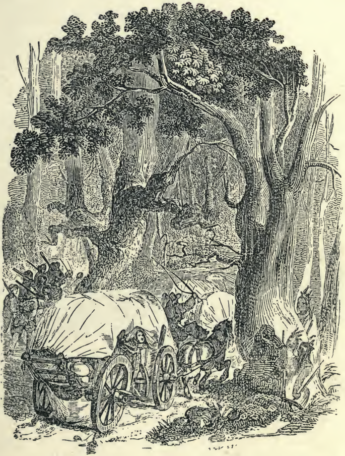
WAGON TRAIN.—Page 20.