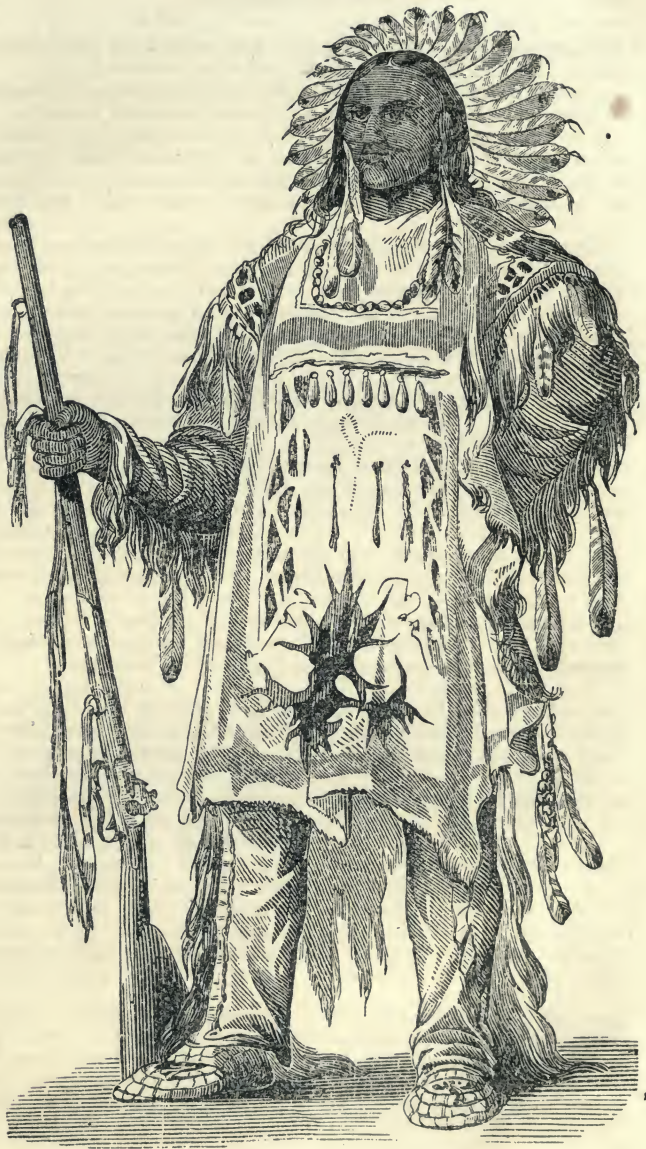
A BLACKFOOT CHIEF.—Page 166.