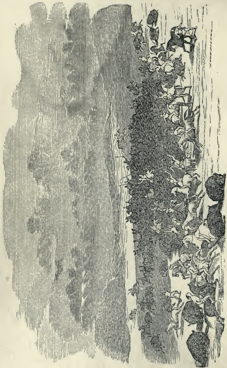
ATTACK ON A HERD OF BUFFALOES.