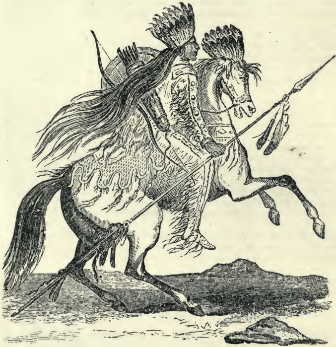
A CROW WARRIOR.—Page 125.