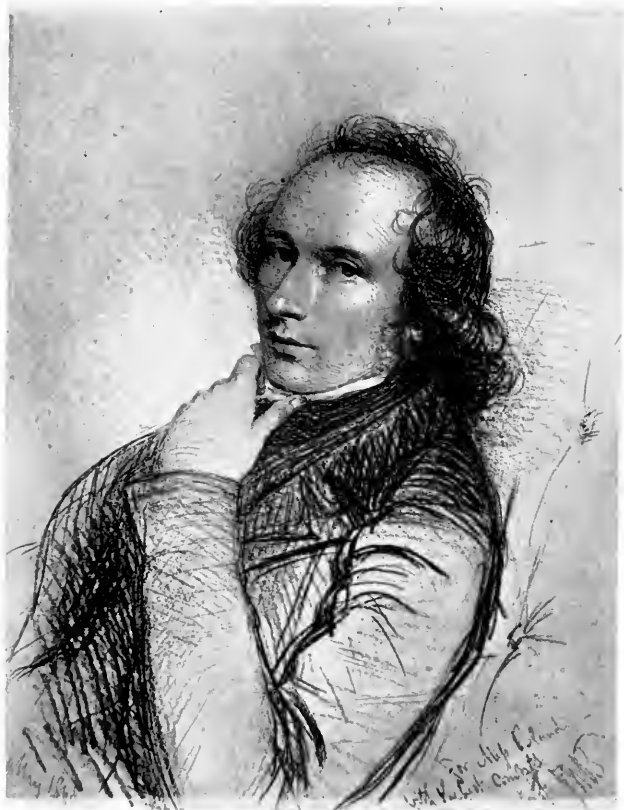
William Stokes, F.R.S. L. C. S.