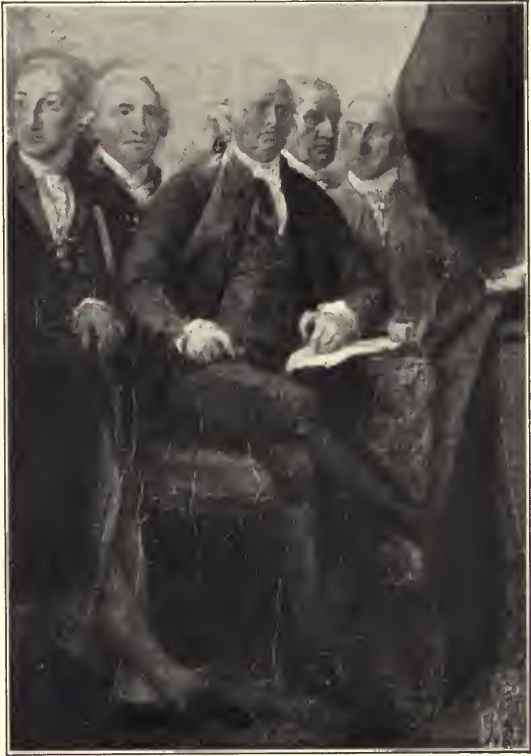
A DETAIL FROM THE TRUMBULL PAINTING OF THE SIGNERS OF THE DECLARATION OF INDEPENDENCE (JAMES WILSON IS THE CENTRAL FIGURE).