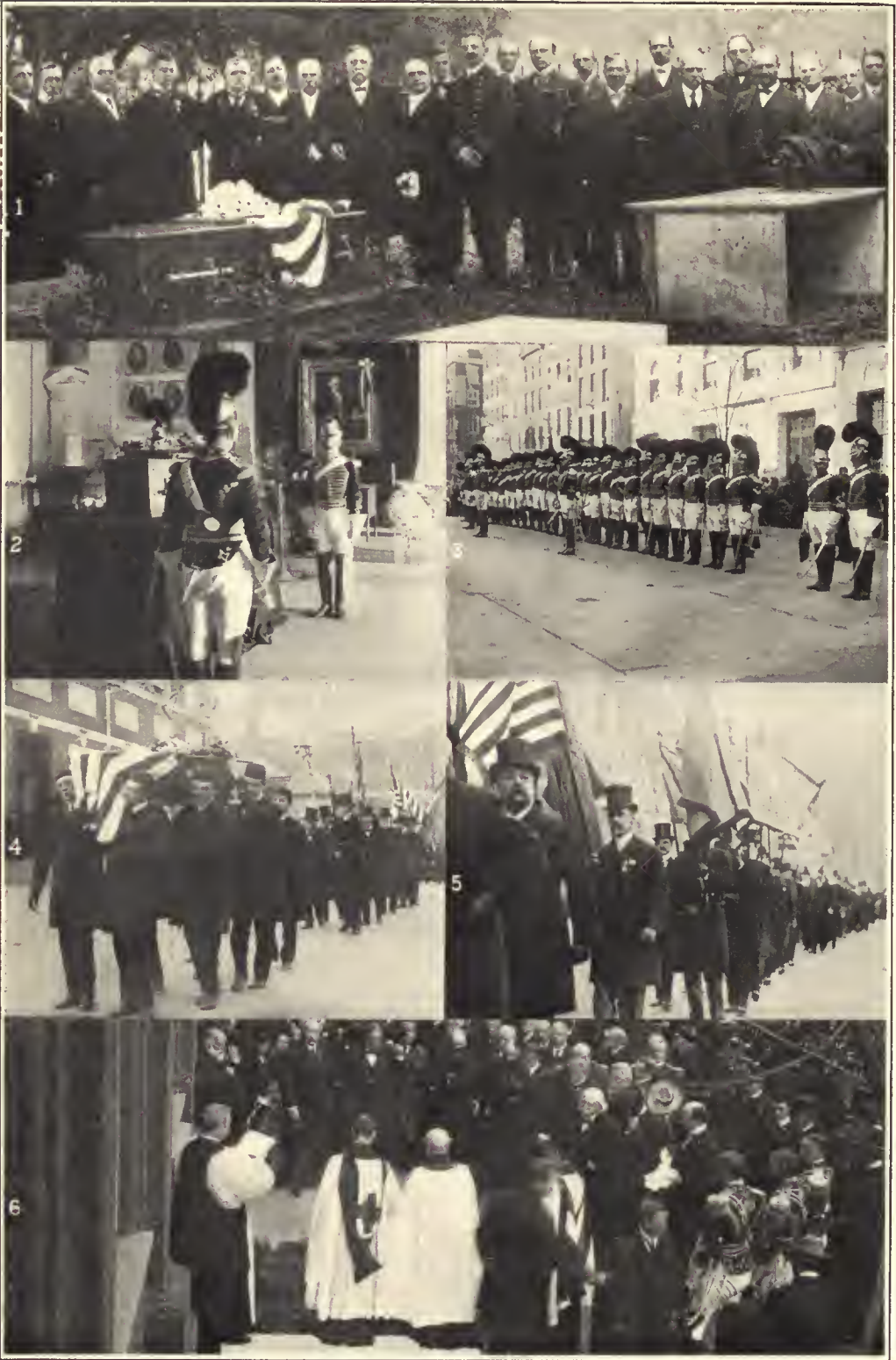
1. THE DISINTERMENT AT EDINGTON