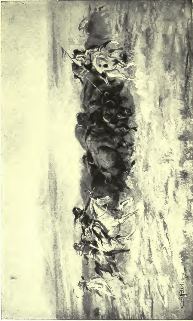
Indians Hunting the Bison in the Days of Lewis and Clark.

(From a water-color painting by C. M. Russell.)