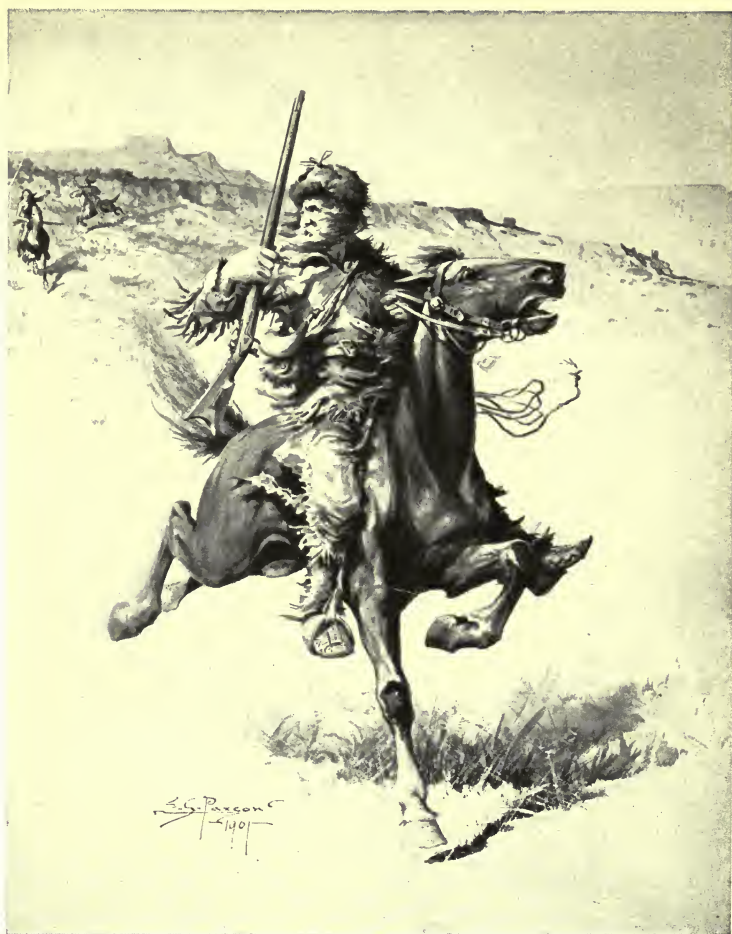
A Trapper Chased by the Blackfeet Indians.