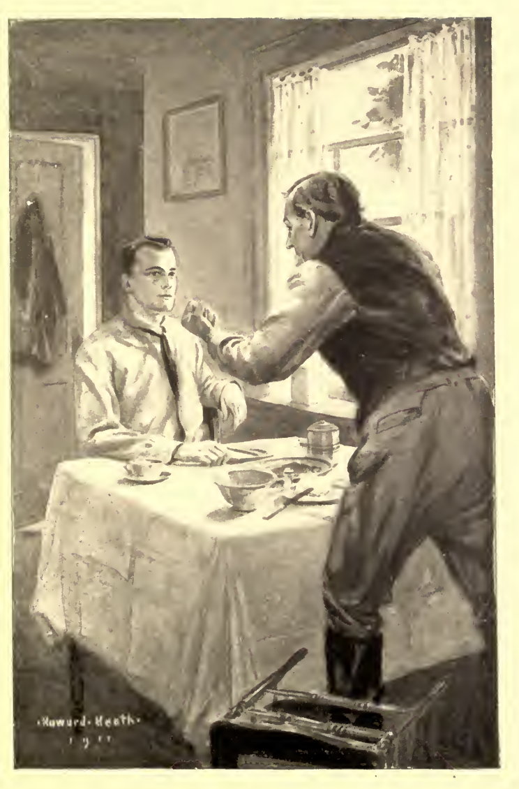
"'Who said I'd done anything? It's a lie." [Page 44.]