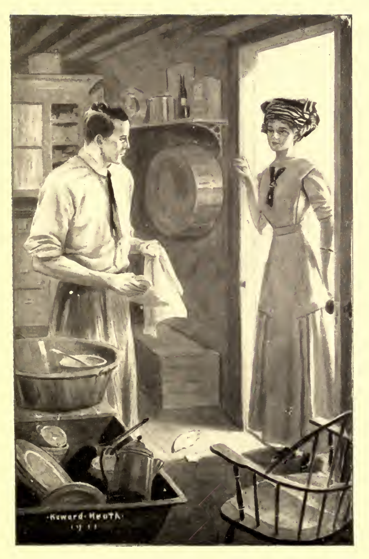
"'Don't mind me, please,' she said."