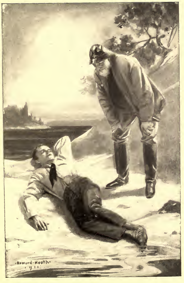
"'Gosh!' repeated Seth. . . . 'Jiminy crimps! I feel better.'"