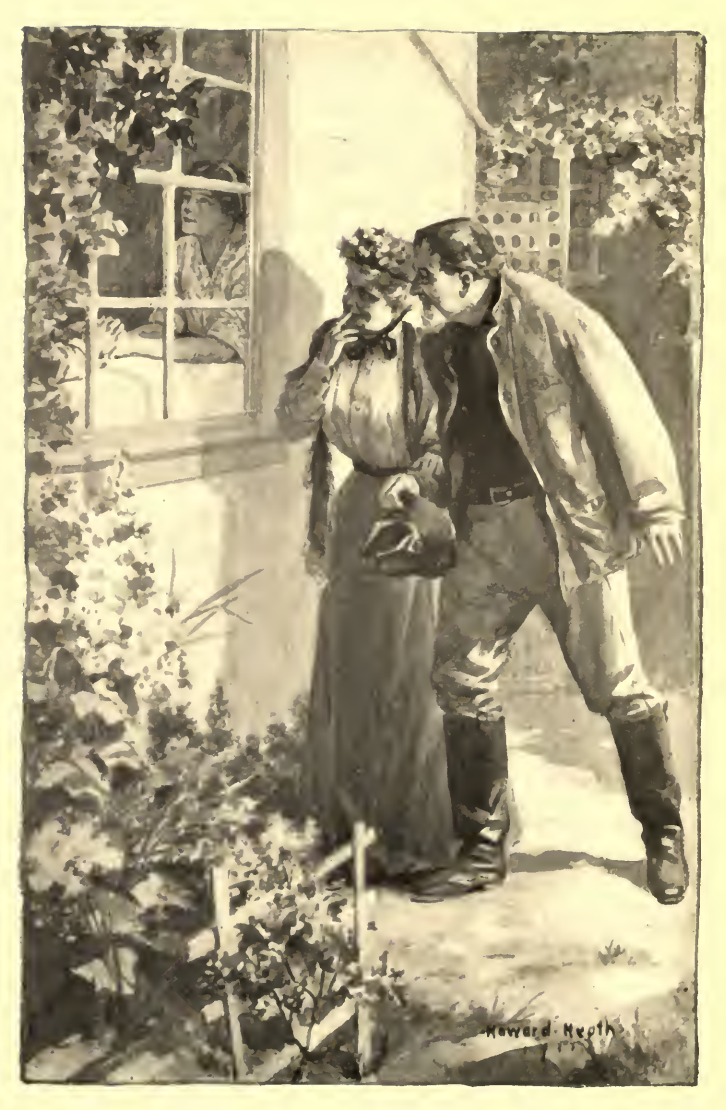
"He crept close to the bungalow window and peeped in."