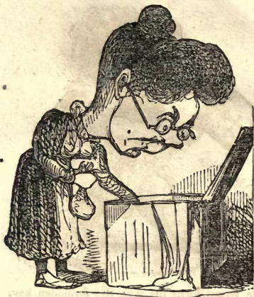
Mrs. Blue Beard examining her husband's treasures.

sils of the table used upon the occasion, were manufactured of pure gold and silver; and persons were sent many miles to procure the greatest delicacies that could possibly be obtained.