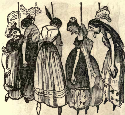
The sight that astonished Mrs. Blue Beard and her sister.

this noble apartment, artificial fountains were playing the most odoriferous waters. The most luxuriant fruit-trees, standing in vases of gold, invited the guests to pluck the delicious fruits they bore.