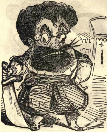
Mr. Blue Beard in a passion.

member this, as you value my love and your own life and happiness.