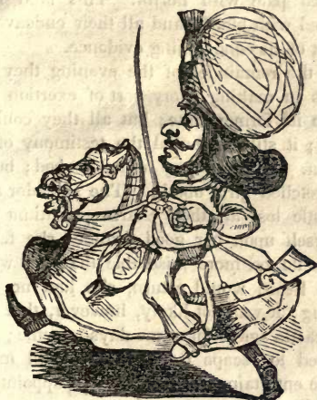
The Brother arrives.

in her hand: she hastily snatched it from the floor; and having summoned sufficient courage to close the shutters, she came out of this dreadful apartment, and locked the door.