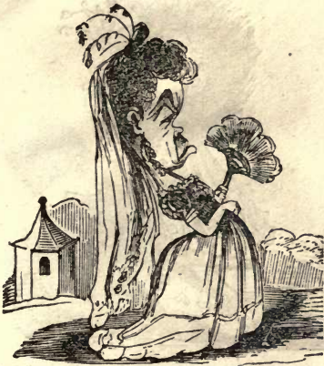
Blue Beard's chosen love.

ers perfumed the air; fountains were playing in every direction; and alcoves were found in every inviting spot. Having passed through these delightful grounds, they reached the castle itself; at the entrance of which they were received by Blue Beard, and a retinue of servants in the most costly dresses. The hall was large and very lofty; its roof was supported by pillars of the finest marble; the windows were of beautiful stained glass; and upon the walls were hanging the portraits of the former possessors of this noble building.