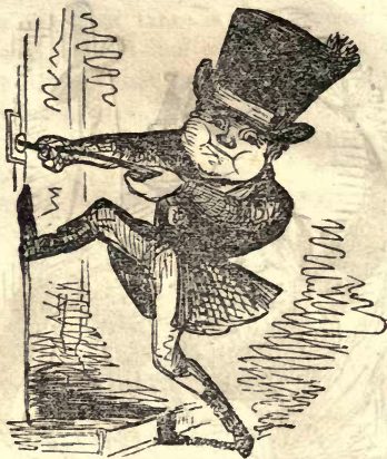
Blue Beard's servant announces his master's intention of coming a courting, to an interesting young lady.

greater pains to show themselves off, than they employed in preparing for their appearance at the castle. But, in truth, neither of them liked him. Such, however, is the thoughtless pride of some young ladies, that scarcely any thing pleases them so well as an opportunity of surpassing each other in displaying off their dress, jewels, or other finery.