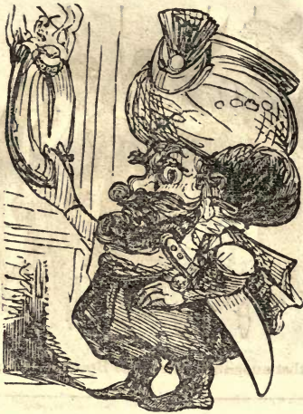
Blue Beard comes home.

scription of amusement, was continued, until folding windows opened, as if of their own accord, and disclosed a covered path through the most delightful part of the gardens, to a room in which supper was prepared: this path was entirely illuminated by splendid lamps; and the most brilliant fireworks were unremittingly discharged by artists engaged for the purpose.