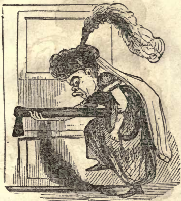
Mrs. Blue Beard opens the door of the forbidden chamber.

When the morning arrived on which this interesting ceremony was to take place, the day had scarcely dawned when sounds of joy were heard. The servants arose to prepare for the series of magnificence that was to take place; but none of them were moving about earlier than the bride and bridegroom; who, as they were the most immediately interested, were also the most anxious, and therefore among the most early, in preparing for the events of the day.