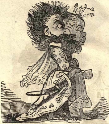
The happy couple on their way home from church.

mented with needle-work that must have occupied the labour of years; the curtains were of satin, but were adorned in a manner to correspond with the carpets: in short, every thing was more splendid than words can describe.