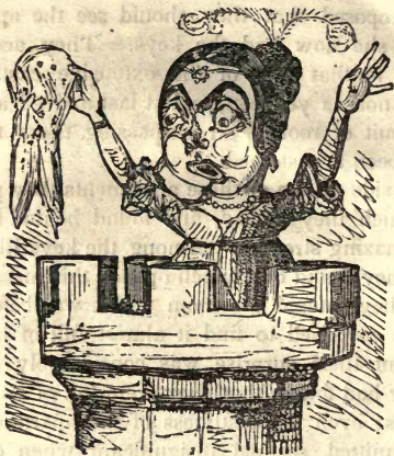
Miss Anna on top of the tower, on the lookout for her brother.

resolved to gratify her irresistible curiosity, and put the key to the door.