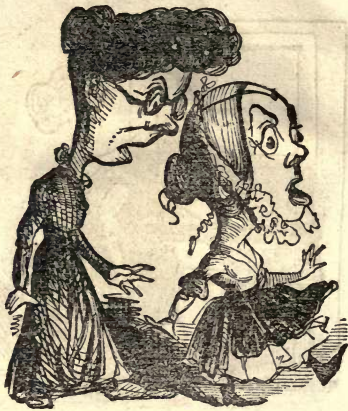
Mrs. Blue Beard and her sister considerably astonished.

Arabian horses; the harness was made of white silk, woven on purpose; the trappings were of pure silver; the carriage itself was chiefly formed of pearl, ivory, and silver; and was lined with white satin, beautifully embossed.