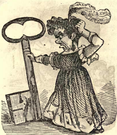
Mrs. Blue Beard in a quandary.

Some time after the marriage had taken place, however, Blue Beard informed his wife that he had occasion to take a journey on account of some business, to which he must attend; "but I beg you, my dearest Fatima, (for that was the young lady's name,) to have every sort of entertainment that can amuse you during my absence. Here are all the keys of the castle; you may therefore examine the different apartments which you have not seen; and I hope you will find some that will surprise and please you as well as those with which you are already acquainted. I must however most earnestly caution and require you not to open the blue closet at the end of the gallery; and although I leave the key of it with you, yet I trust you will have the prudence to fulfil my wishes in this particular. Re-