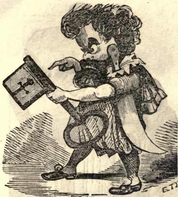
Blue Beard gives his wife the forbidden key.

ed the younger of the two ladies that have been mentioned, to consent to become his wife. The splendor of every thing around her, the immense wealth she would have at command, and the attentions she had received during her visit, completely captivated the young lady, so that she no longer felt disposed to resist; and accordingly, with her mother's approbation, they were married. She, however, agreed that her sister should live with her in the castle.