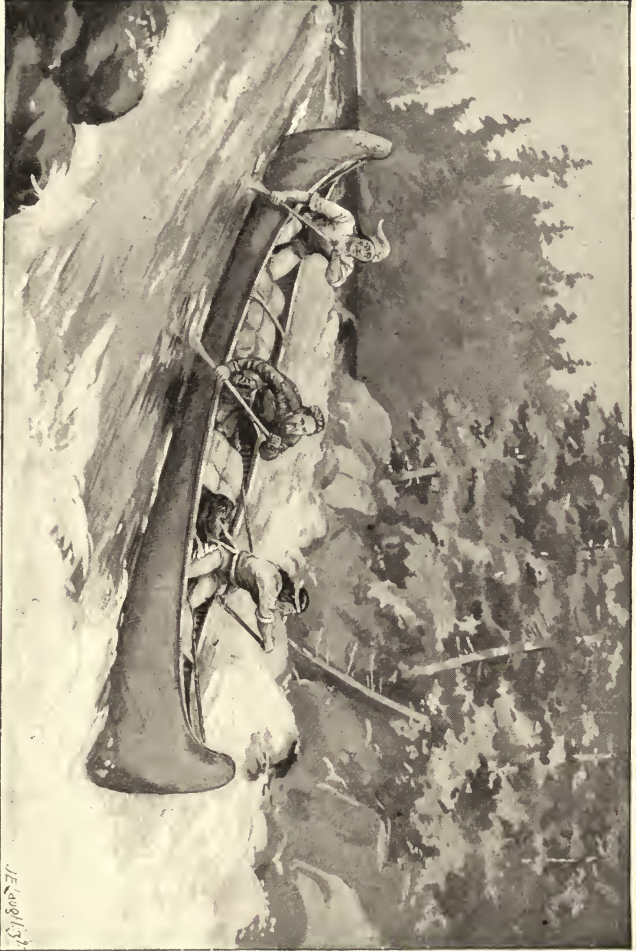
SHOOTING THE RAPIDS IN A BIRCH CANOE.