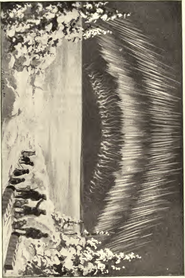
THE AURORA BOREALIS.