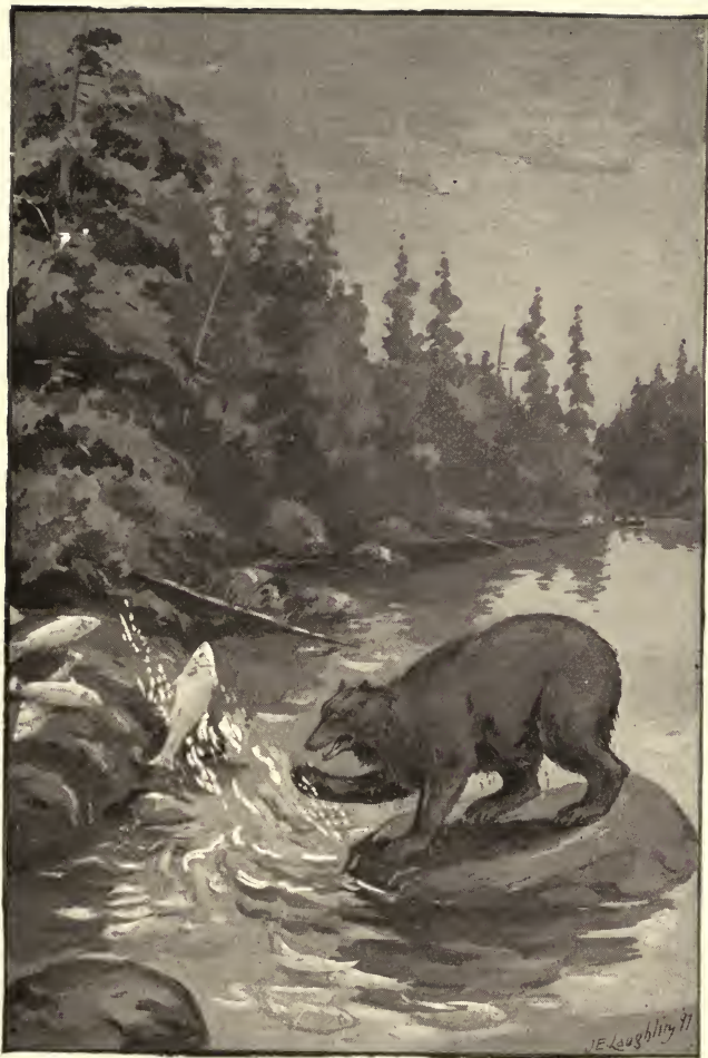
THE BEAR FISHING.