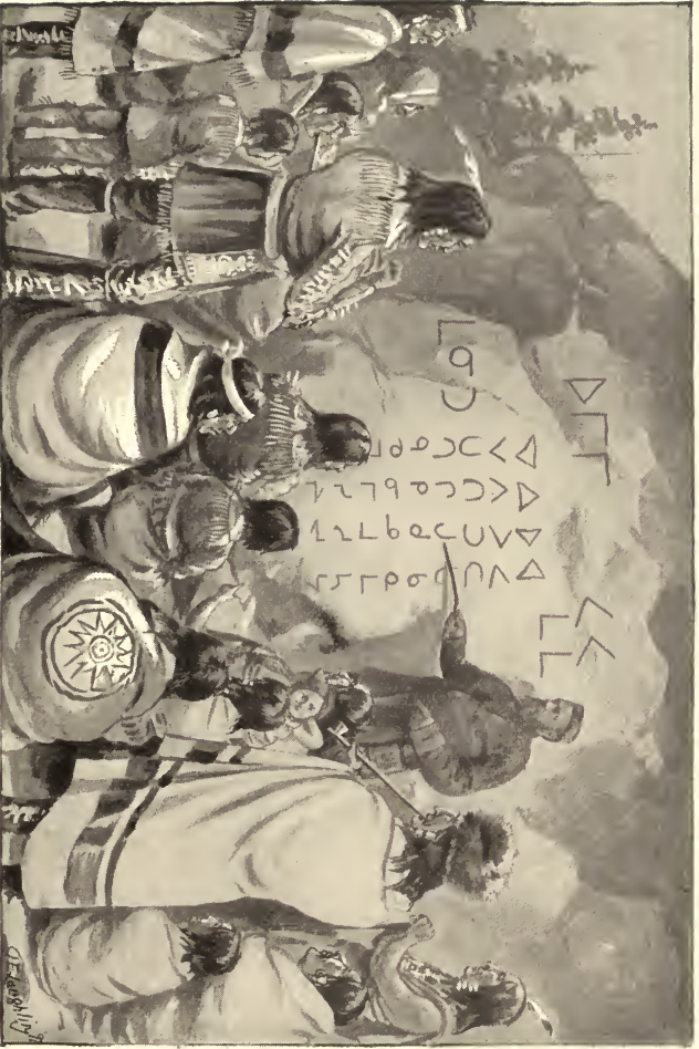
GOD ON THE ROCK.