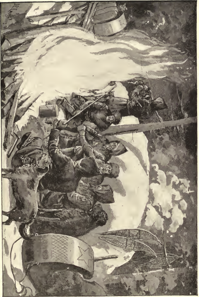
THE WINTER CAMP.