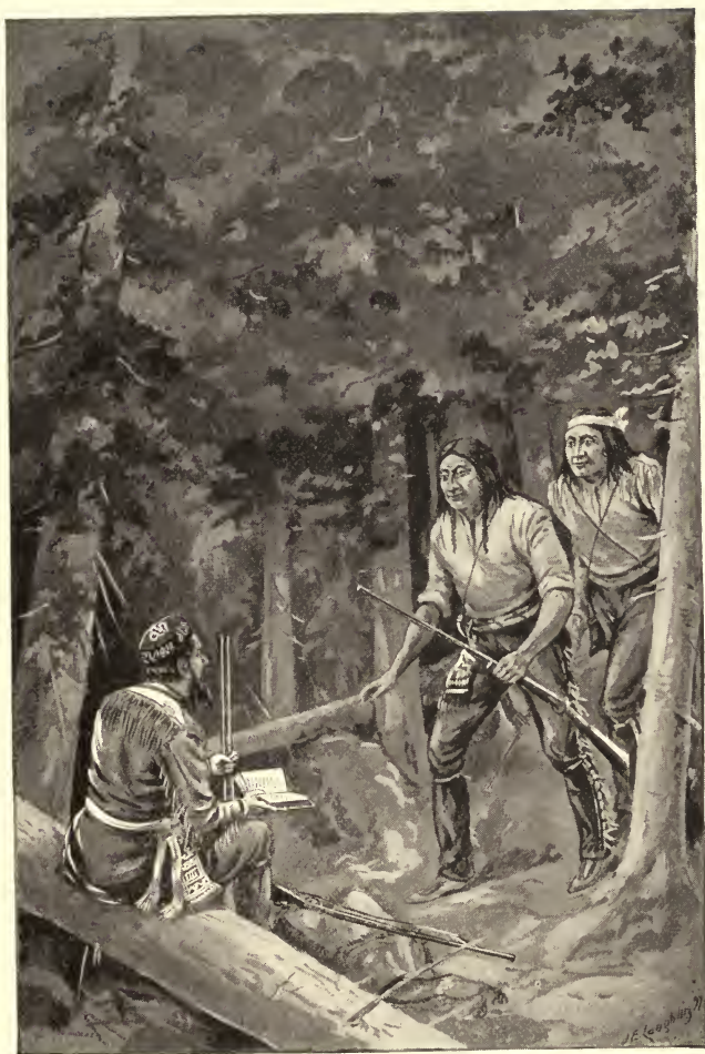
“GOOD MISSIONARY, BUT HIM LOST THE TRAIL.”