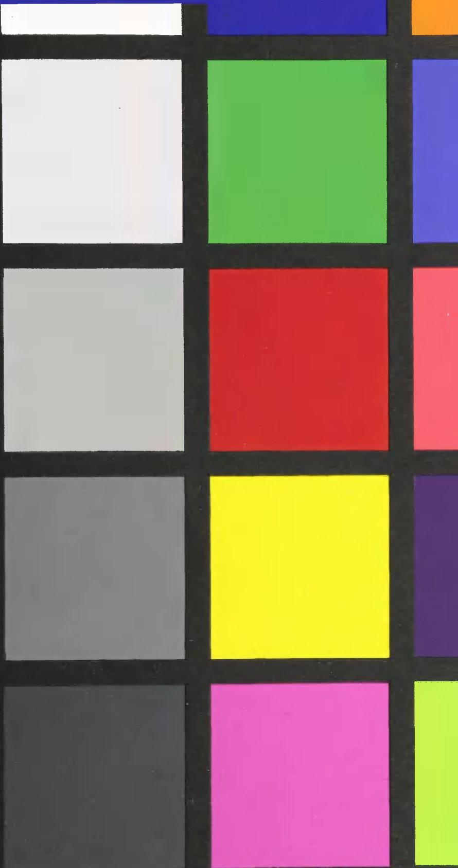
GretagMachbeth™ ColorChecker Color Rendition Chart