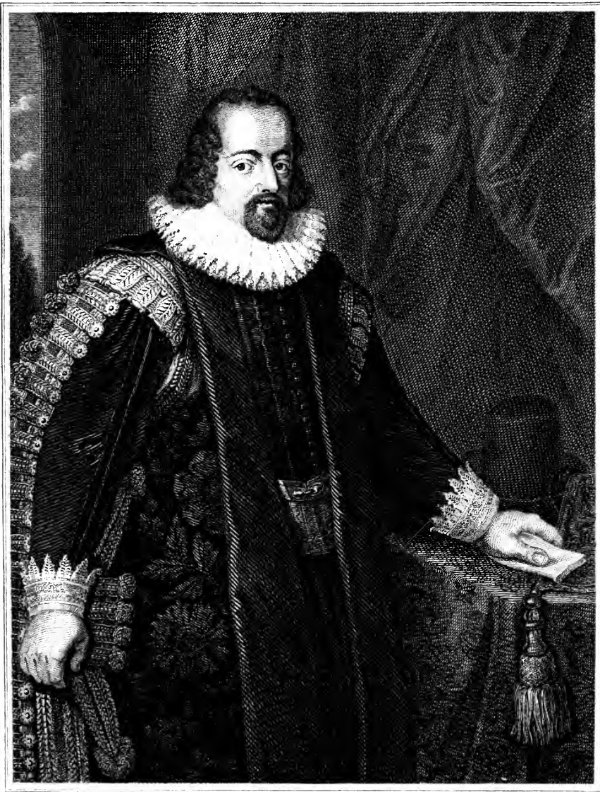
FRANCIS LORD BACON.