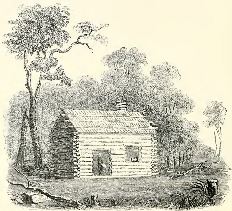
SCHOOL HOUSE OF THE SLASHES,