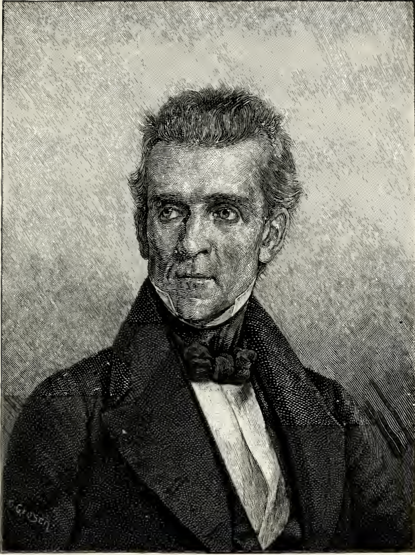
JAMES K. POLK.