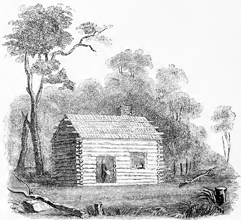
SCHOOL HOUSE OF THE SLASHES.