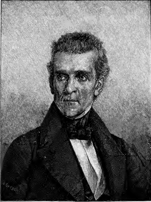
JAMES K. POLK.