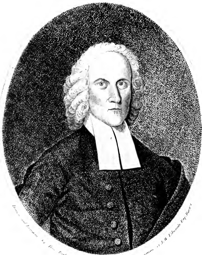
REV. JONATHAN EDWARDS, President of Middlebury College. NEW JERSEY: