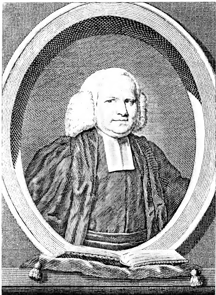
The Rev. George Whitefield: A. M. late Chaplain to the R. Hon ble the Countess of Huntingdon. Born Dec. 16. 1714 O. S. Died Sep. 30. 1770.