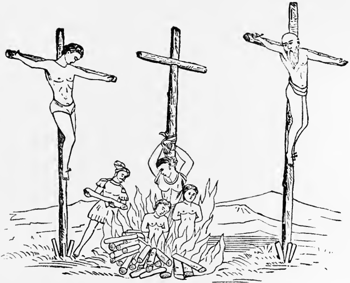
FOR THE LOVE OF GOD.