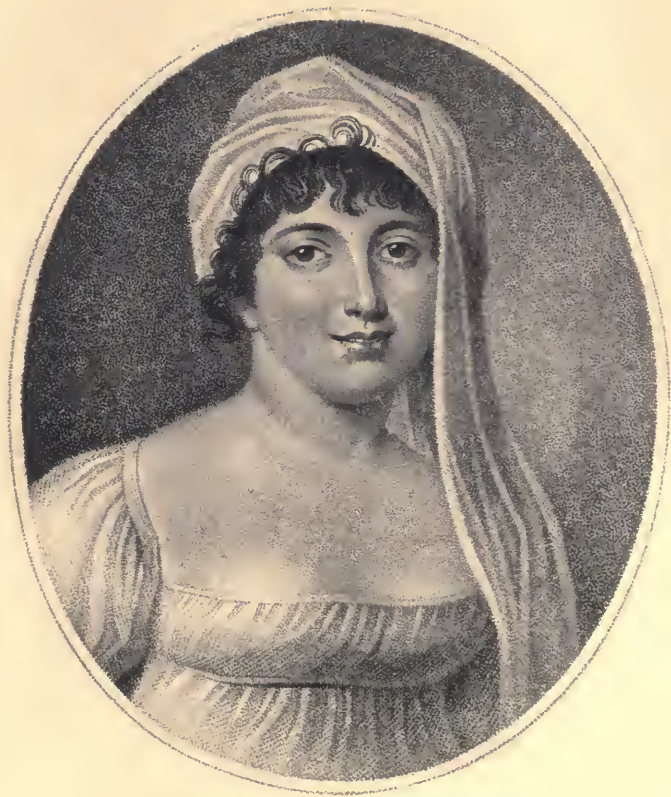
Madame de Staël.