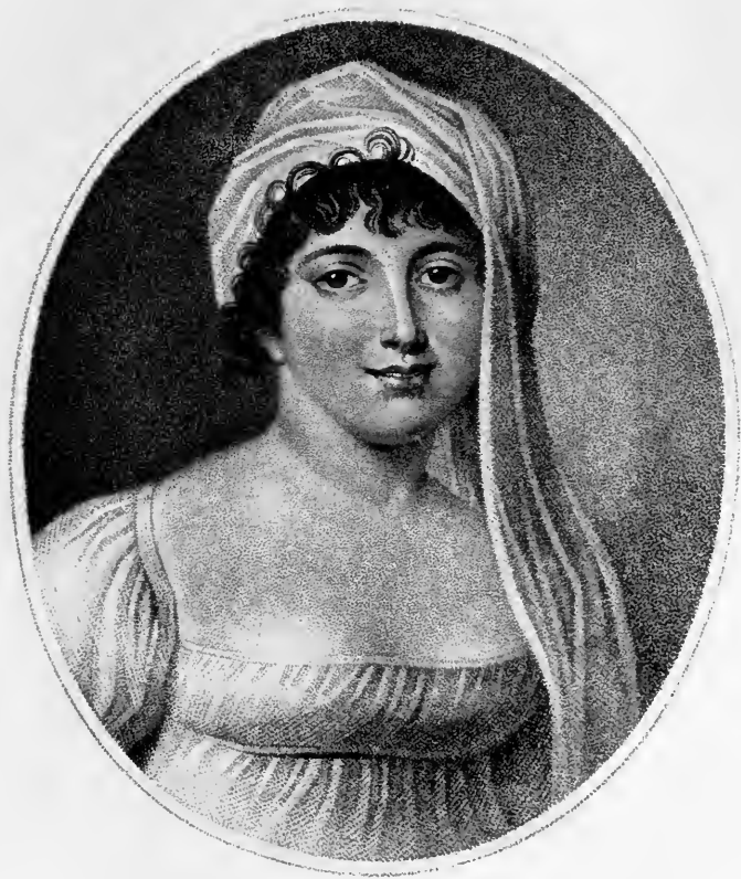
Madame de Staël.