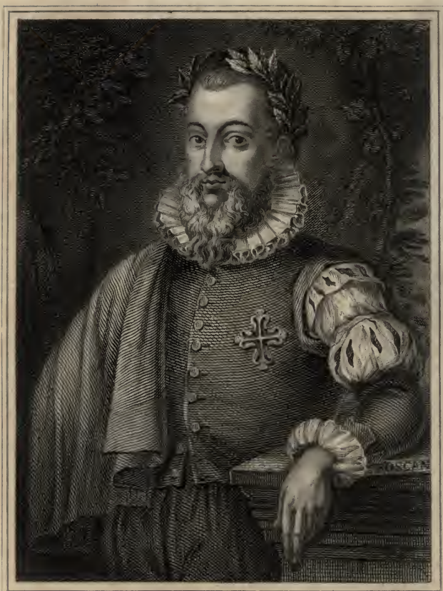
Lope de Vega