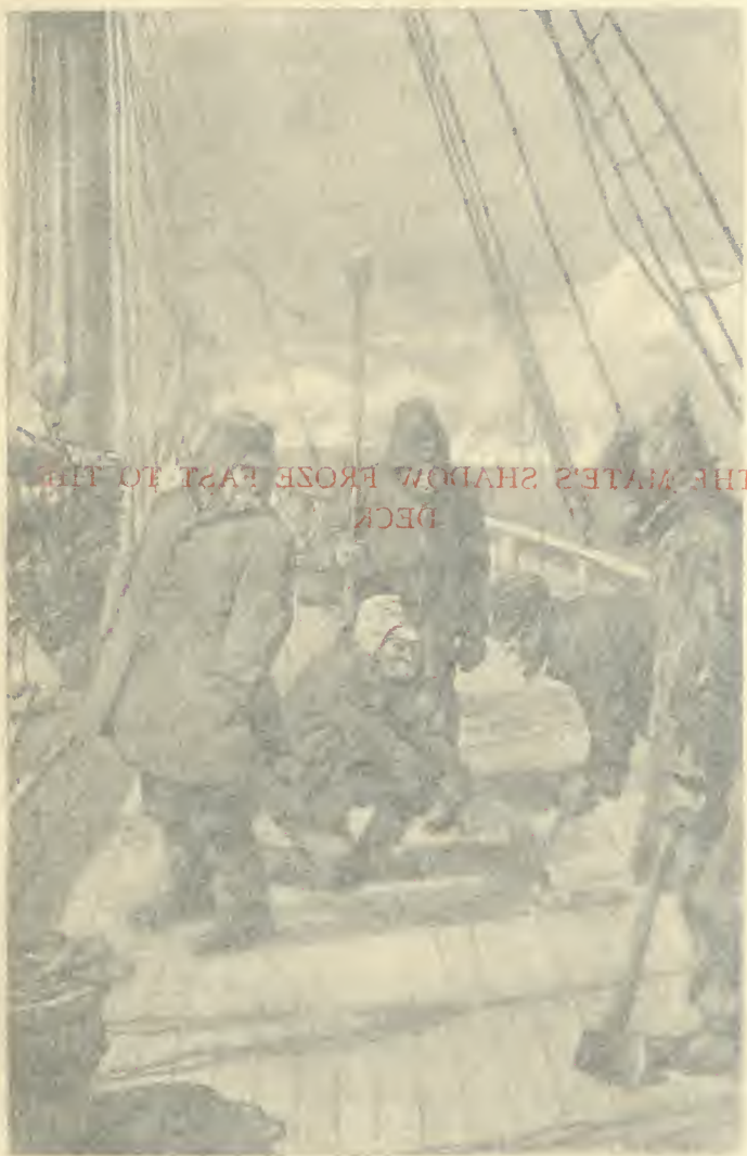
THE WATER'S SHADOW FROZE FAST TO THE DECK