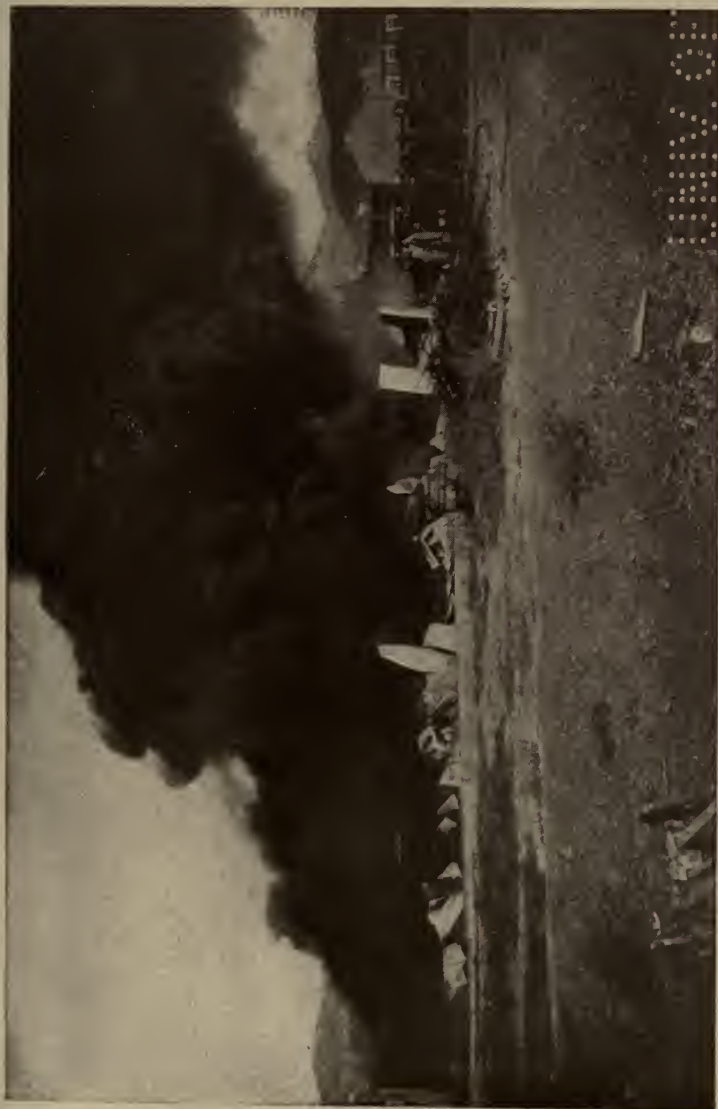
RUSSIAN STORES SET ON FIRE BY JAPANESE SHELLS AT PORT ARTHUR