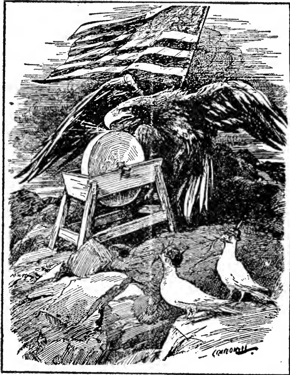
— THE INTRUDERS. AMERICAN EAGLE (to German Peace Doves)—“Go away, I’m busy!” —Punch (London).

This picture was clipped from “ Punch ,” (London) and there is no mistaking it but what the world is in tune with God’s Holy Word.