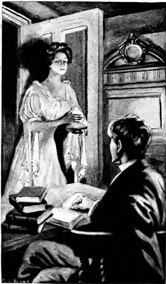
M. 055