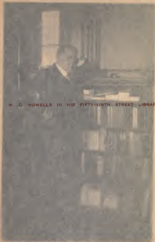
W. D. HOWELLS IN HIS FIFTY-NINTH STREET LIBRARY