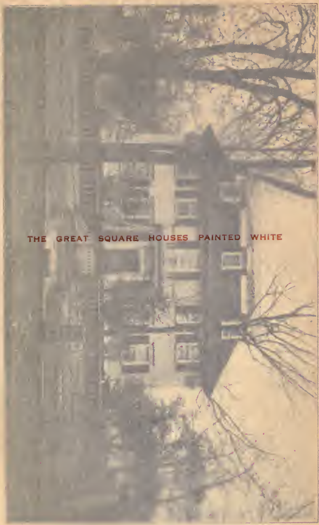
THE GREAT SQUARE HOUSES PAINTED WHITE