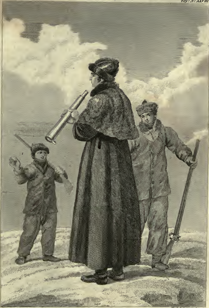
WINTER DRESS OF OFFICERS AND CREW.