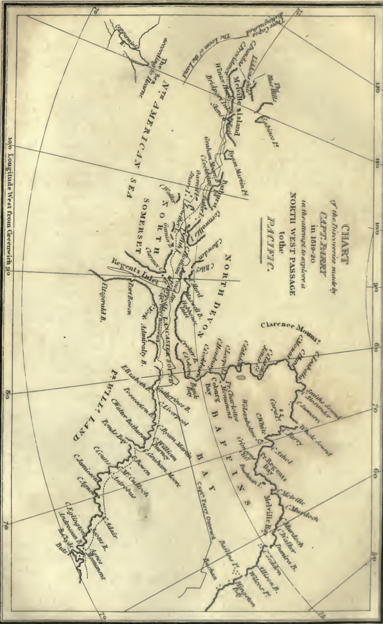
CHART of the Discoveries made by CAPT. PARRY in 1819-20 in the attempt to explore a NORTH WEST PASSAGE to the PACIFIC.