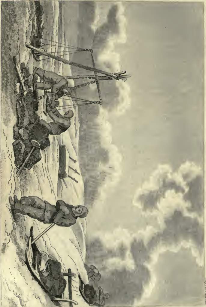
PREPARING STONES FOR BALLAST.