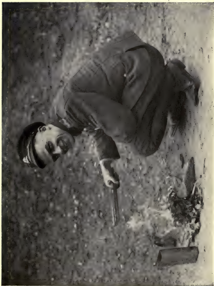
COOKING UNDER DIFFICULTIES.