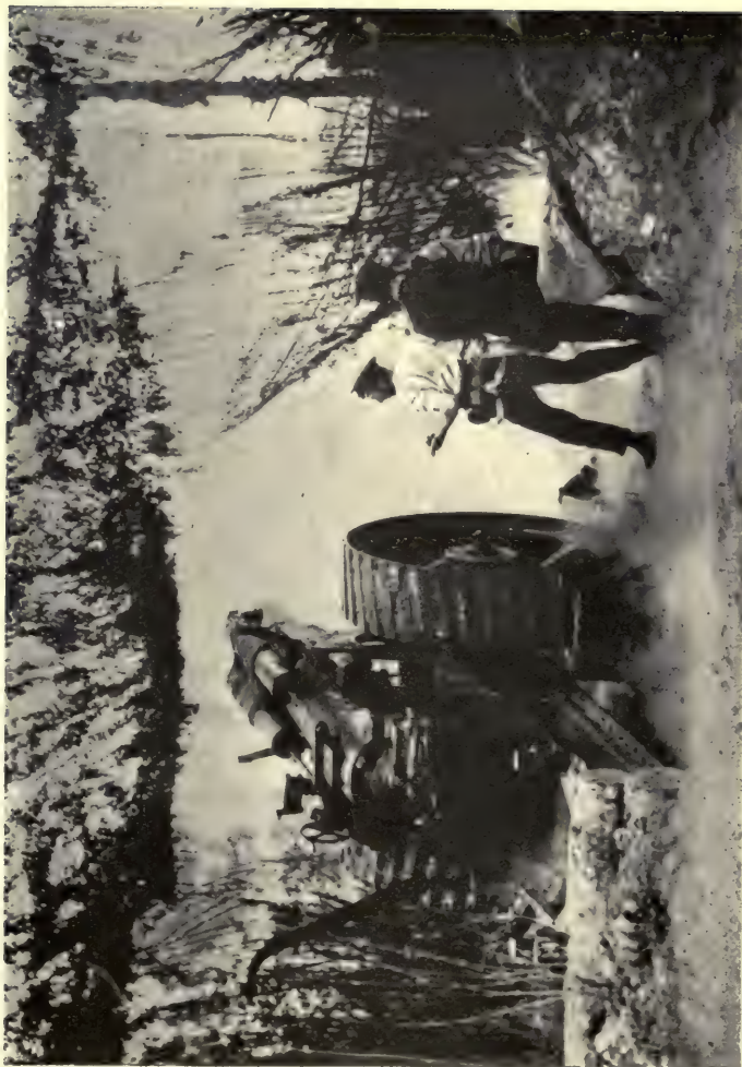
A HEAVY HOWITZER, UNDER CAMOUFLAGE.