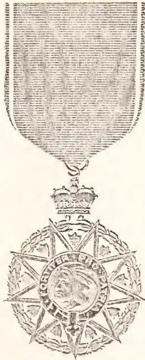
Insignia of the Society of Colonial Wars.