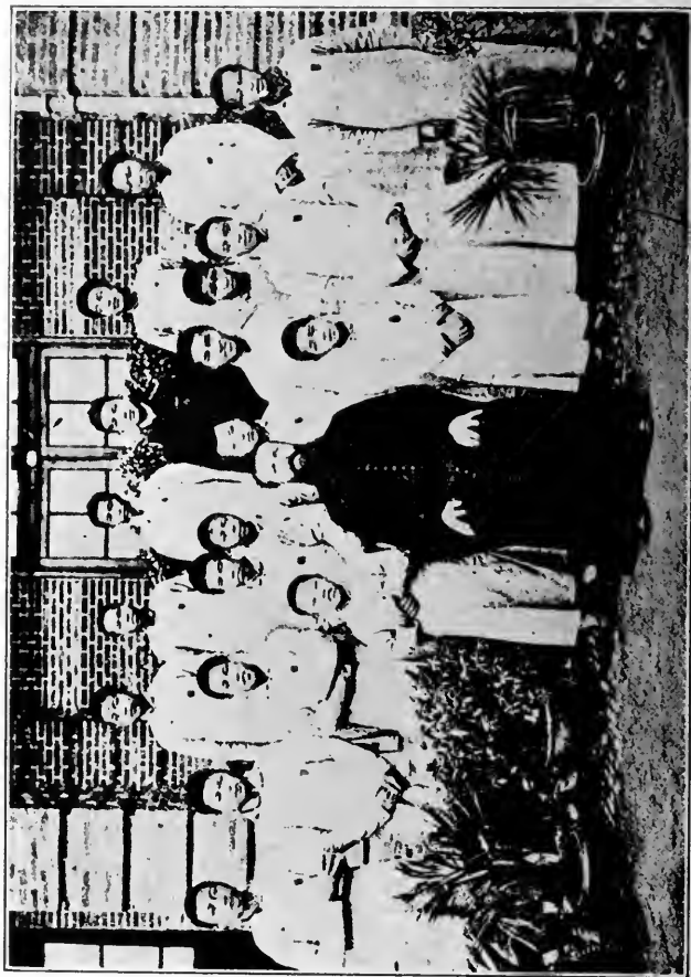
SOME OF THE ZI-KA-WEI ORPHANS