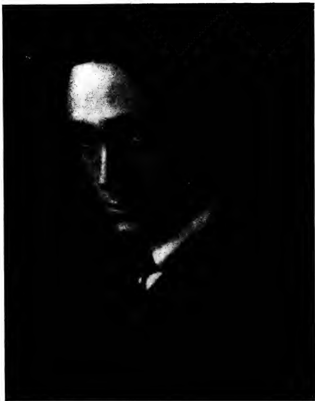
GRANVILLE BARKER