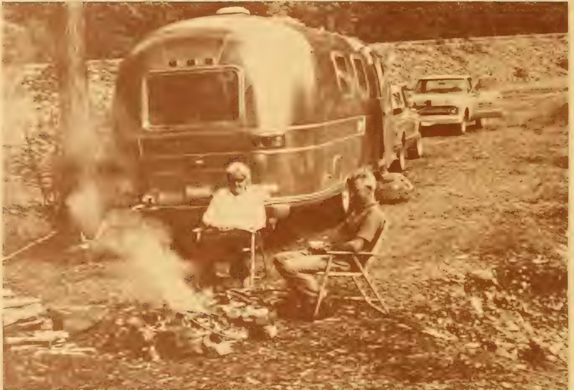
The use of fire appears to be an important part of the recreational experience for recreationists in dispersed areas.