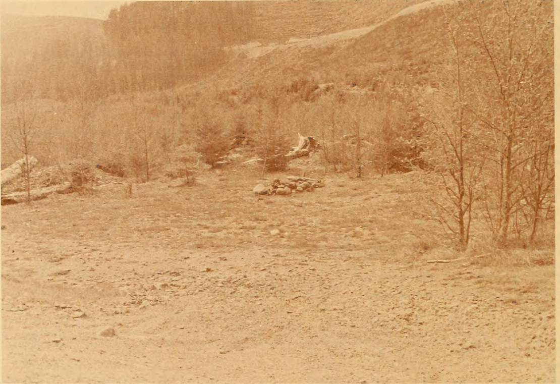
Some impromptu recreation sites in dispersed settings are located away from heavy fuels and pose little risk of wildfire.