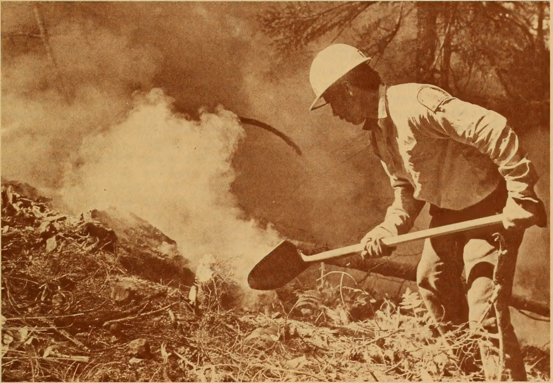
The risk of large and costly wildfires from recreation use in dispersed areas is a major concern to resource managers.