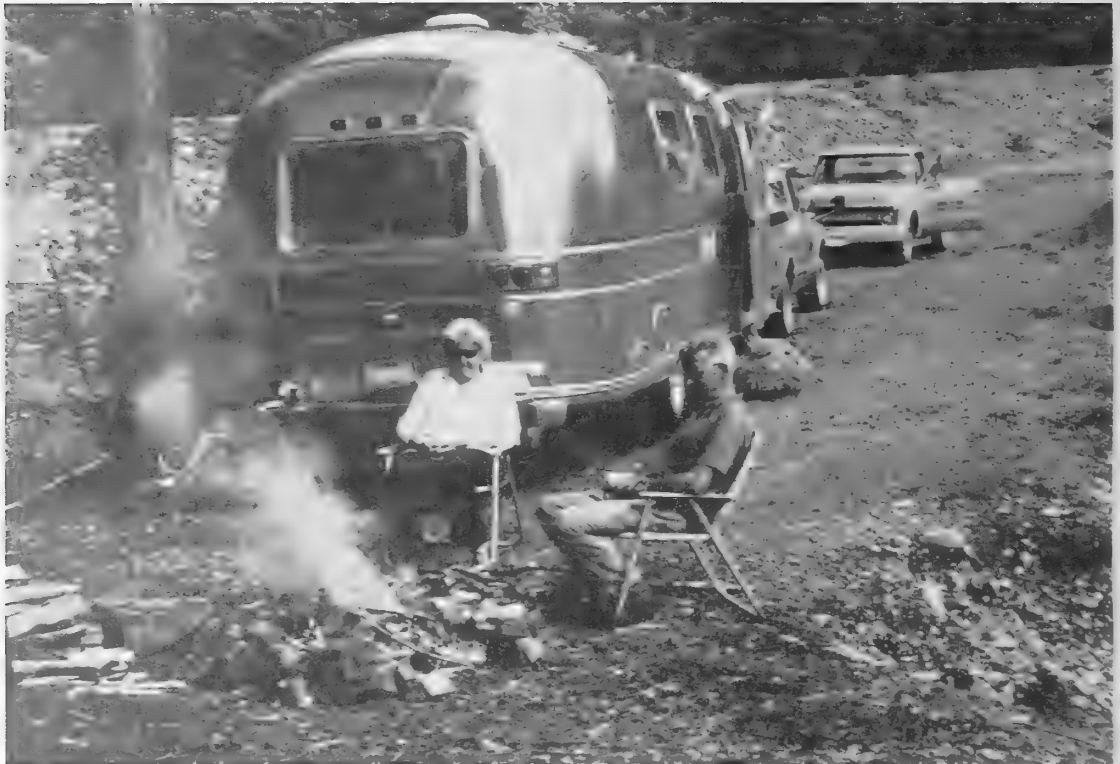
The use of fire appears to be an important part of the recreational experience for recreationists in dispersed areas.