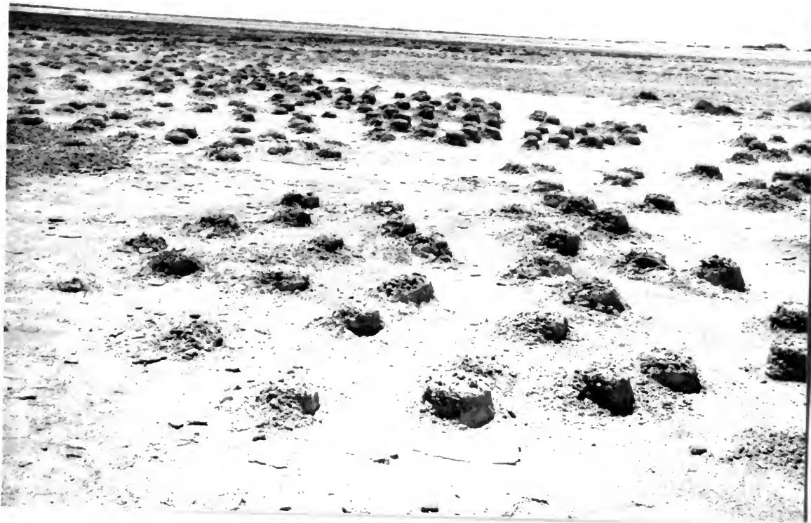
8847. Older nest turrets, probably of 1967, at Pekel- meer, Bonaire, N.A. February 12, 1969.