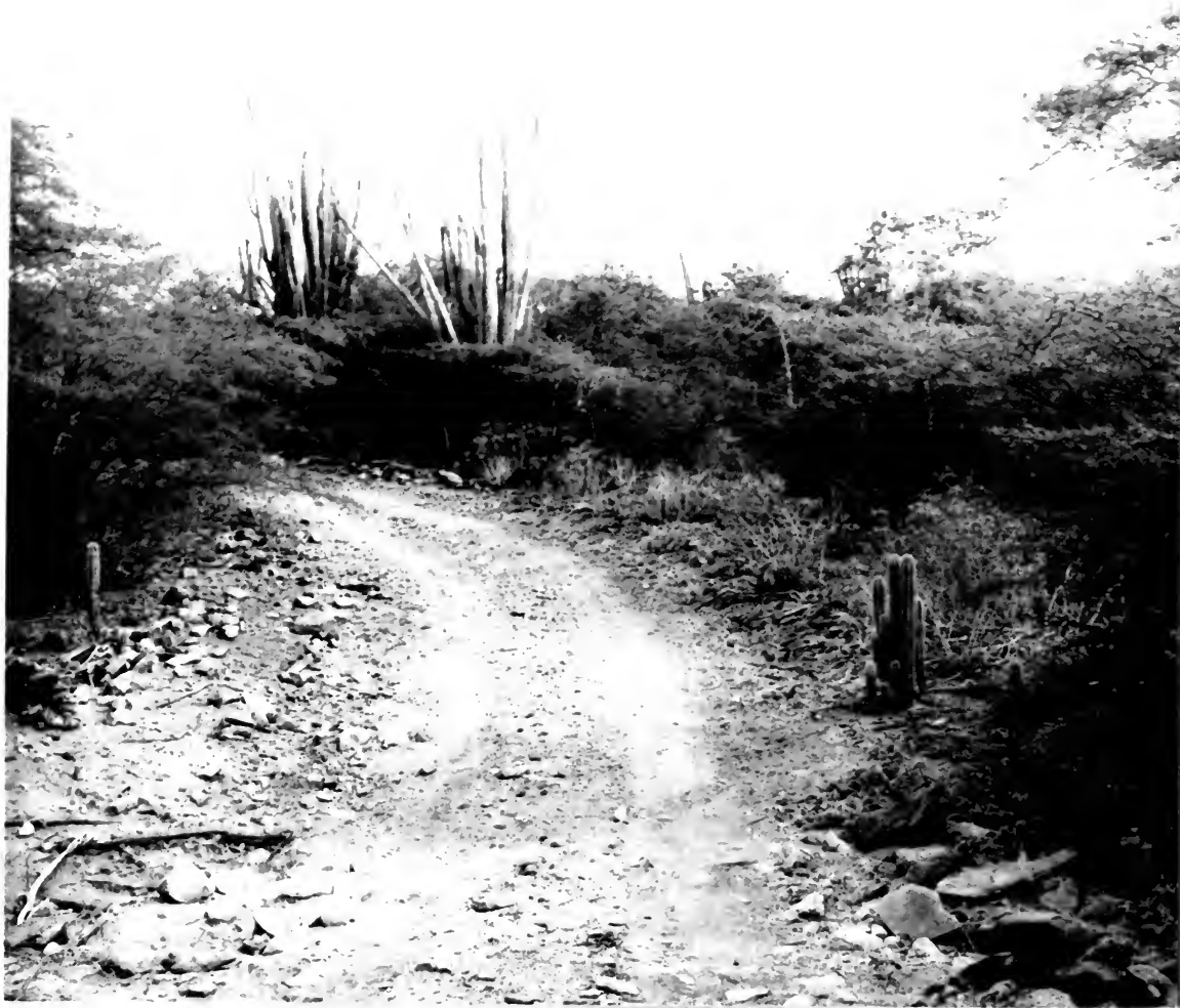
8831. Road back (north) of Brandaris, Slagbaai, Bonaire, N.A. February 9, 1969.