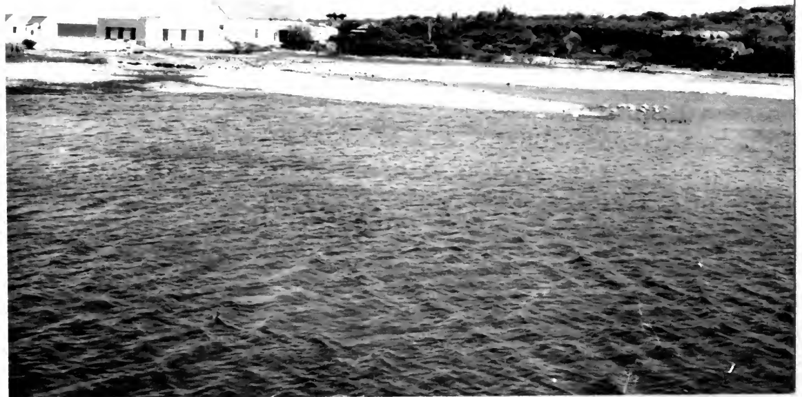
8868. Flamingos and main buildings, Slagbaai, Bonaire, N.A. February 14, 1969.