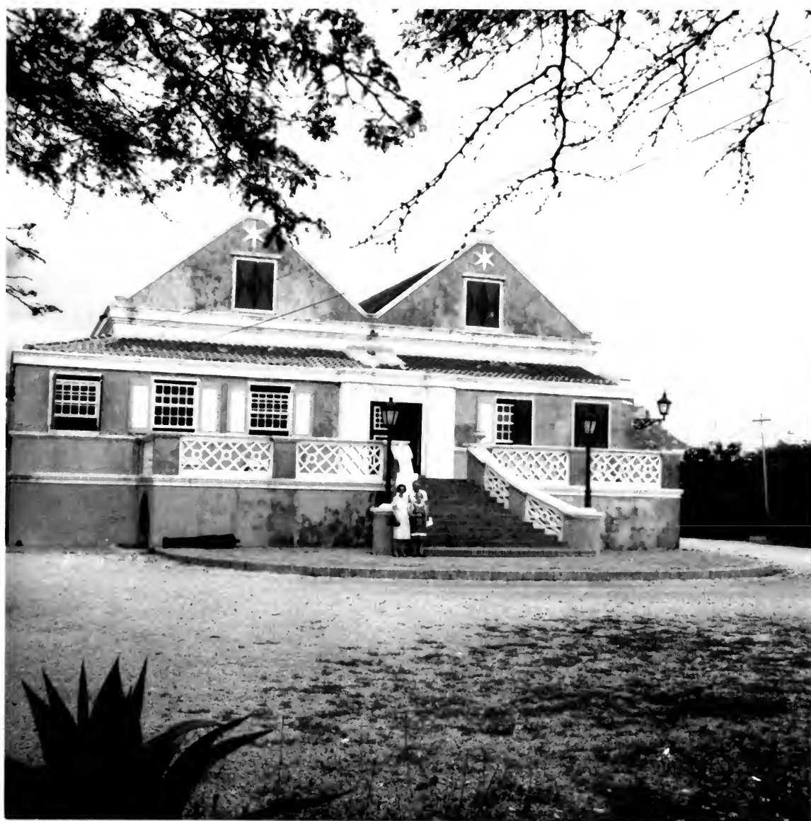
8910. National Museum of Curaçao, N.A. March 2, 1969.