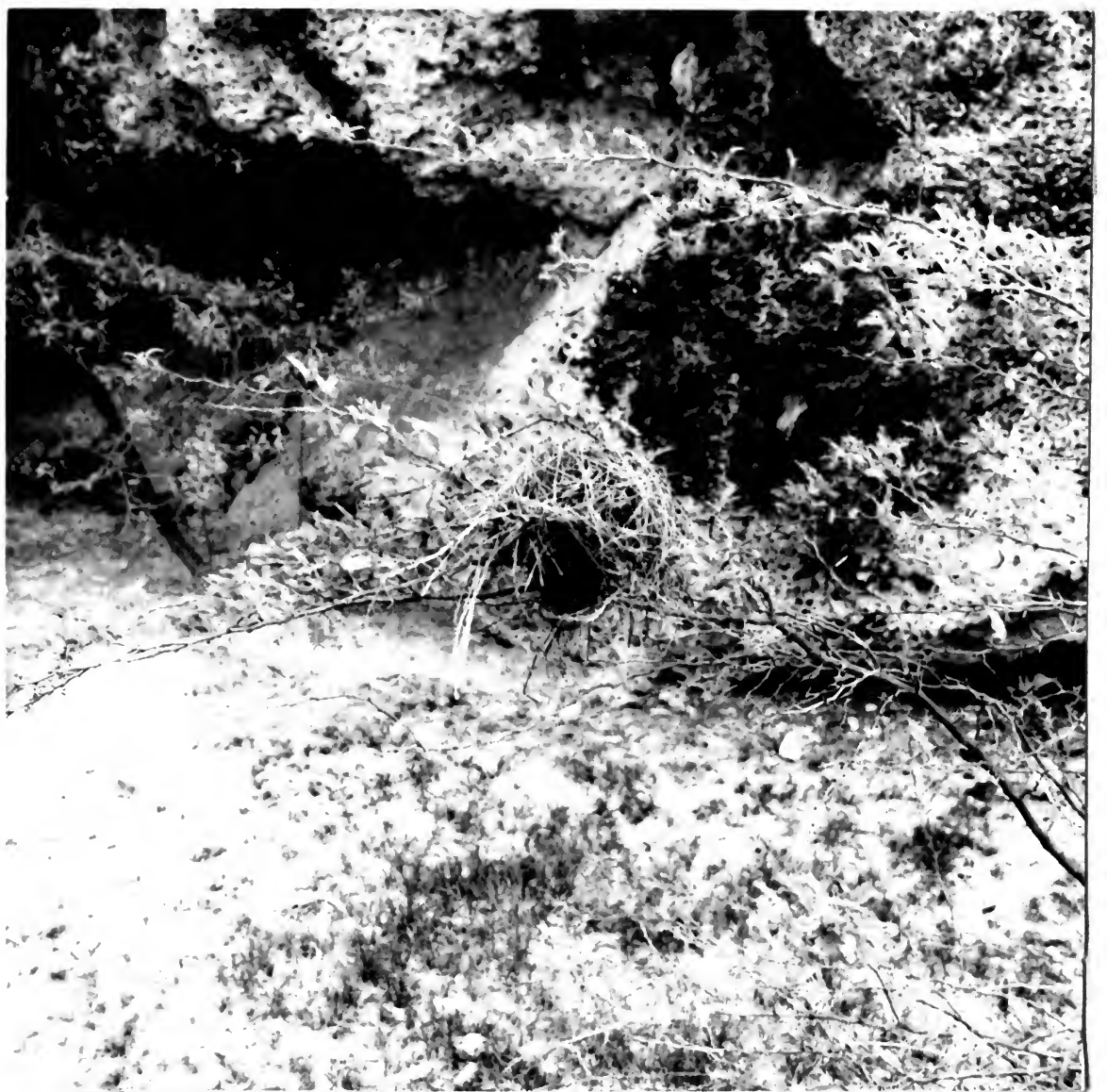
8814. Nest of Bananaquit, Coereba flaveola bonairensis. Slagbaai, Bonaire, N.A. February 3, 1969.