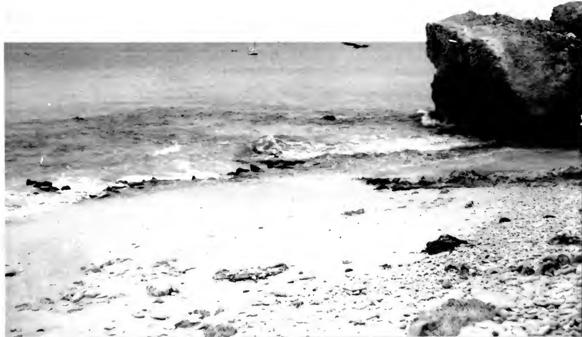
8904. Pelican flying from rock just beyond our house at Slagbaai, Bonaire, N.A. February 26, 1969.