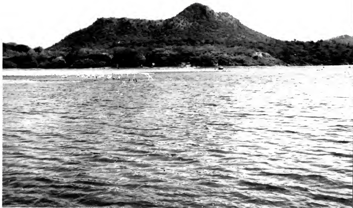
8869. Flamingos at Slagbaai, Brandaris in background. Bonaire, N.A. February 14, 1969.