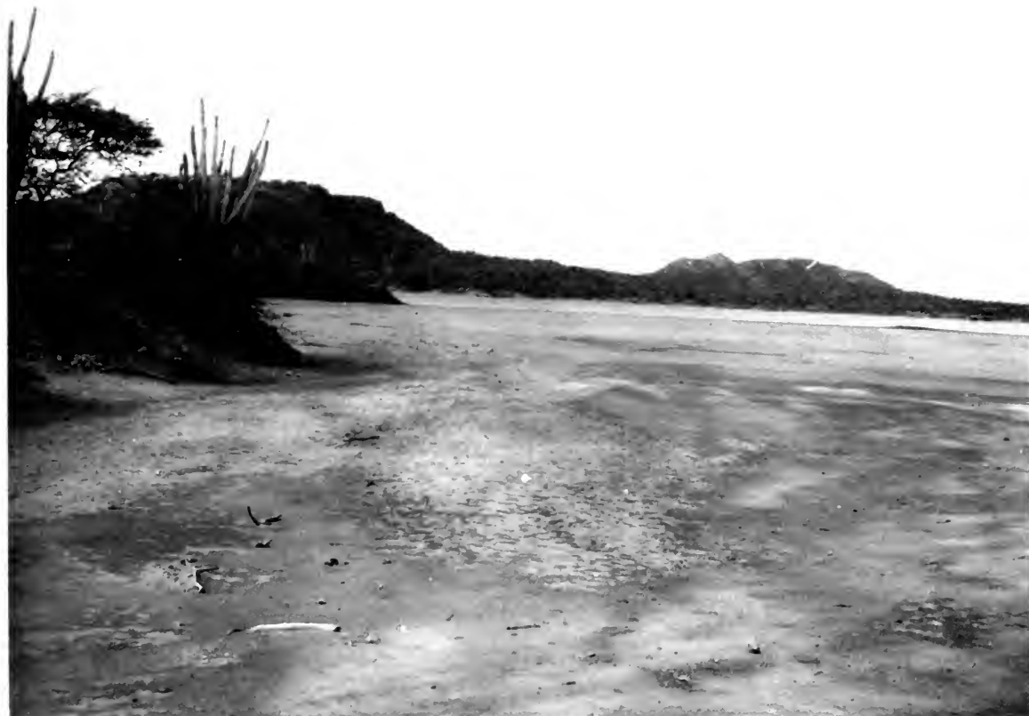
8816. Northern side of Gotomeer, near entrance to Slagbaai, Bonaire, N.A. February 5, 1969.