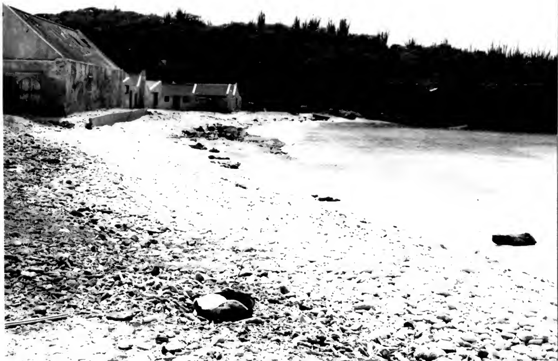
8856. Ancient salt warehouse and other buildings on Slag- baai Plantation, Bonaire, N.A. February 13, 1969.