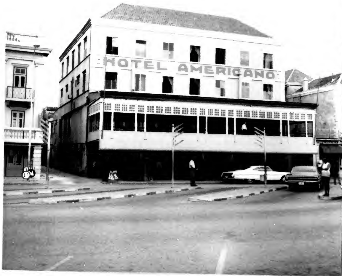
8813. HotelAmericano, Curaçao, N.A. March 2, 1969. (Completely burned down during riots on May 30, 1969).