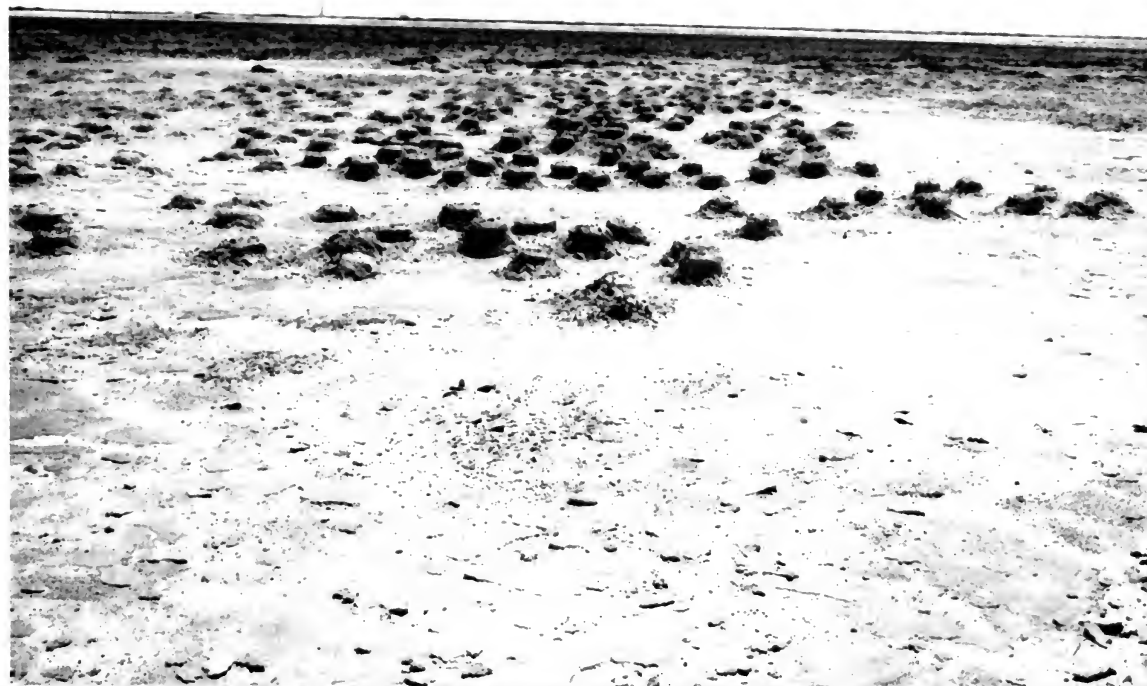
8844. Flamingo nest turrets of 1968 at Pekelmeer, Bonaire, N.A. February 12, 1969.