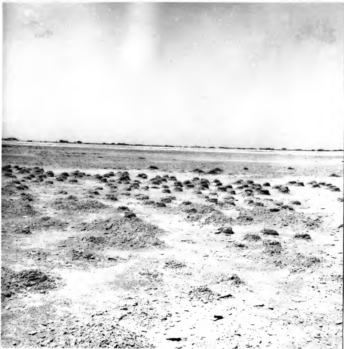
8845. Older nest turrets, probably of 1967, at Pekel- meer, Bonaire, N.A. February 12, 1969.