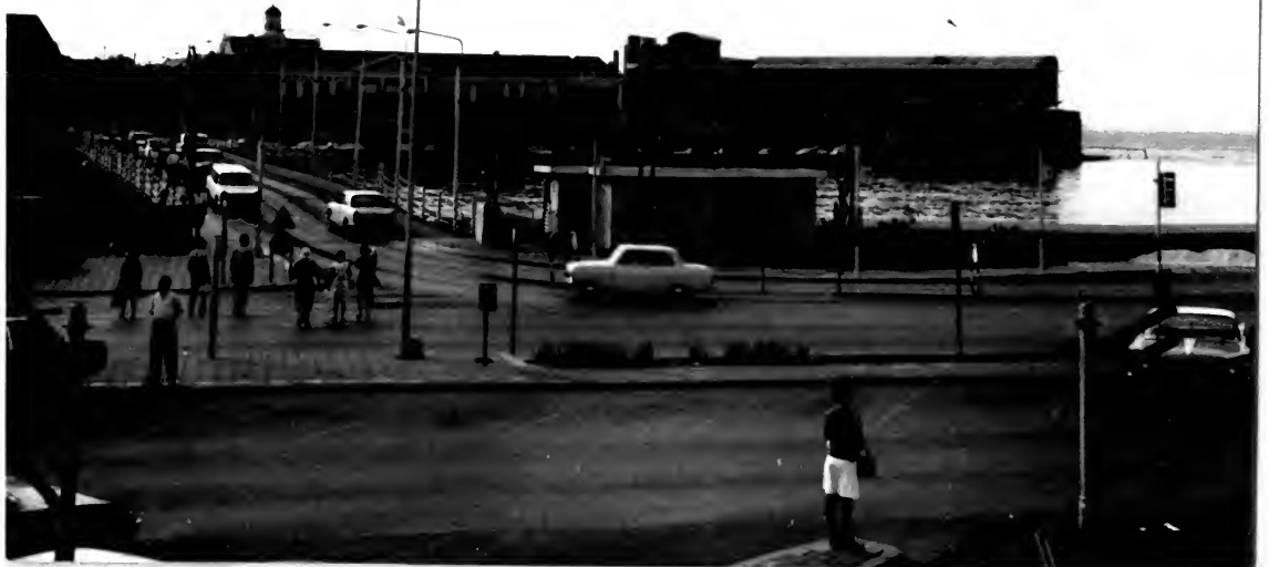
8922. The bridge closed, with view of harbor entrance. Governor's Palace and old Protestant Church in background. Curaçao, N.A. March 3, 1969.