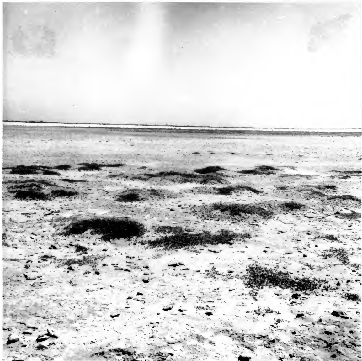
8843. Ancient flamingo nest turrets at Pekelmeer, Bonaire, N.A. February 12, 1969.