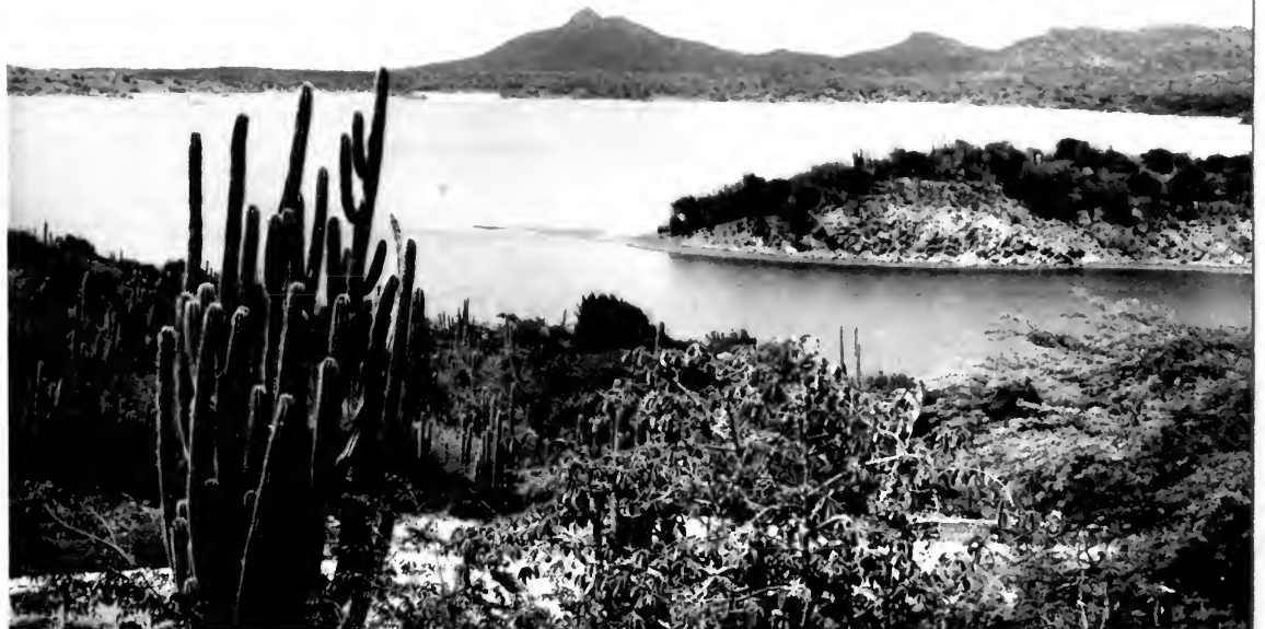
8878. Goto Meer, taken from the south. Erandaris in back- ground. Bonaire, N.A. February 20, 1969.