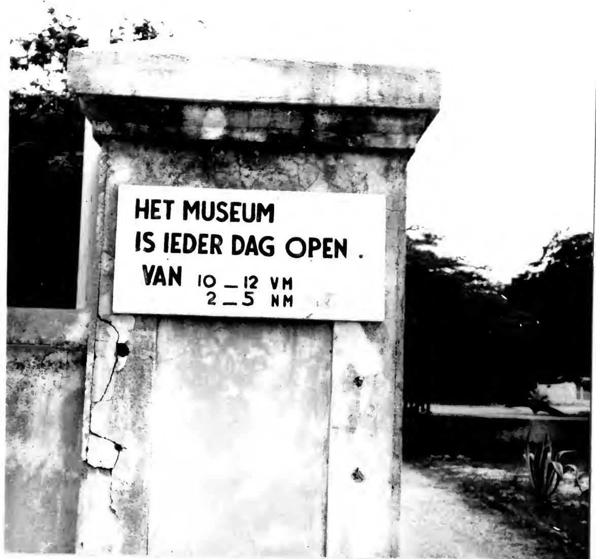
8912. Sign on Museum gate. Curaçao, N.A. March 2, 1969.