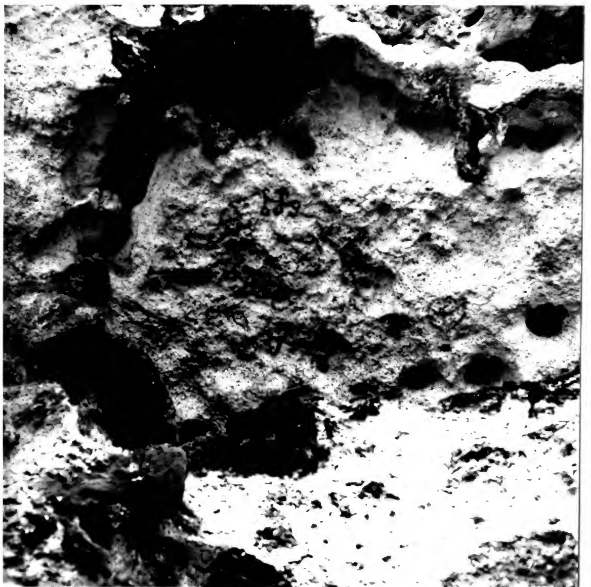
8852. Indian inscriptions in "ceiling" of cave, Onima, Bonaire, N.A. February 13, 1969.