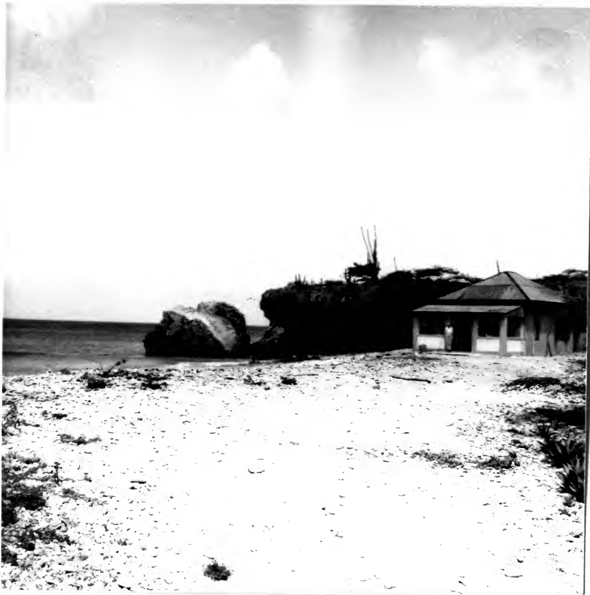
8855. Our house on Slagbaai Plantation, Bonaire, N.A. February 13, 1969.