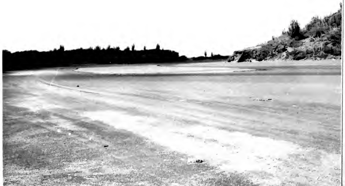
8838. Saliña south of Bran- daris, Slagbaai, Bonaire, N.A. February 9, 1969.