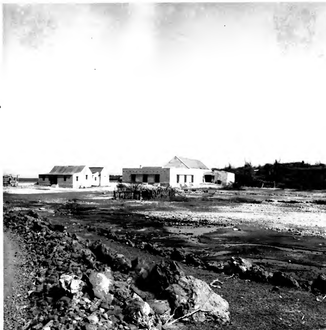
8866. Main buildings at Slag- baai Plantation. Bonaire, N.A. February 14, 1969.