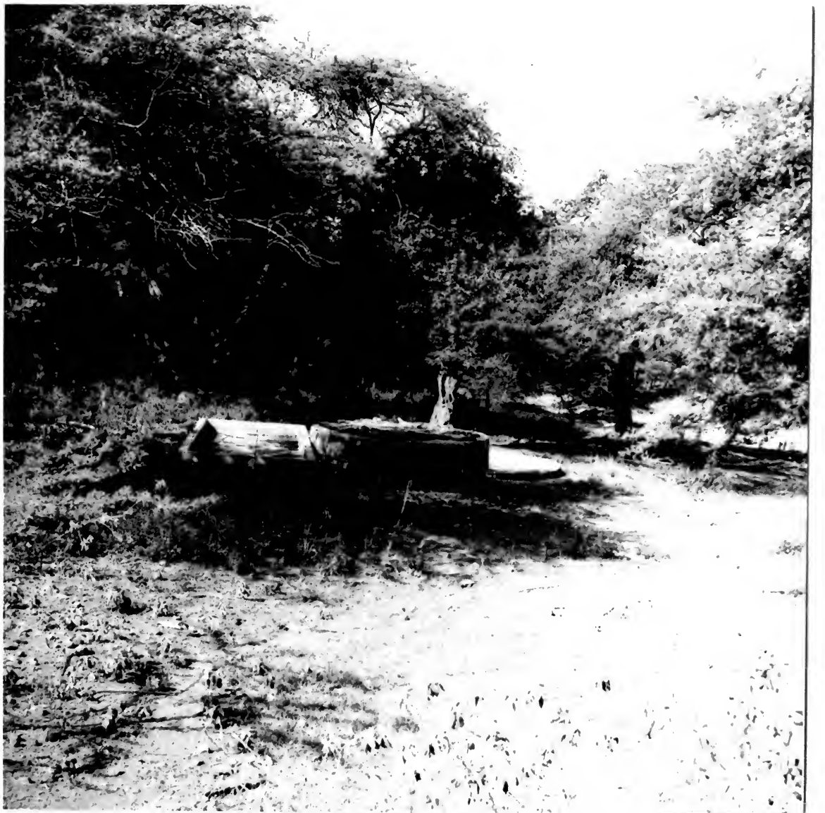
8864. Old well at Labra, Brasiel, Bonaire, N.A. February 14, 1969.