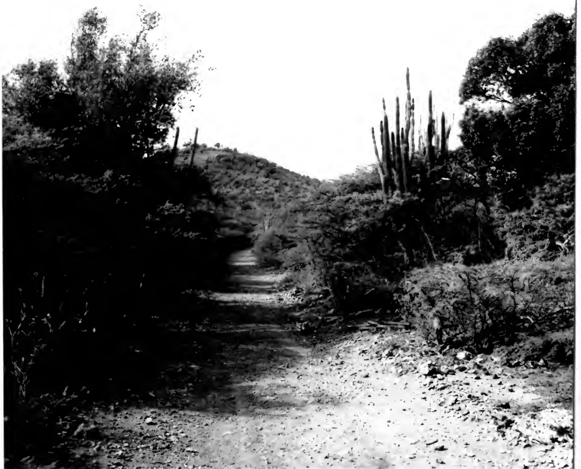
8896. Old road north of Playa Funchi, Washington, Bonaire, N.A. February 26, 1969.