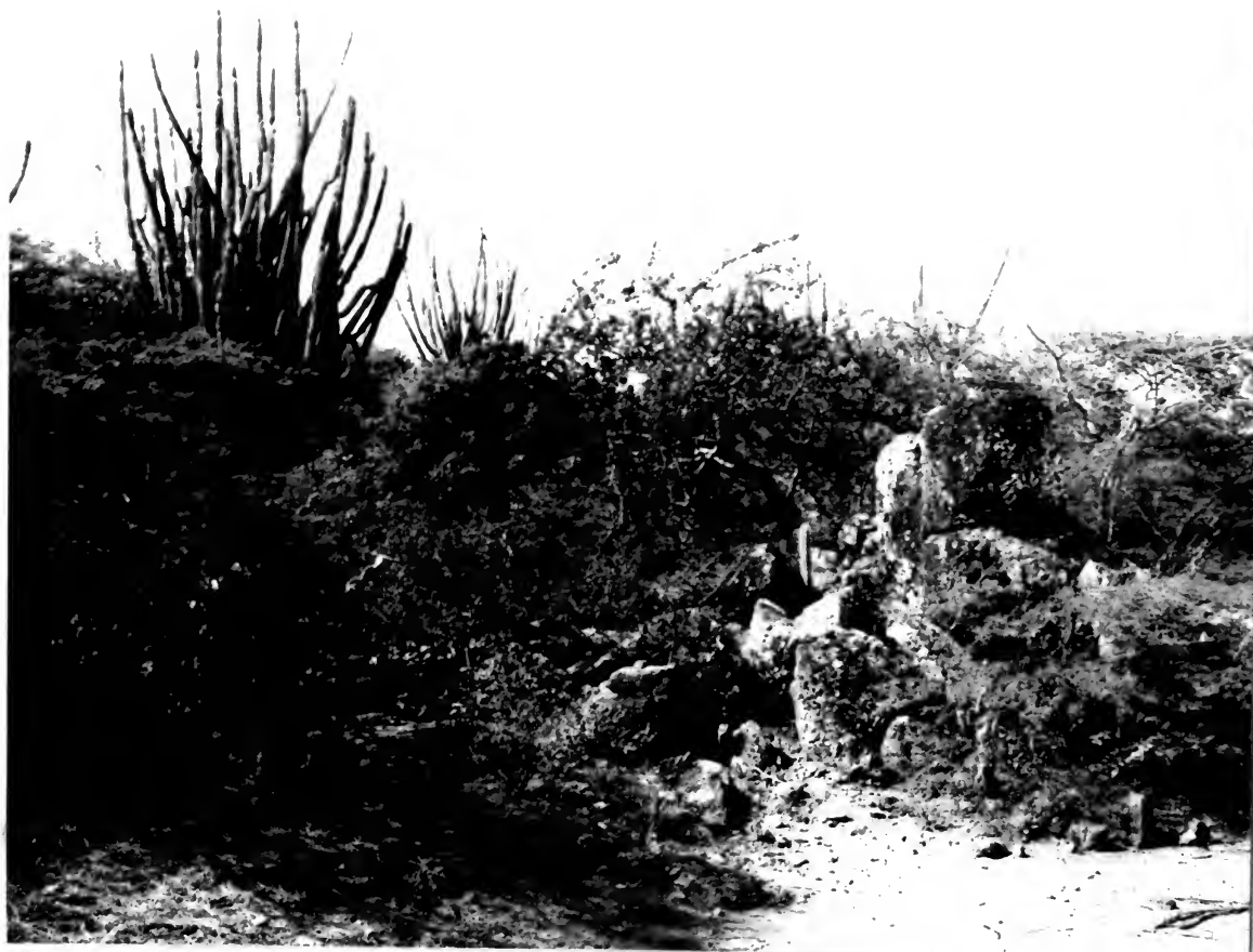
8835. Bush along trail south of Brandaris, Slagbaai, Bonaire, N.A. February 9, 1969.