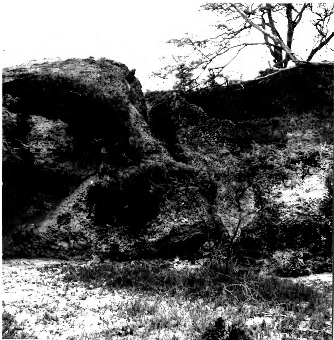
8815. Location of Bananaquit nest (center). Slagbaai, Bonaire, N.A. February 3, 1969.