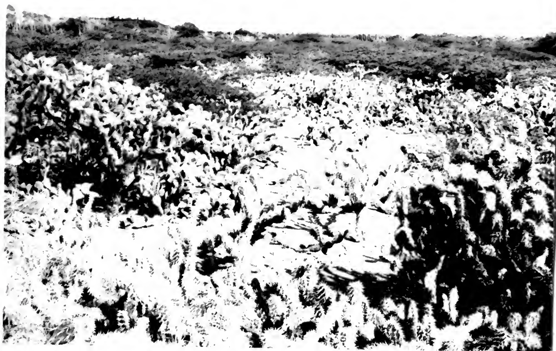
8875. Flat-pad cactus, Fontein, Bonaire, N.A. February 18, 1969.