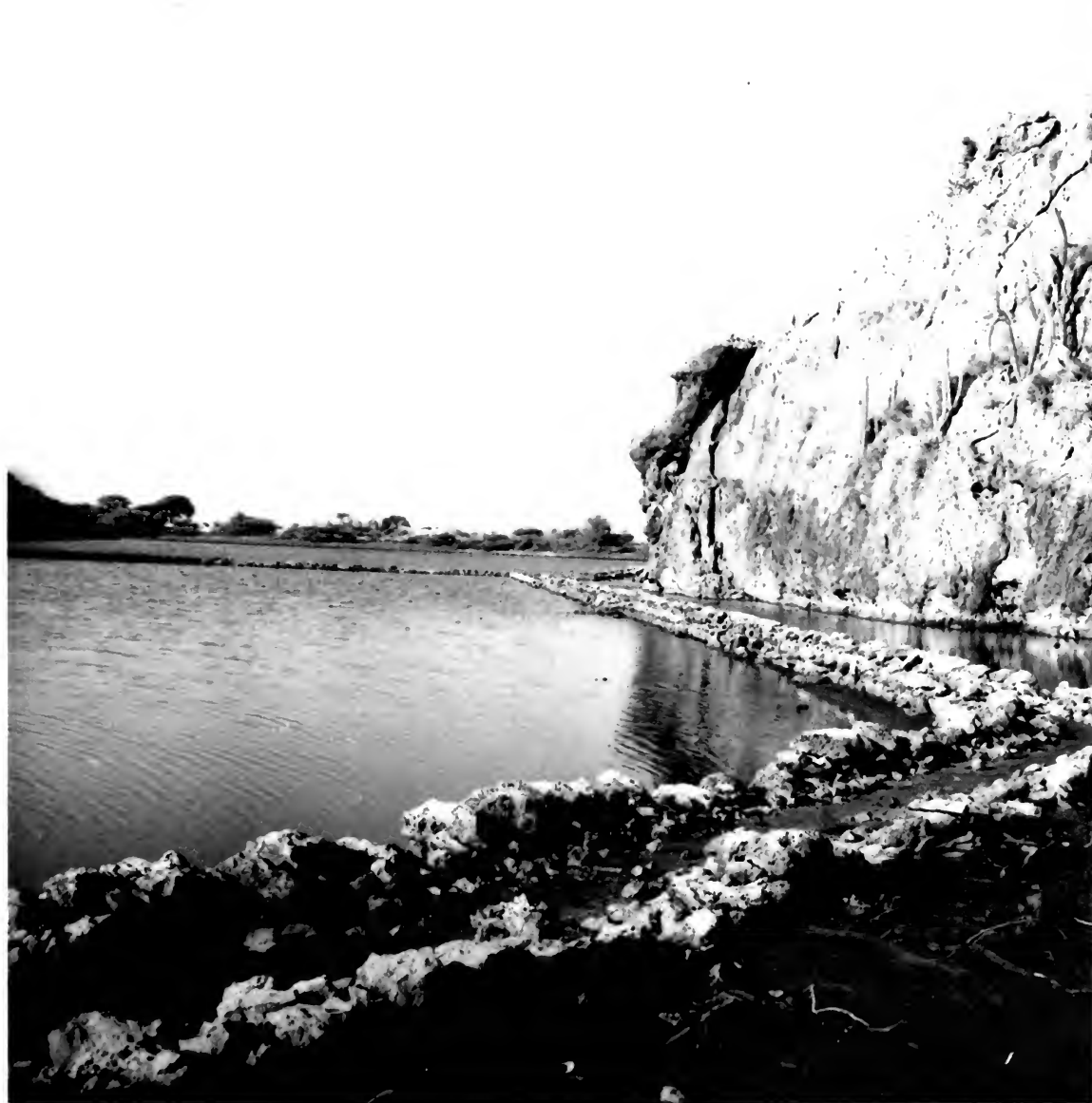
8862. Old salt evaporating ponds, Salina Playa Frans, Brasiel, Bonaire, N.A. February 14, 1969.