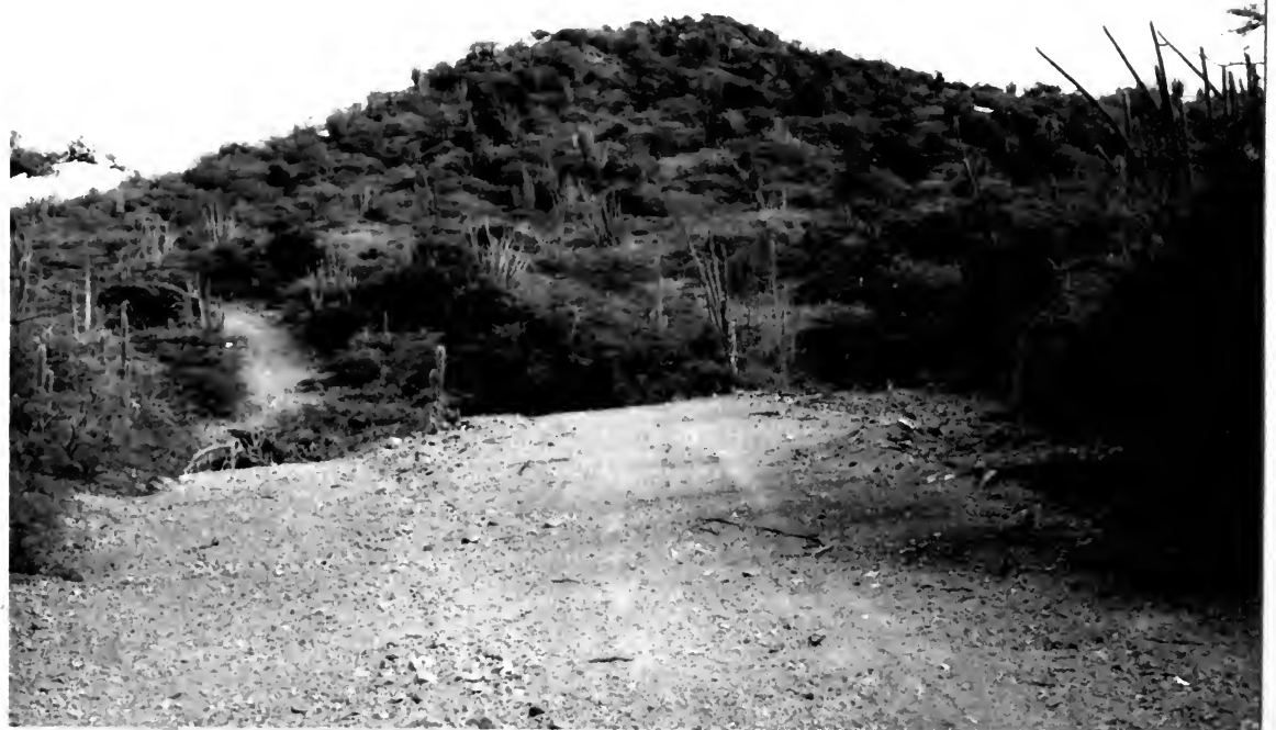
8898. The end of the hills called Pichi Lang, north of Playa Funchi, Washington, Bonaire, N.A. February 26, 1969.