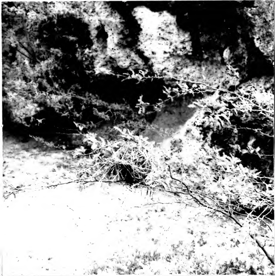
8813. Nest of Bananaquit, Coereba flaveola bonairensis. Slagbaai, Bonaire, N.A. February 3, 1969.