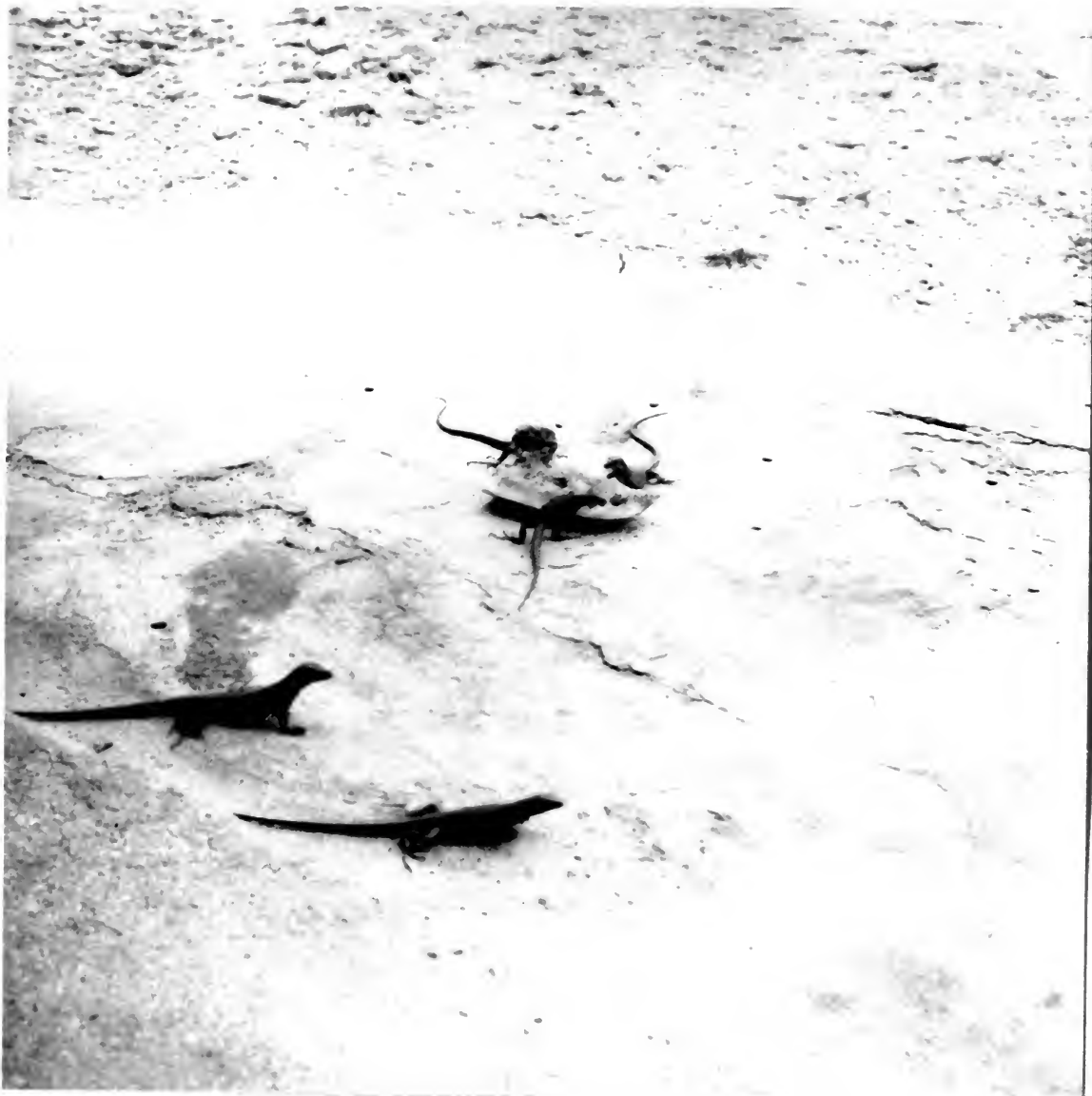
8891. Lizards eating water- melon rind on our porch. Slagbaai, Bonaire, N.A. February 22, 1969.