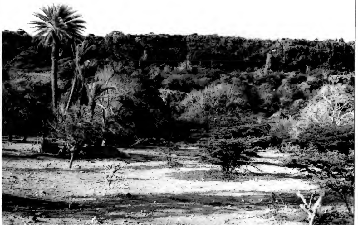
8872. Fontein, Bonaire, N.A. February 18, 1969.