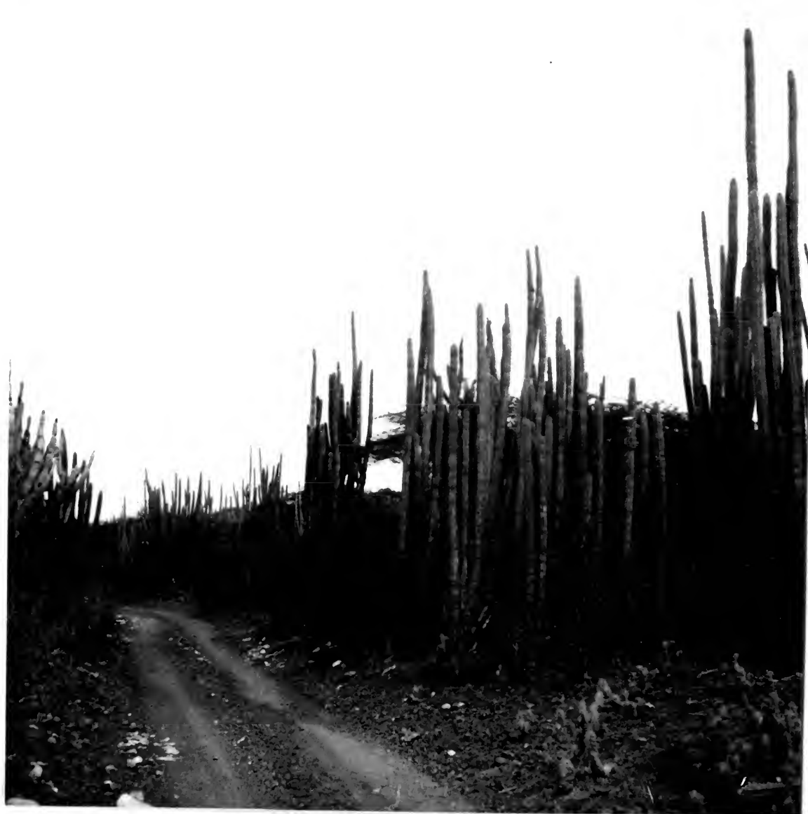
8870. Organ cactus lining road on Slagbaai Plantation. Bonaire, N.A. February 16, 1969.