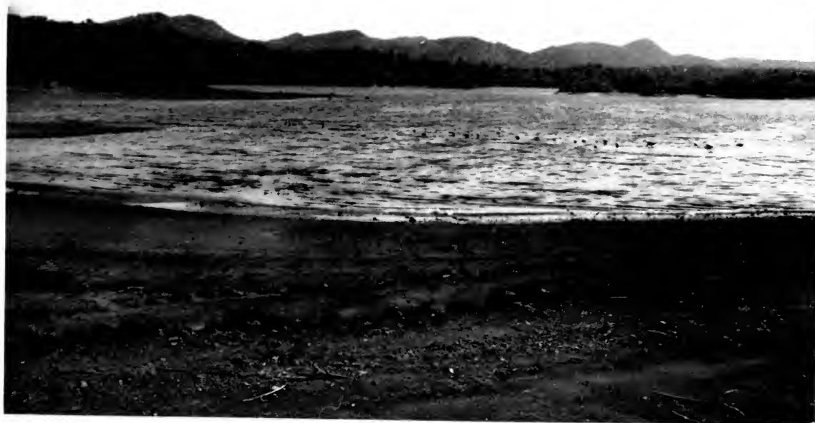
8865. Salt lagoon at Slag- baai Plantation, with flamingos. Bonaire, N.A. February 14, 1969.