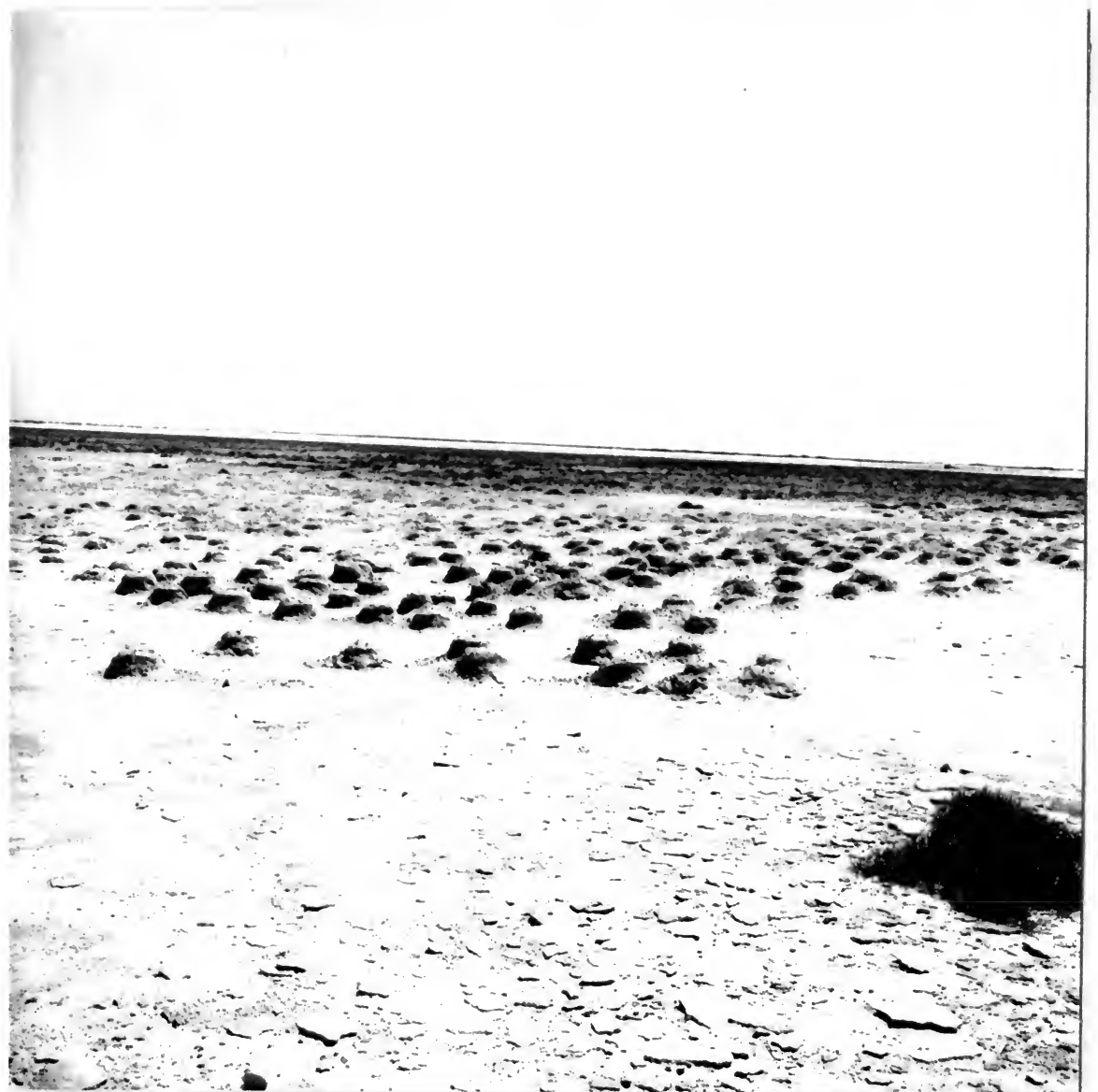
8848. Older nest turrets, probably of 1967, at Pekel- meer, Bonaire, N.A. February 12, 1969.