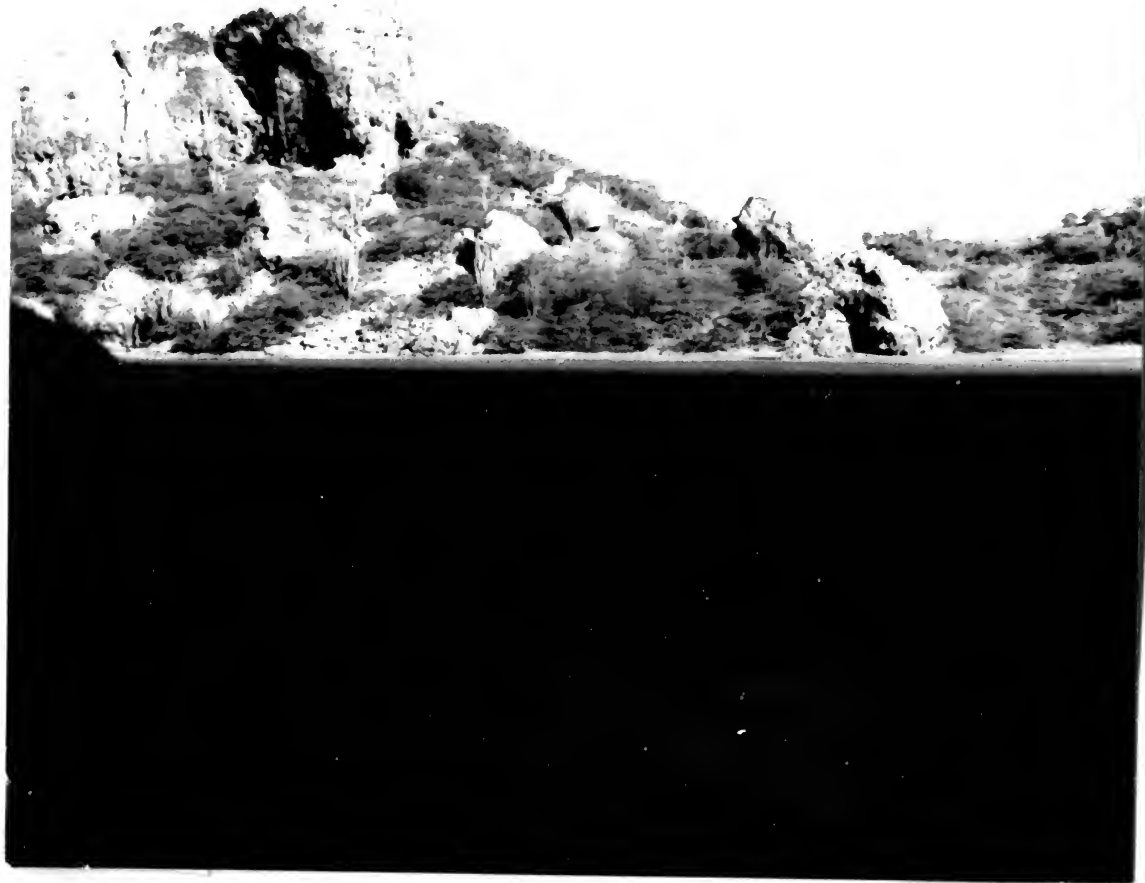
8863. Dry margin of Saliña Playa Frans, Brasiel, Bonaire, N.A. February 14, 1969.