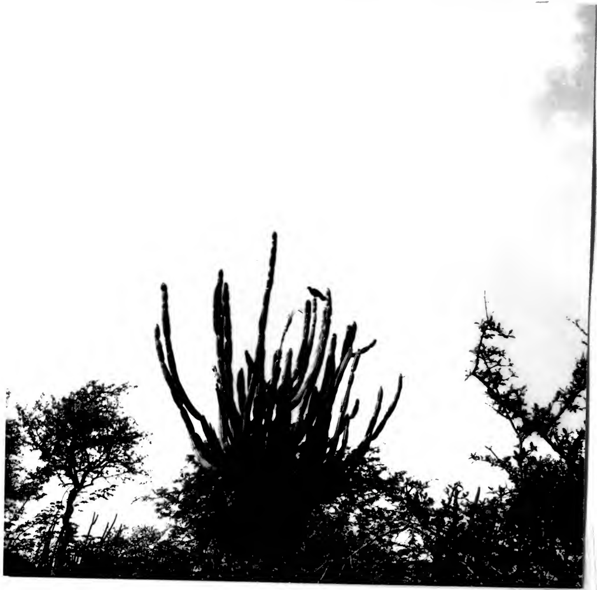
8837. Caracara on organ cactus, north of Brandaris, Slagbaai, Bonaire, N.A. February 9, 1969.