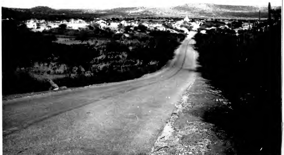
8842. Rincón, Bonaire, N.A. February 9, 1969.