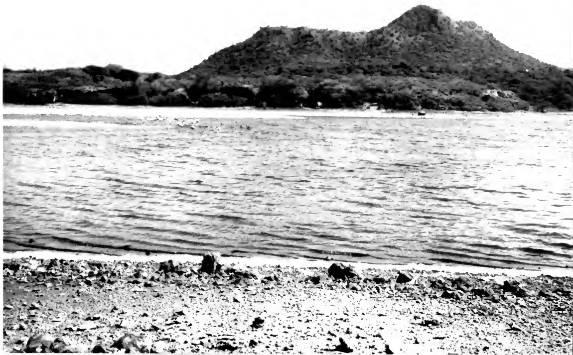
8867. Flamingos on salt lagoon at Slagbaai. Brandaris in background. Bonaire, N.A. February 14, 1969.