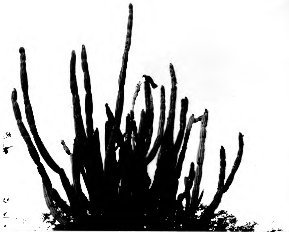
8836. Caracara on organ cactus, north of Brandaris, Slagbaai, Bonaire, N.A. February 9, 1969.