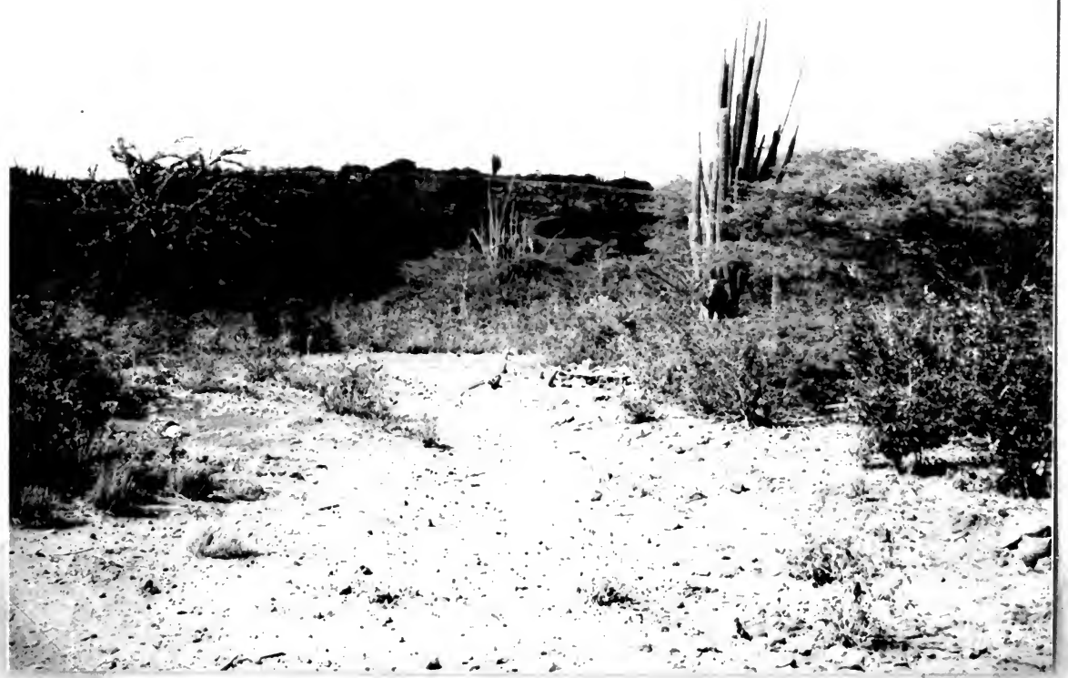
8832. Bush north of Brandaris, Slagbaai, Bonaire, N.A. February 9, 1969.