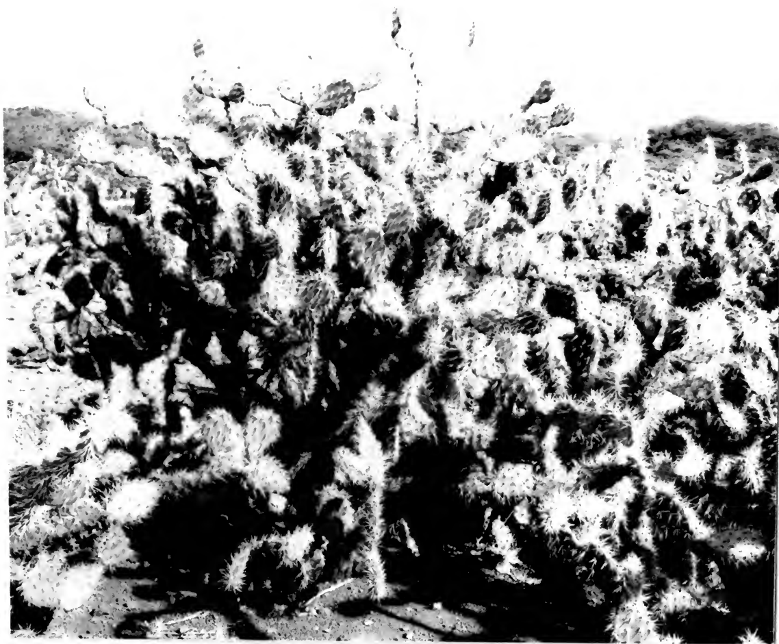
8876. Flat-pad cactus, Fontein, Bonaire, N.A. February 18, 1969.