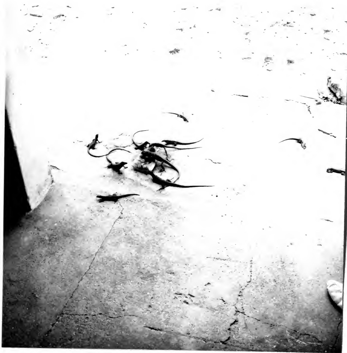
8889. Lizards feasting on watermelon rind. Slagbaai, Bonaire, N.A. February 22, 1969.