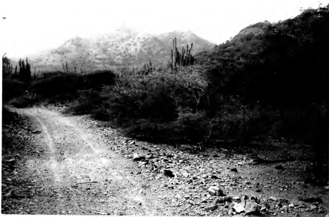
8897. Pichi Lang, from the road between Playa Funchi and Playa Bartol. Washington, Bonaire, N.A. February 26, 1969.