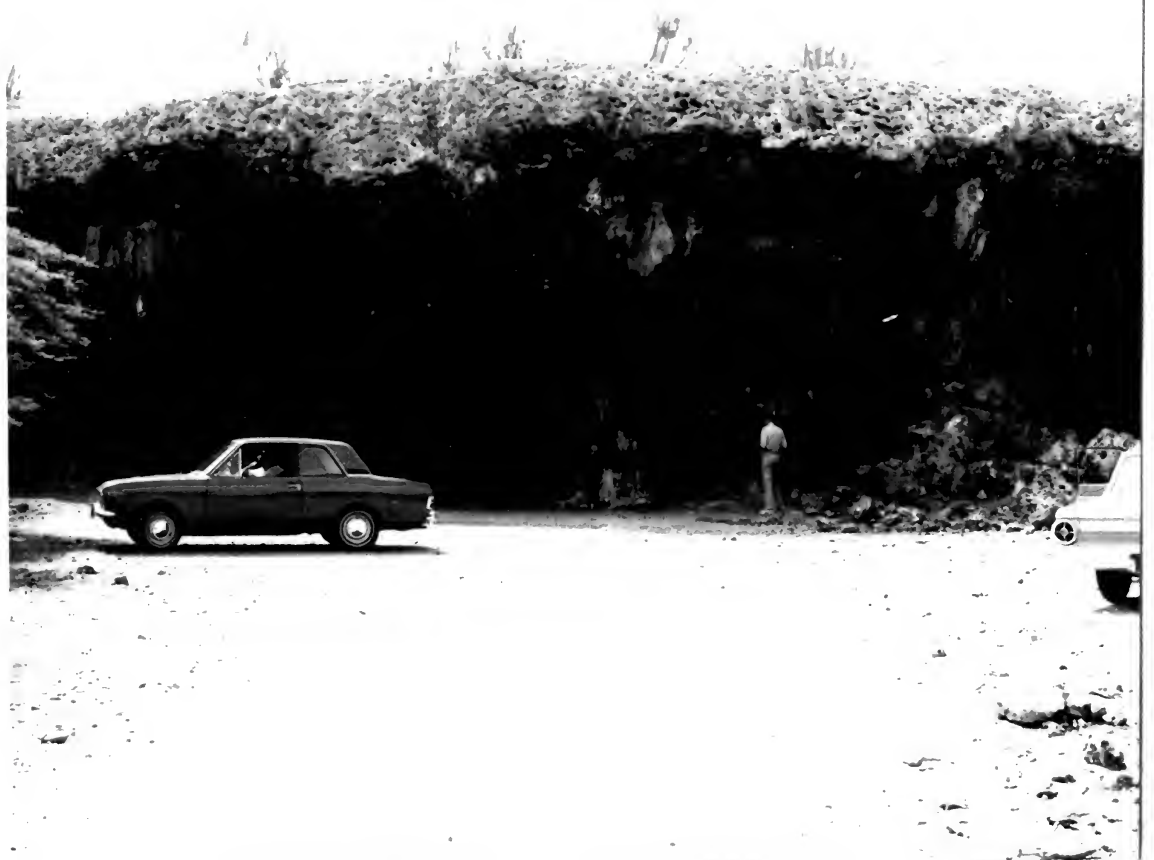
8854. The "Cortina" at the cave in which Indian inscrip- tions are found. Onima, Bonaire, N.A. February 13, 1969.