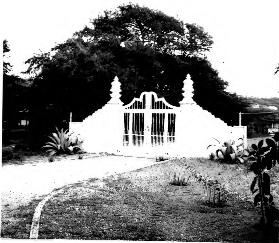
8911. Entrance gate to National Museum, Curaçao, N.A. March 2, 1969.