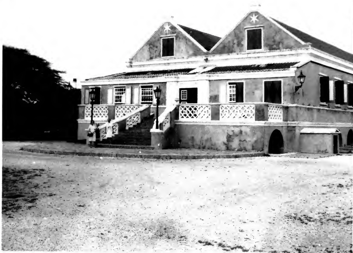
8909. National Museum of Curaçao, Netherlands Antilles. March 2, 1969.