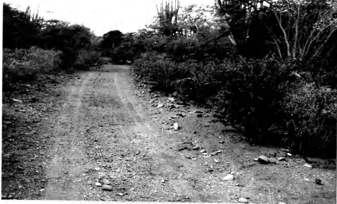
8829. Old road back of Brandaris, Slagbaai, Bonaire, N.A. February 9, 1969.