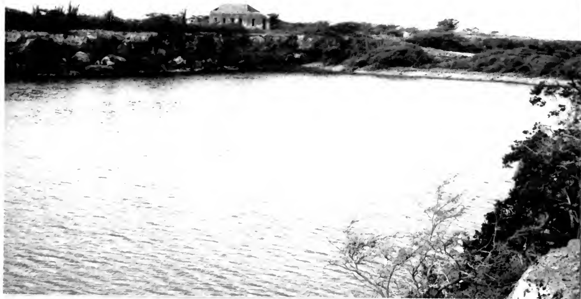
8895. Old house at Playa Funchi, Washington, Bonaire, N.A. February 26, 1969.