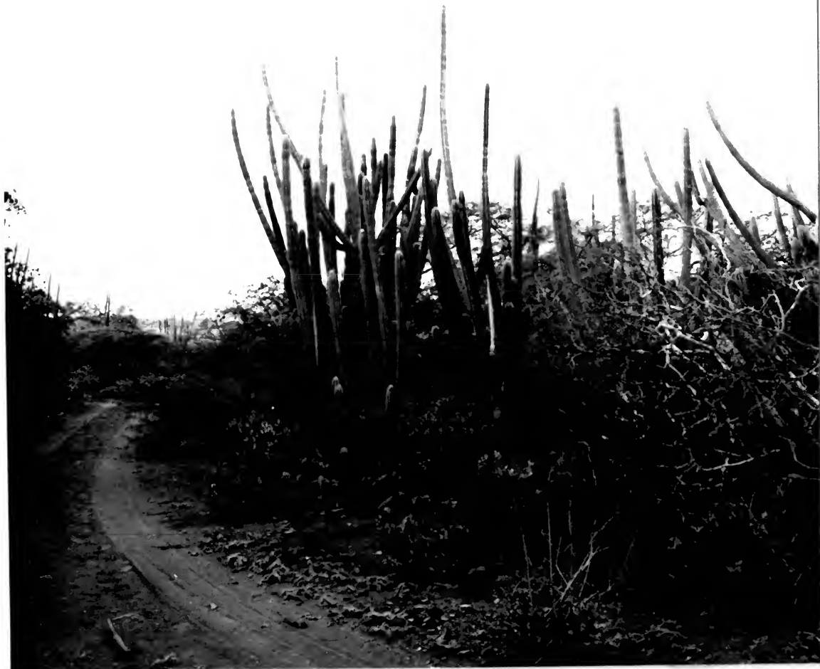
8830. Road back (north) of Brandaris, Slagbaai, Bonaire, N.A. February 9, 1969.