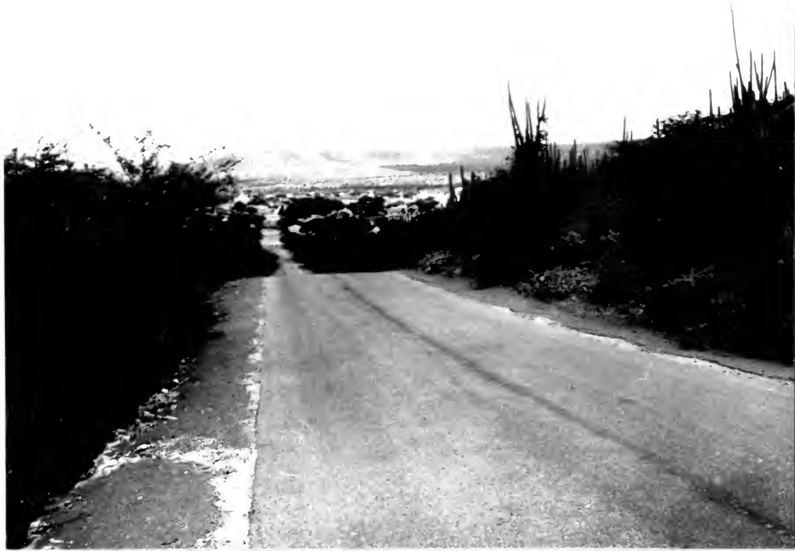
8841. Road to Rincón from Slagbaai, Bonaire, N.A. February 9, 1969.