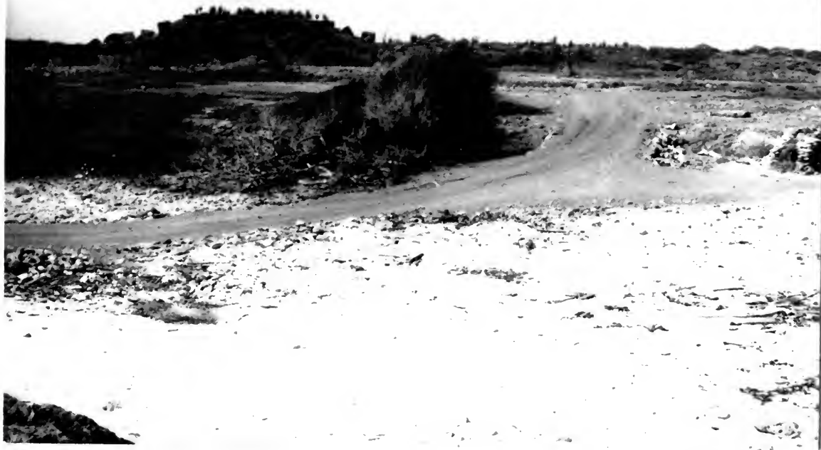
8851. Road leading north toward Washington National Park, at Eoca Onima, Bonaire, N.A. February 13, 1969.