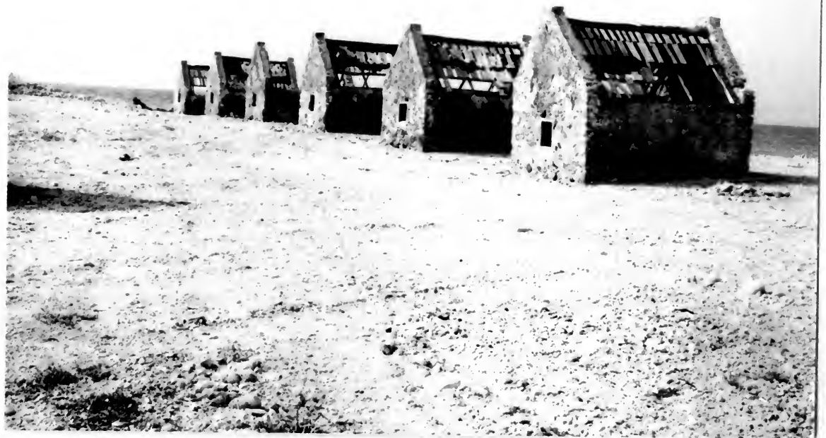
8908. Ancient slave huts near Pekelmeer, Bonaire, N.A. February 28, 1969.