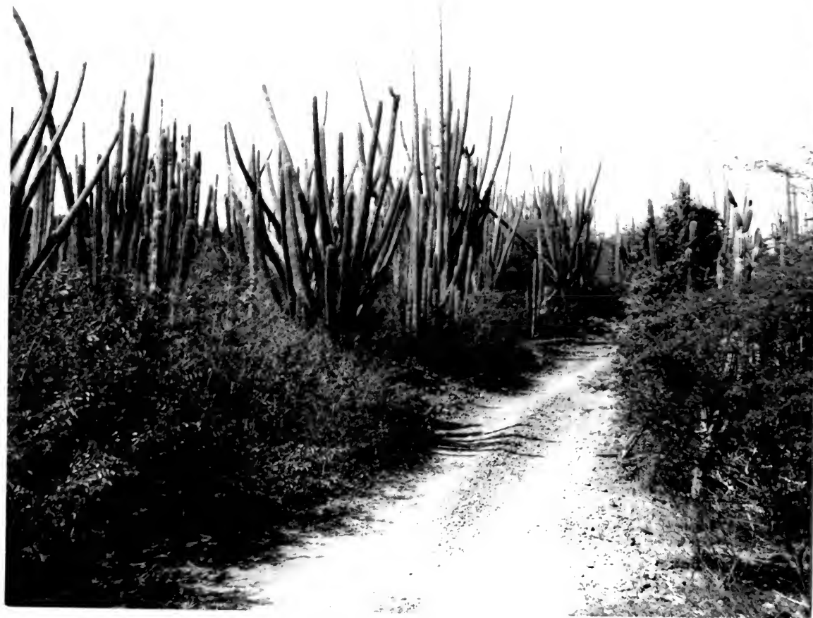
8871. Organ cactus lining road on Slagbaai Plantation. Bonaire, N.A. February 16, 1969.