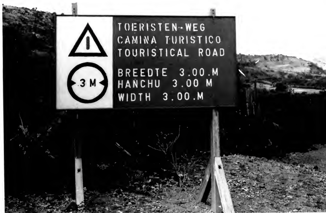
8826. "Touristical Road", above Rincón, Bonaire, N.A. February 8, 1969.