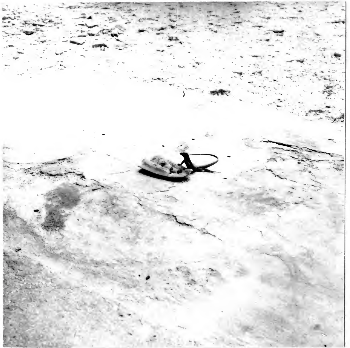
8892. Lizard and watermelon rind on our porch. Slagbaai, Bonaire, N.A. February 22, 1969.