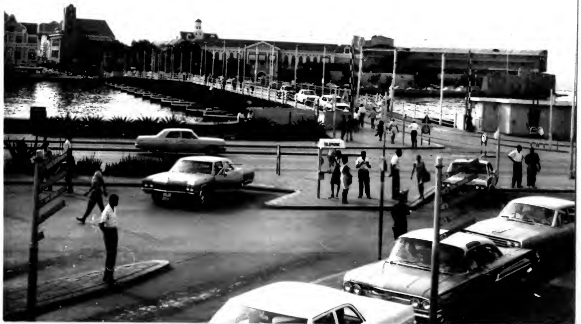
8914. Harbor entrance, Curaçao, N.A. March 3, 1969.