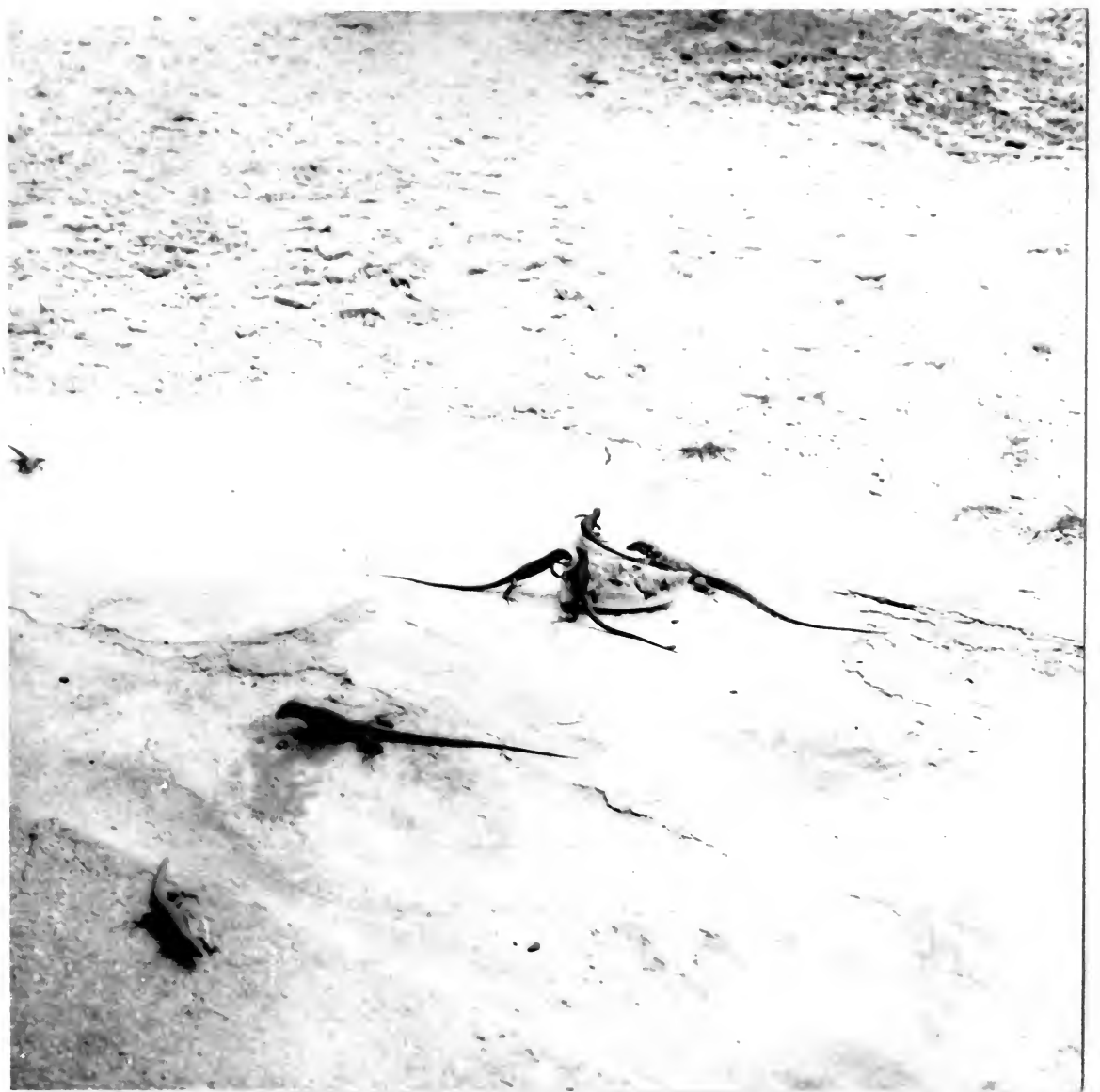
8890. Lizards on our porch, feasting on watermelon rind. Slagbaai, Bonaire, N.A. February 22, 1969.