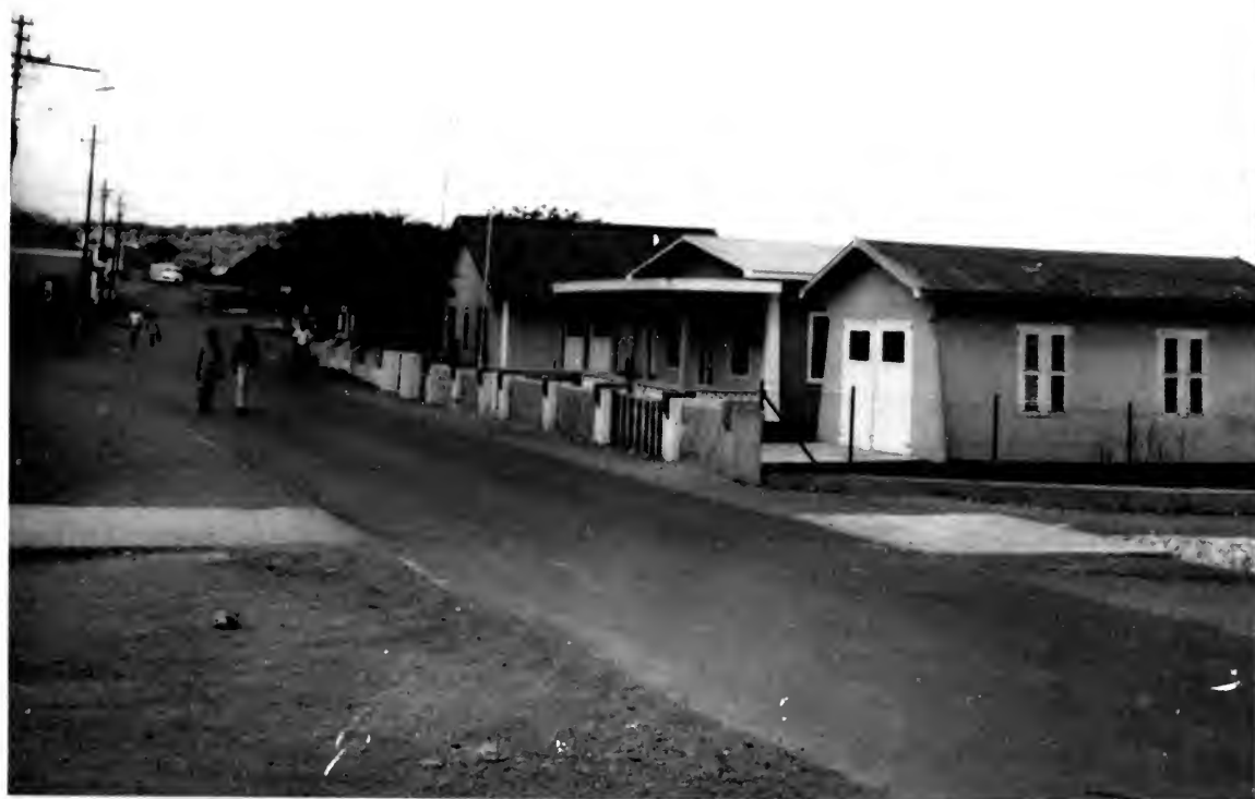
8825. Street in Rincón, Bonaire, N.A. February 8, 1969.