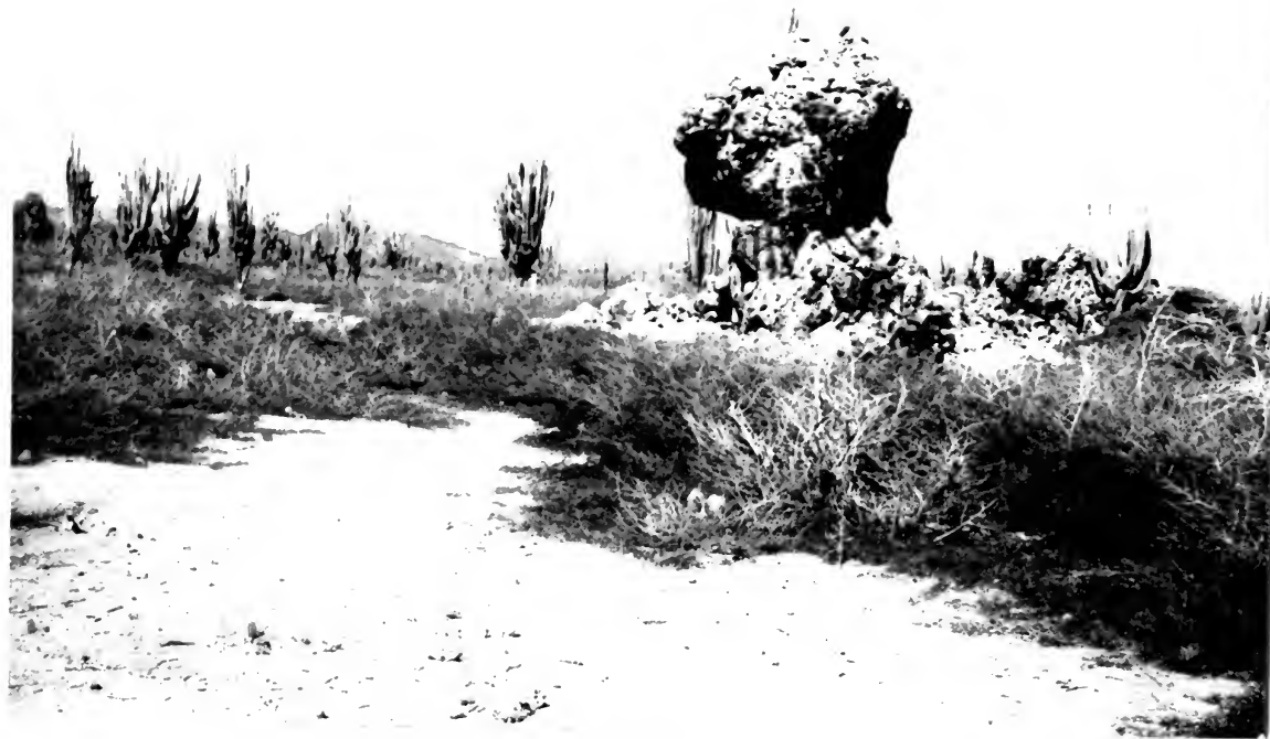
8877. Piedra Bonaire, a pinnacle rock, north of Onima, Bonaire, N.A. February 18, 1969.