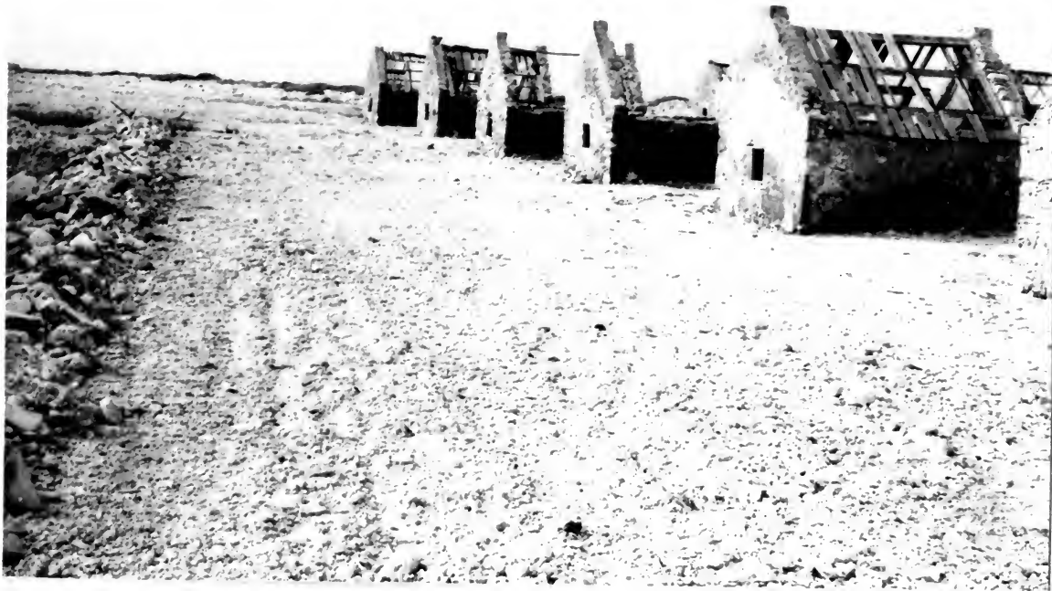
8907. Ancient slave huts near Pekelmeer, Bonaire, N.A. February 28, 1969.