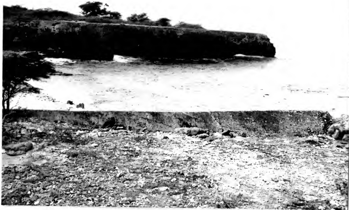
8903. The south end of Slagbaai Bay, taken from the escarpment back of our house. Bonaire, N.A. February 26, 1969.