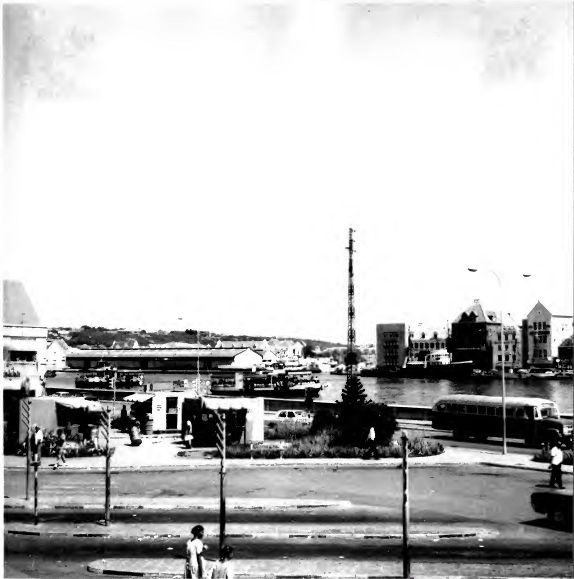
8921. Ferries crossing the harbor. Brionplein in foreground. Curaçao, N.A. March 3, 1969.