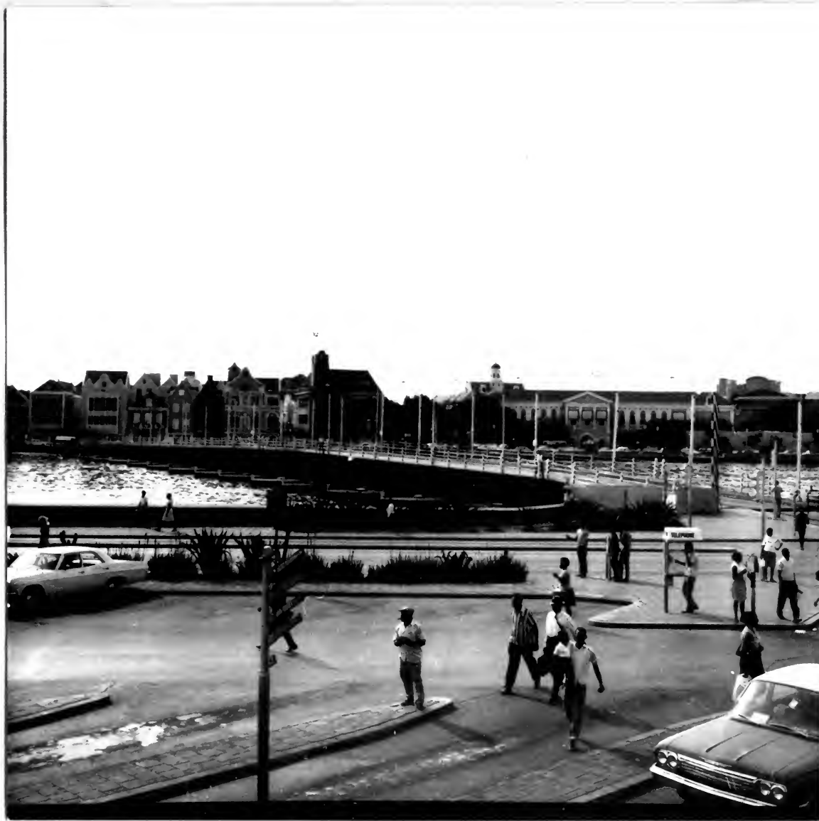
8923. The bridge beginning to open. Curacao, N.A. March 3, 1969.