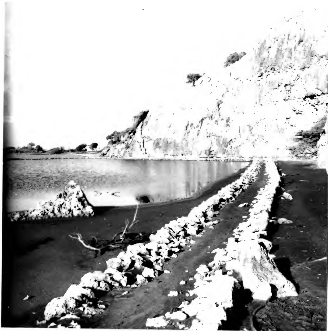
8861. Old salt evaporating ponds, Salina Playa Frans, Brasiel, Bonaire, N.A. February 14, 1969.