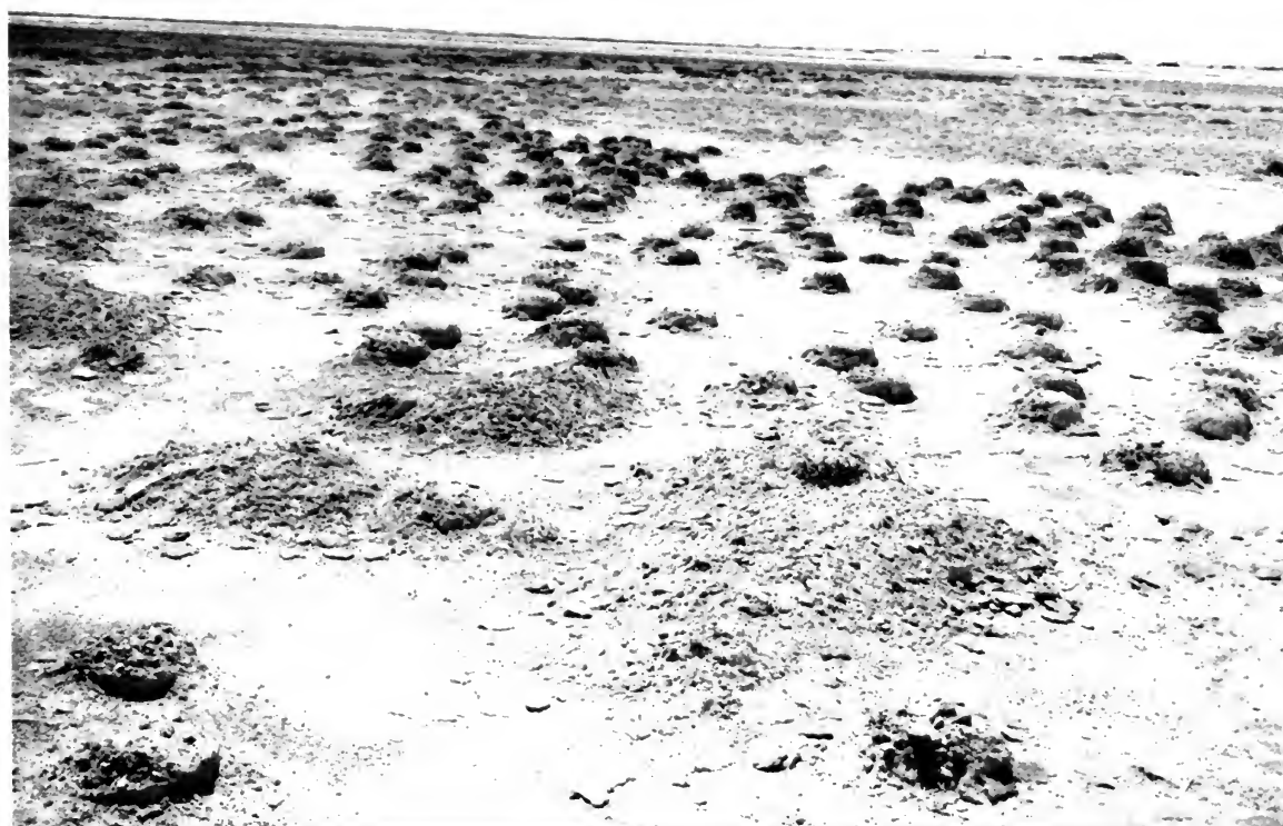
8846. Older nest turrets, probably of 1967, at Pekel- meer, Bonaire, N.A. February 12, 1969.