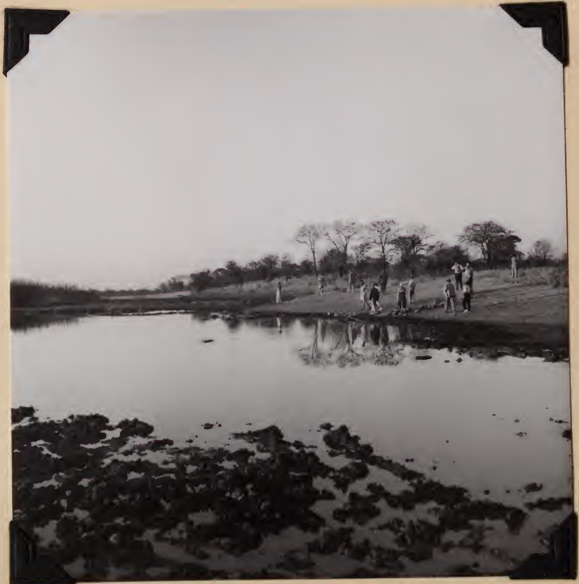
6478. A water hole, Wan- kie Game Reserve, Southern Rhodesia. July 13, 1957.