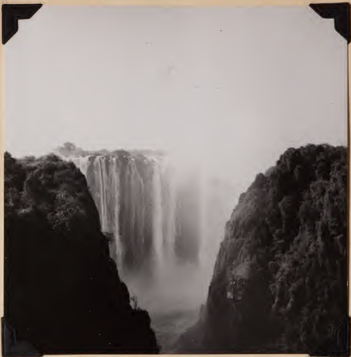
6487. Victoria Falls, July 16, 1957