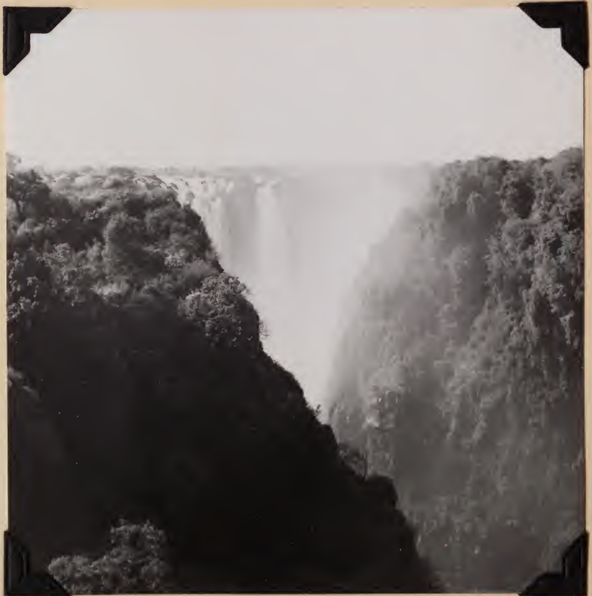
6486. The Victoria Falls on the Zambesi River, boundary of Southern and Northern Rhodesia. July 16, 1957