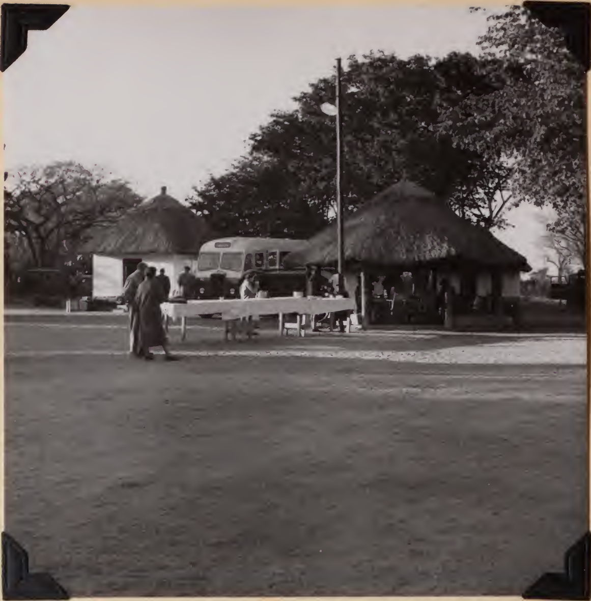
6471. Shumba Camp, Wankie Game Reserve, Southern Rhodesia. July 13, 1957