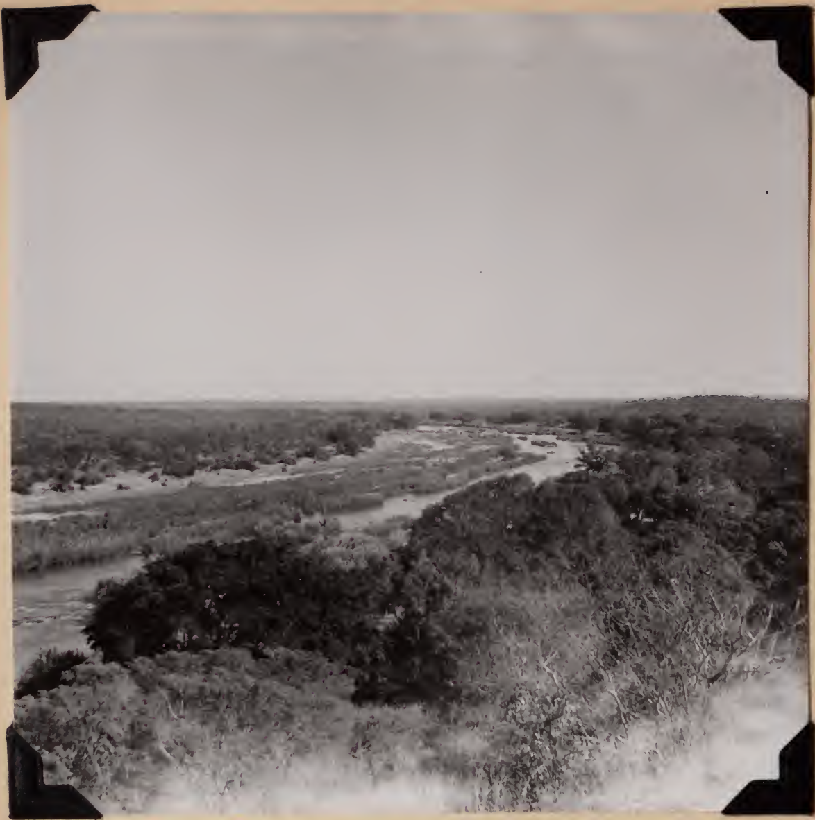
6527. Oliphants River, Kruger National Park, Transvaal. July 27, 1957