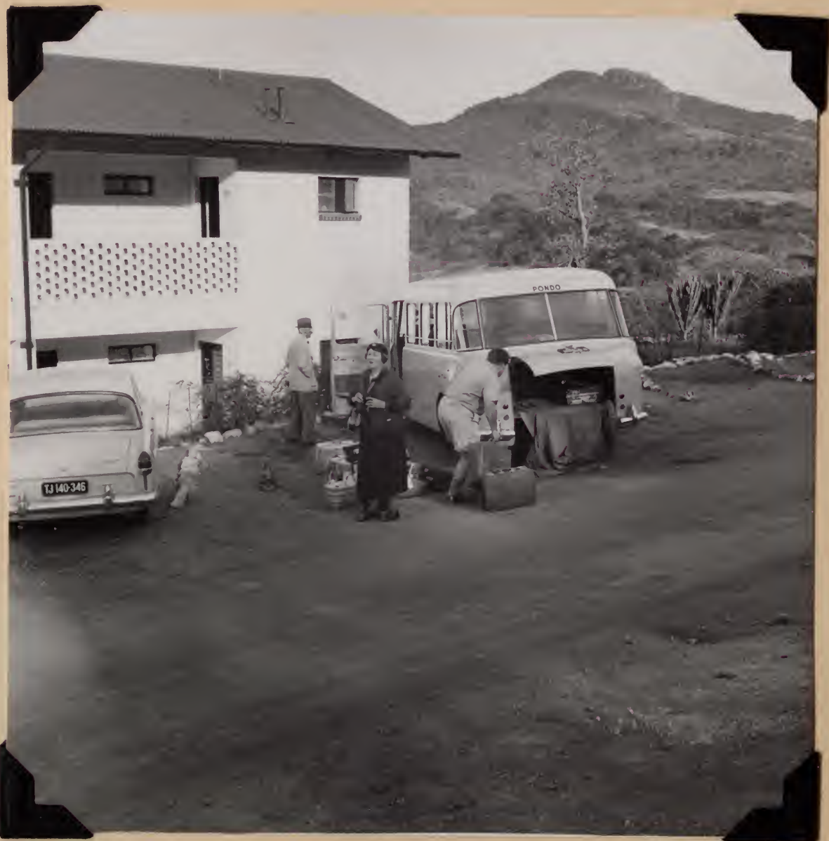
6520. Loading our baggage at Mountain Inn in the Zoutpanberg Mountains, Transvaal July 25, 1957