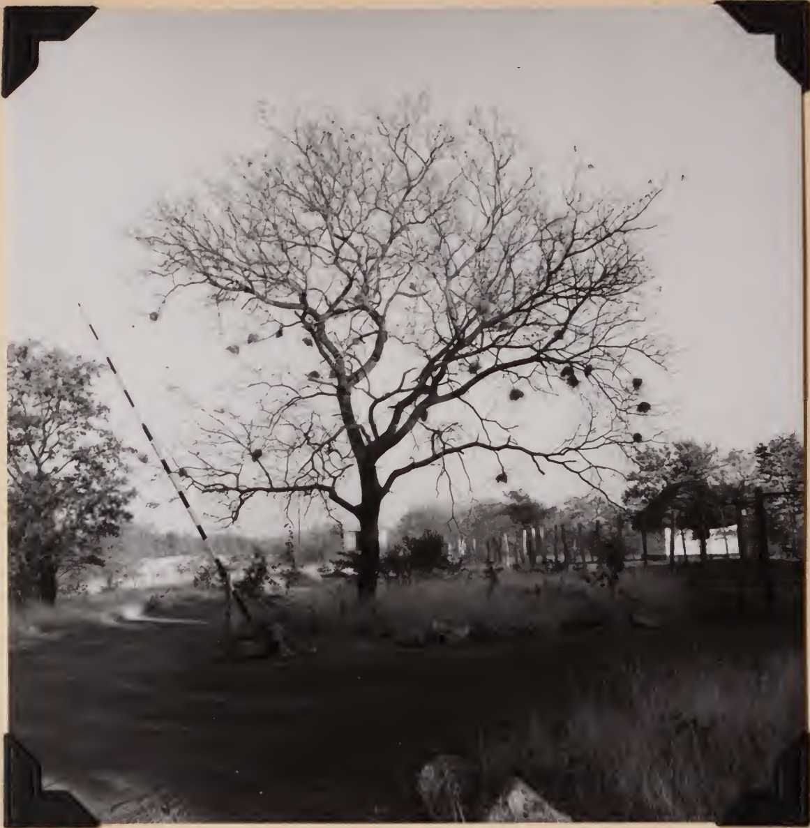
6483. Nests of the Sparrow Weaver ( Plocepasser mahali ) at Robins Camp, Wankie Game Reserve, Southern Rhodesia. July 14, 1957