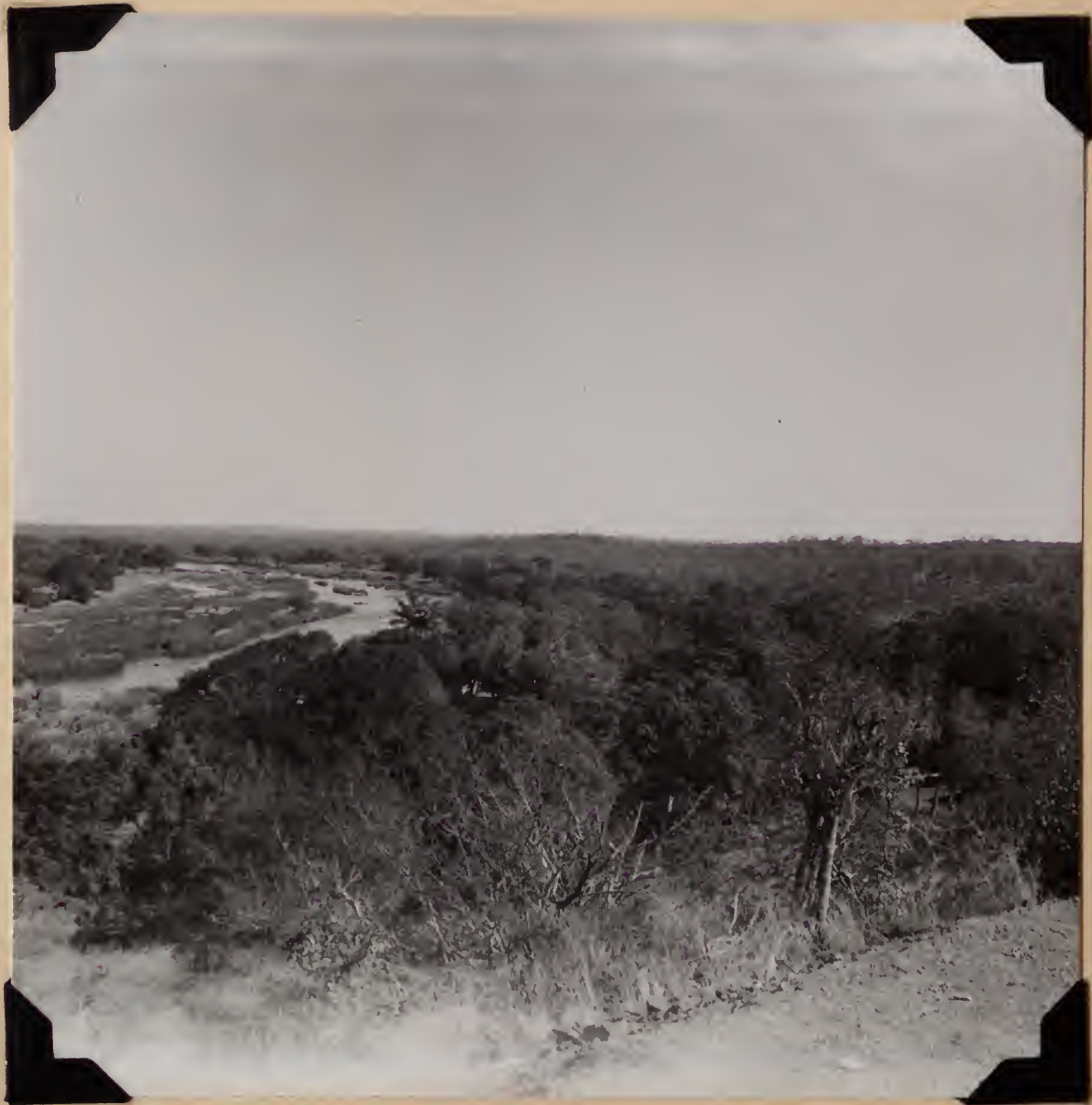
6526. Oliphants River, Kruger National Park, Transvaal. July 27, 1957