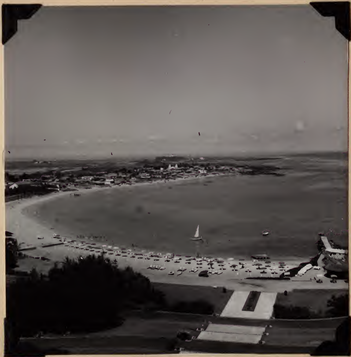
6568. Village and bay from balcony of Hotel N'Gor, Dakar, Senegal, August 9, 1957