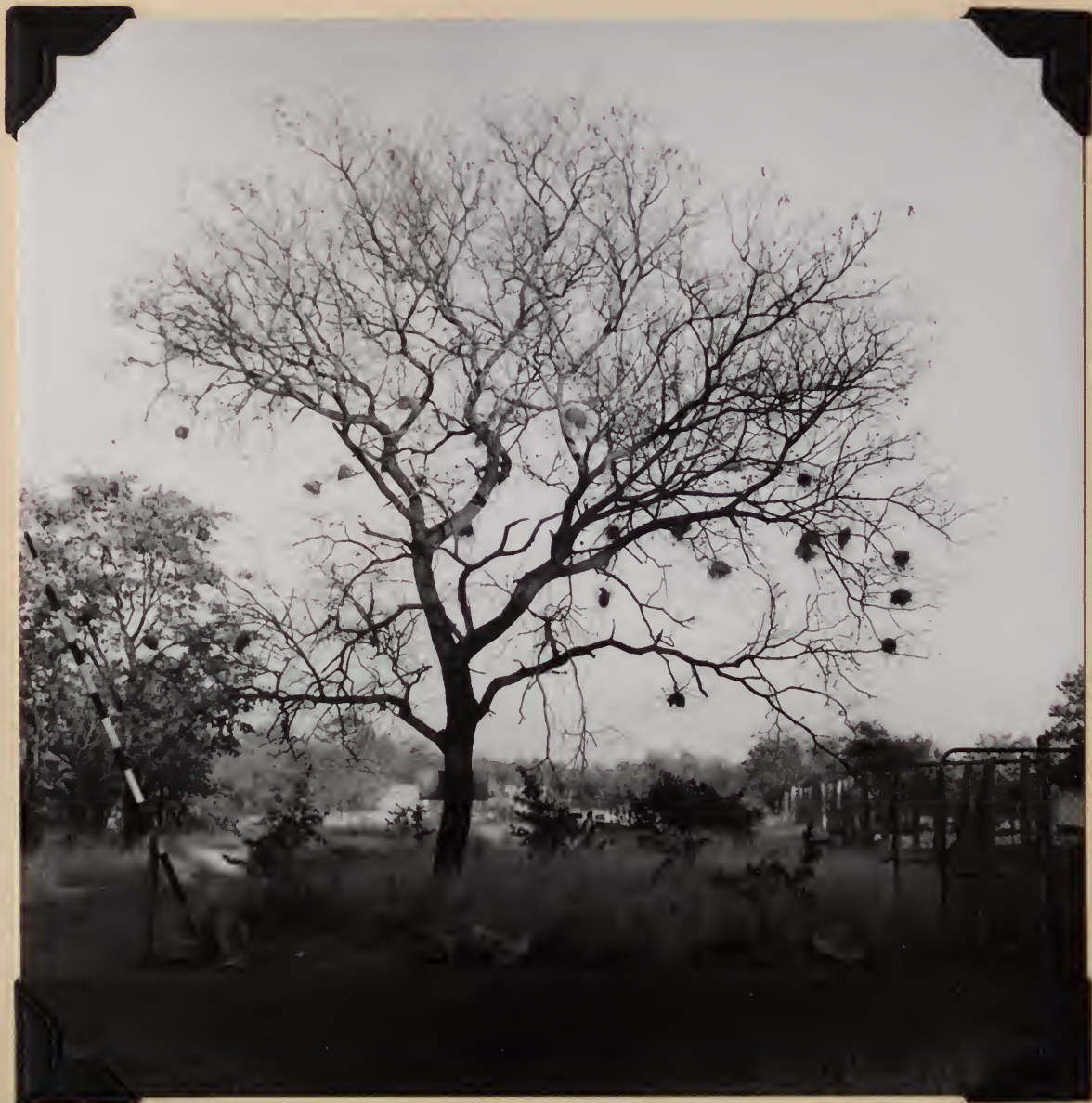
6482. Nests of the Sparrow Weaver ( Plocepasser mahali ) at Robins Camp, Wankie Game Reserve, Southern Rhodesia. July 14, 1957