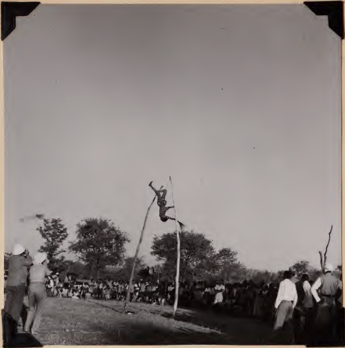
6503. Nyalindele performs. Livingstone, Northern Rhodesia. July 20, 1957