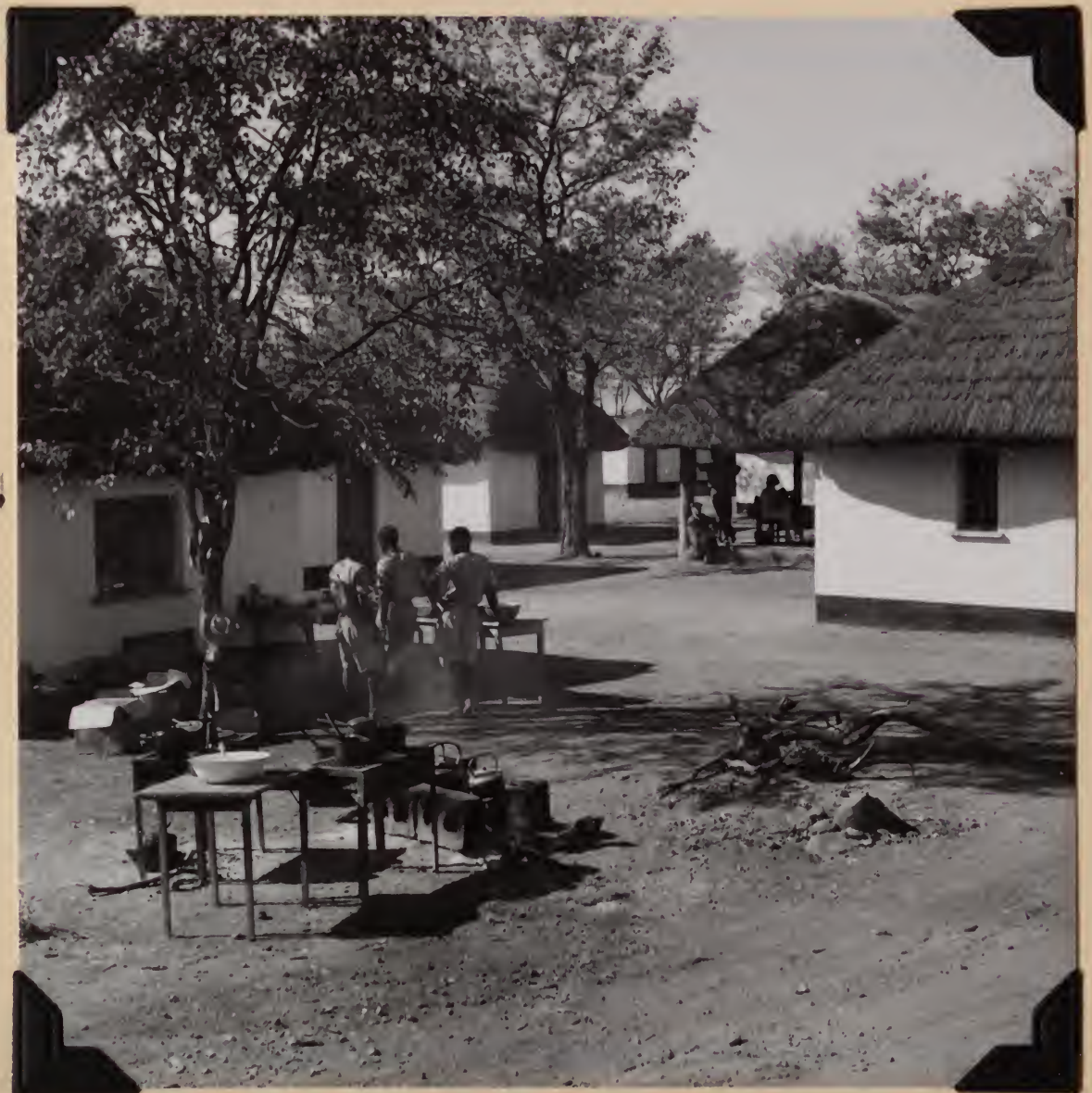
6474. The cooking fires, Shumba Camp, Wankie Game Reserve, Southern Rhodesia. July 13, 1957.