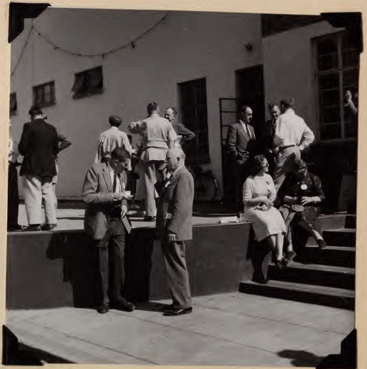
6496. Congress members at ease, Livingstone July 17, 1957