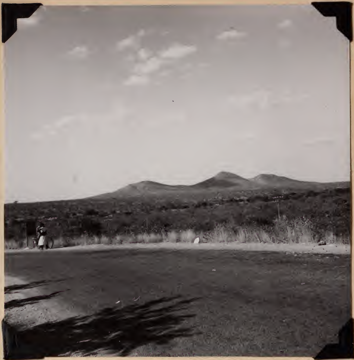
6517. At Beit Bridge, Transvaal. July 24, 1957