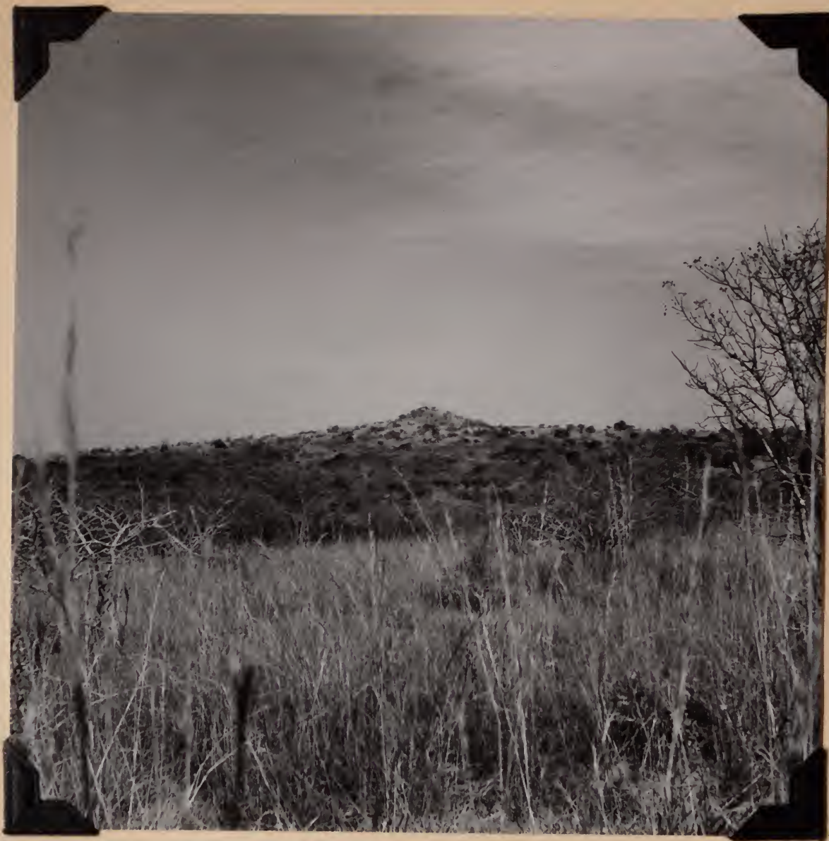
6539. Pretorius Kop, Kruger National Park, Transvaal. July 29, 1957