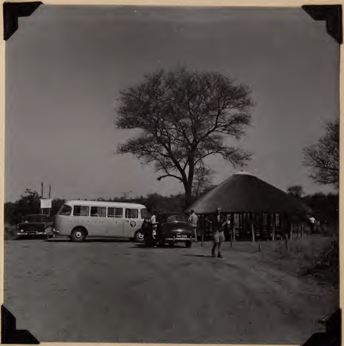
6524. At Nshawu Camp, Edwin Cohen at right. July 26, 1957