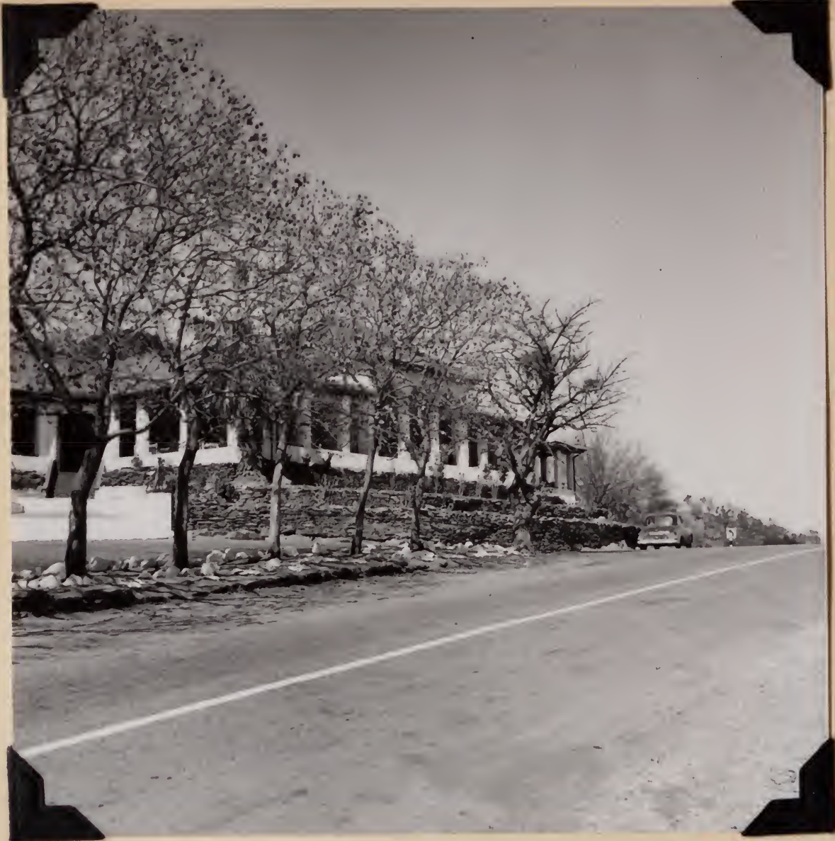
6511. Luncheon stop at Gwanda, Southern Rhodesia. July 24, 1957