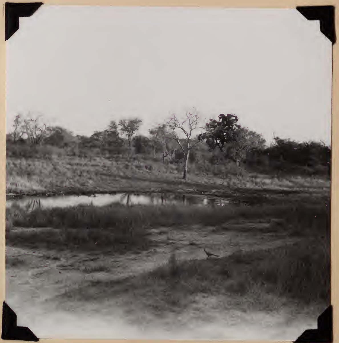
6528. Water hole near Satara. Go-way bird, Crinifer concolor in foreground.