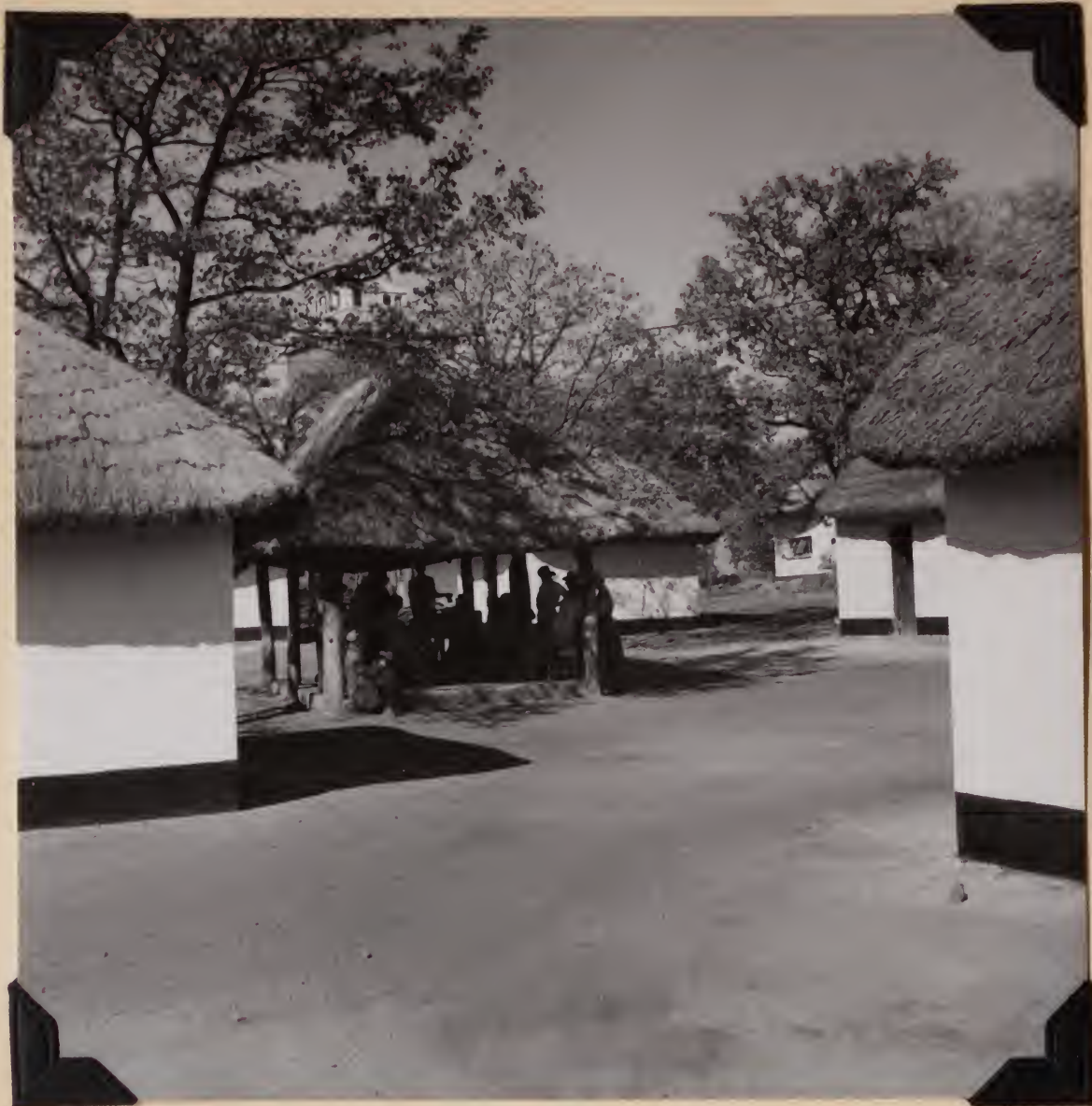
6475. In Shumba Camp, Wankie Game Reserve, Southern Rhodesia. July 13, 1957