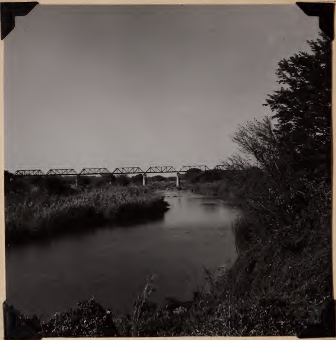
6529. Sabie River at Skukuza Rest camp, Kruger National Park, Transvaal. July 28, 1957.