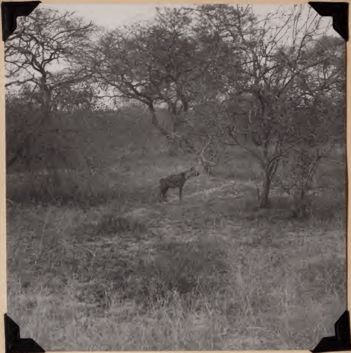
6533. Hyaena, Kruger Park, Transvaal. July 29, 1957