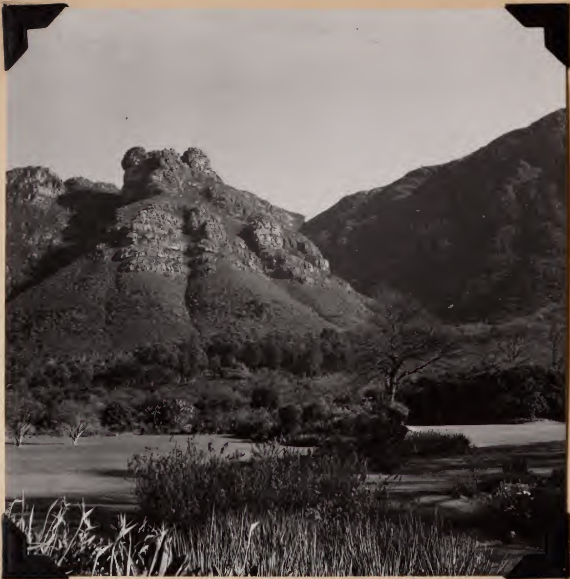
6553. In the botanic garden at Kirstenbosch, Cape Province. August 5, 1957