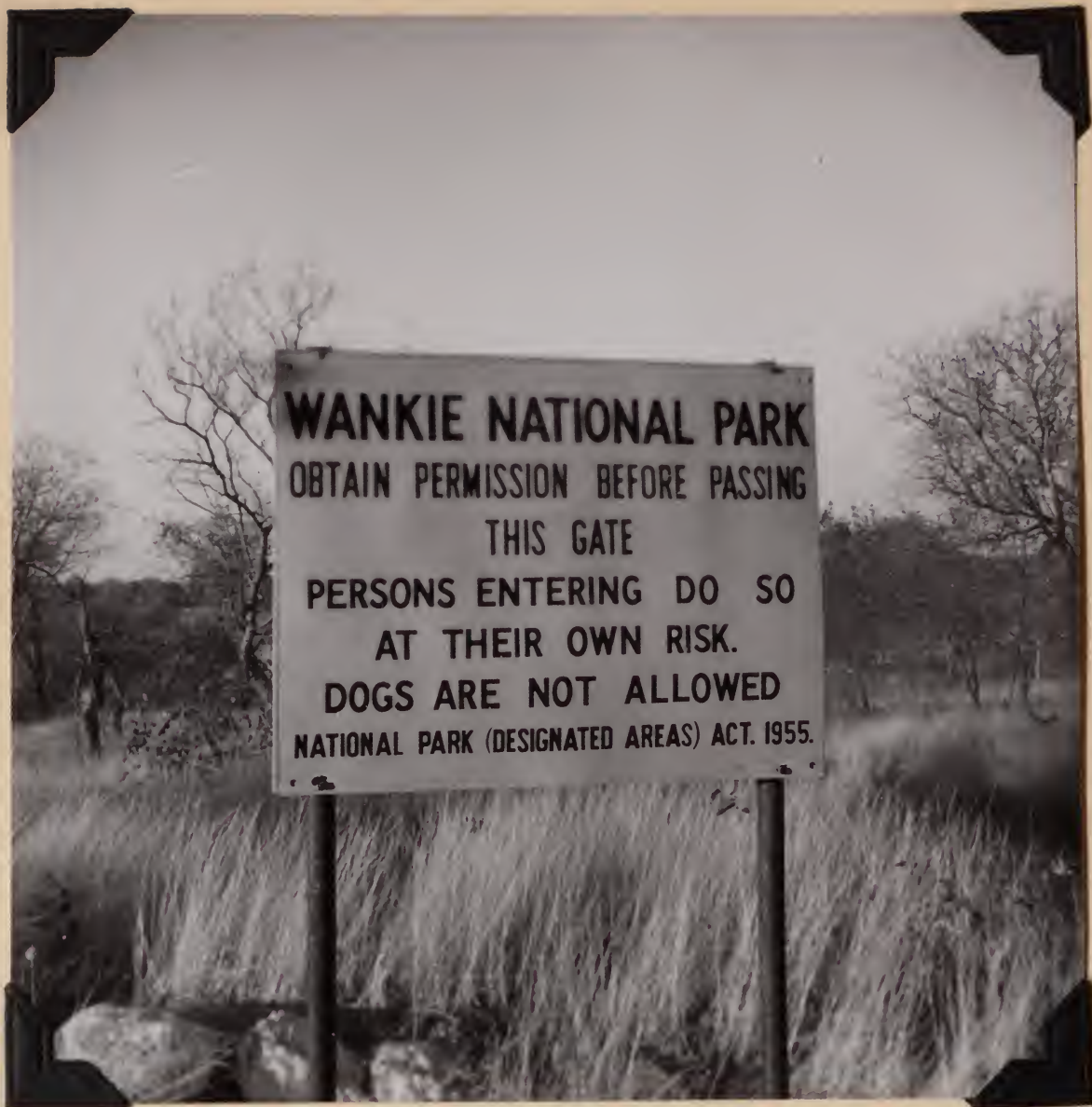
6479. At Robins Camp, Wankie Game Reserve. July 14, 1957