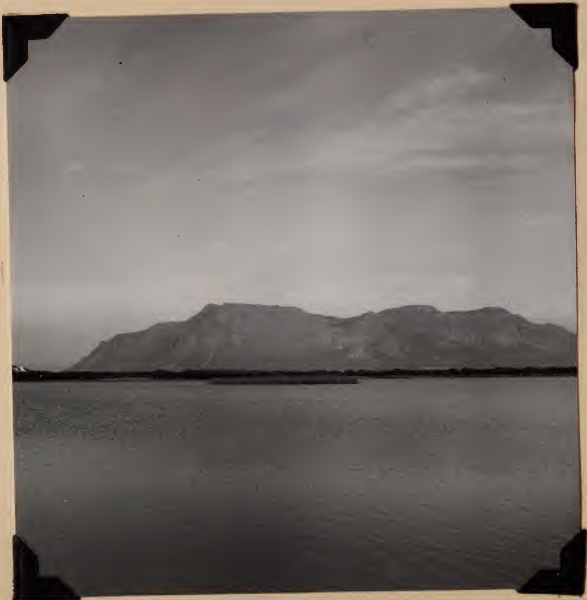
6556. Table Mountain from the Rondevlei Sanctuary, Cape Province. August 5, 1957