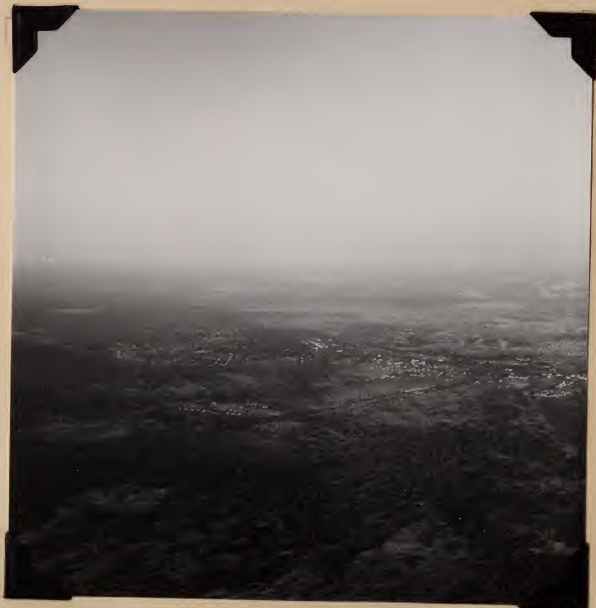
6564. Livingstone, Southern Rhodesia, from plane. August 8, 1957