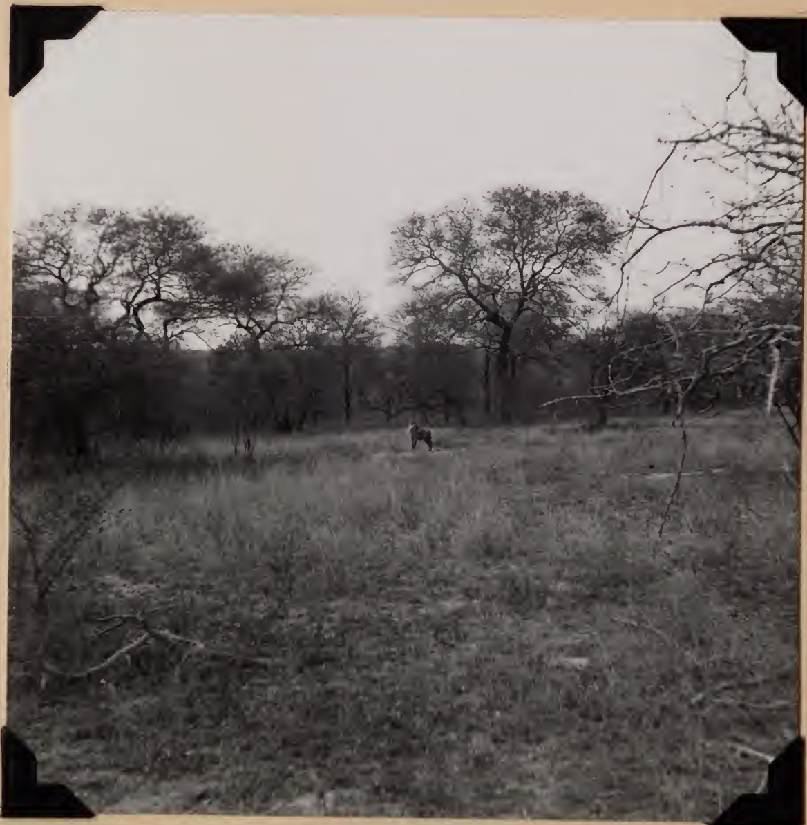
6532. Hyaena, near Pretorius Kop, Kruger National Park, Trans- vaal. July 29, 1957