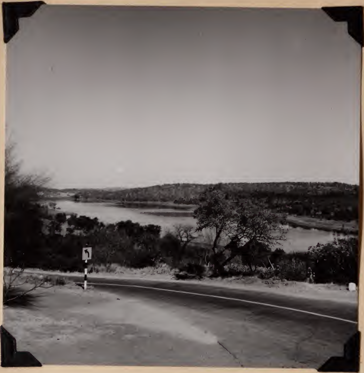
6515. The Limpopo River at Beit Bridge, Transvaal. July 24, 1957