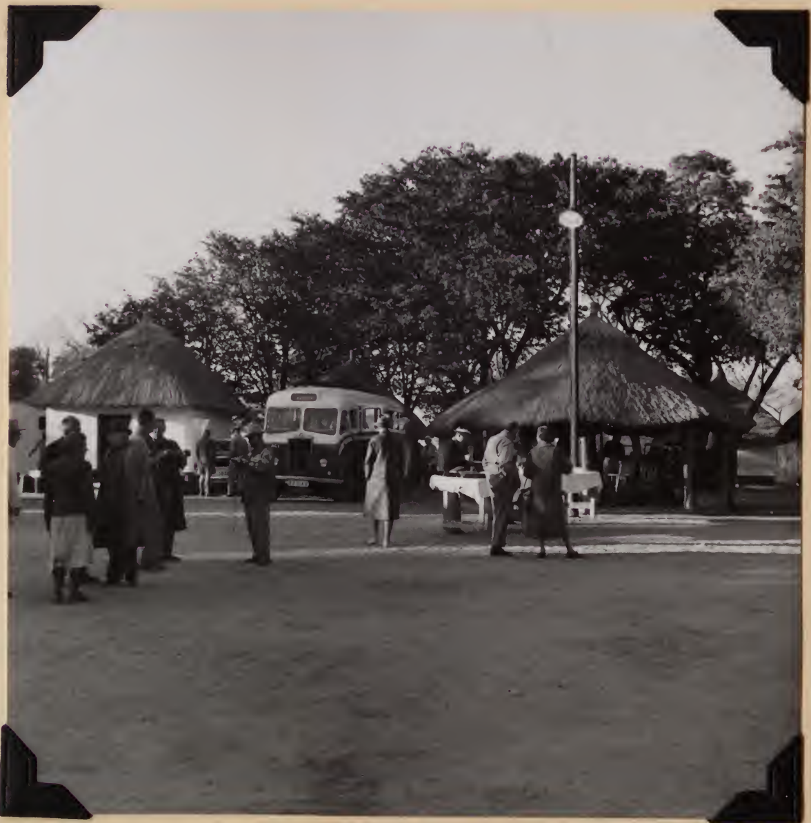
6472. Shumba Camp, Wankie Game Reserve, Southern Rhodesia. July 13, 1957.