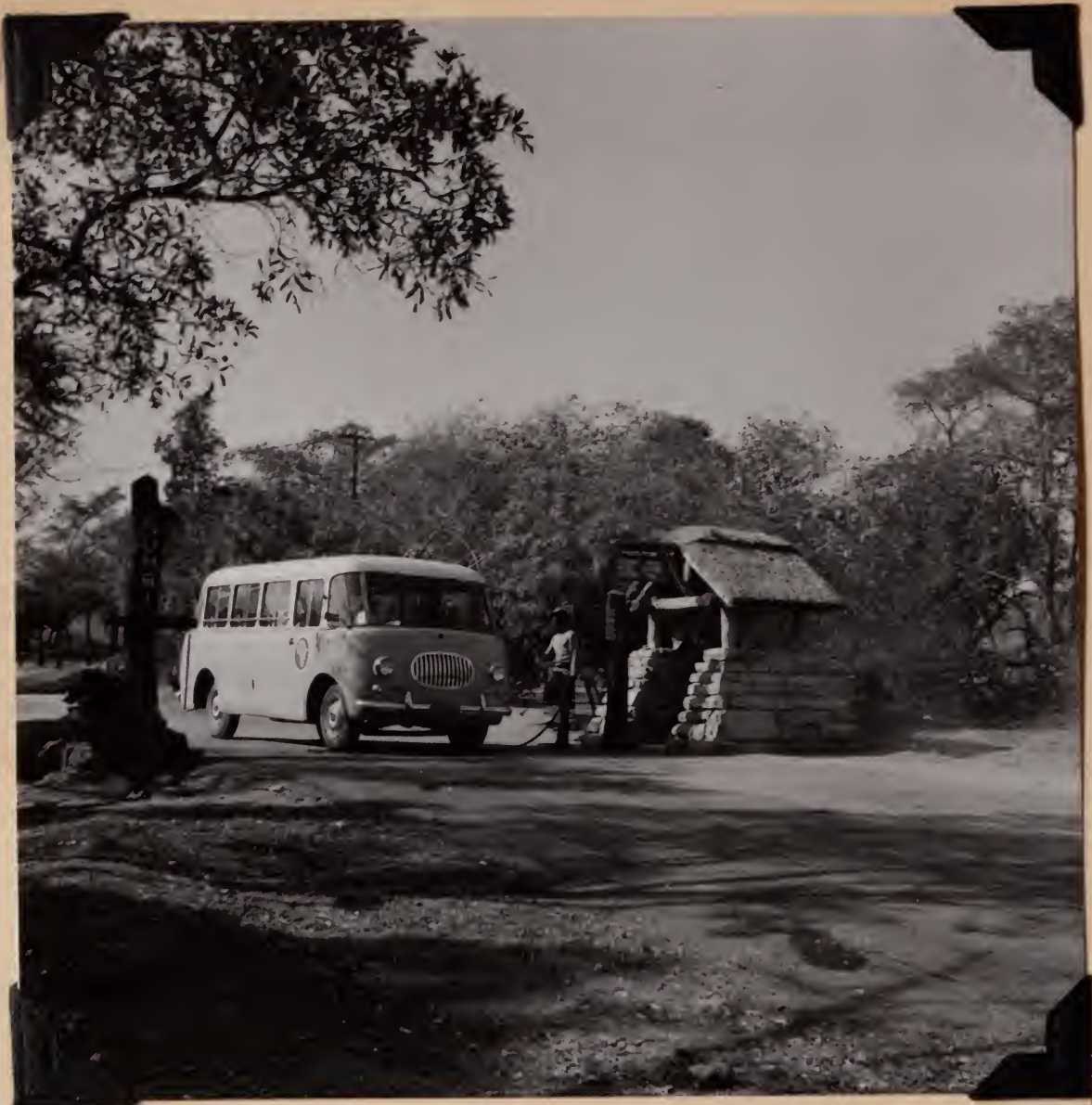
6543. Our bus leaves the Park via Numbi Gate. July 29, 1957