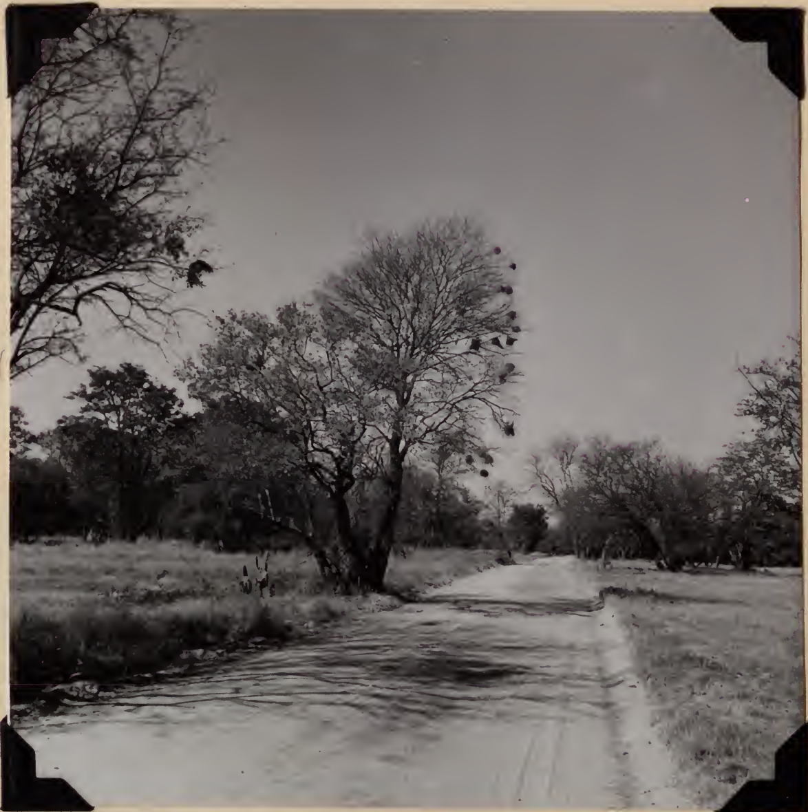
6508. Nests of the Sparrow-weaver ( Plocepasser mahali ) near Livingstone, Northern Rhodesia. July 21, 1957