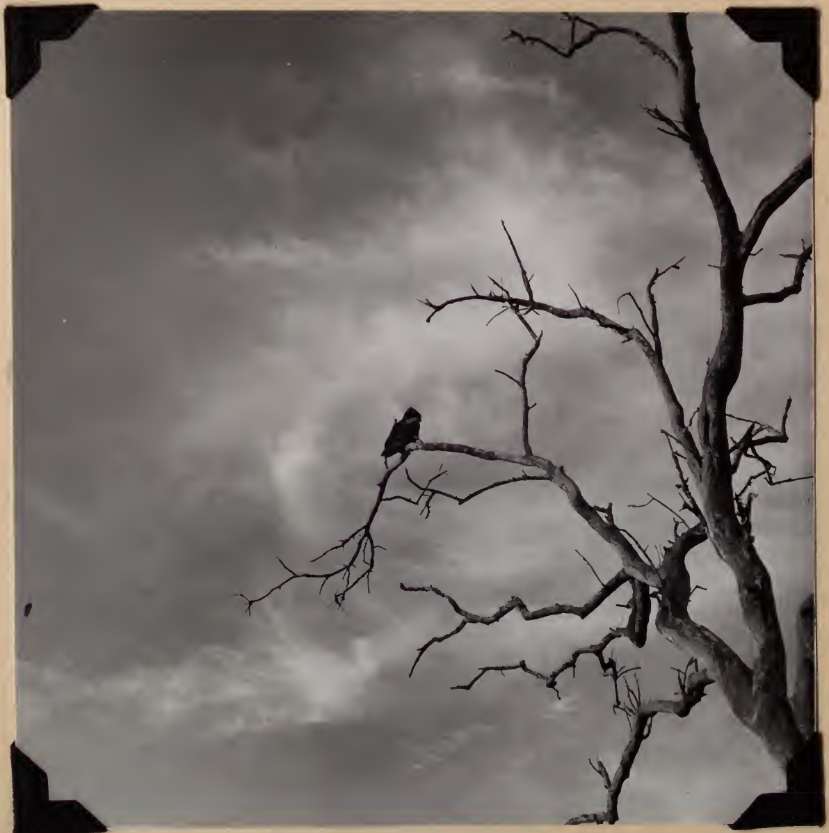
6522. Bateleur Eagle, Terathopius ecaudatus near Letaba, Kruger National Park, Trans- vaal. July 25, 1957

Two Hadeda Ibis feed- ing on bar in midstream.