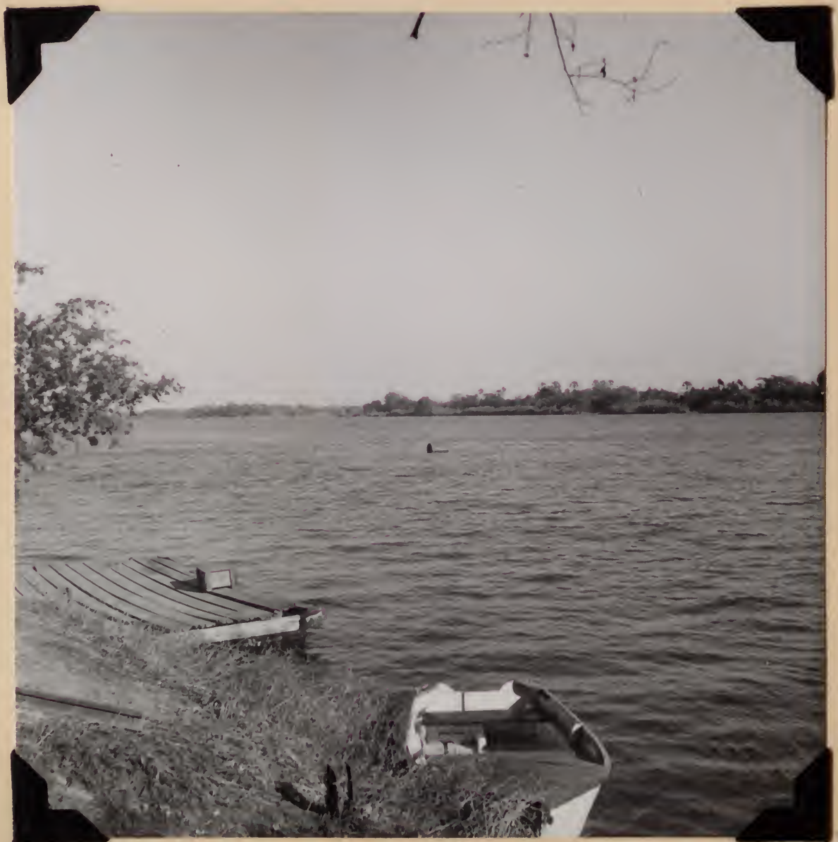
6498. Zambesi River above Victoria Falls. July 17, 1957