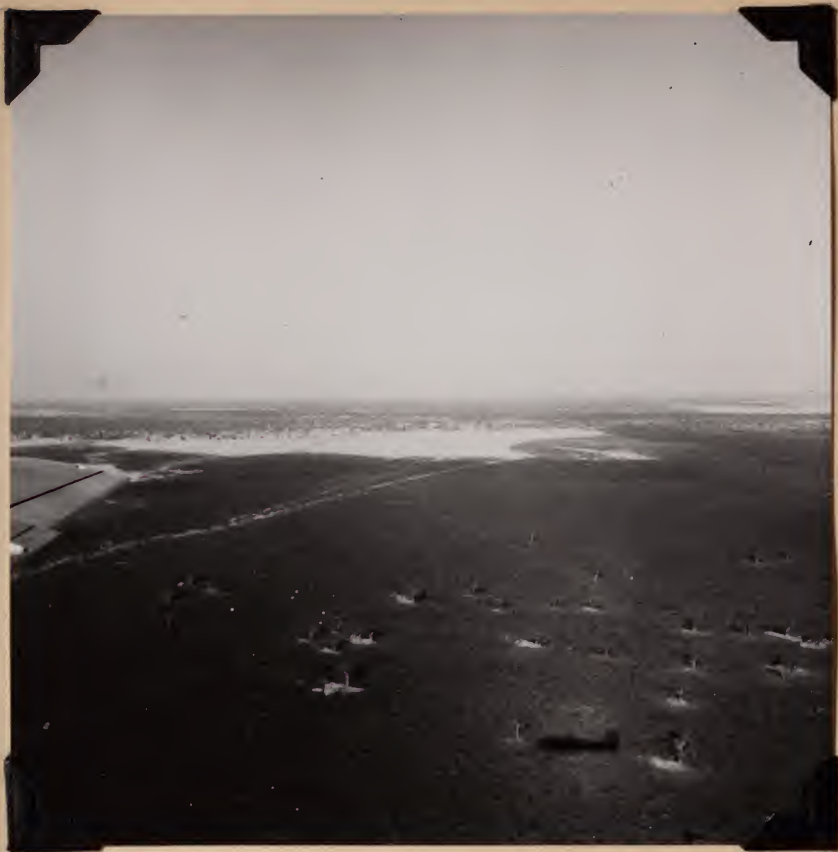
6563. Looking across the Wankie Game Reserve, Southern Rhodesia, from plane showing Kalahari sand August 8, 1957