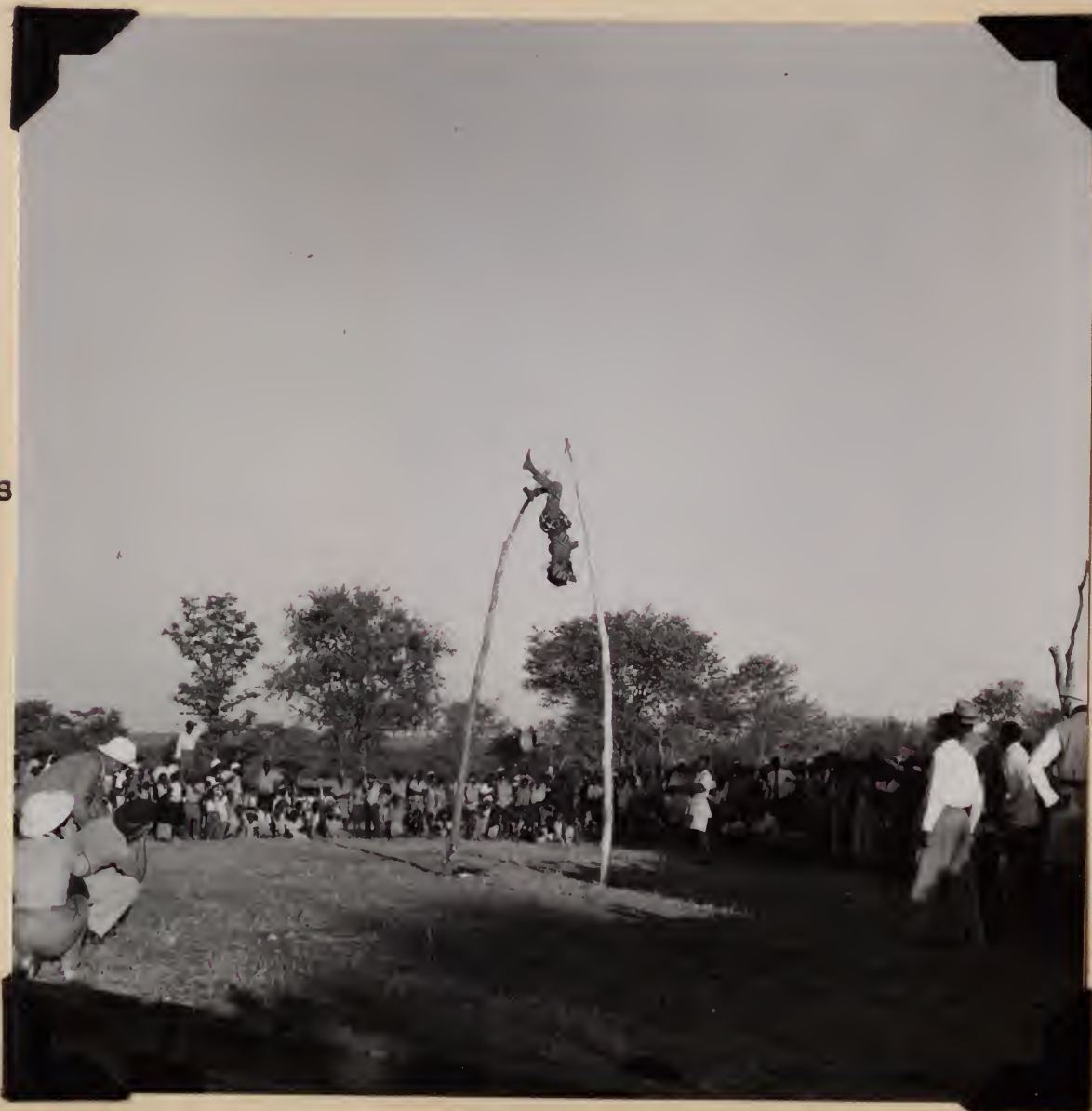
6502. The Makishi dancers present the aerial per- formance of the female character "Myalindele." Livingstone, Northern Rhodesia. July 20, 1957