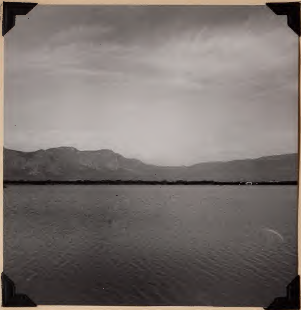
6557. Table Mountain from the Rondevlei Sanctuary, Cape Province. August 5, 1957