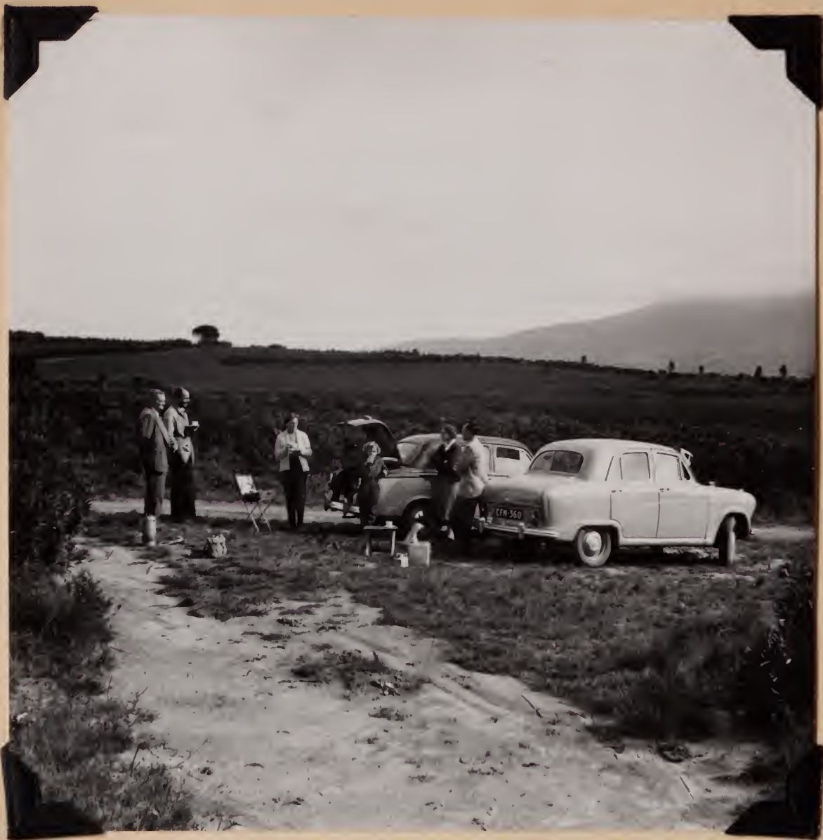
6561. At Vergelegen Farm, Somerset, West, Cape Province. August 6, 1957