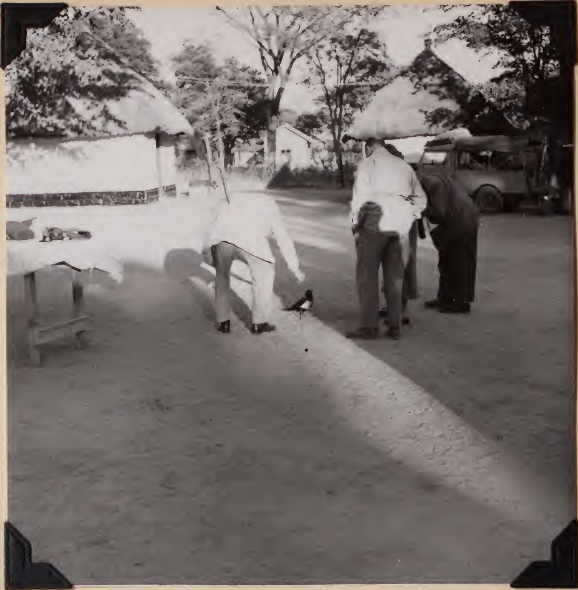
6477. A tame pied crow ( Corvus albus ), Shumba Camp, Wankie Game Reserve July 13, 1957