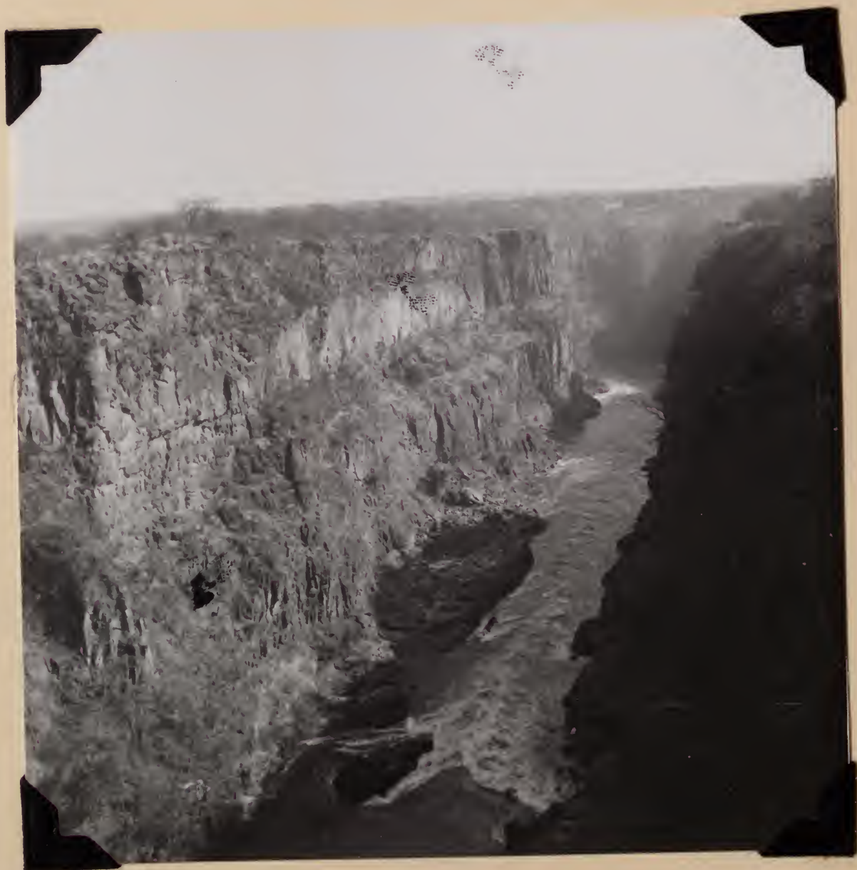
6490. Gorge below Vic- toria Falls. July 16, 1957