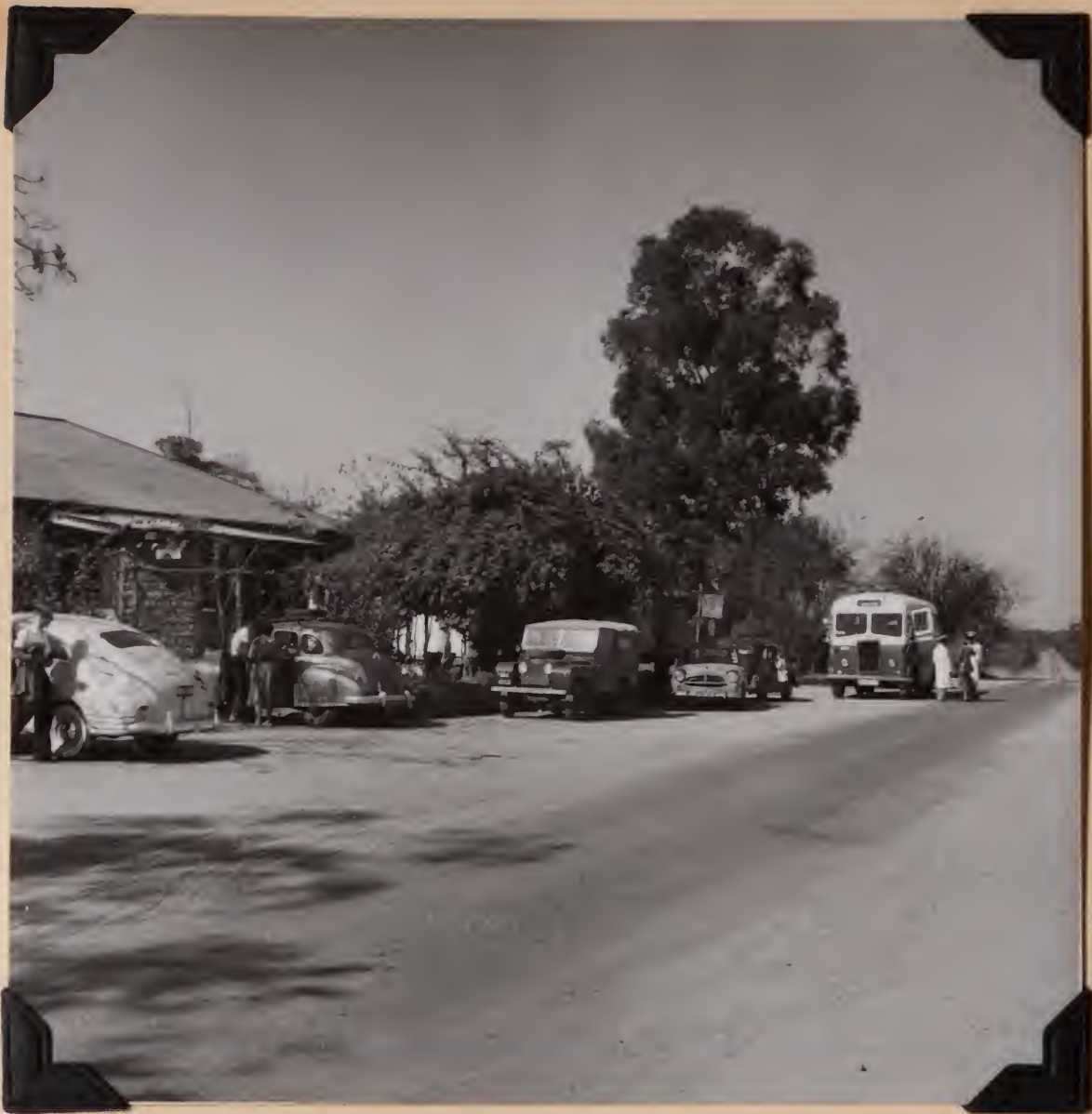
6469. Luncheon stop at Van Niekerk's Hotel near entrance to Wankie Game Reserve, Southern Rhodesia. July 12, 1957