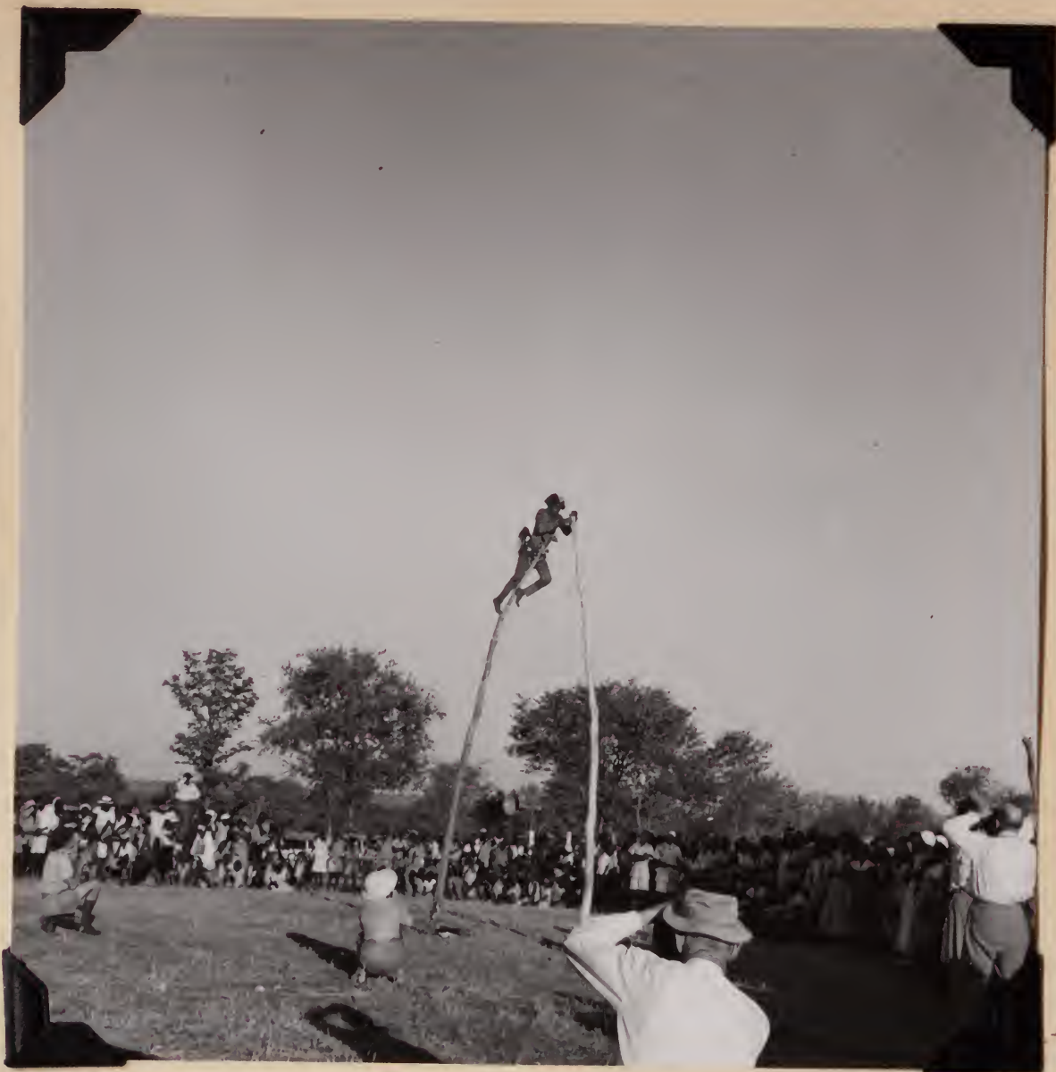
6501. Nyalindele, Livingstone, Northern Rhodesia. July 20, 1957