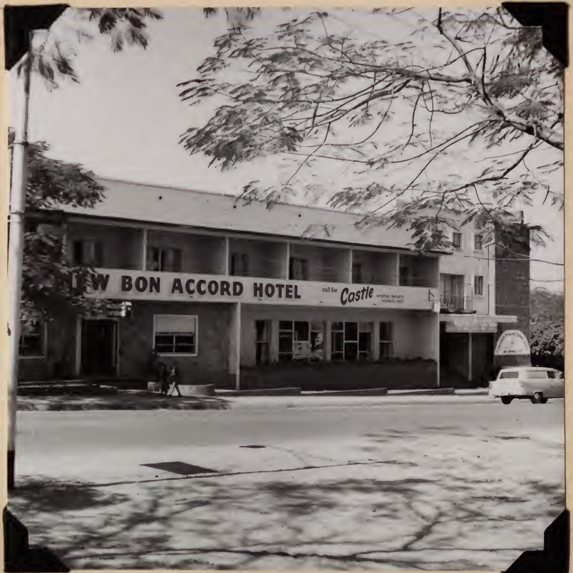
6492. Hotel headquarters at Livingstone, Northern Rhodesia. July 17, 1957