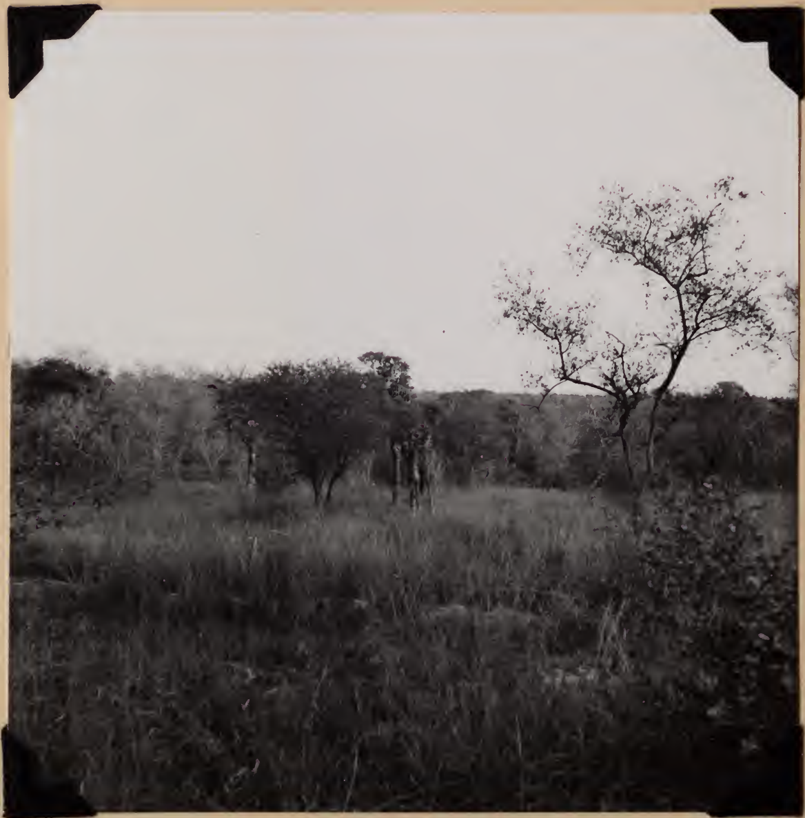
6534. Giraffe near Pretorius Kop, Kruger National Park, Trans- vaal. July 29, 1957