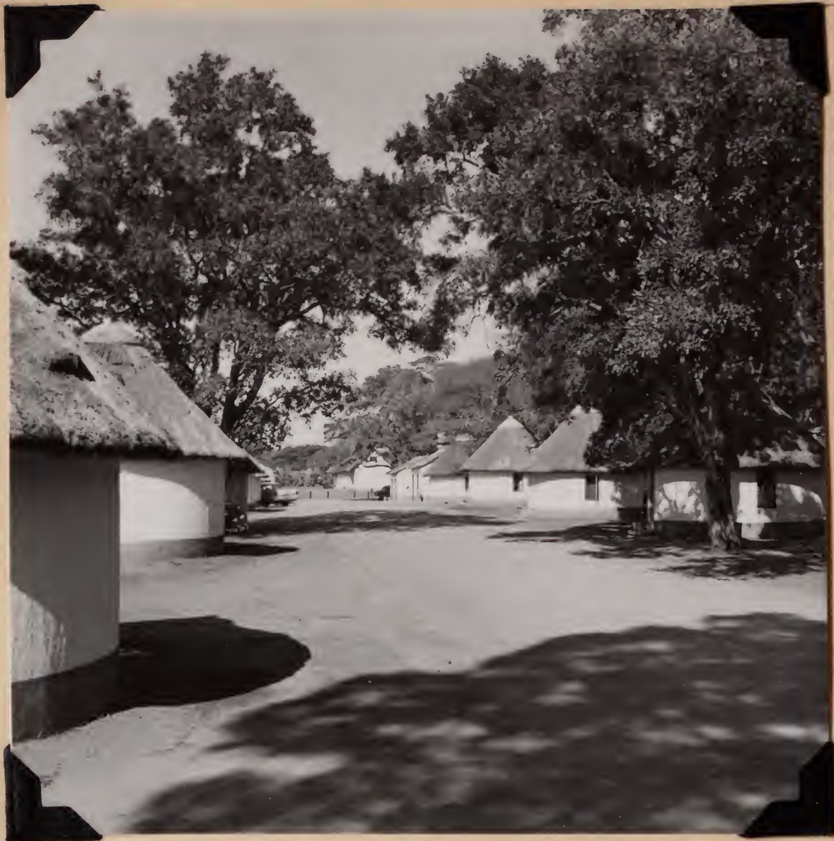
6525. Letaba Rest Camp, Kruger National Park, Transvaal. July 26, 1957