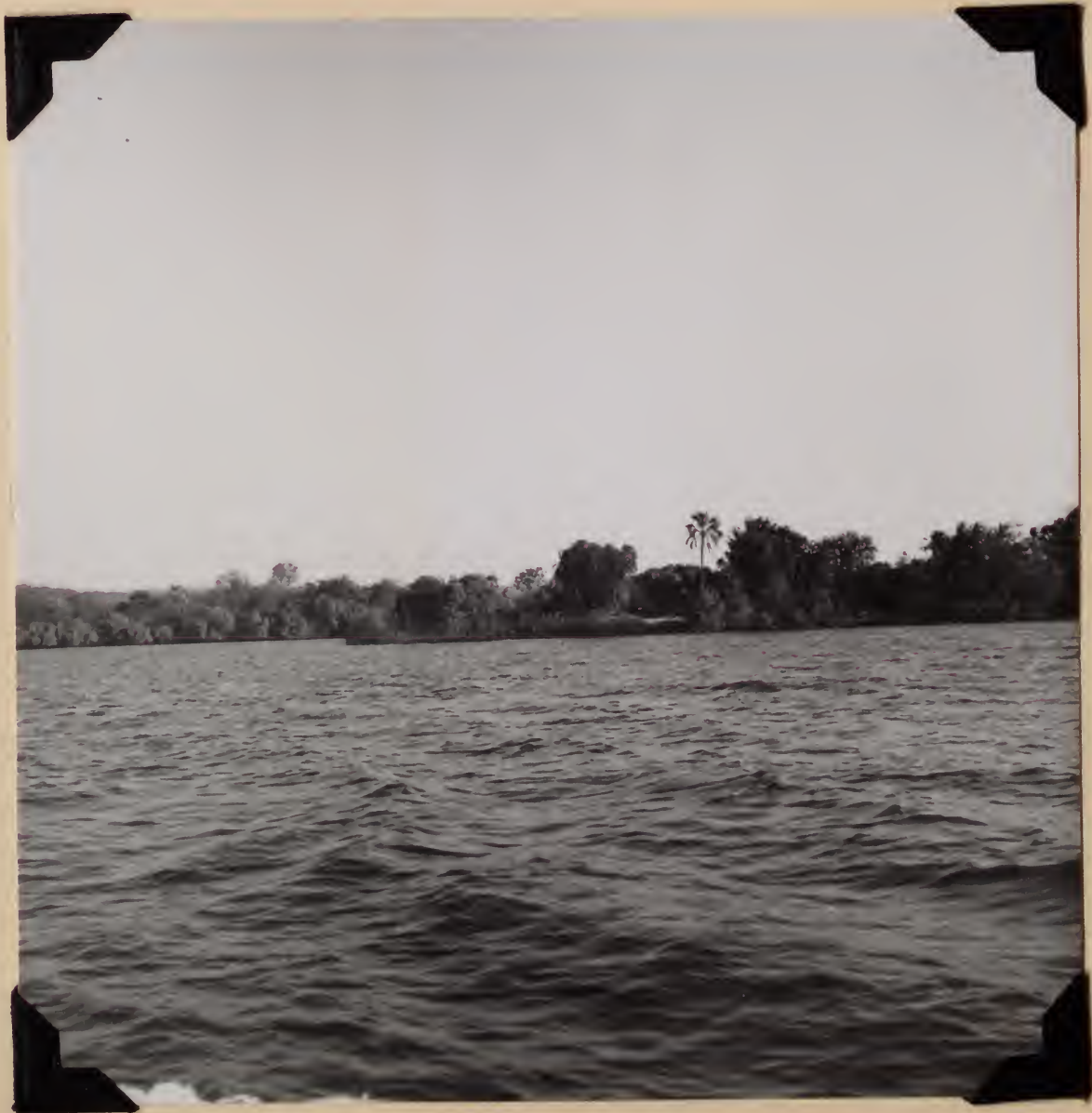
6500. Zambesi River above Victoria Falls. July 17, 1957