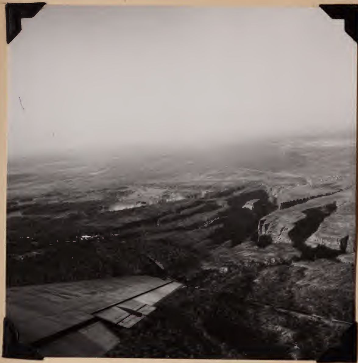
6565. Victoria Falls and the gorge on the Zambesi, from plane. August 8, 1957