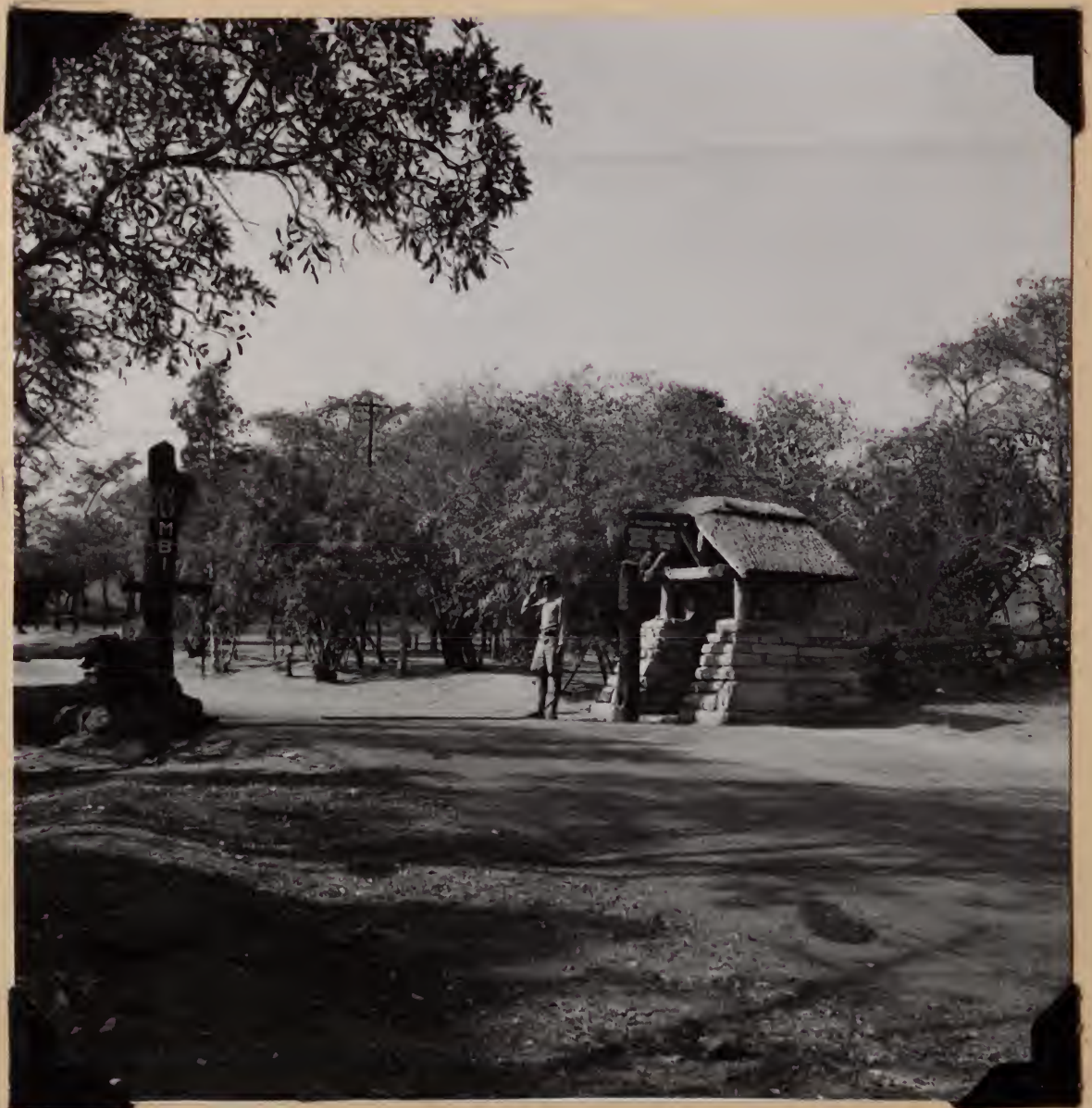
6542. The Numbi Gate, Kruger National Park, Transvaal. July 29, 1957