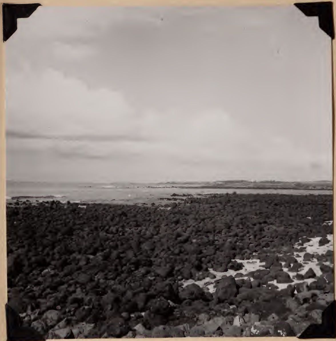
6567. Rocky beach at Dakar, Senegal. August 9, 1957