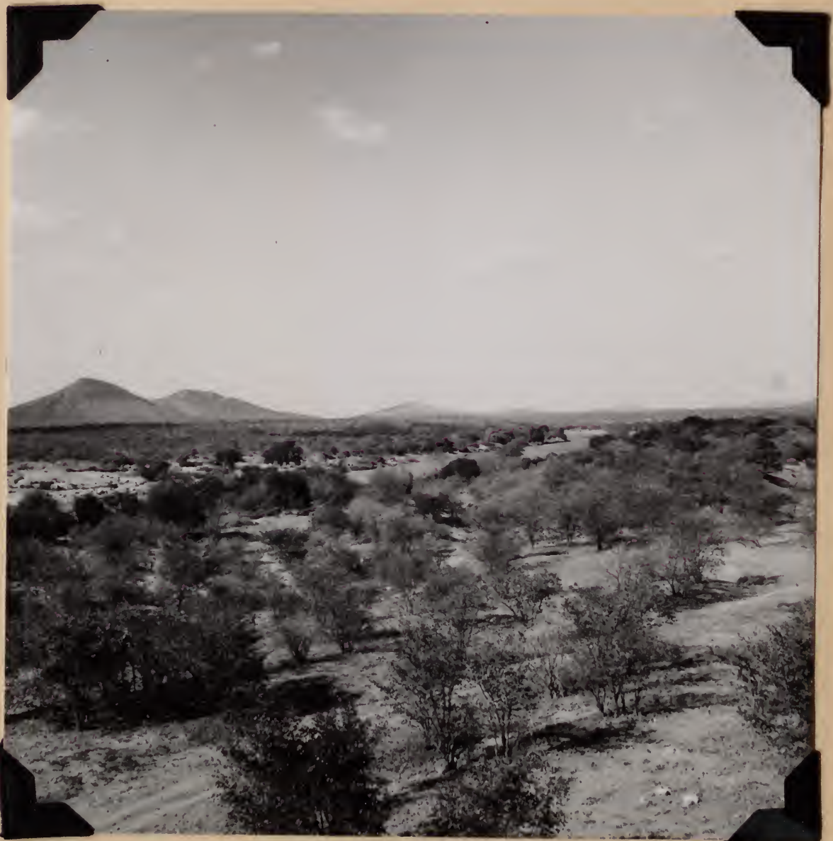
6518. At Beit Bridge, Transvaal. July 24, 1957