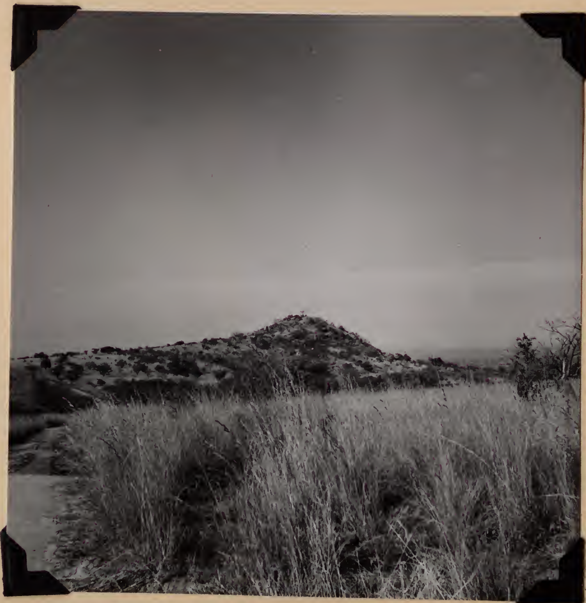
6540. Pretorius Kop, Kruger Park, Trans- vaal. July 29, 1957