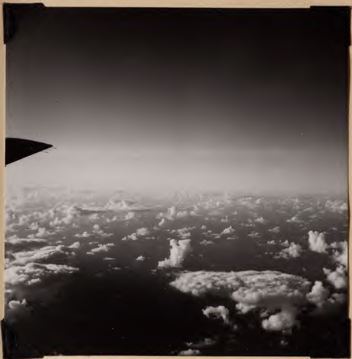
6569. Sunset clouds from plane at 19,000 feet. East of Lisbon, Portugal. August 12, 1957.