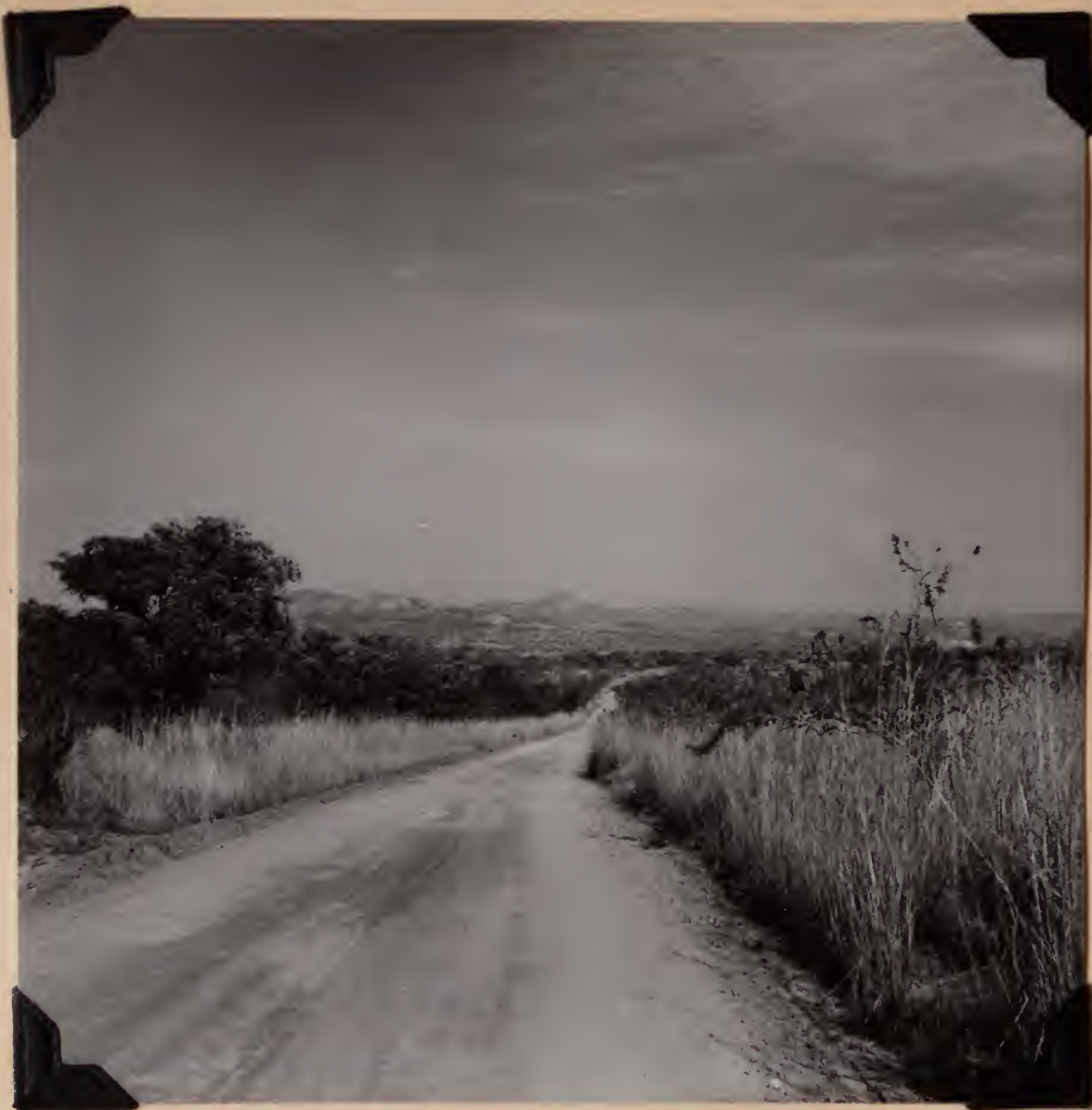
6545. Legogotha Peak. July 29, 1957