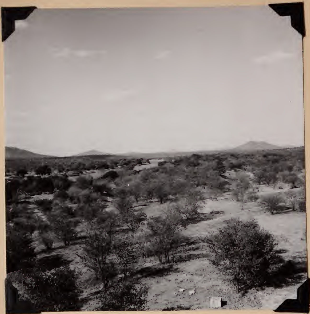
6519. At Beit Bridge, Transvaal. July 24, 1957