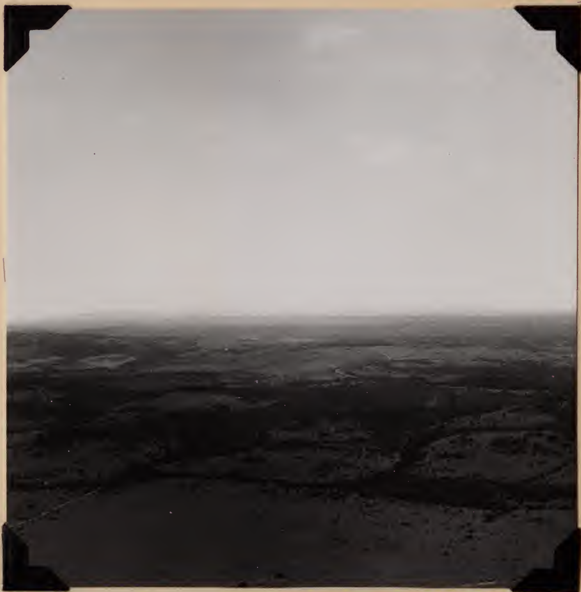
6548. View of eastern Natal from plane. Drakensberg Mountains in distance. August 3, 1957