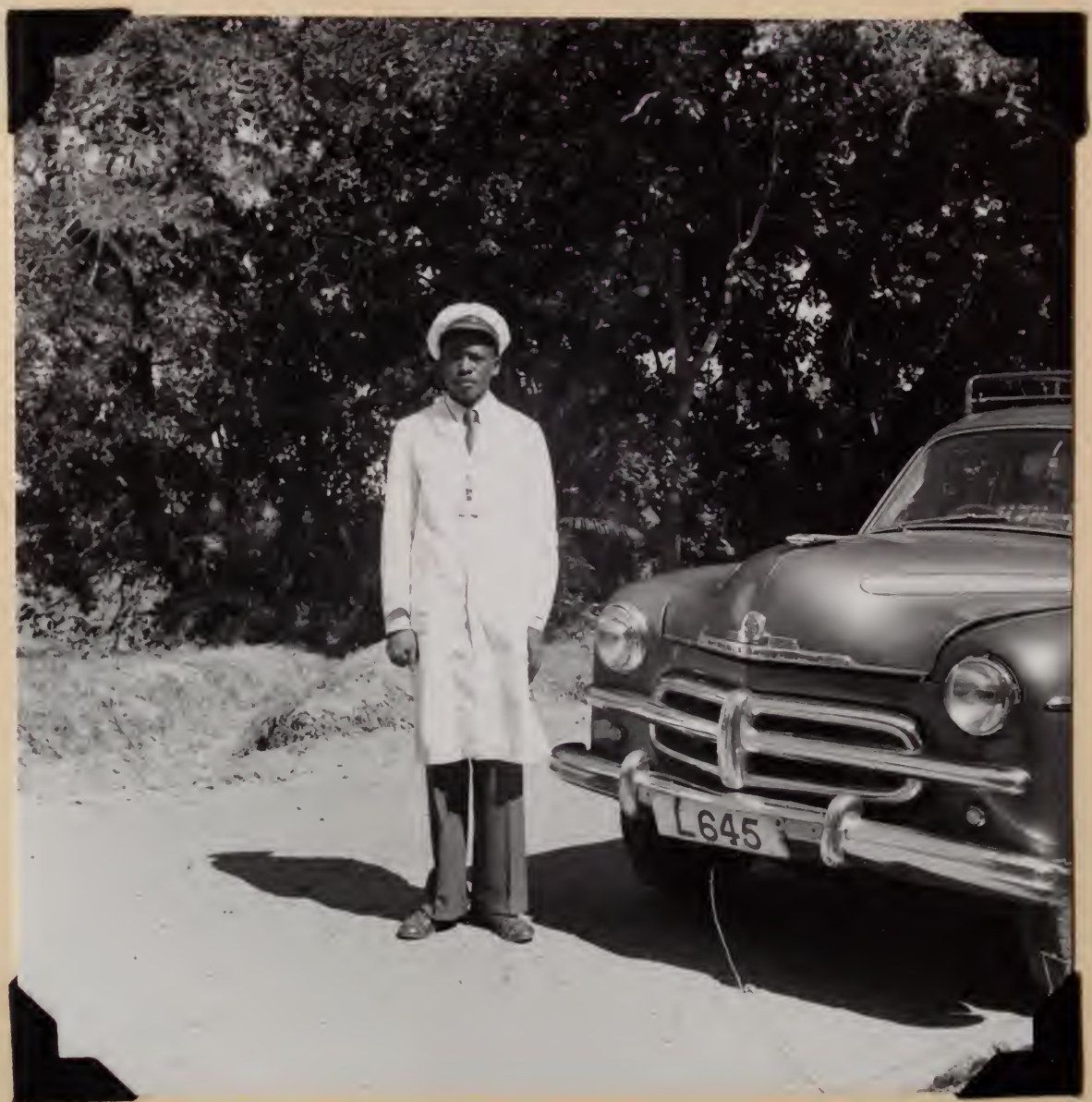
6510. My driver and car for a day along the Zambesi River. July 21, 1957