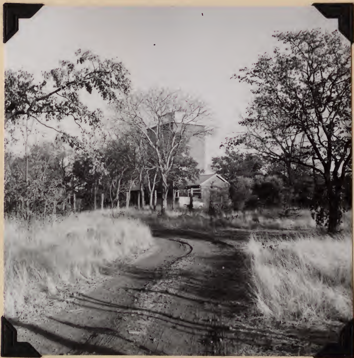
6484. The old Robins Observatory, Wankie Game Reserve, Southern Rhodesia. July 14, 1957