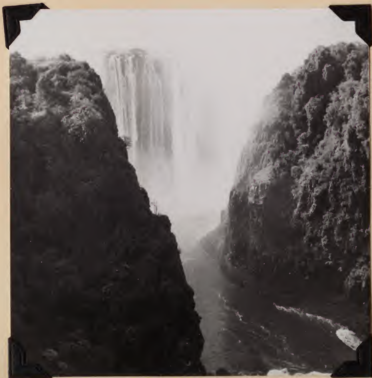
6488. Victoria Falls. July 16, 1957