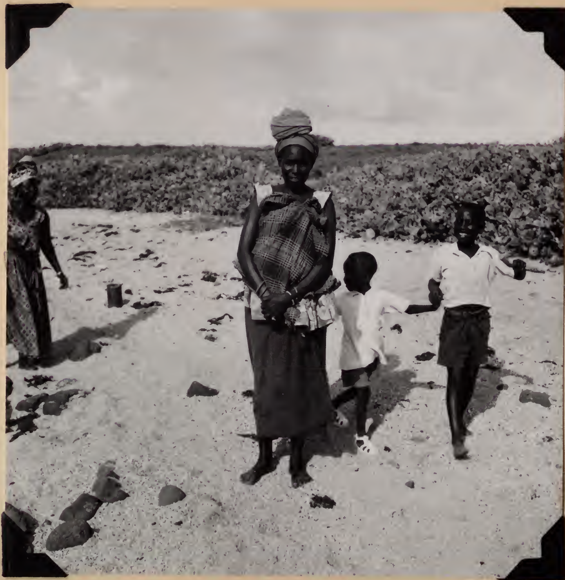
6566. Native woman at Dakar, Senegal. August 9, 1957