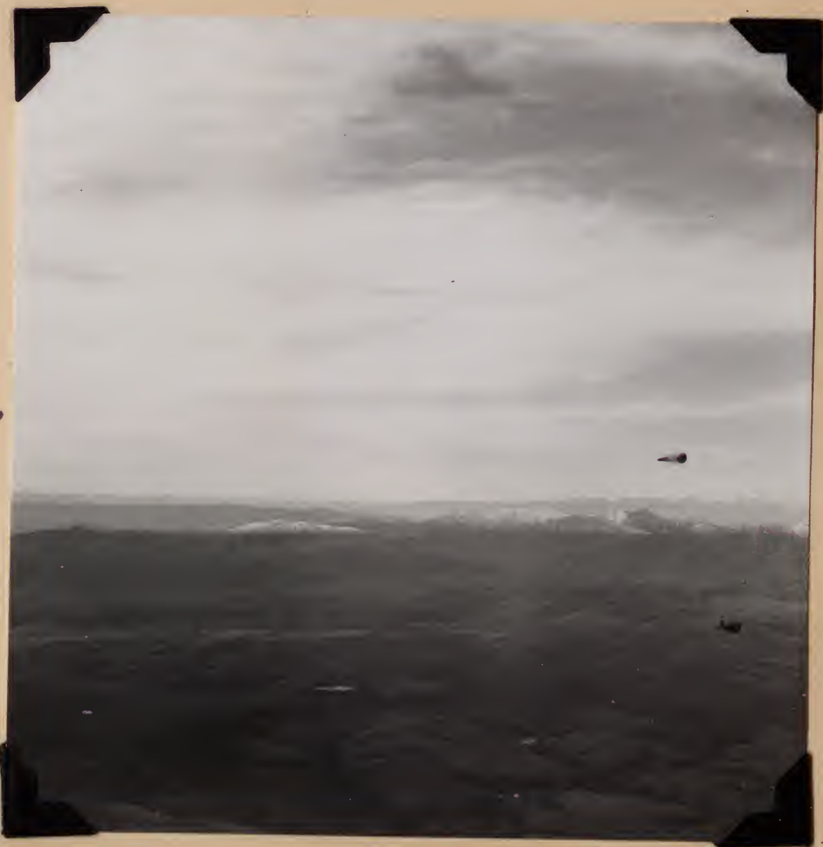
6552. Snow on mountains in eastern Cape Province, from plane. August 3, 1957