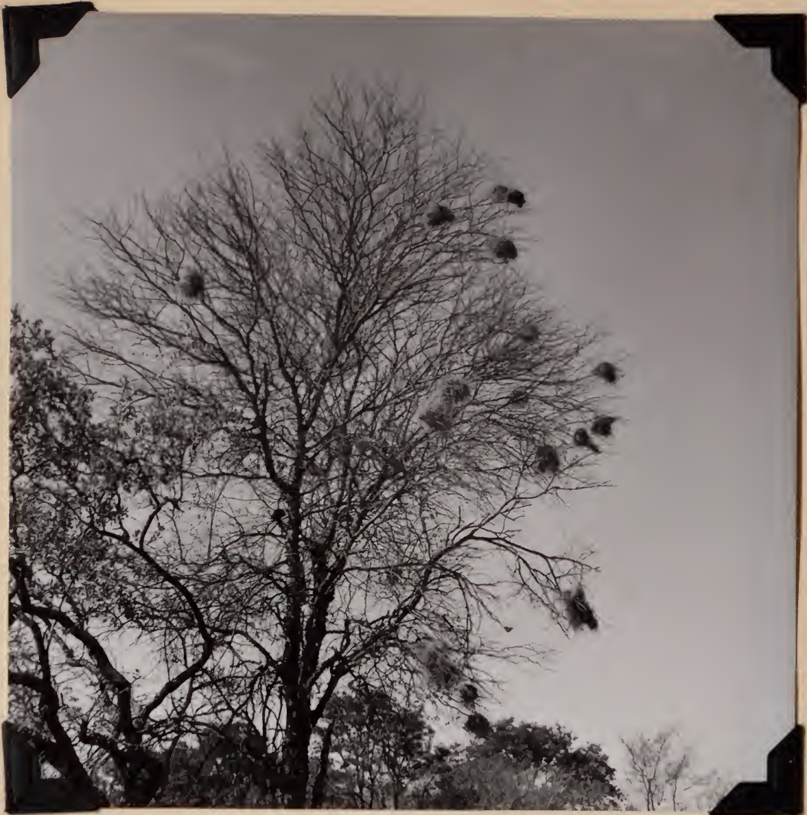
6509. Nests of the Sparrow-weaver Plocepasser mahali . near Livingstone, Northern Rhodesia. July 21, 1957.