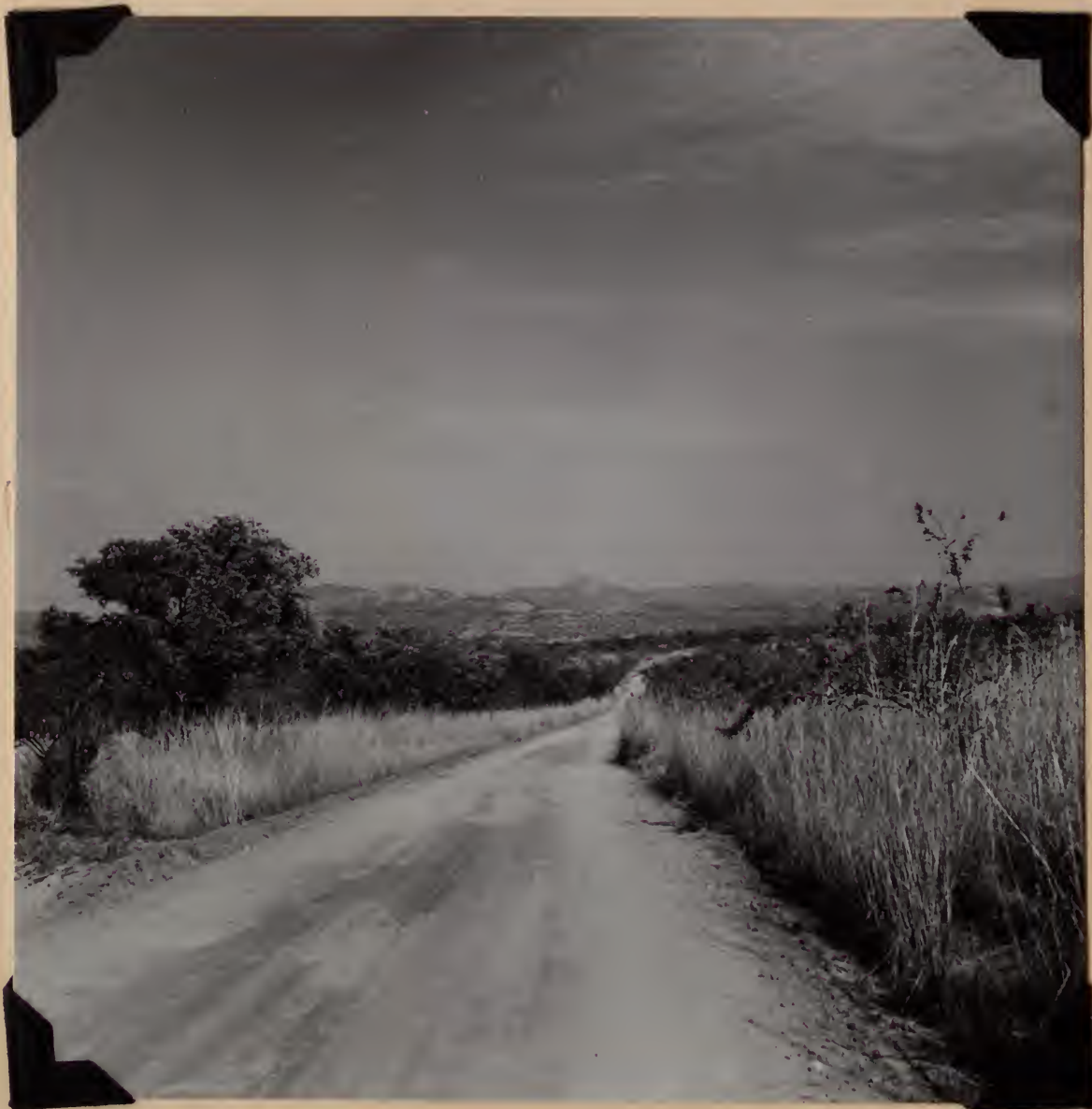
6544. View toward Legogotha Peak, near Numbi Gate. July 29, 1957