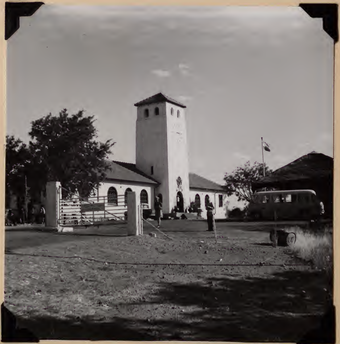
6516. Immigration and customs station for the Union of South Africa at Beit Bridge, Transvaal. July 24, 1957