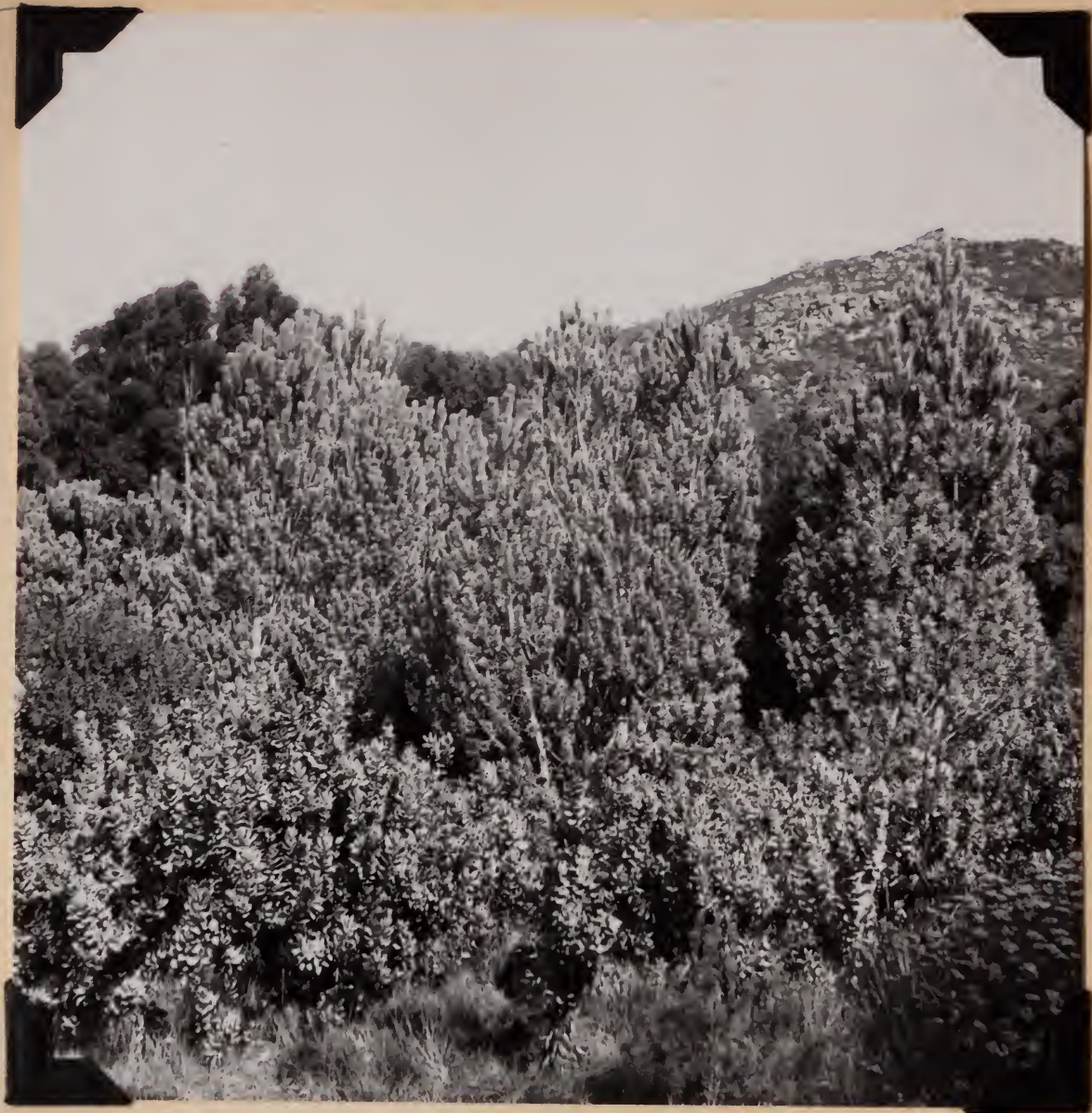
6555. Silver tree ( Leucodendron argenteum ) in Botanic garden at Kirstenbosch, Cape Province. August 5, 1957