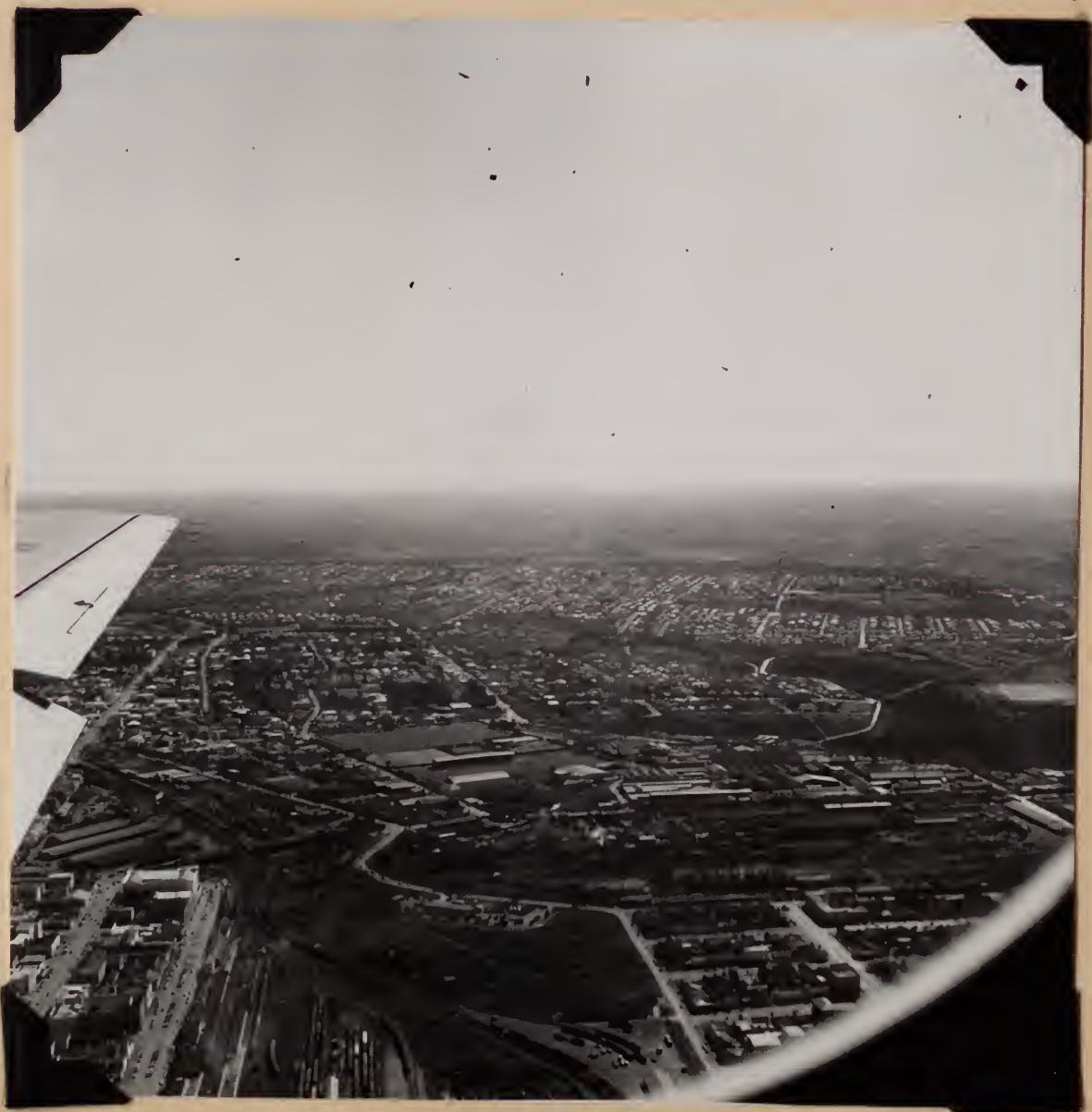
6550. East London, Cape Province, from plane. August 3, 1957