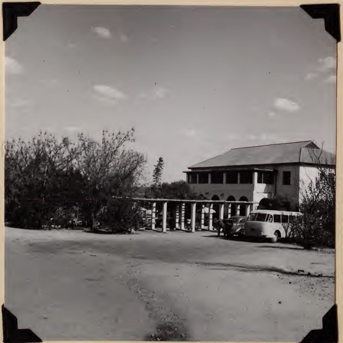
6512. At Gwanda, Southern Rhodesia. July 24, 1957.