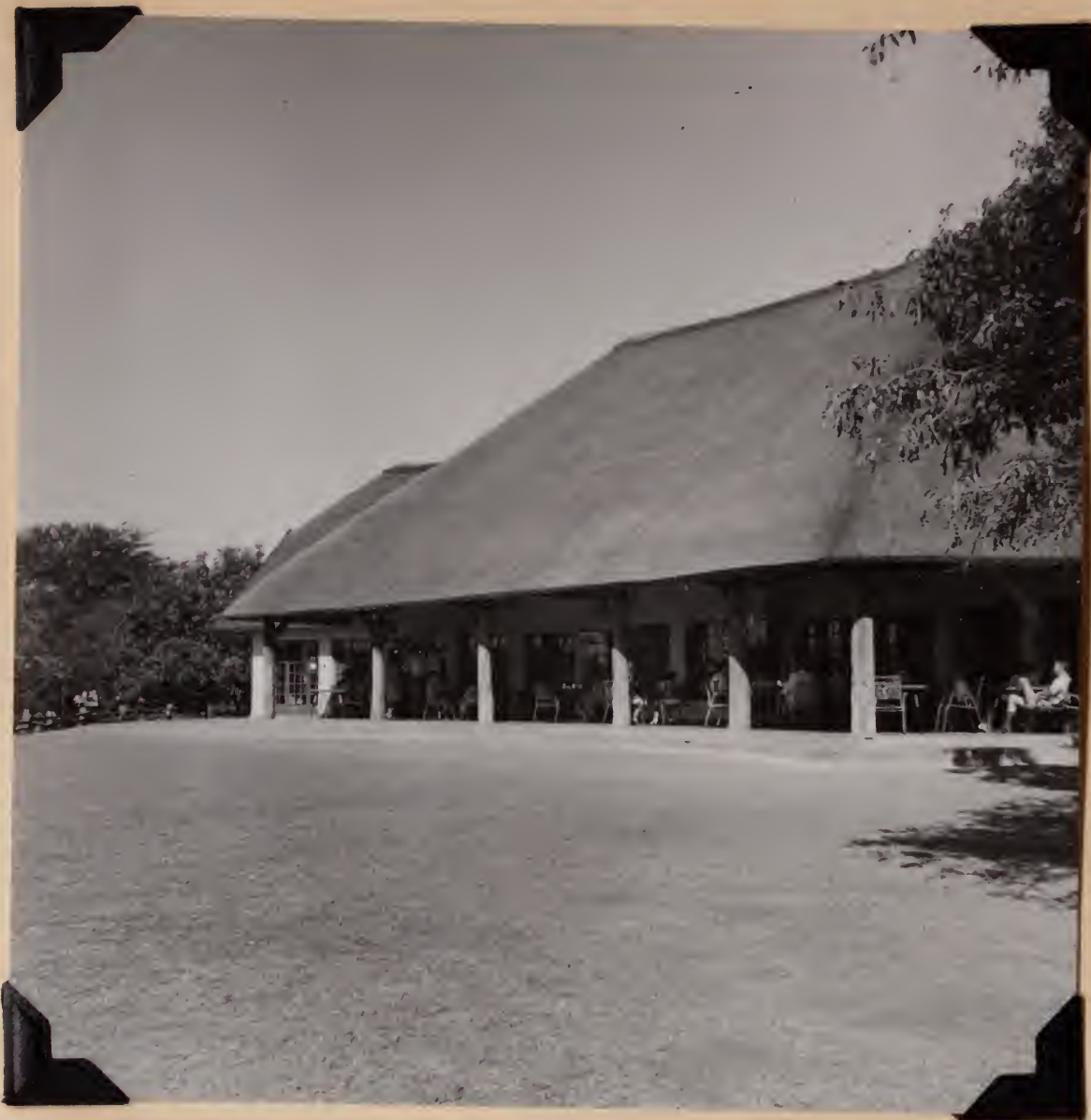
6531. Main building at Skukuza Rest camp, Kruger National Park, Transvaal. July 28, 1957