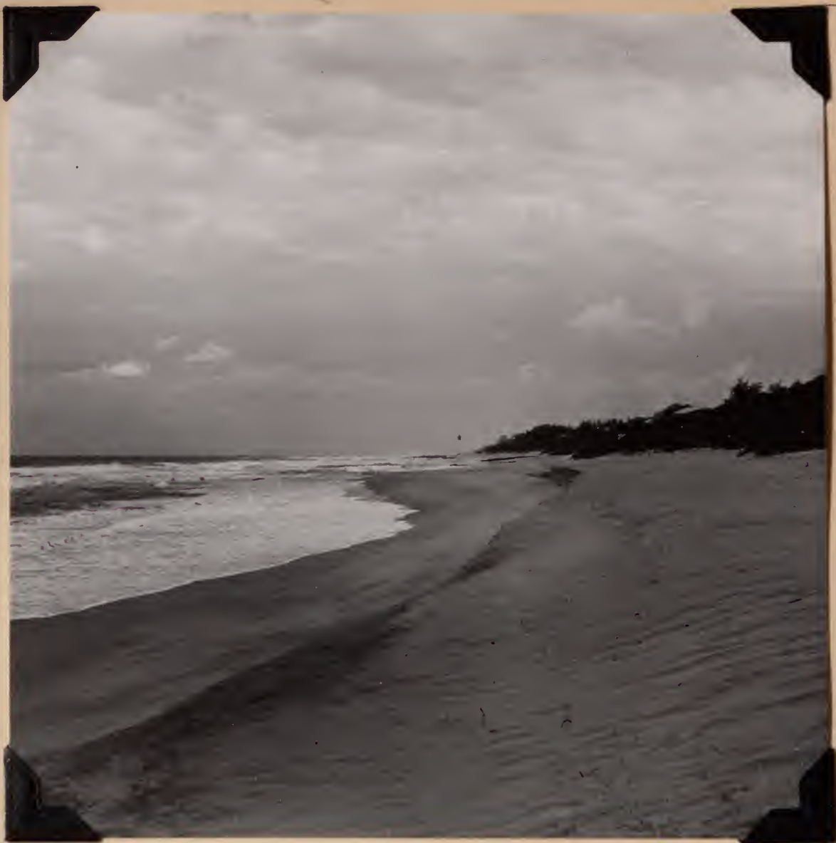
6547. Beach at Umhlanga Rocks, Durban, Natal. August 2, 1957