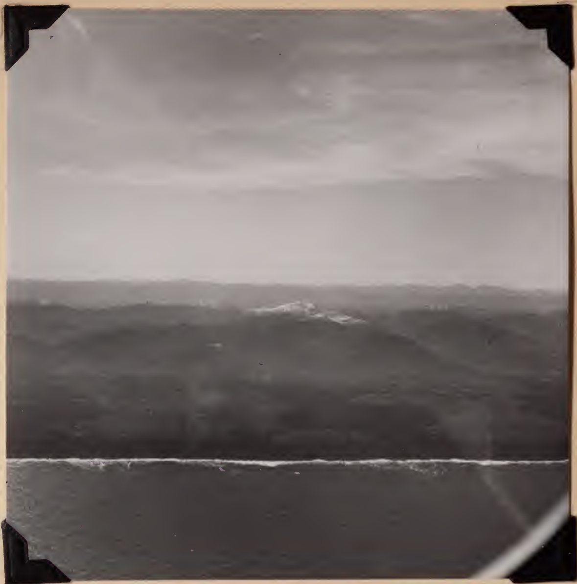
6551. Snow on mountains in Cape Province, from plane. August 3, 1957