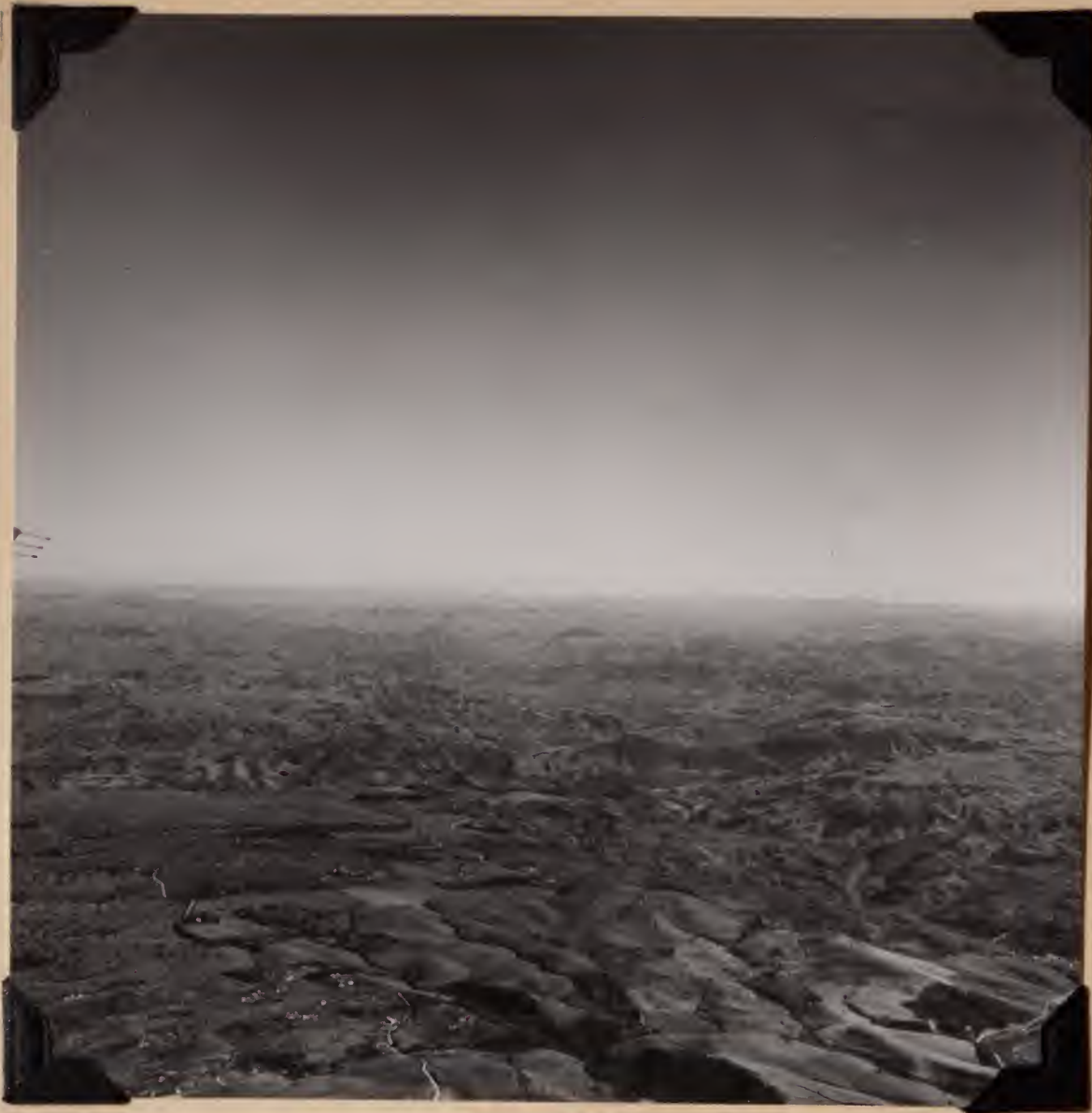
6549. Looking across Southern Natal from plane. August 3, 1957