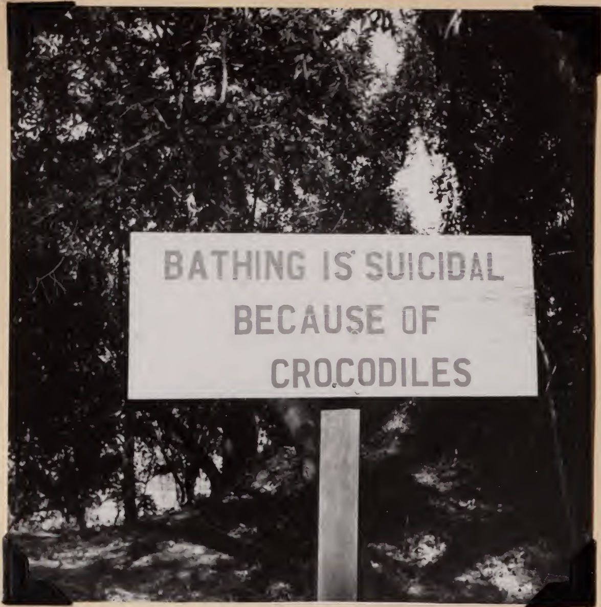
6507. Sign at a sandy beach on the Zambesi River. July 21, 1957.