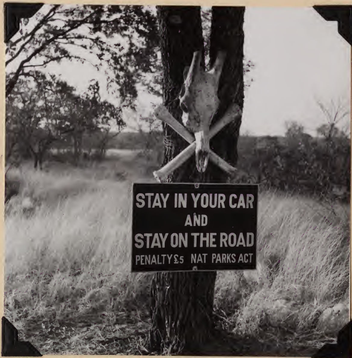
6480. At Robins Camp, Wankie Game Reserve, Southern Rhodesia. July 14, 1957