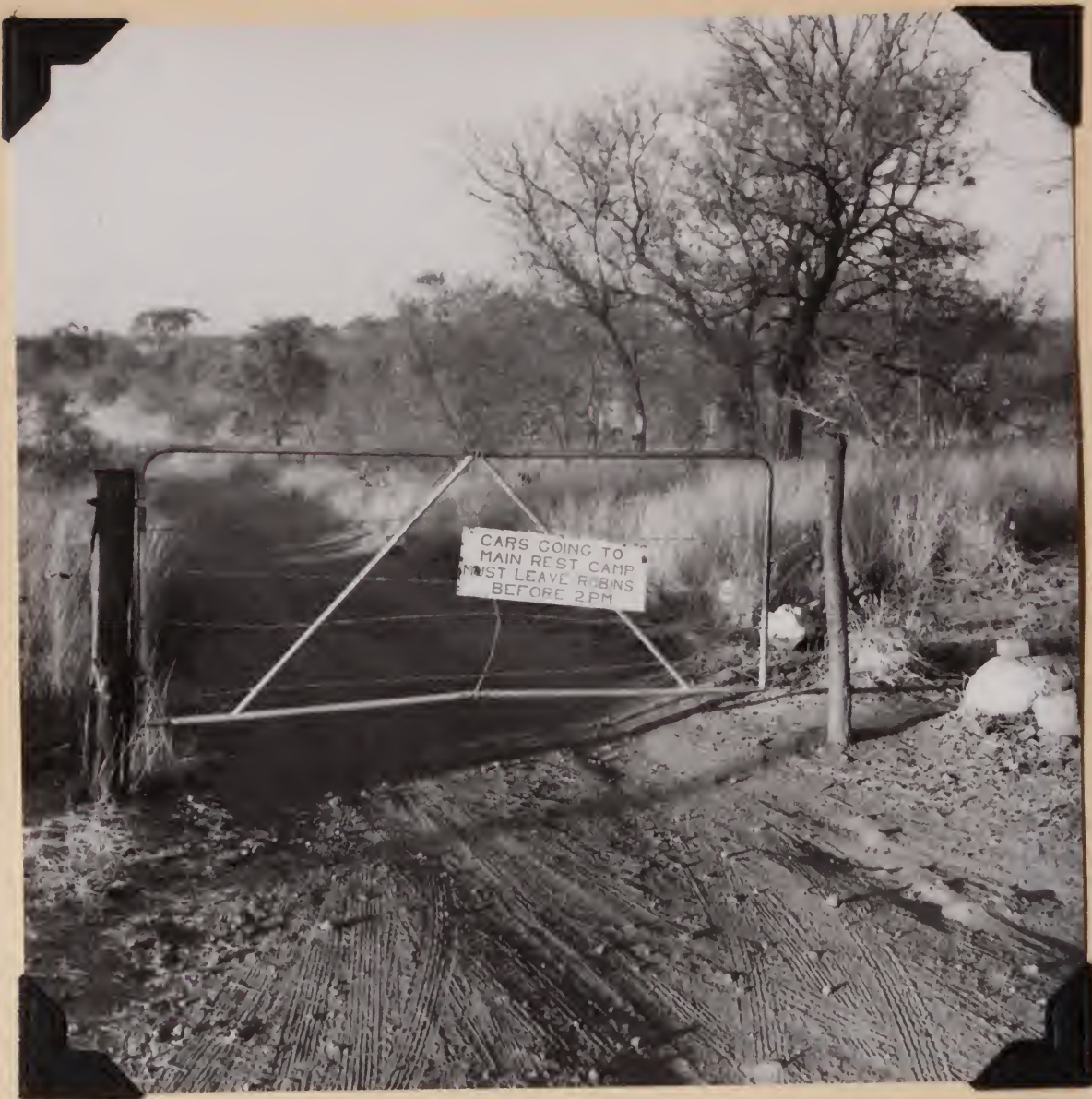
6481. The gate at Robins Camp, Wankie Game Reserve, Southern Rhodesia. July 14, 1957