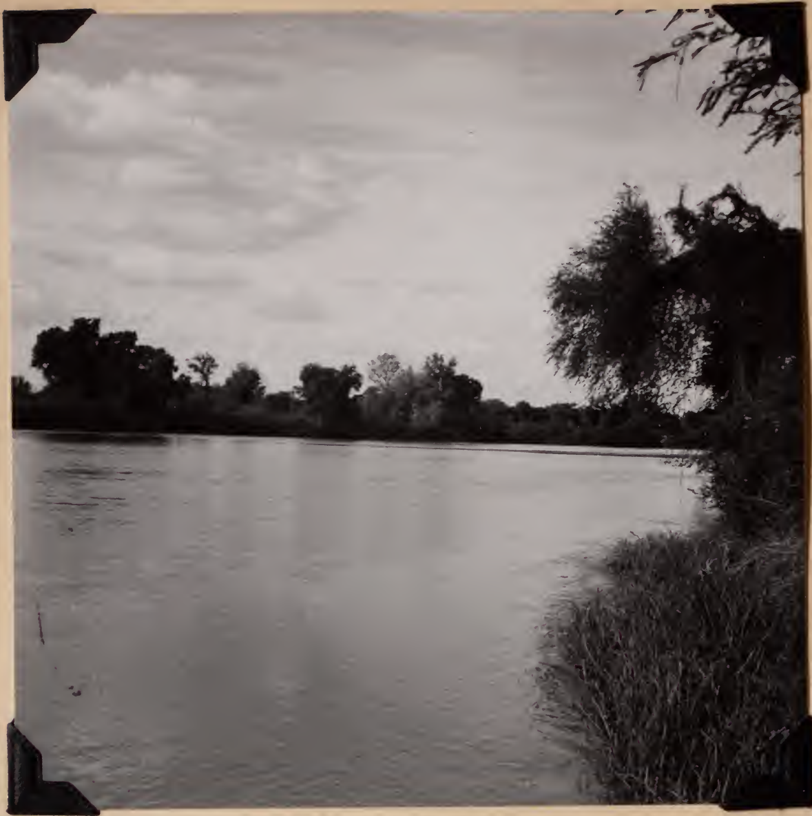
6521. Limpopo River near Parfuie, Kruger National Park, Transvaal, July 25, 1957.

Two Hadeda Ibis feed- ing on bar in midstream.