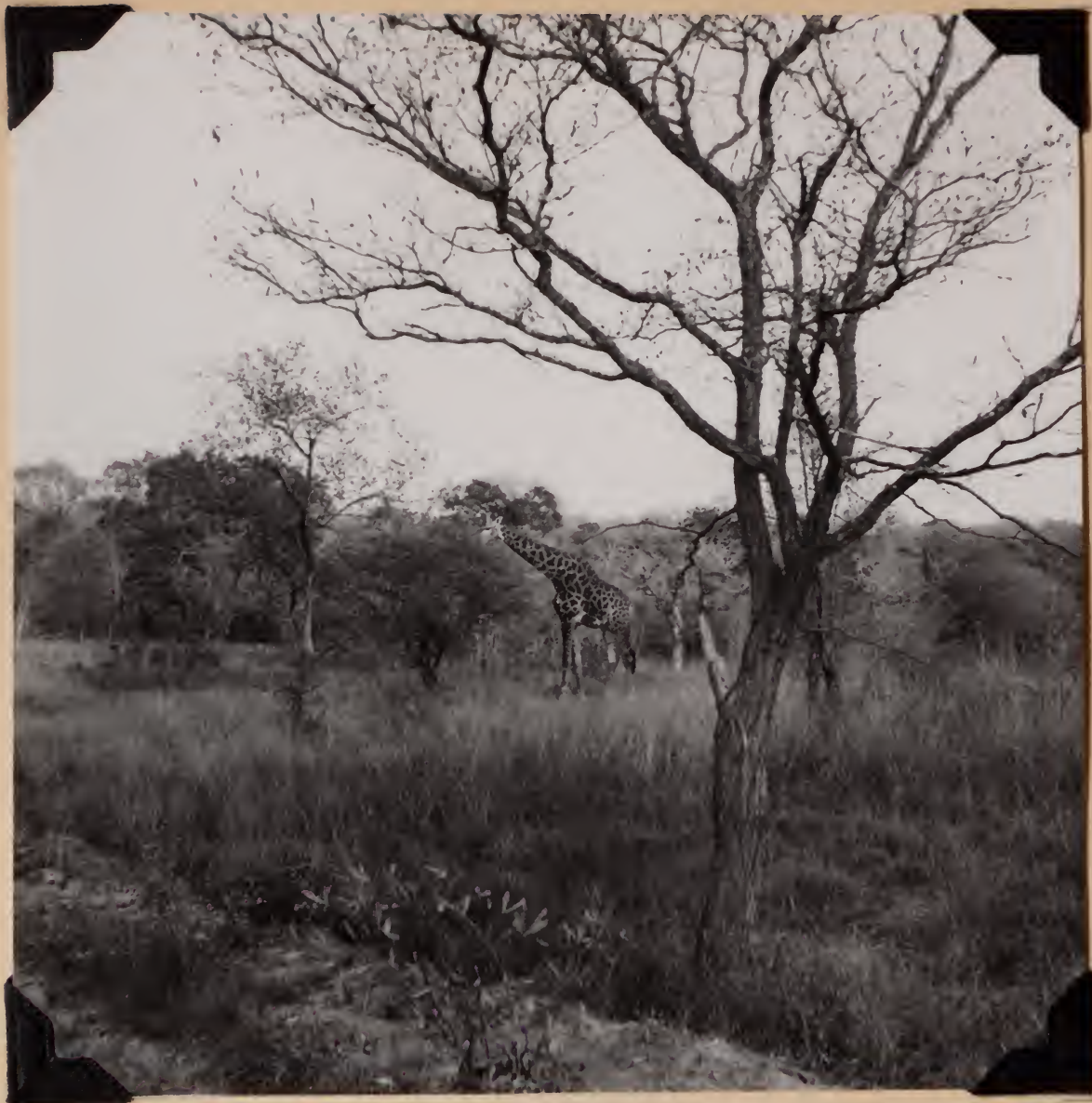
6535. Giraffe, Kruger Park, Transvaal. July 29, 1957