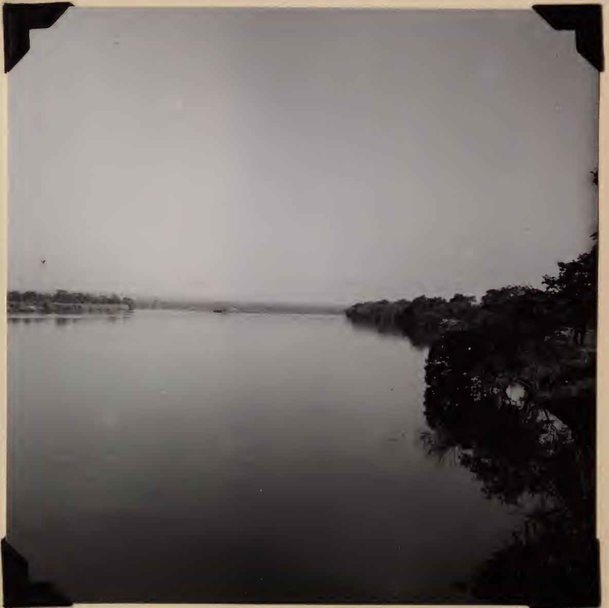
6506. Zambesi River above Victoria Falls. July 21, 1957.