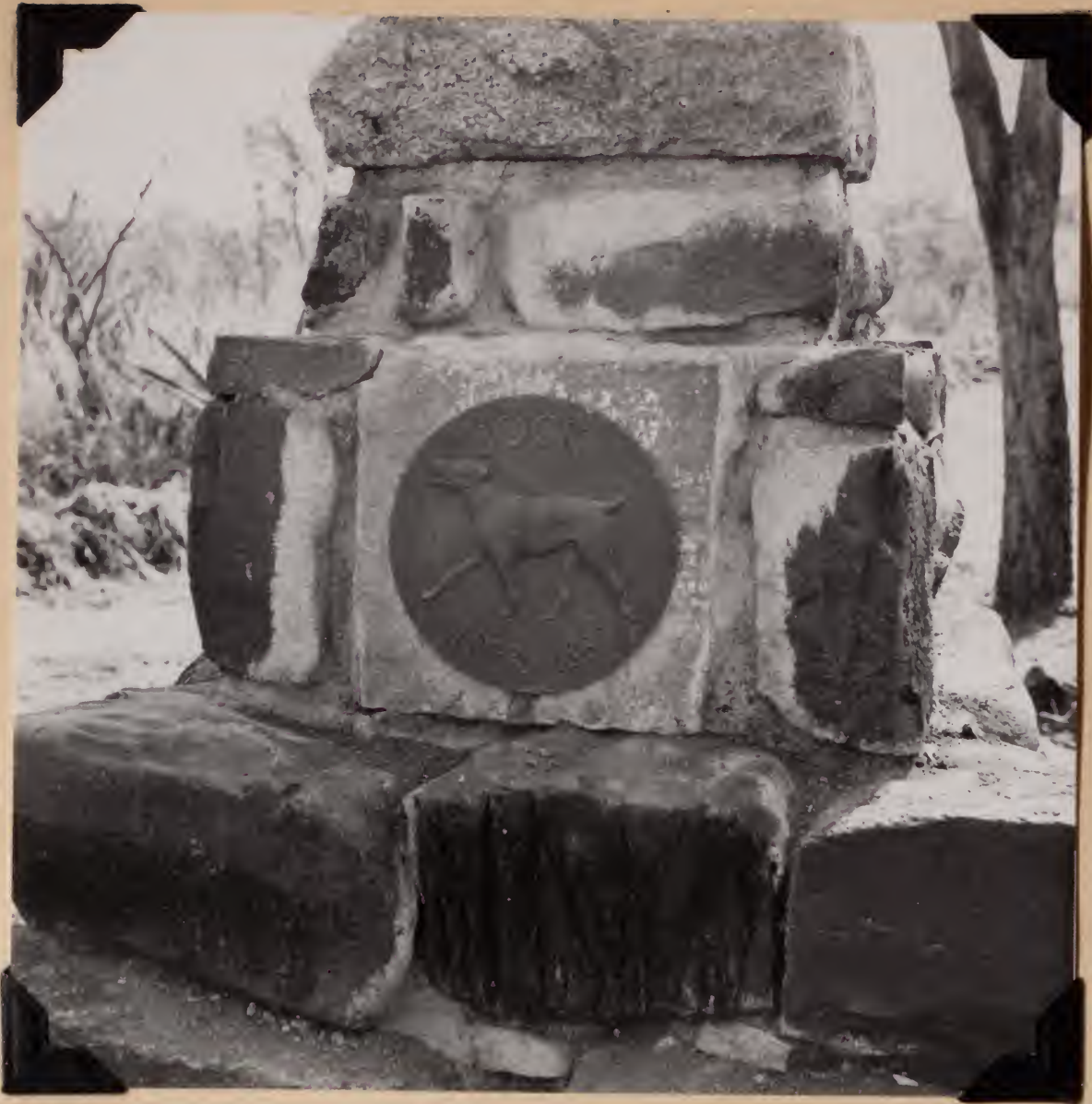
6541. Monument to the dog Jock, hero of the book, "Jock of the Bushveld," outside Numbi Gate, Kruger National Park, Trans- vaal. July 29, 1957