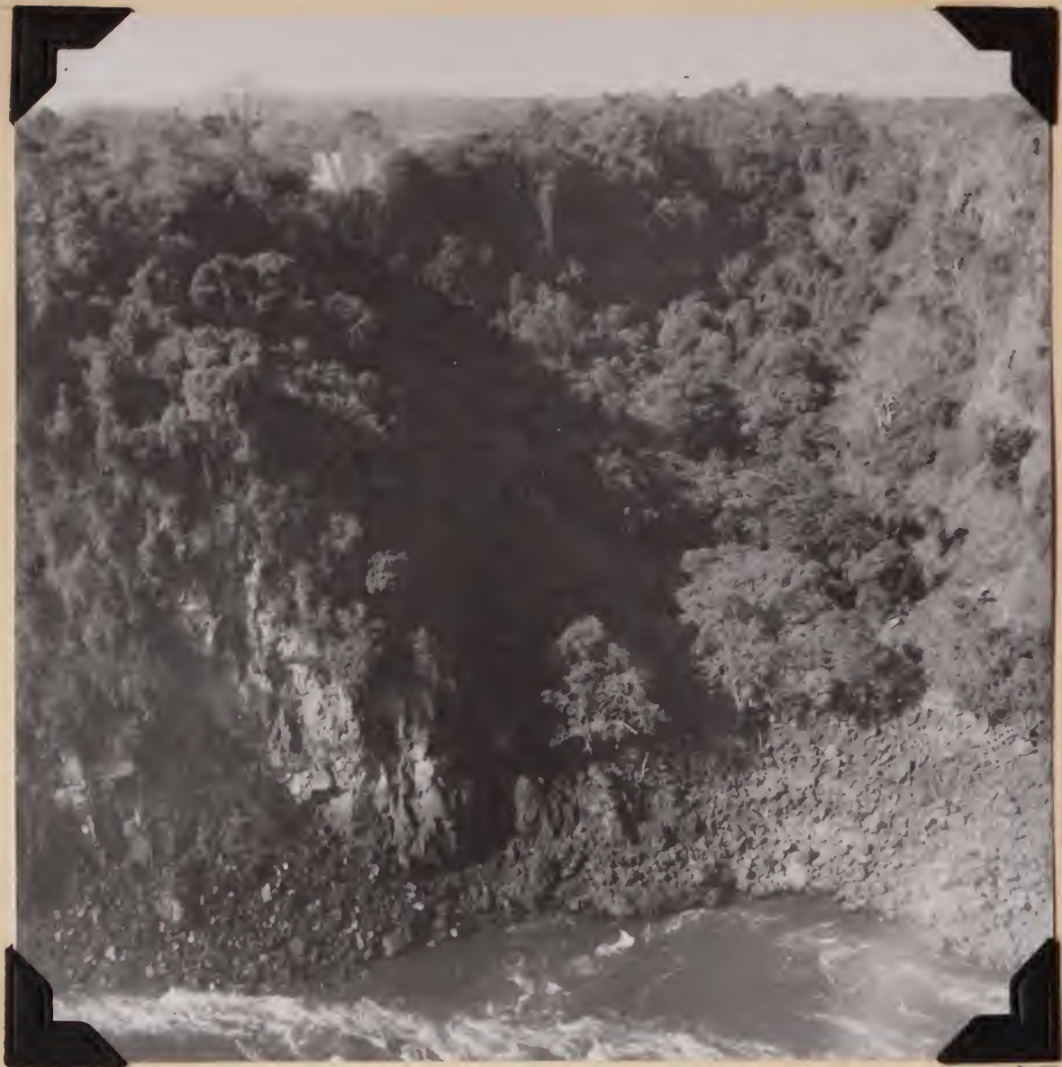
6489. Wooded slope of gorge at Victoria Falls. July 16, 1957