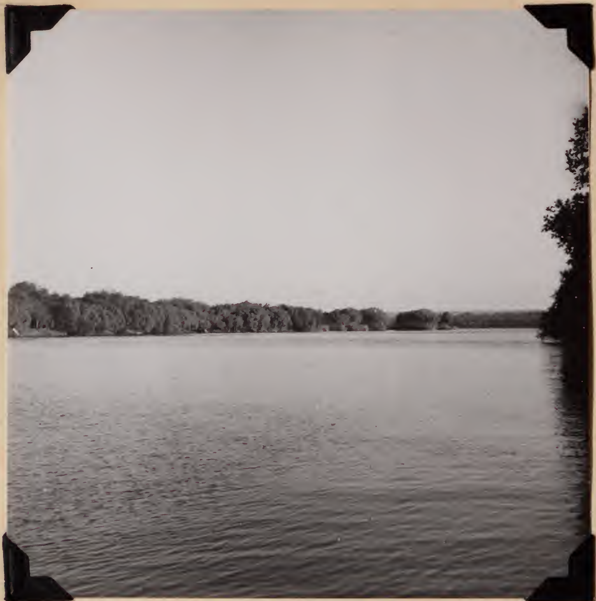
6499. Zambesi River above Victoria Falls. July 17, 1957