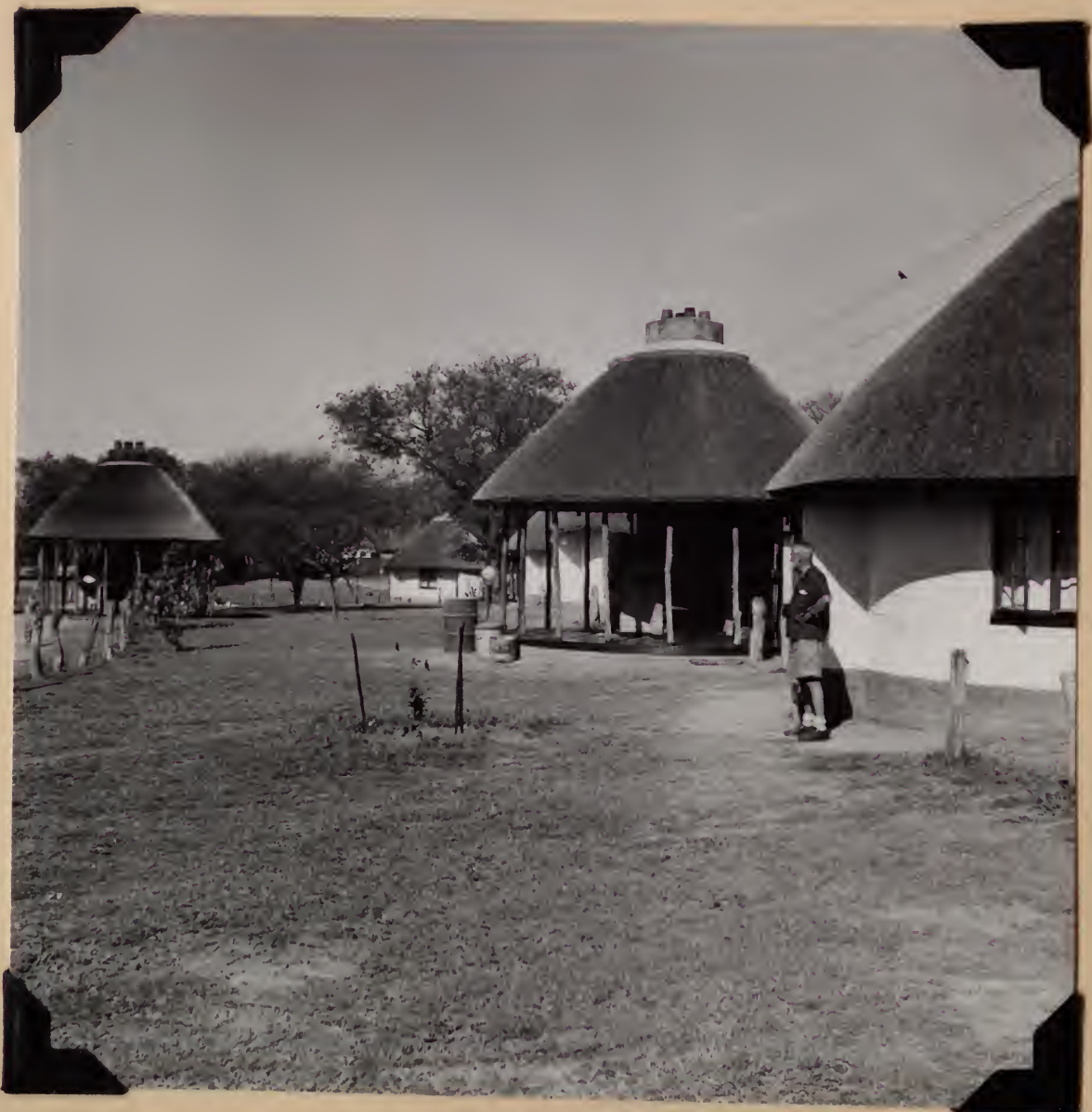
6530. Edwin Cohen and our quarters at Skukuza Rest camp, Kruger National Park, Transvaal. July 28, 1957