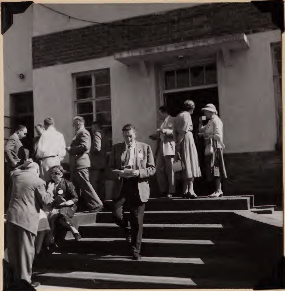
6495. Entrance of Victoria Hall, Living- stone, Northern Rhodesia July 17, 1957