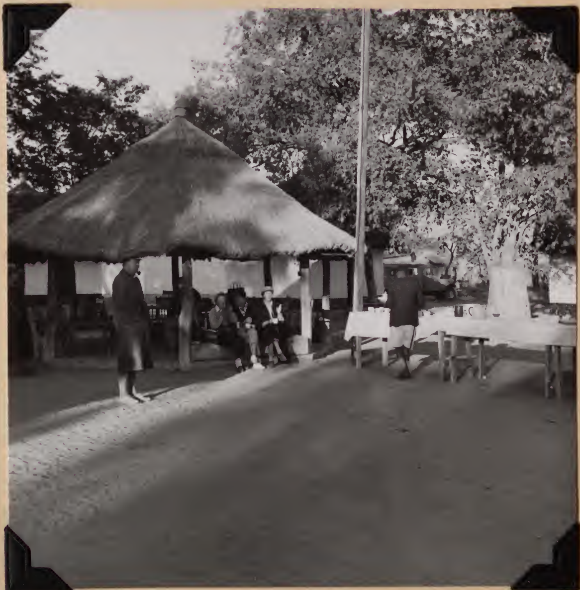
6470. Main Camp, Wankie Game Reserve, Southern Rhodesia. July 12, 1957