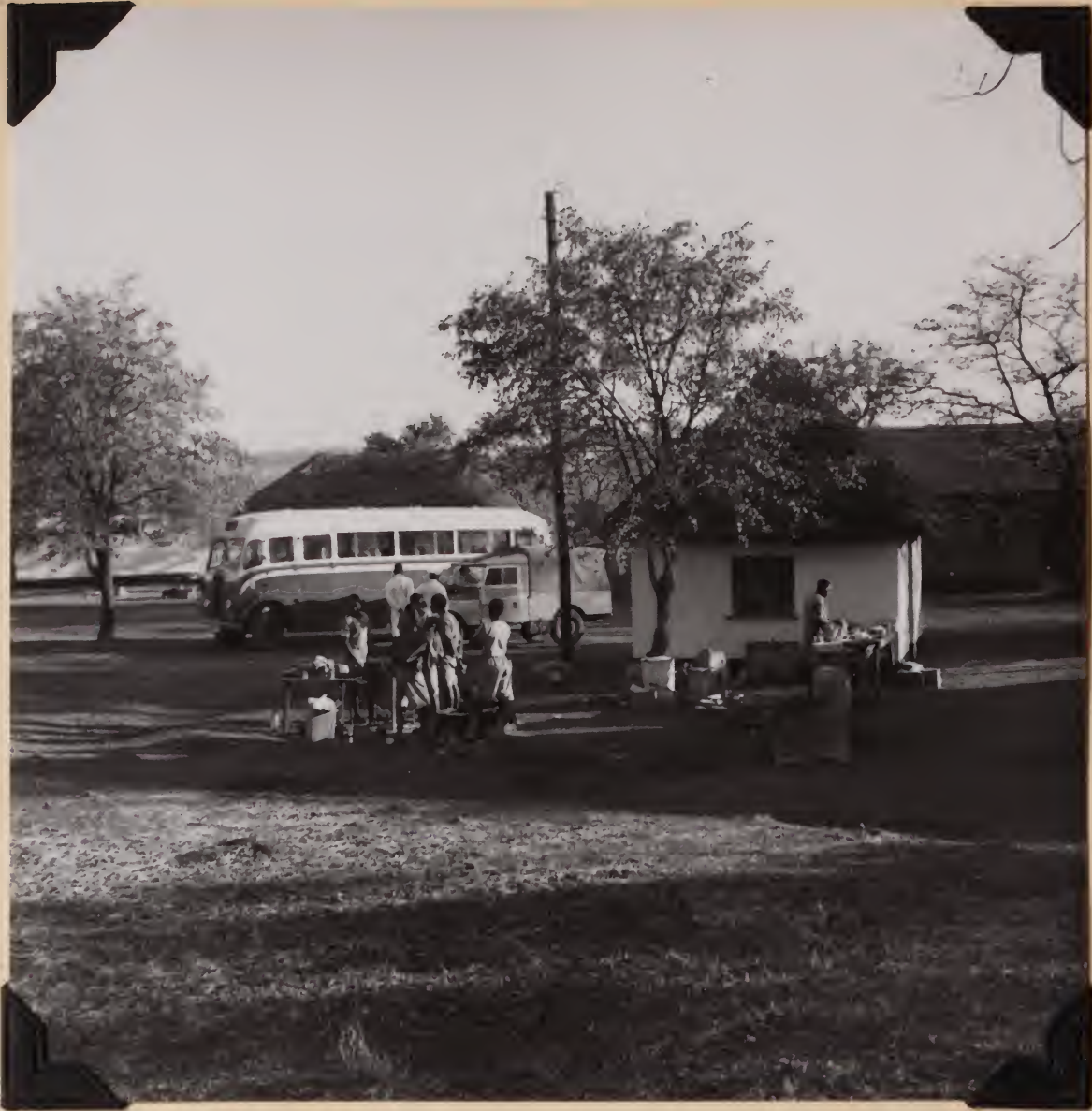
6485. At Robins Camp, Wankie Game Reserve, Southern Rhodesia. July 14, 1957