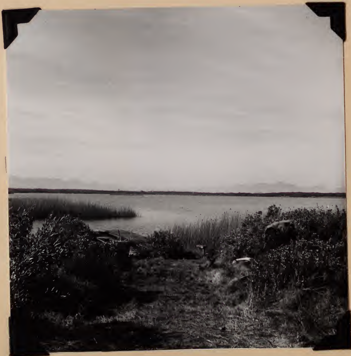
6558. Rondevlei Sanctuary. Hottentot Holland Mountains in background. August 5, 1957