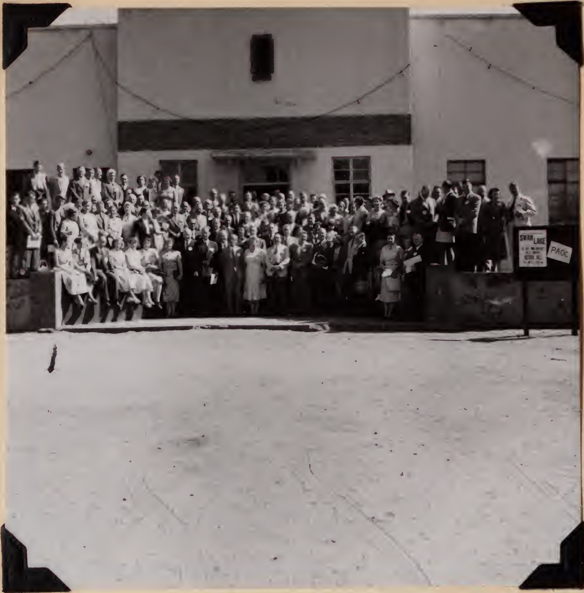
6497. The Pan-African Orni thological Congress, Livingstone, Northern Rhodesia. July 17, 1957