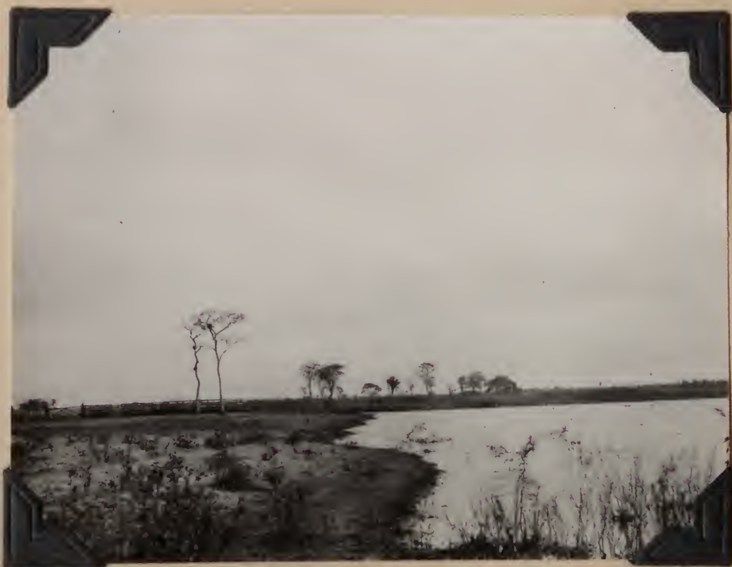
B.S. 22058. Flooded border of Río Paraguay. Puerto Pinasco, Paraguay. September 3, 1920.