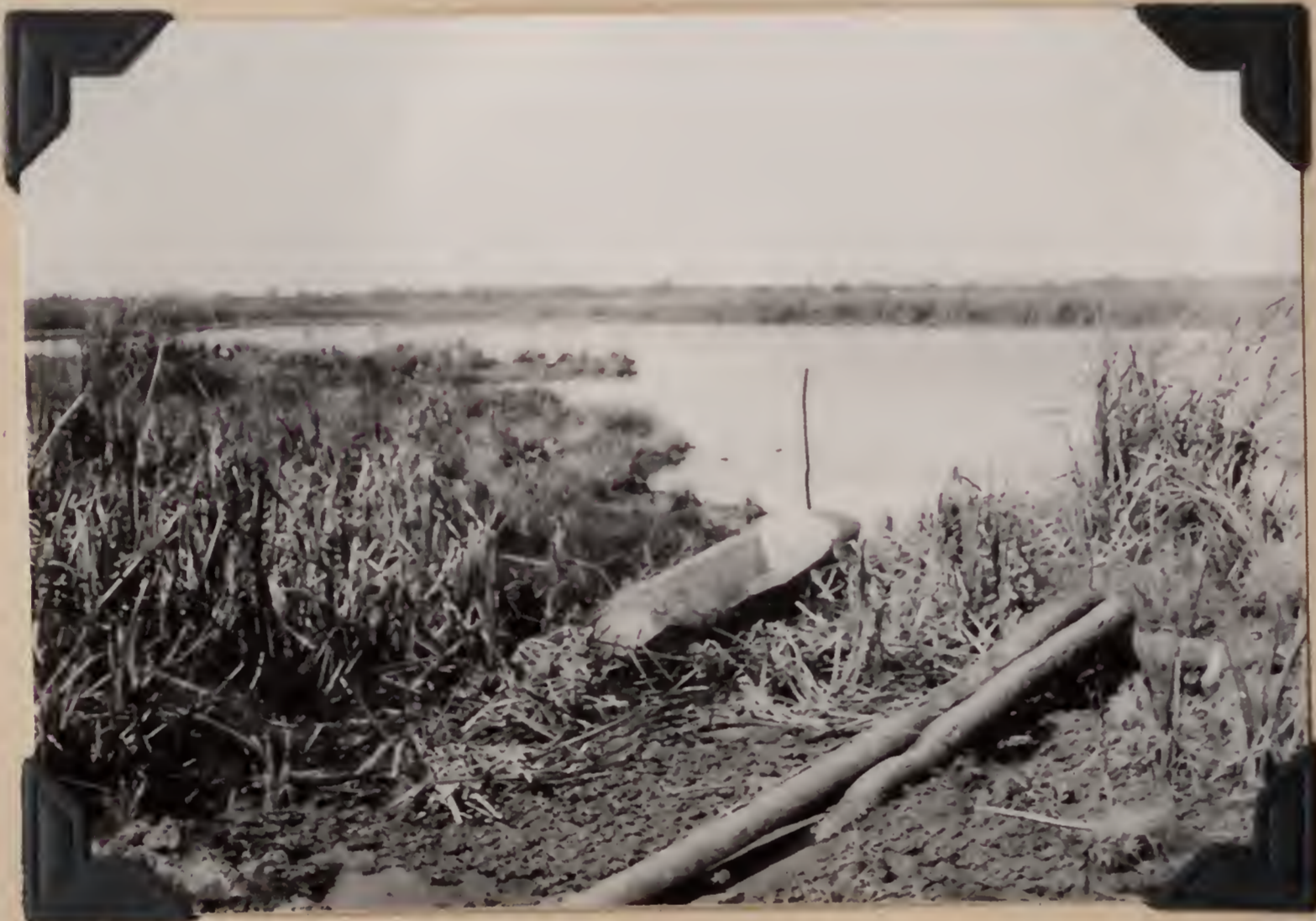
B.S. 22031. Crude boat called cachiveo at border of lagoon. Riacho Pilaga, Formosa, Argentina. August 17, 1920.