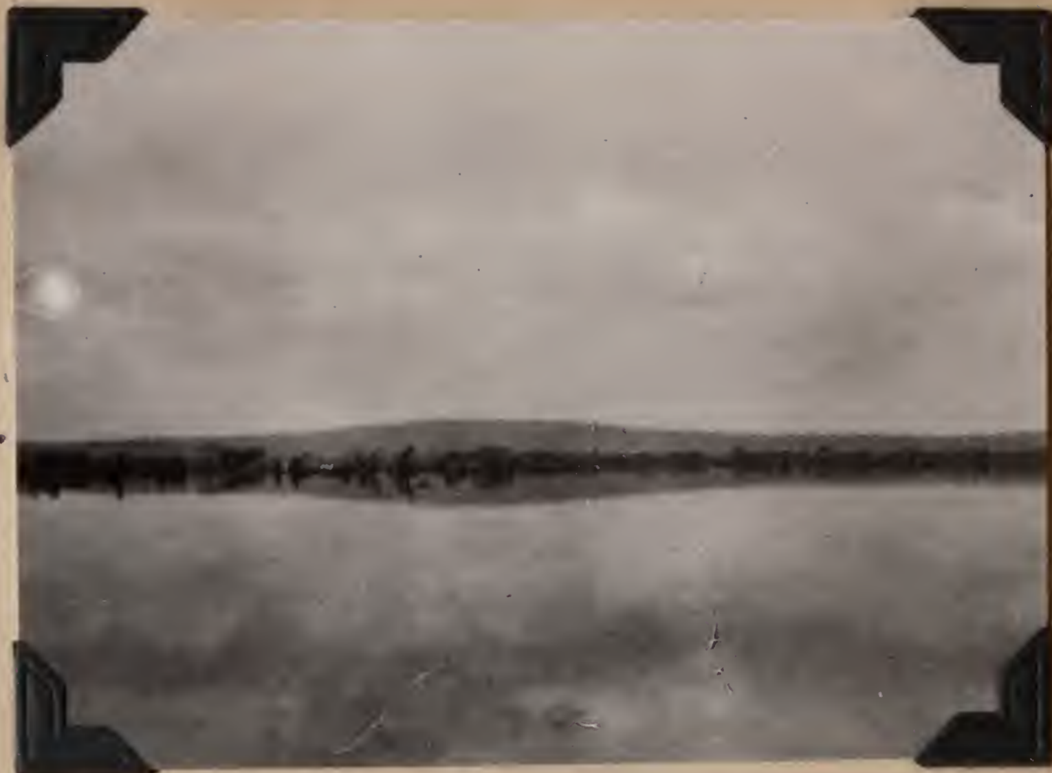
B.S. 22059. Cerro Lorito on eastern bank of Río Paraguay opposite Puerto Pinasco, Paraguay. September 3, 1920.