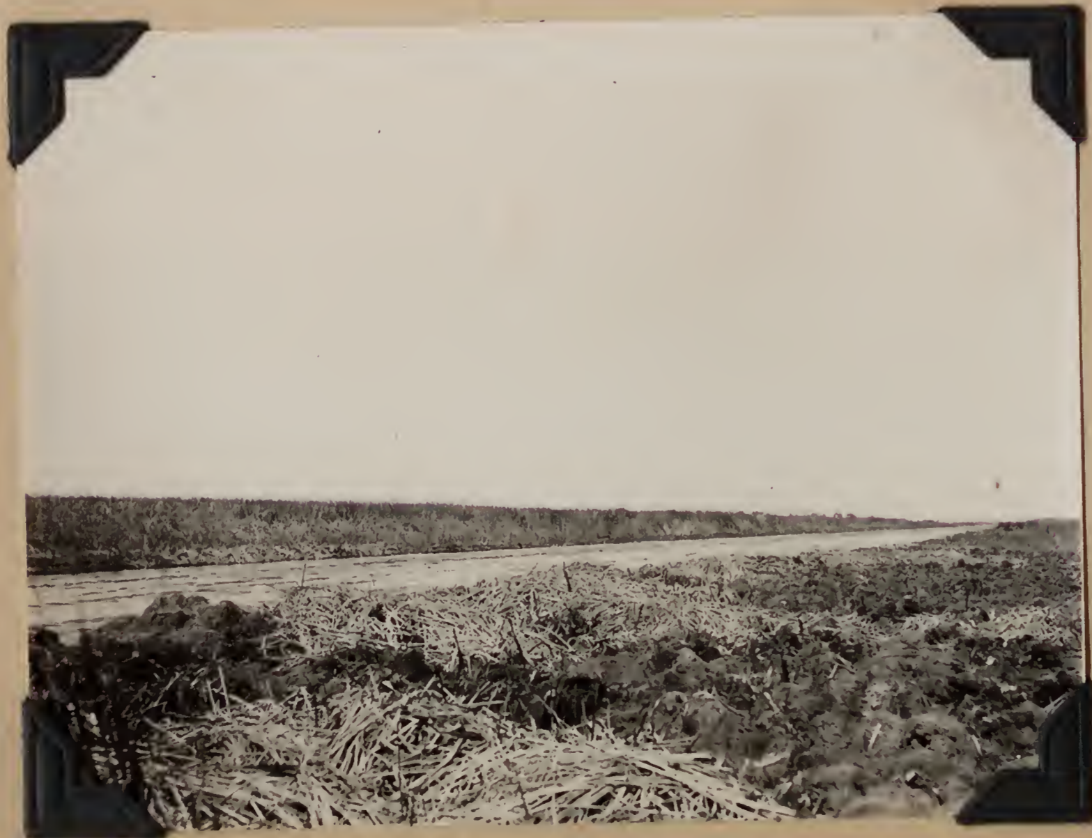
B.S. 22119. Marsh and canal, haunt of Trudeau's Tern, Sterna trudeaui . Dolores, Buenos Aires, Argentina. October 21, 1920.