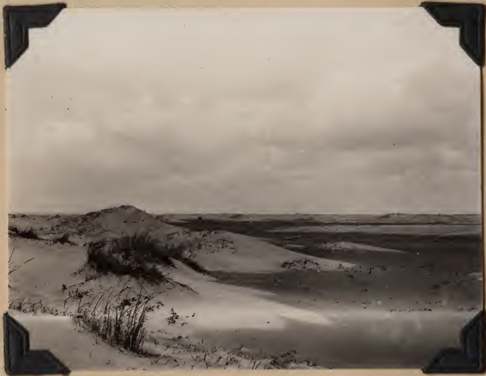
B.S. 22155. Sand dunes 15 miles south of Cabo San Antonio. Lavalle, Buenos Aires, Argentina. November 7, 1920.