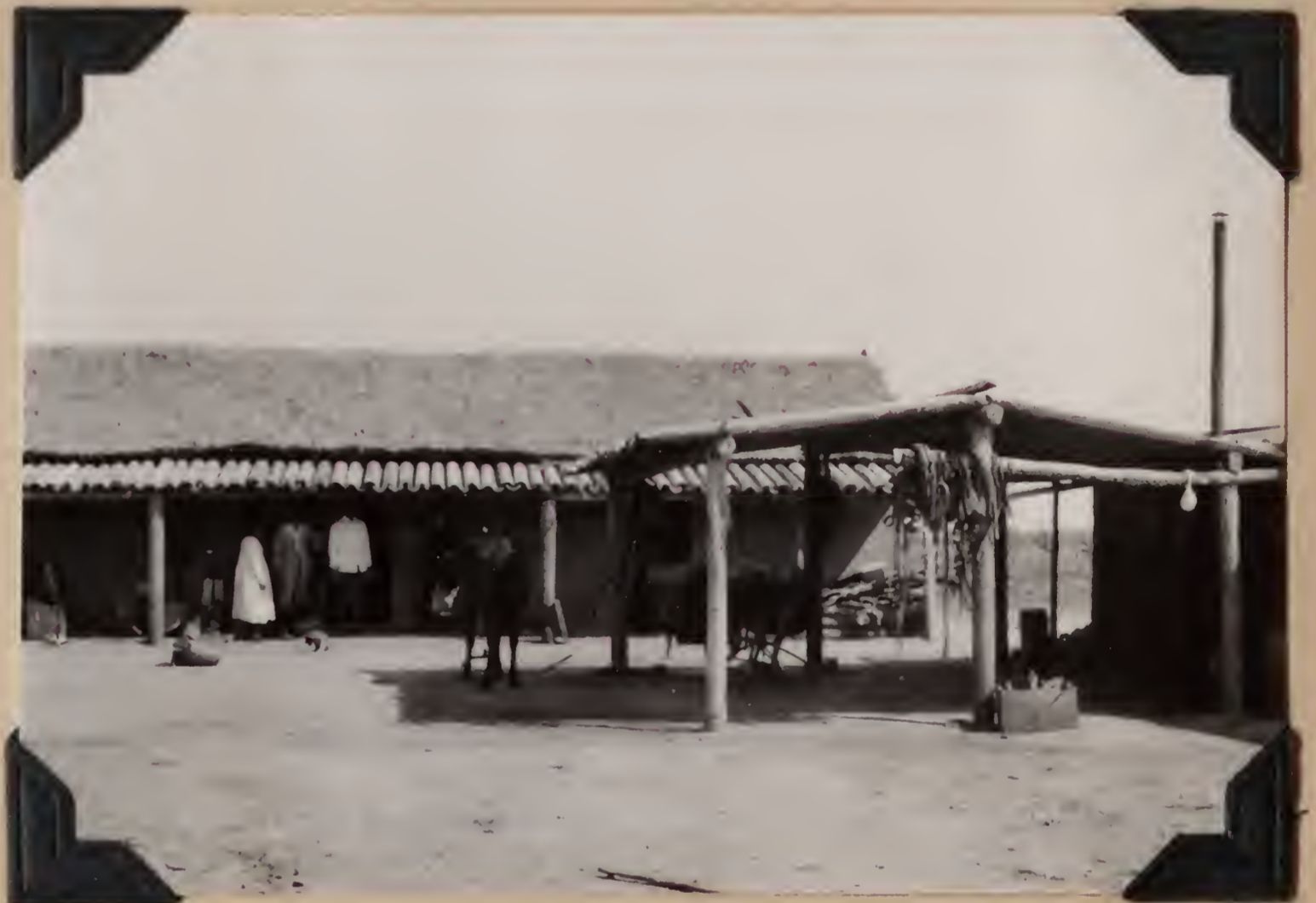
1376. Hacienda Linda Vista, Riacho Pilaga, Formosa, Argentina. August 14, 1920.