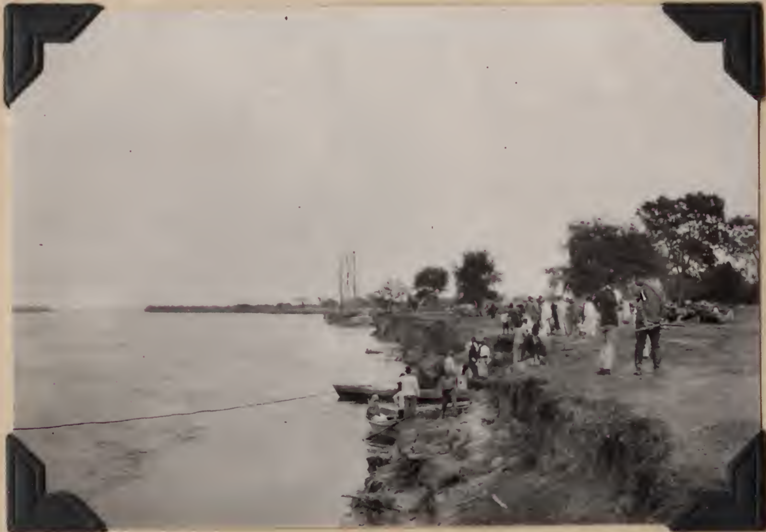
1368. Passengers crossing in small boats from Paraguay at Puerto Las Palmas, Chaco on the Paraná River. August 2, 1920.