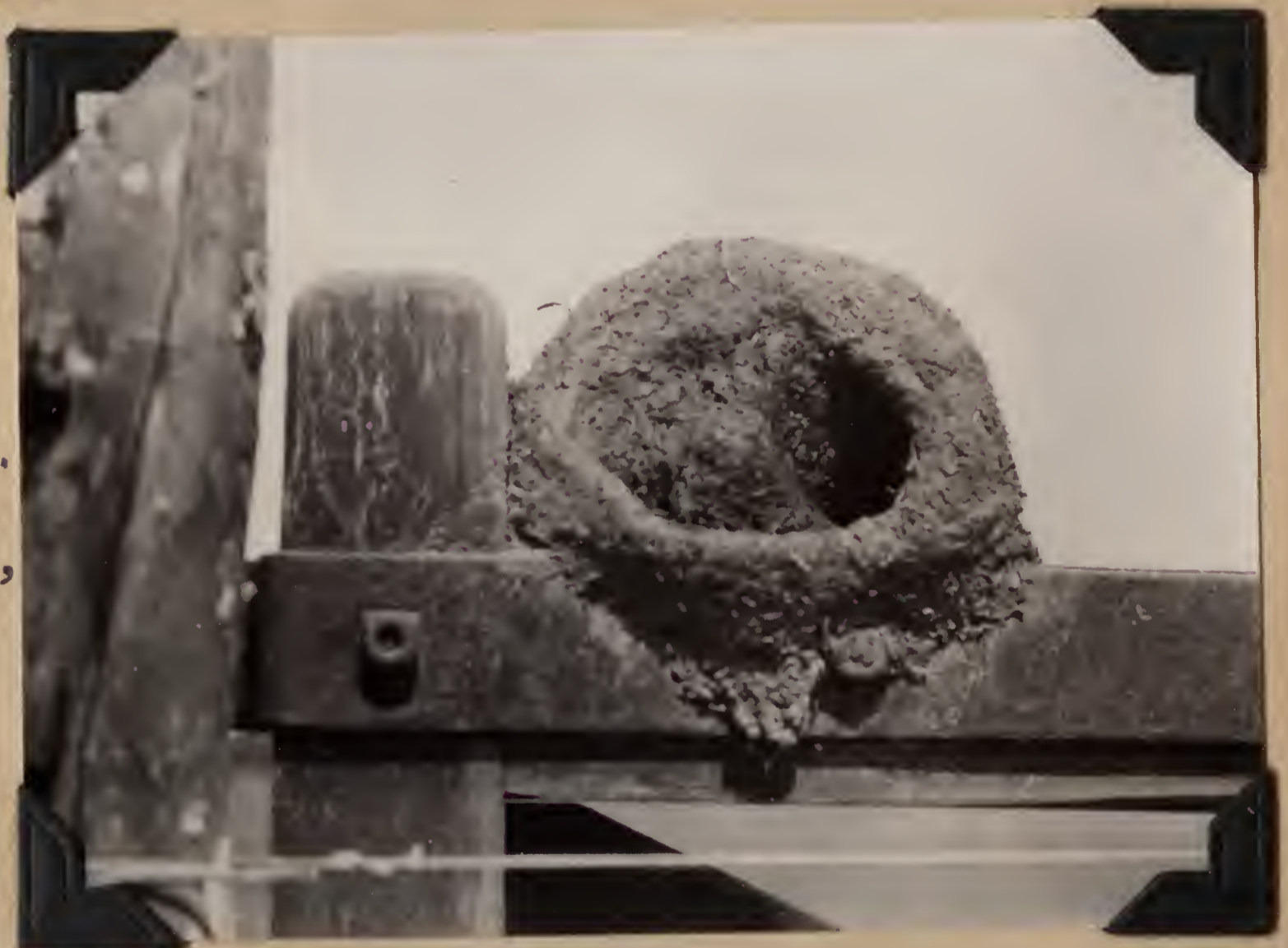
B.S. 22169. Nest of ovenbird or hornero ( Furnarius rufus ) on gate that is used daily. Lavalle, Buenos Aires, Argentina. November 11, 1920.