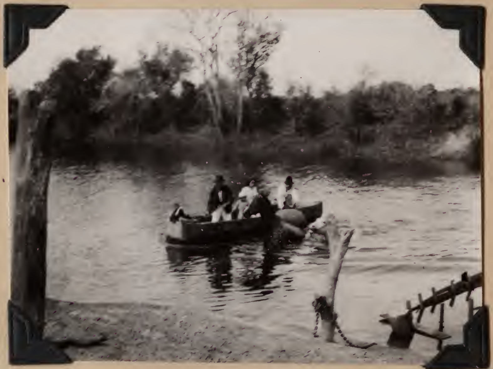
B.S. 21992. Ferry across deep riacho. Las Palmas, Chaco, Argentina. July 30, 1920.