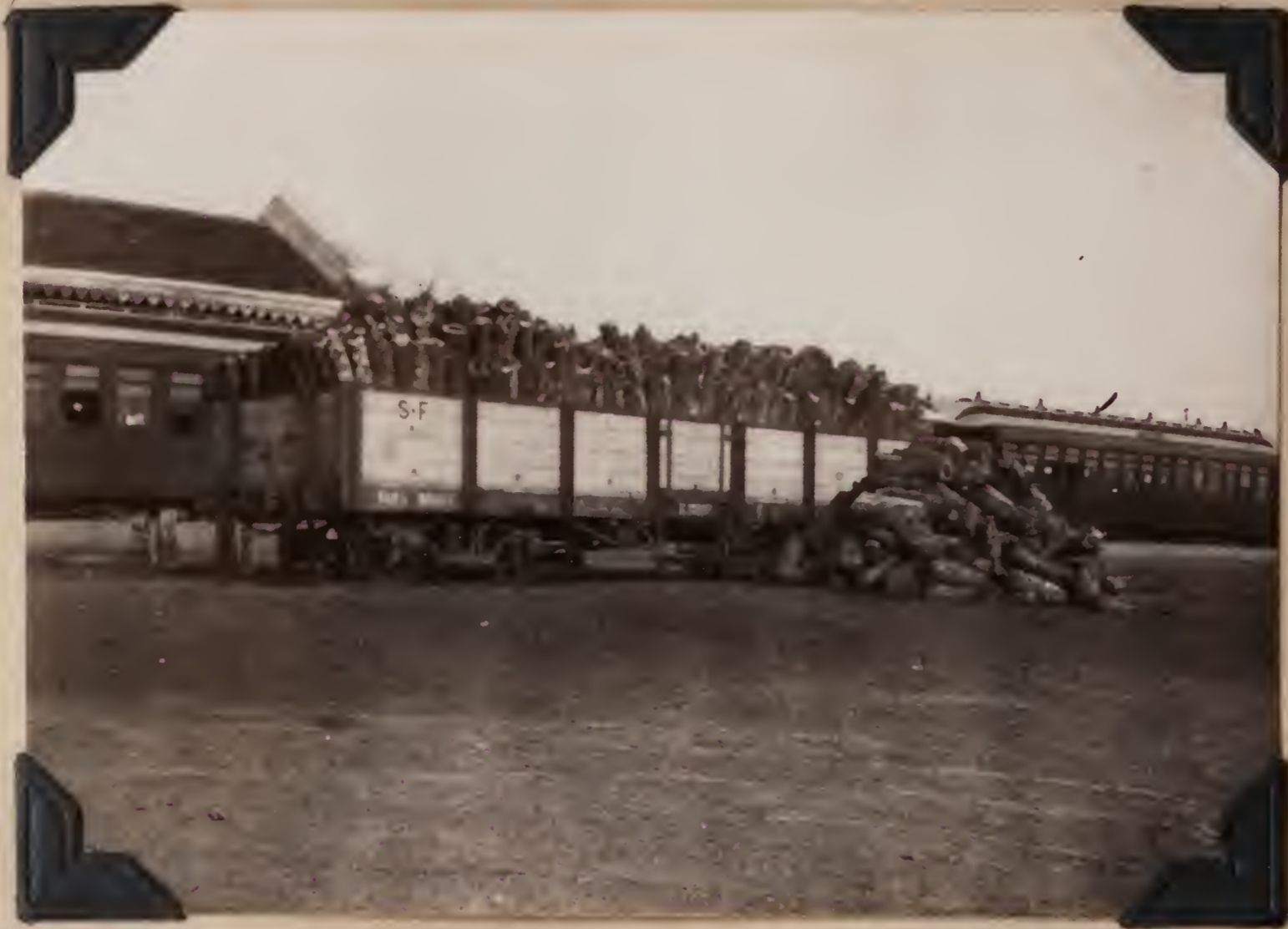
1343. Quebracho wood for use as fuel. La Sabana, Chaco, Argentina. July 5, 1920.