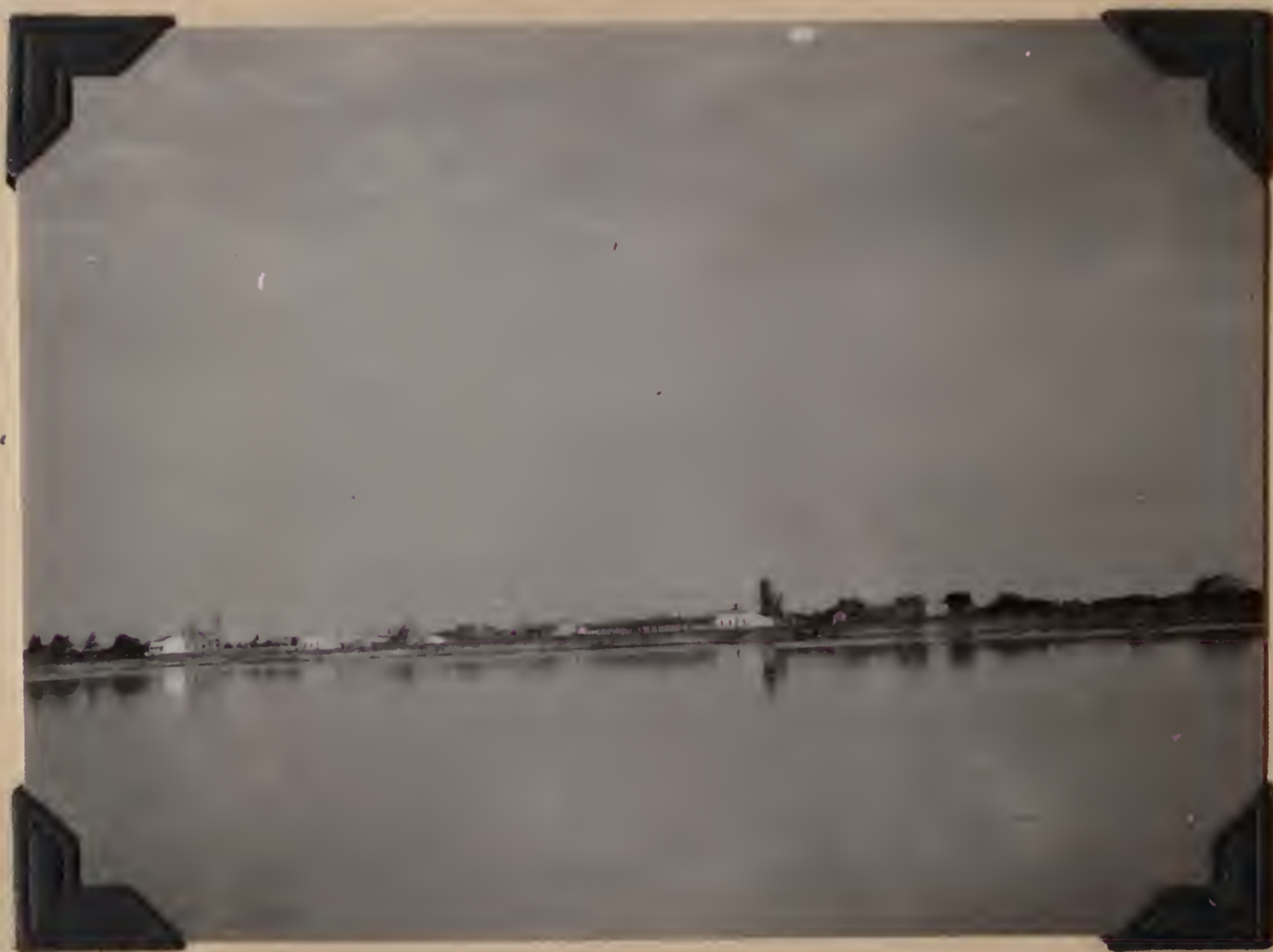
B.S. 22005. Río Paraguay near Humaitá, Paraguay. Argentina. August 2, 1920.