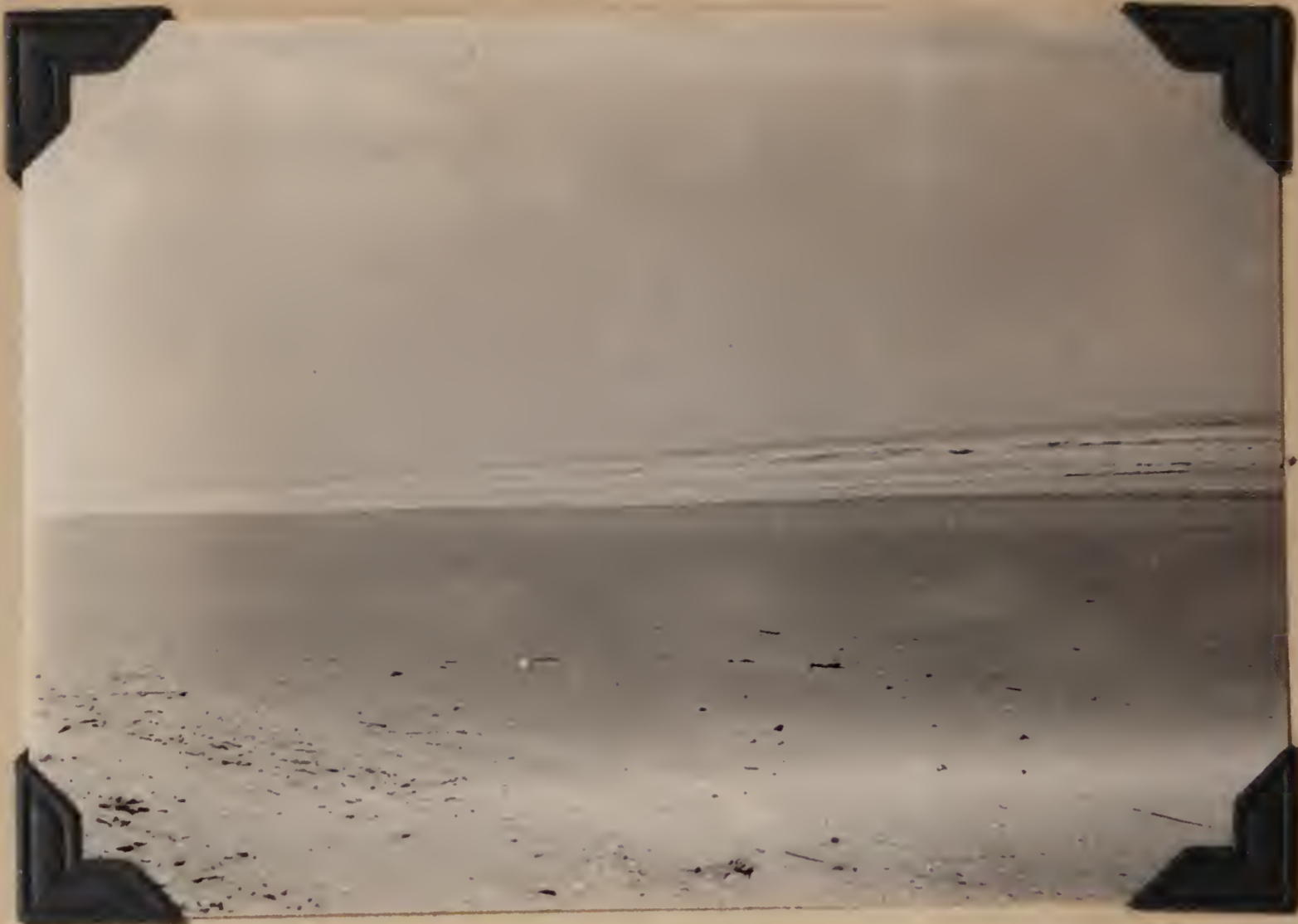
1421. Ocean beach 15 miles south of Cabo San Antonio, east coast of Prov. Buenos Aires, Argentina. November 7, 1920.