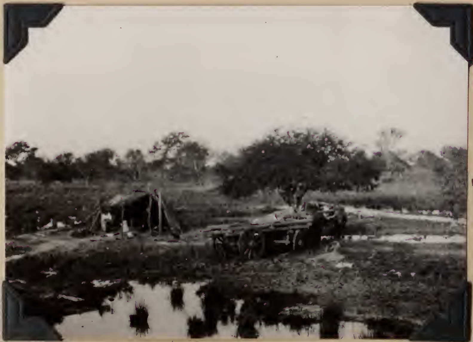
B.S. 21936. Typical view in deforested section of the Chaco. Southern Chaco, Argentina. July 5, 1920.