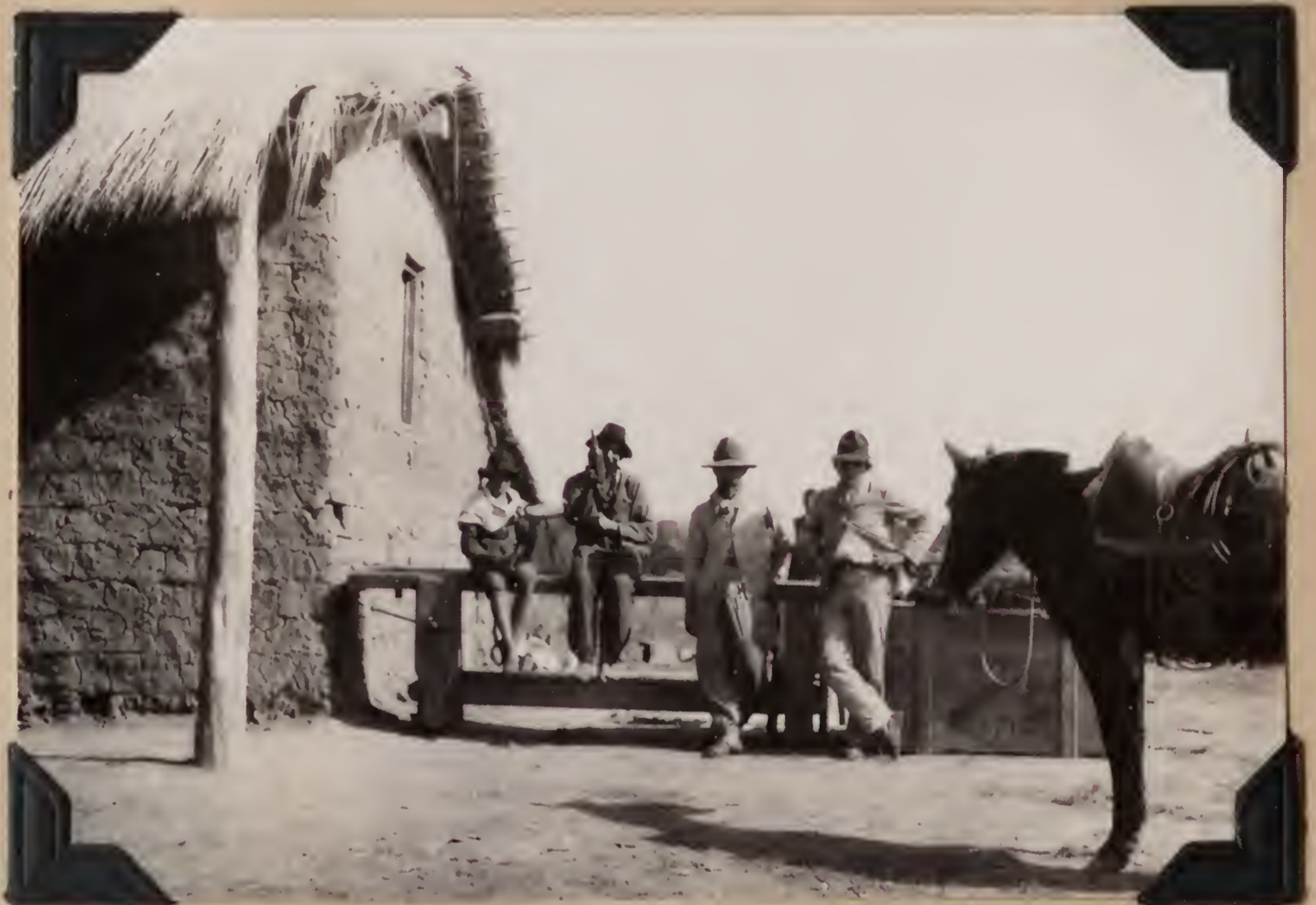
1352. Peones at a wayside boliche. Las Palmas, Chaco, Argentina. July 19, 1920.