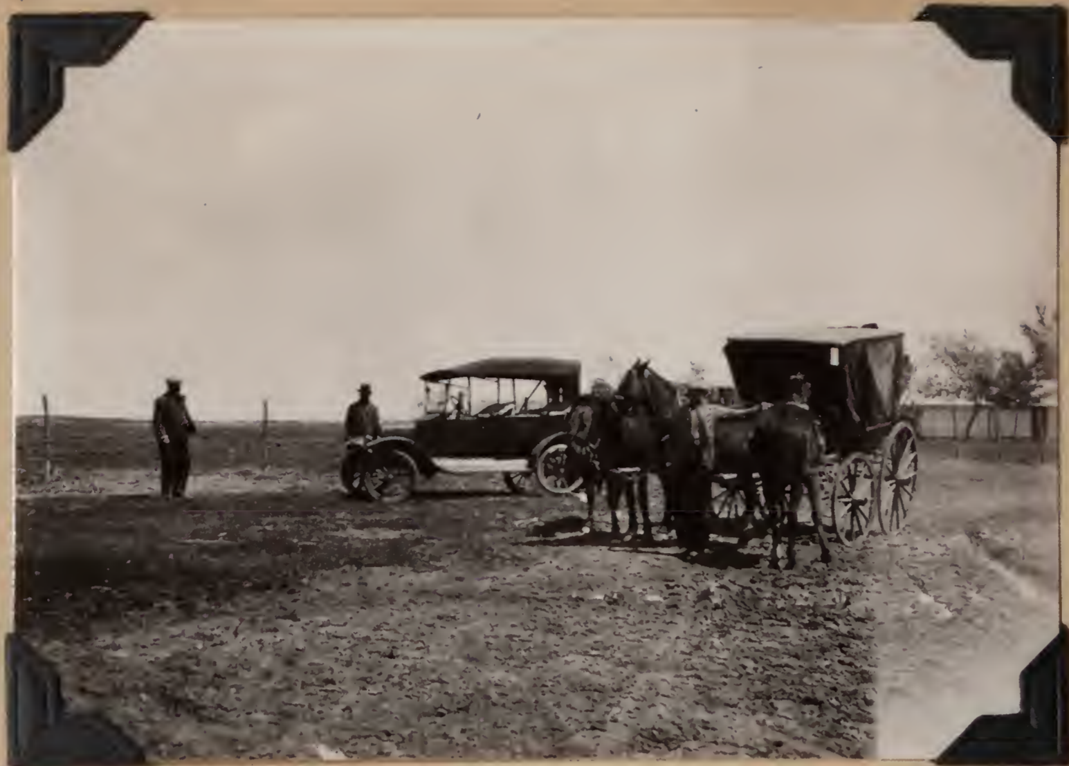
1409. Changing from auto to coach, at Conessa, Buenos Aires, Argentina.