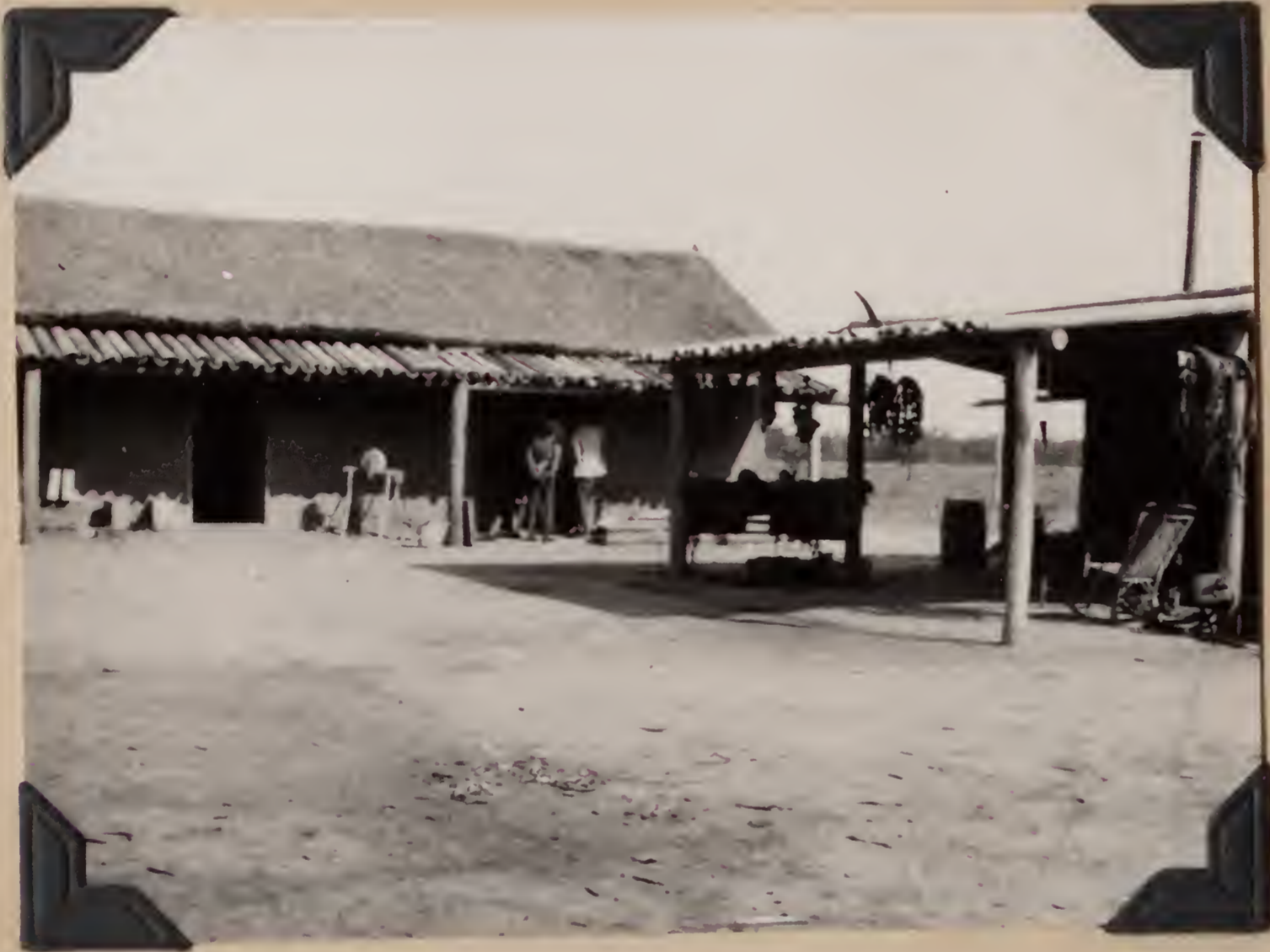
B.S. 22036. Indians trading at Hacienda Linda Vista. All purchases made through an outside window to prevent robbery. Riacho Pilaga, Formosa, Argentina. August 18, 1920.