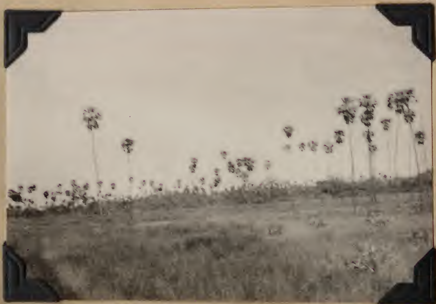
1405. View in a palmar, Kilómetro 130, west of Puerto Pinasco, Paraguay.