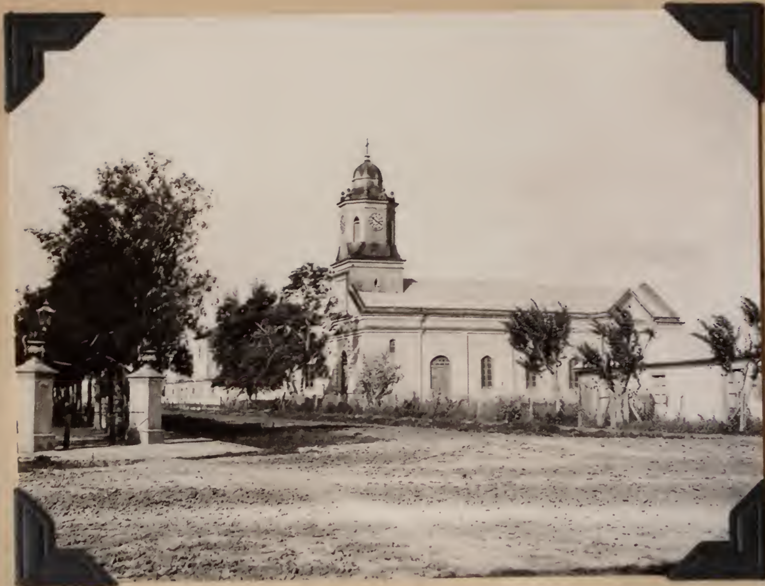
B.S. 22174. Catholic church typical of those found universally in pampa towns. Lavalle, Buenos Aires, Argentina. November 15, 1920.