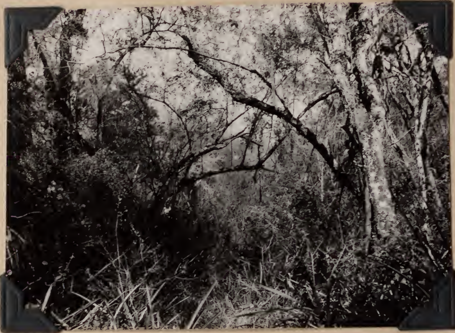
B.S. 22017. Trail or picada through El Monte Inglés; spiny plant known as Caraguata in fore- ground. Riacho Pilaga, Formosa, Argentina. August 11, 1920.