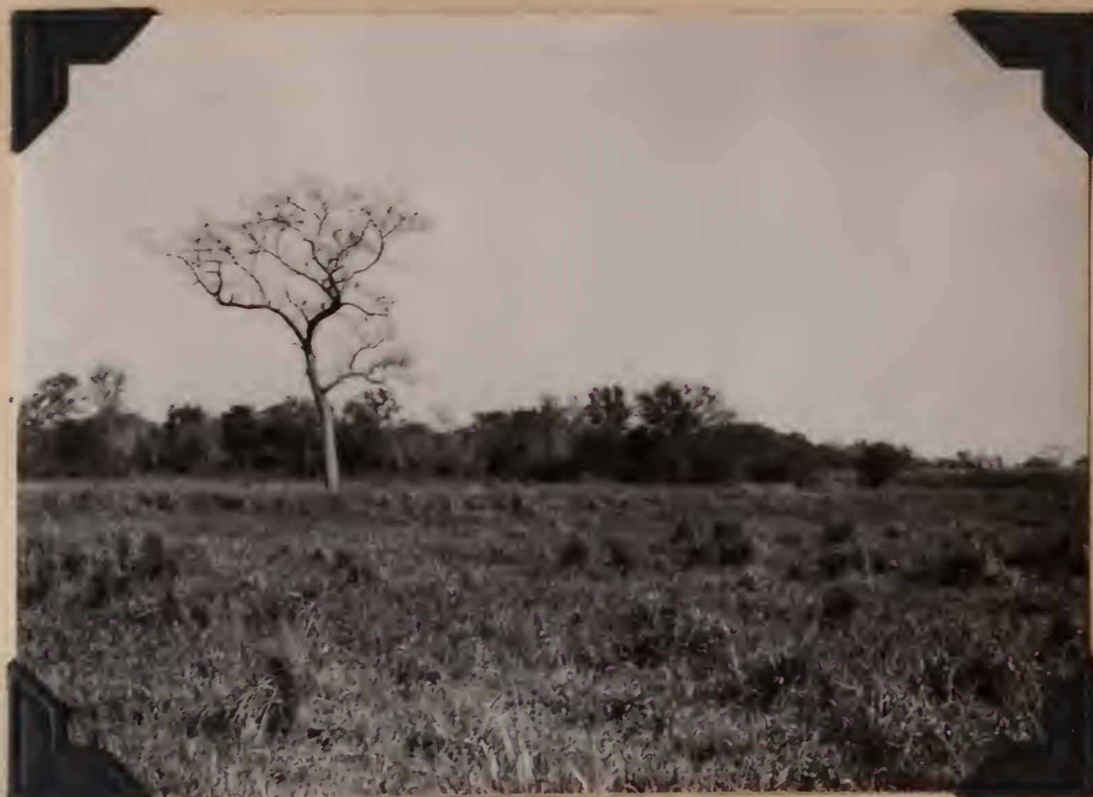
B.S. 22011. Typical view of Chaco, across an open savanna toward forest. Riacho Pilaga, Formosa, Argentina. August 8, 1920.