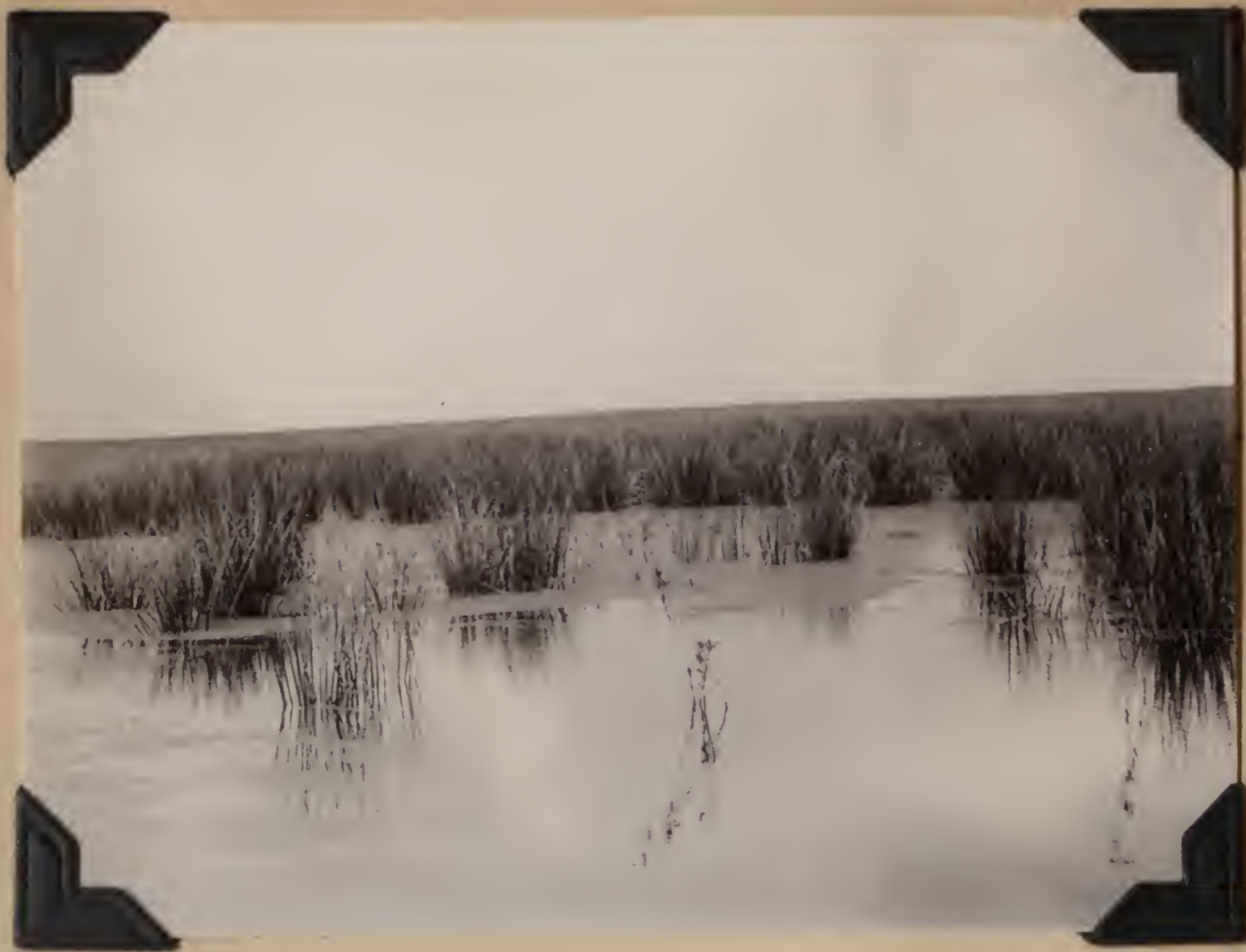
B.S. 22164. View in marsh or cañadon, Estancia Los Ynglesés. Lavalle, Buenos Aires, Argentina. November 10, 1920.