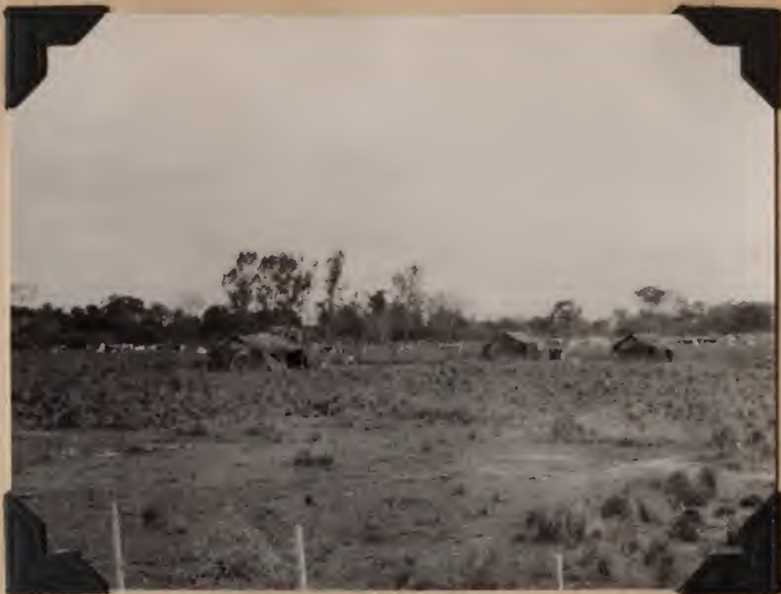
B.S. 21994. Village of Toba Indians. Las Palmas, Chaco, Argentina. August 1, 1920.