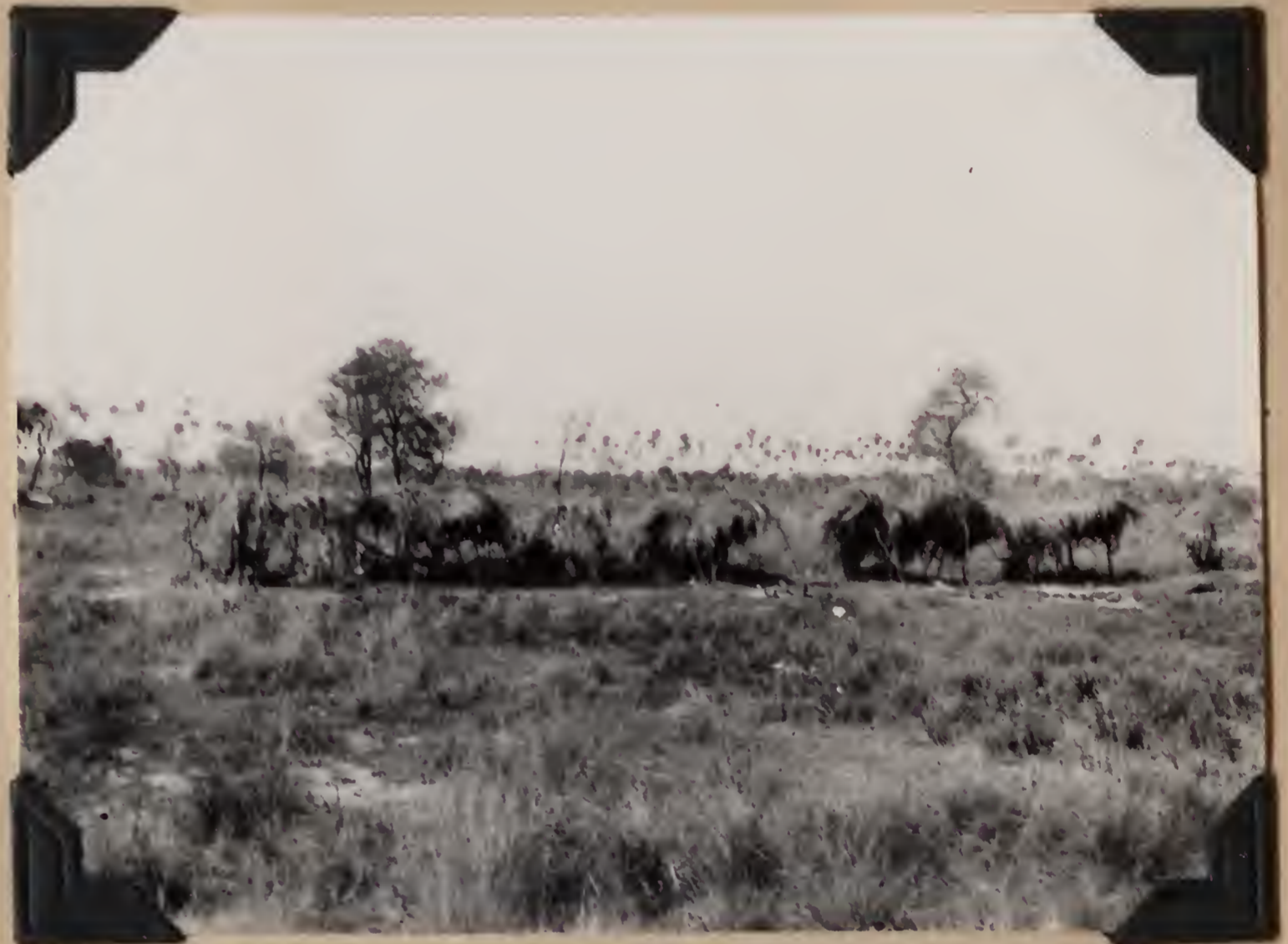
B.S. 22064. Deserted Indian tolda, Laguna Palmas, Kilómetro 80, Puerto Pinasco, Paraguay. September 10, 1920.