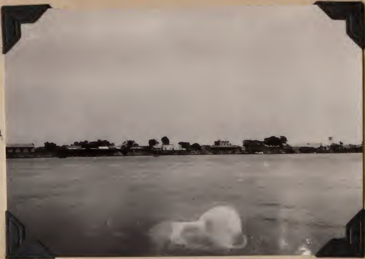
B.S. 22048. View of town from Río Paraguay. Formosa, Formosa, Argentina. August 26, 1920.