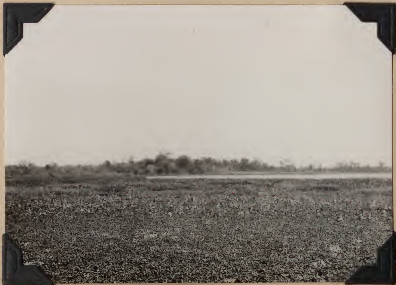
B.S. 21973. Lagoon. Apparently solid foreground in reality is vegetation resting on mud and water 6 inches to 2 feet deep. Las Palmas, Chaco, Argentina. July 23, 1920.