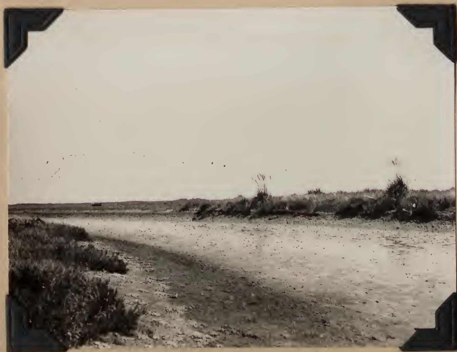
✓ B.S. 22129. Tide channels or cangrejales at mouth of Río Ajó at low tide. Black spots are crabs. Good feeding grounds for shorebirds. Lavalle, Buenos Aires, Argentina.