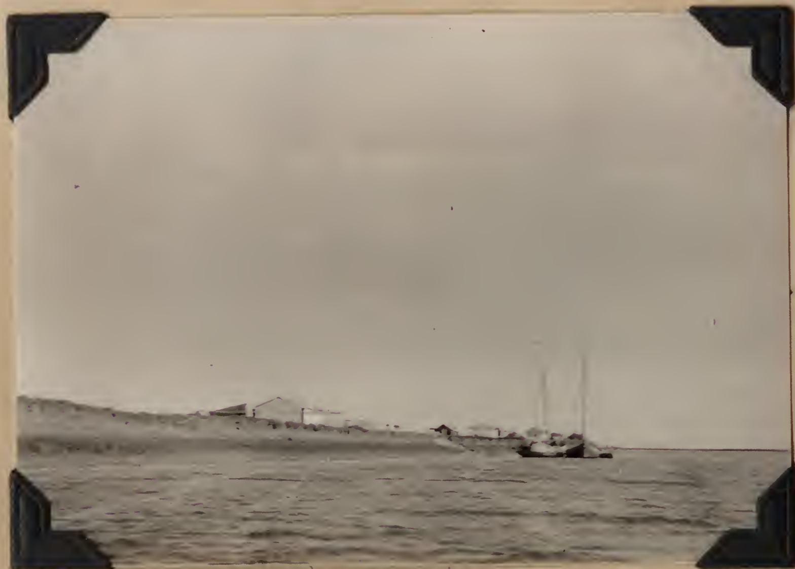
1412. Fishing station near mouth of Río Ajó, below Lavalle, Buenos Aires, Argentina. October 25, 1920.