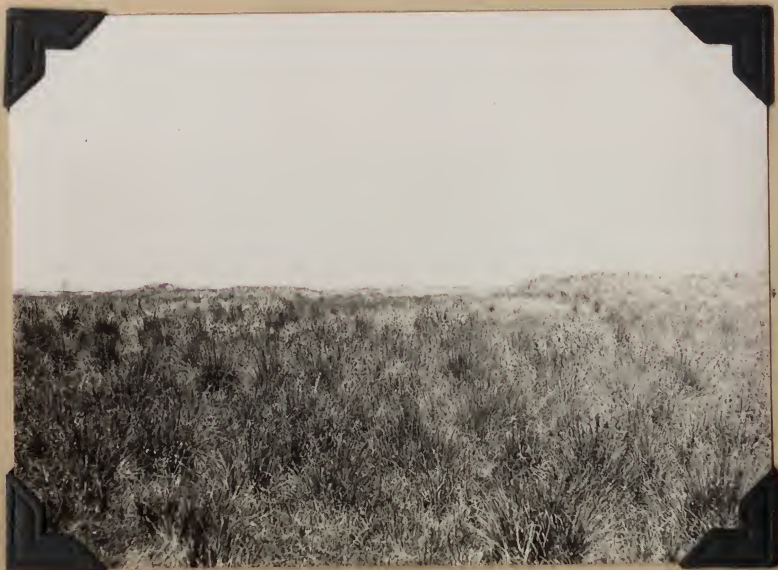
S.I. 36513 A B.S. 22159. Sand dunes 15 miles south of Cabo San Antonio. Lavalle, Buenos Aires, Argentina. November 8, 1920.