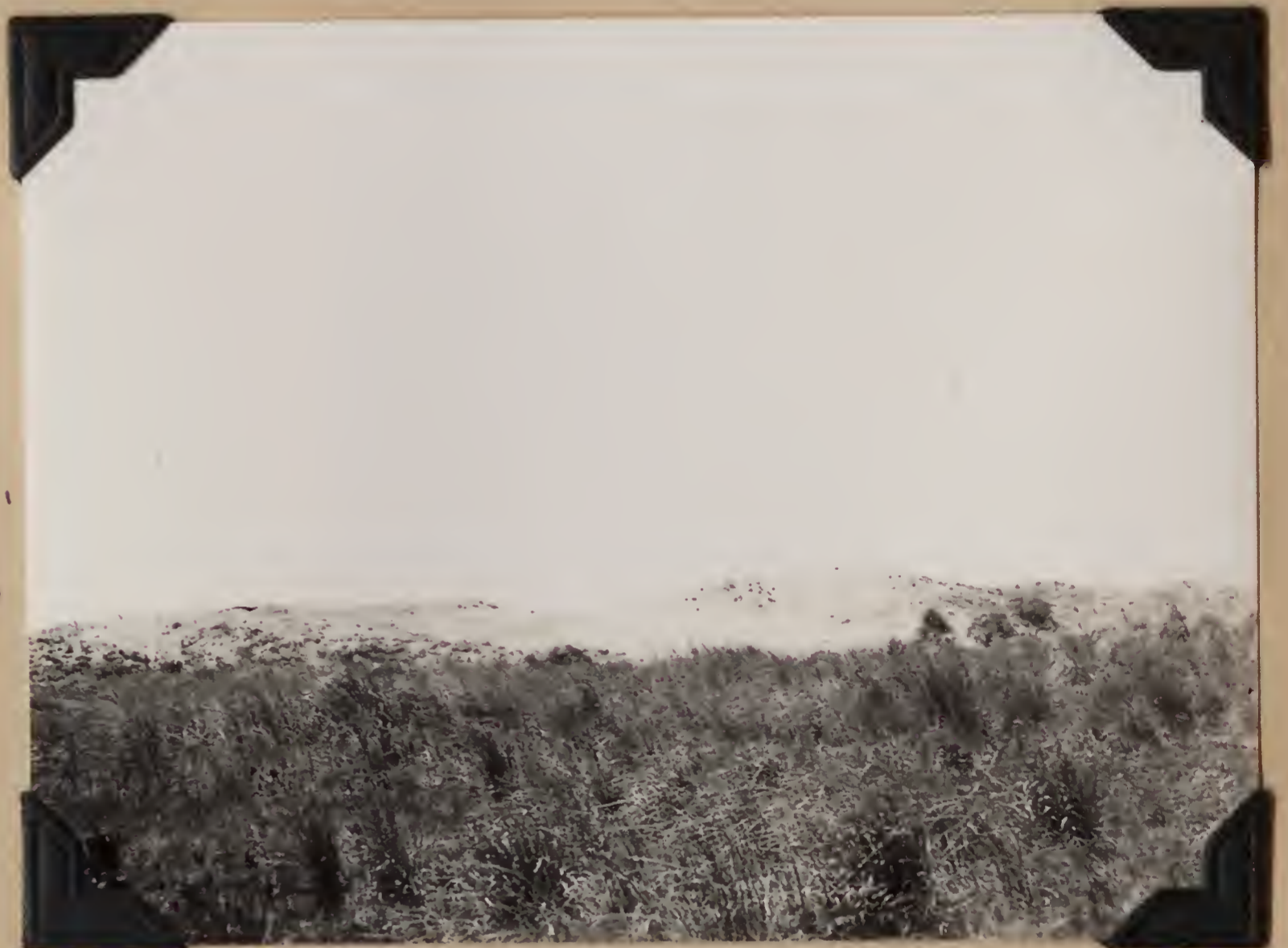
B.S. 22158. Sand dunes 15 miles south of Cabo San Antonio. Lavalle, Buenos Aires, Argentina. November 8, 1920.