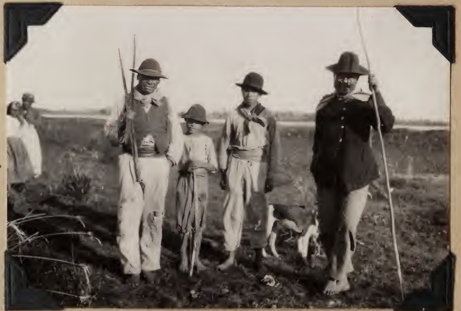
1355. Toba Indians on a fishing expedition. Las Palmas, Chaco, Argentina. July 23, 1920.