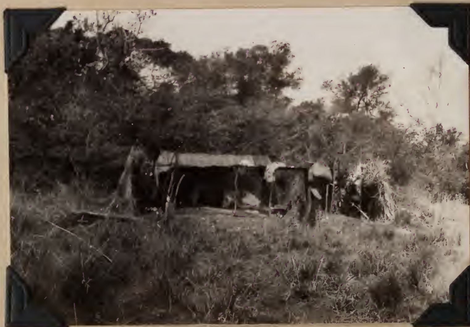
1358. Toba Indian hut near Las Palmas, Chaco, Argentina. July 23, 1920.