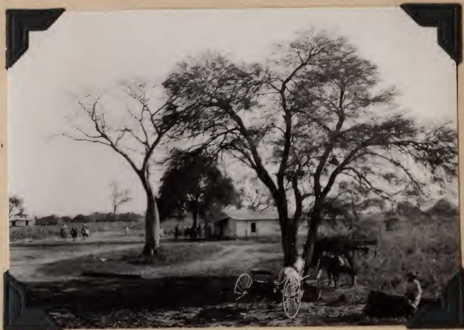
B.S. 22009. Kilómeter 182, or Fontana, Formosa, Argentina. August 6, 1920.