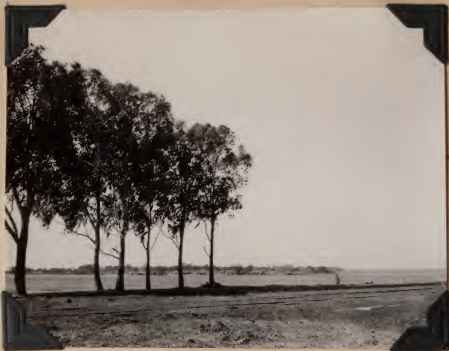
B.S. 22008. Río Paraguay with town of Alberdi, Paraguay on opposite shore. Formosa, Formosa, Argentina. August 4, 1920.