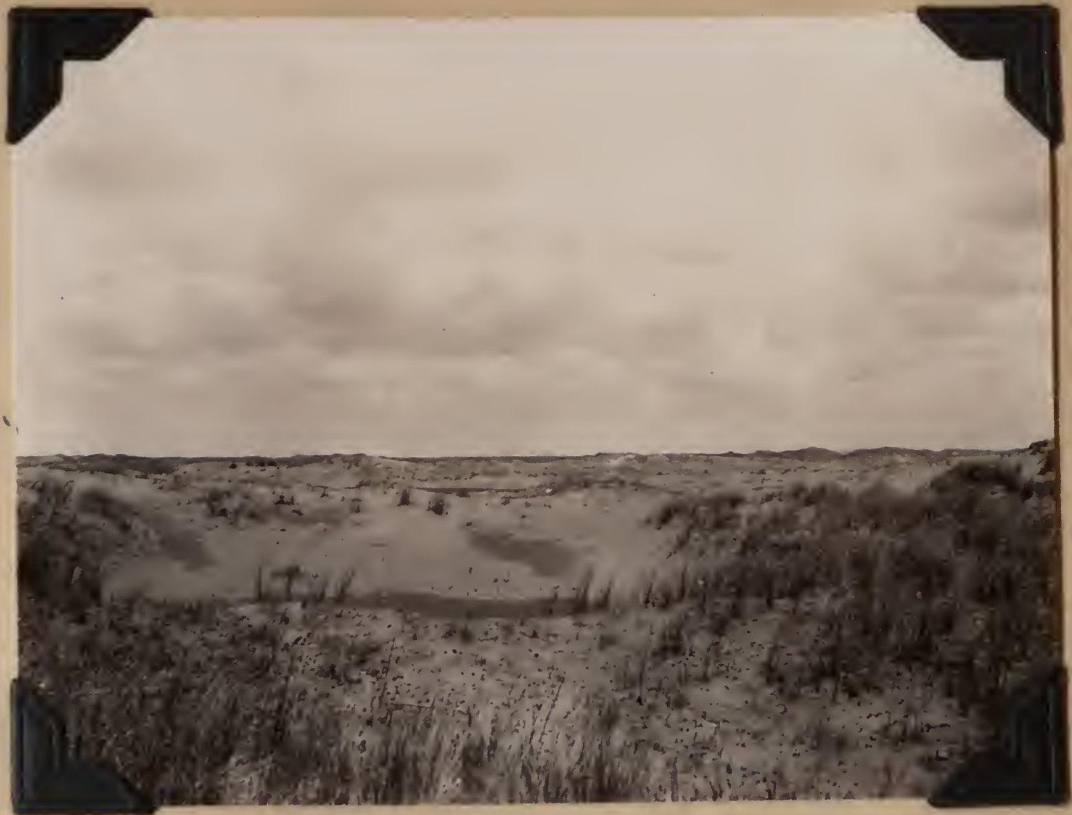
B.S. 22154. Sand dunes 15 miles south of Cabo San Antonio. Lavalle, Buenos Aires, Argentina. November 7, 1920.