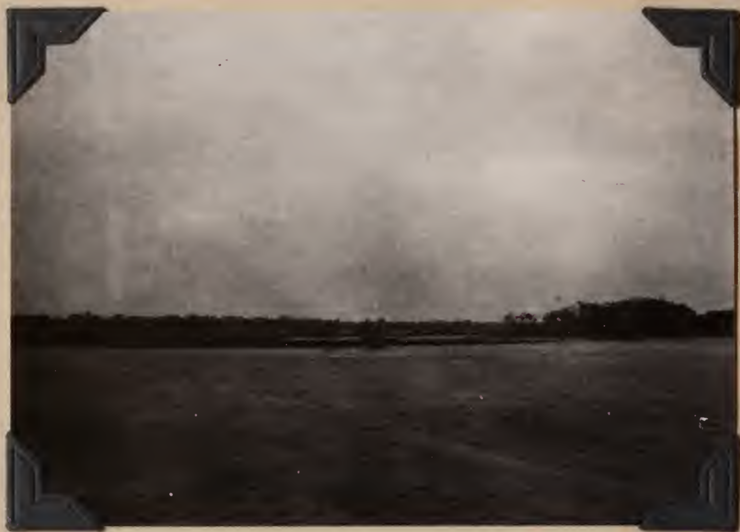
B.S. 22055. Mouth of Río Pilcomayo. Paraguay. August 27, 1920.