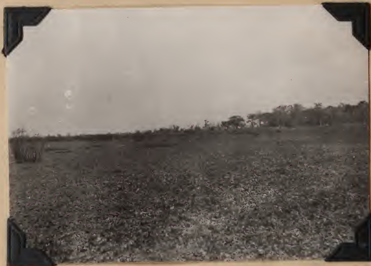
B.S. 22077. Shore line of lagoon filled with floating vegetation. Kilómetro 80. Puerto Pinasco, Paraguay. September 15, 1920.