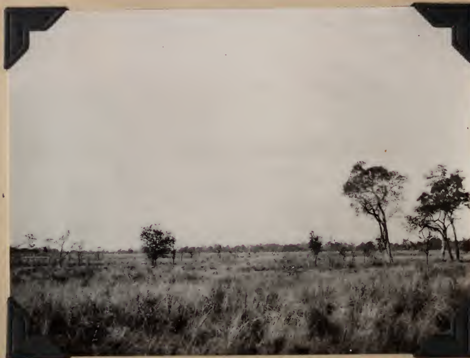
B.S. 21963. Open savanna in Chaco. Las Palmas, Chaco Argentina. July 19, 1920.