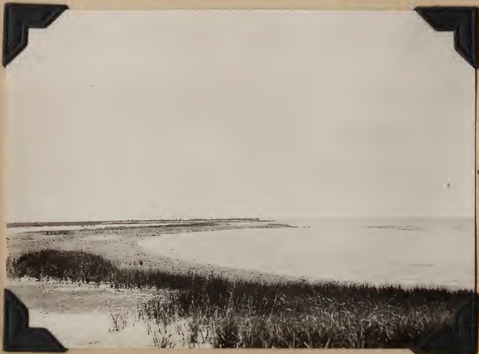
B.S. 22171. Tidal flats at mouth of Río Ajó. Lavalle, Buenos Aires, Argentina. November 15, 1920.