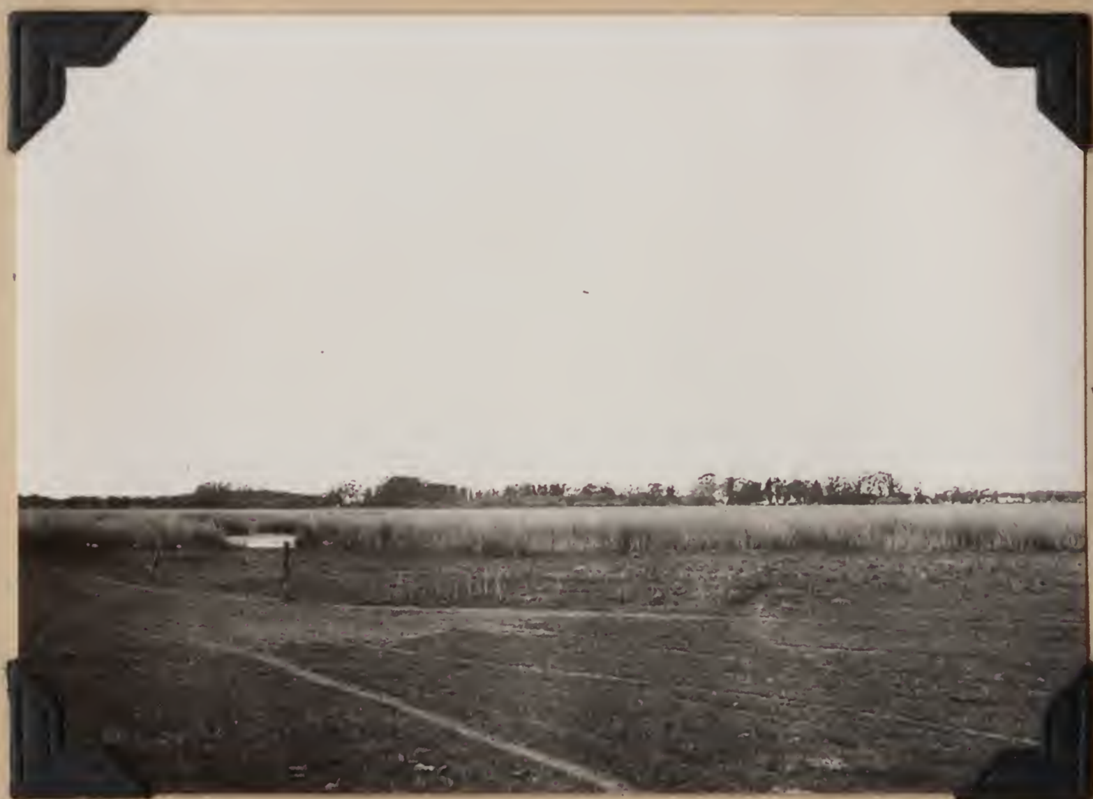
B.S. 22139. View of marsh or cañadon with Estancia Los Ynglésés in background. Lavalle, Buenos Aires, Argentina. October 29, 1920.