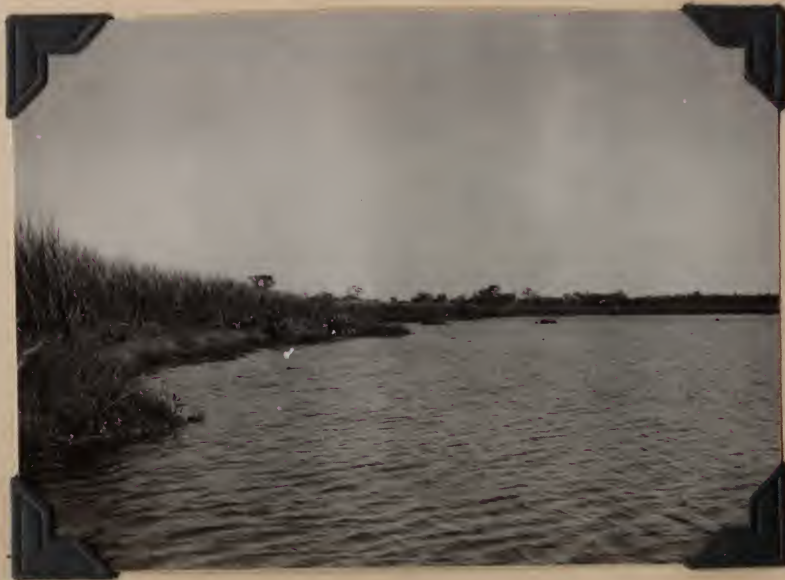
B.S. 22026. Border of lagoon in Chaco, grown with rushes. Floating masses of water hyacinth in distance. Riacho Pilaga, Formosa, Argentina. August 16, 1920.