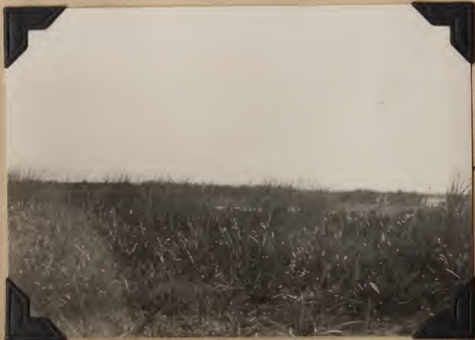
1400. Laguna Wall at Kilómetro 200, west of Puerto Pinasco, Paraguay. September 25, 1920.