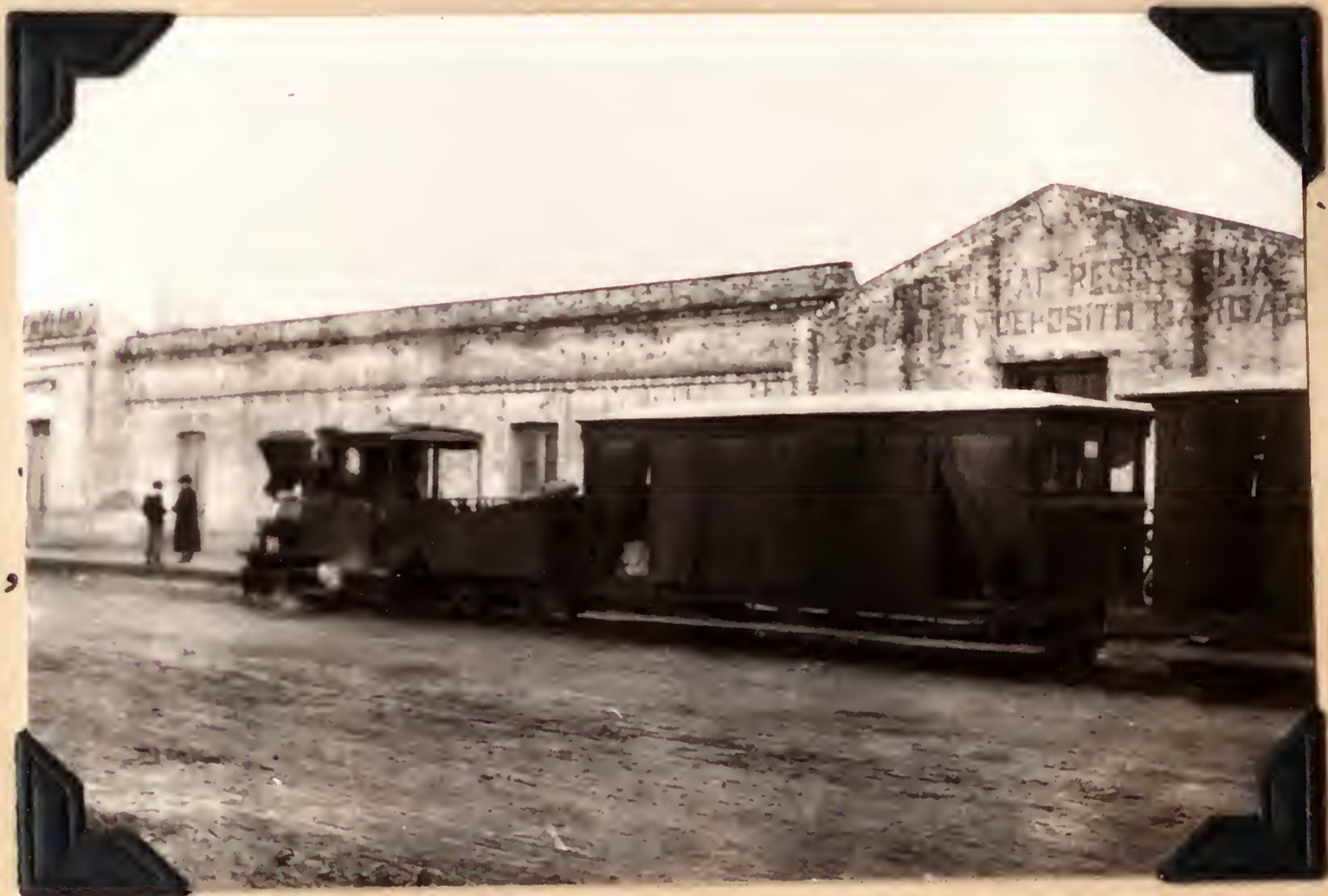
1350. The train from Resistencia to Barranqueros on the Río Paraná. Resistencia, Chaco, Argentina. July 11, 1920.