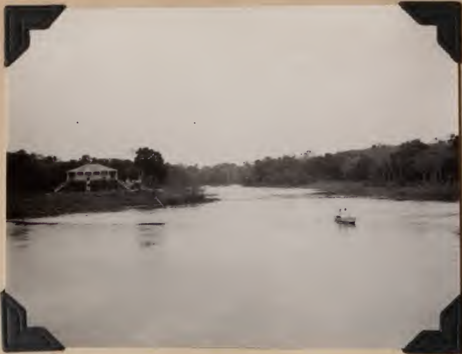
B.S. 22003. Mouth of Río de Oro on Río Paraguay below Puerto Bermejo, Argentina. August 2, 1920.