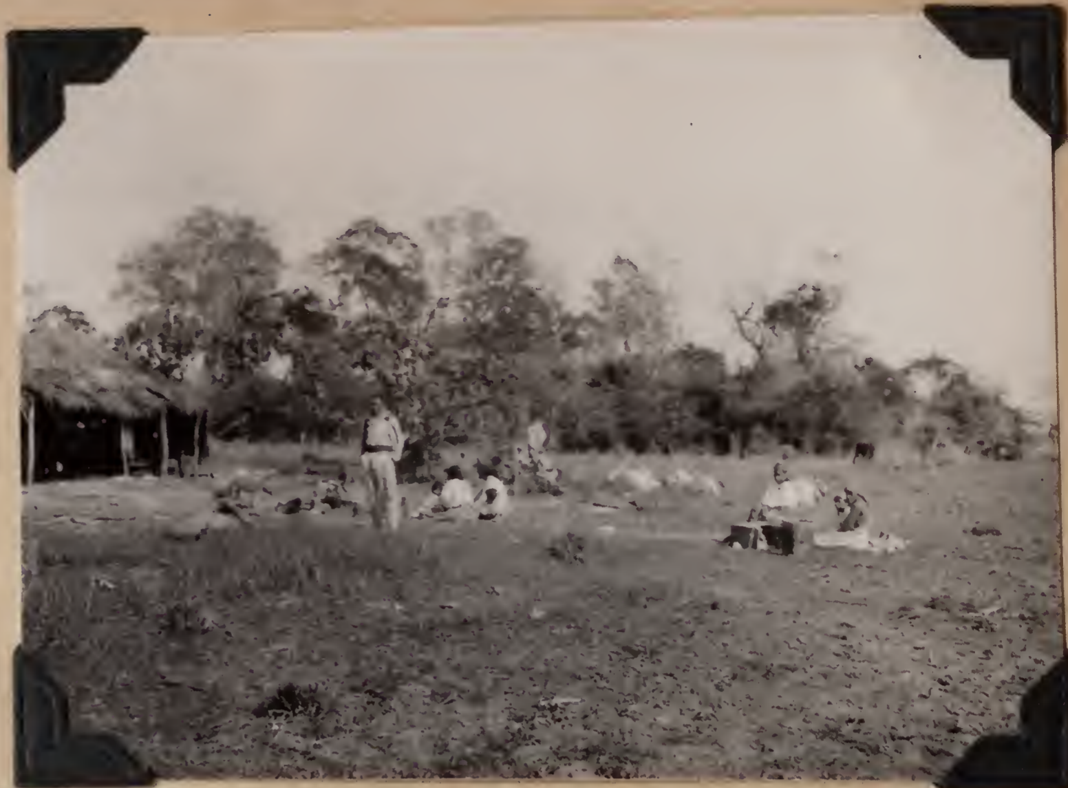
B.S. 21974. A Toba Indian Family. Las Palmas, Chaco, Argentina. July 23, 1920.