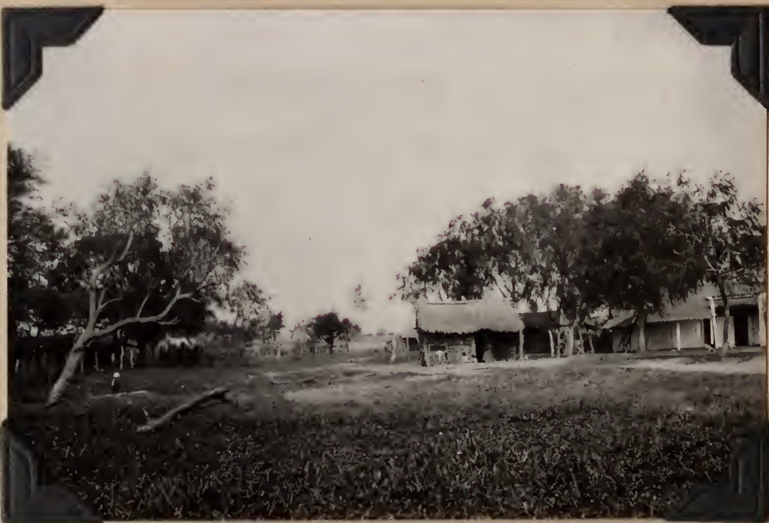
1386. The foreground con- sists of aquatic vegetation con- cealing entirely the water of a lagoon. Alberdi, Paraguay. August 26, 1920.