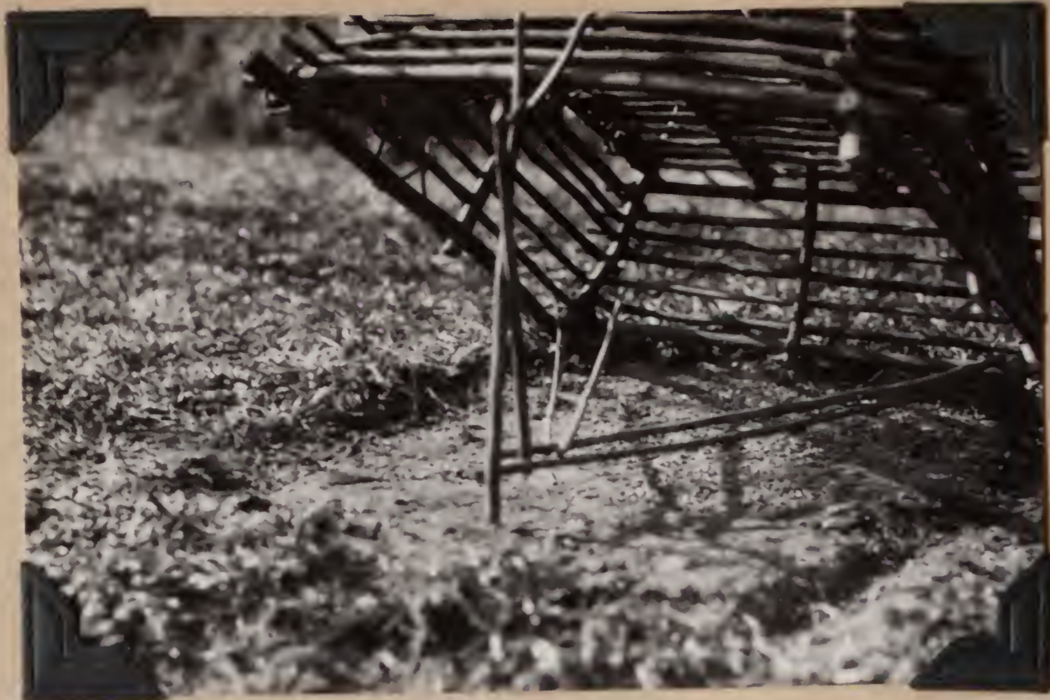
B.S. 22046. Near view of bird trap to show arrangement of triggers. Formosa, Formosa, Argentina. August 24, 1920.