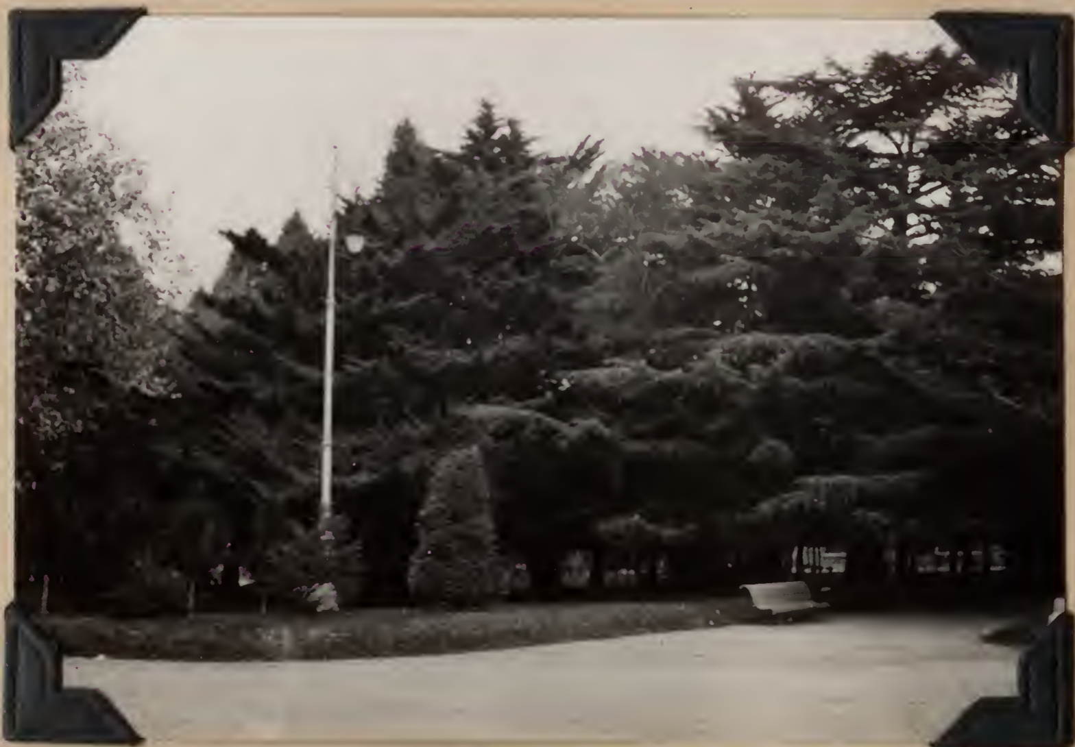
1340. Park in Montevideo, Uruguay. June 20, 1920.