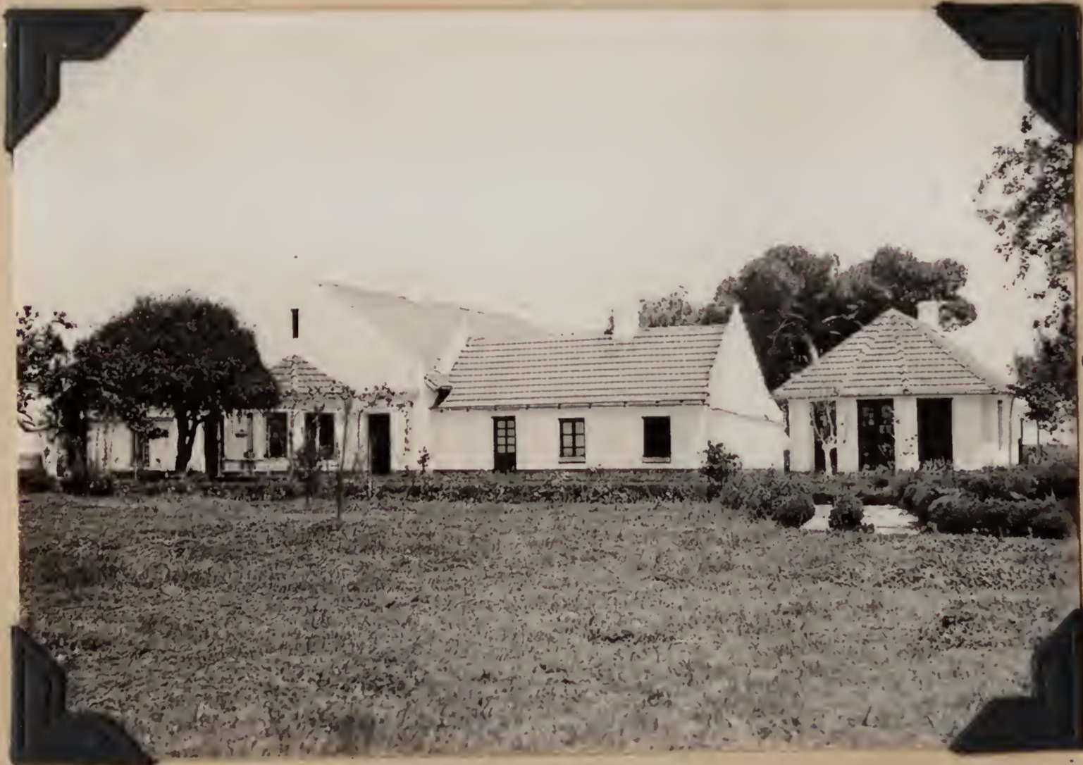
1417. The main house at Estancia Los Ynglesés, former property of the ornithologist Ernest Gibson. Building for his bird skins and study at right. Lavalle, Buenos Aires, Argentina. October 30, 1920.