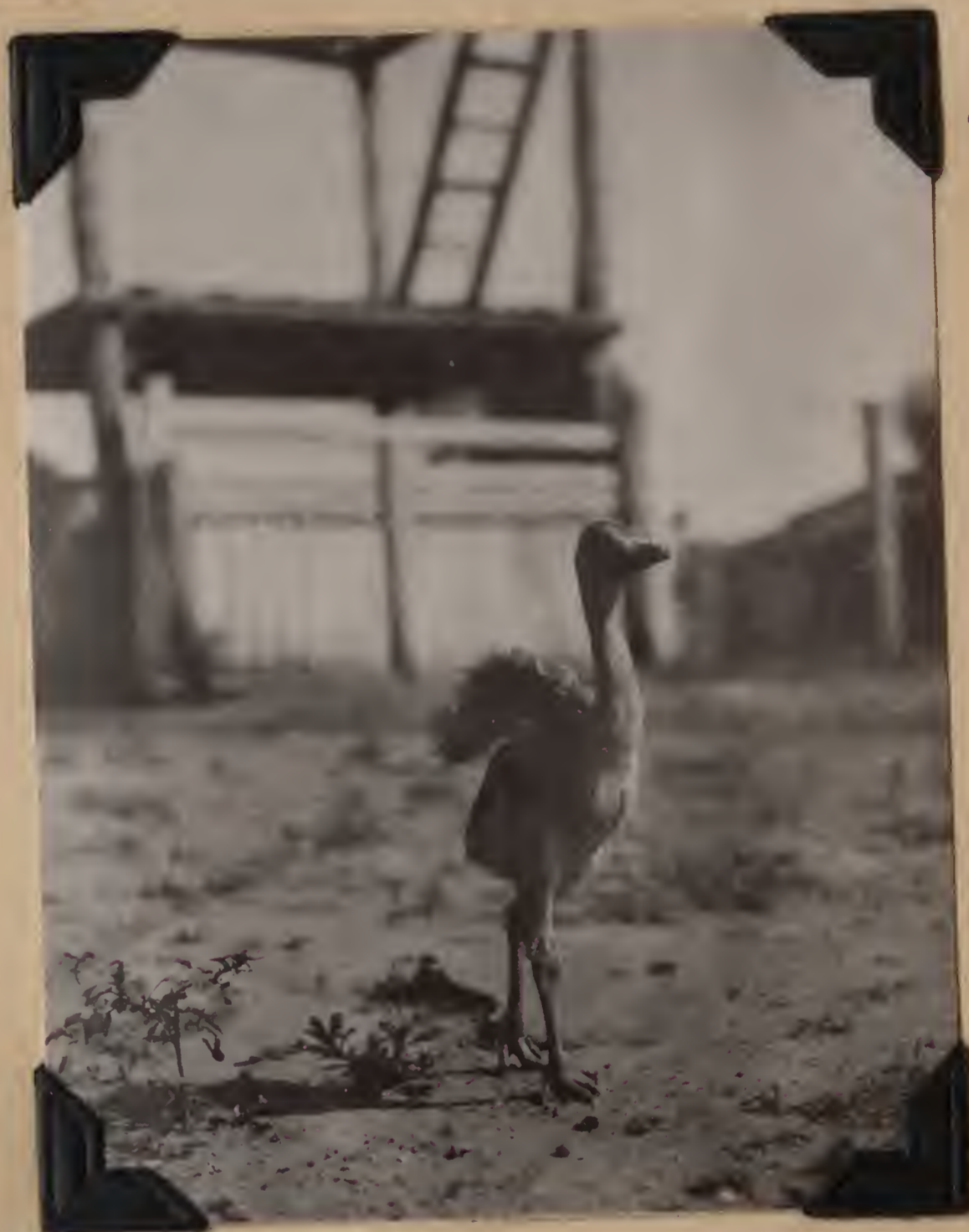
B.S. 22118. A week-old rhea, Kilómetro 80. Puerto Pinasco, Paraguay. September 27, 1920.