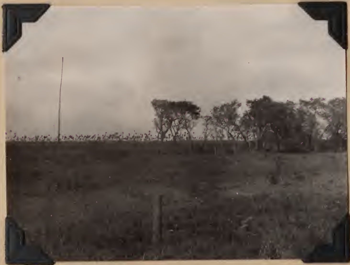
B.S. 22090. Laguna Perdido west of Laguna Lata. Puerto Pinasco, Paraguay.