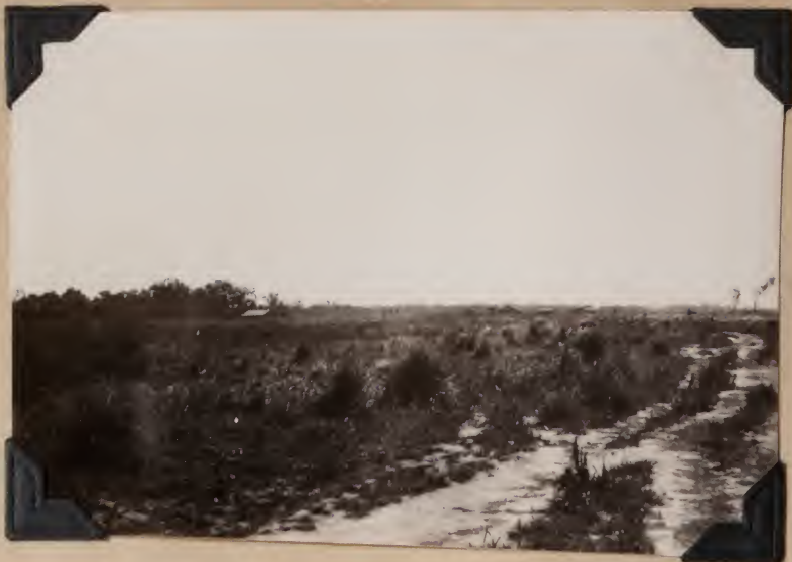
1373. A distant view of the Hacienda Linda Vista, Riacho Pilaga, Formosa, Argentina. August 8, 1920.