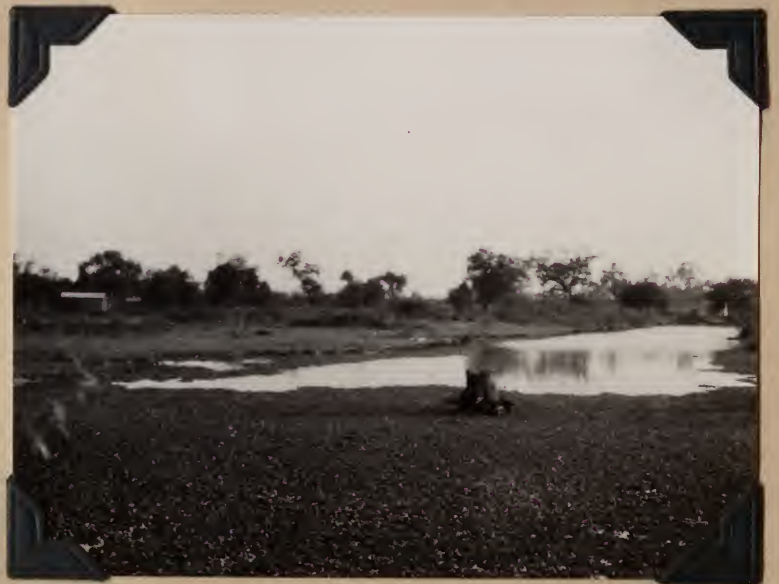
B.S. 21933. Lagoon covered at shore with float- ing vegetation. La Sabana, Chaco, Argentina. July 5, 1920.