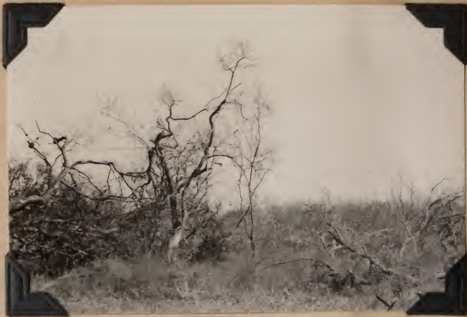
1398. Vinal monte killed by fire. Laguna Wall, Kilómetro 200 west of Puerto Pinasco, Paraguay. September 25, 1920.