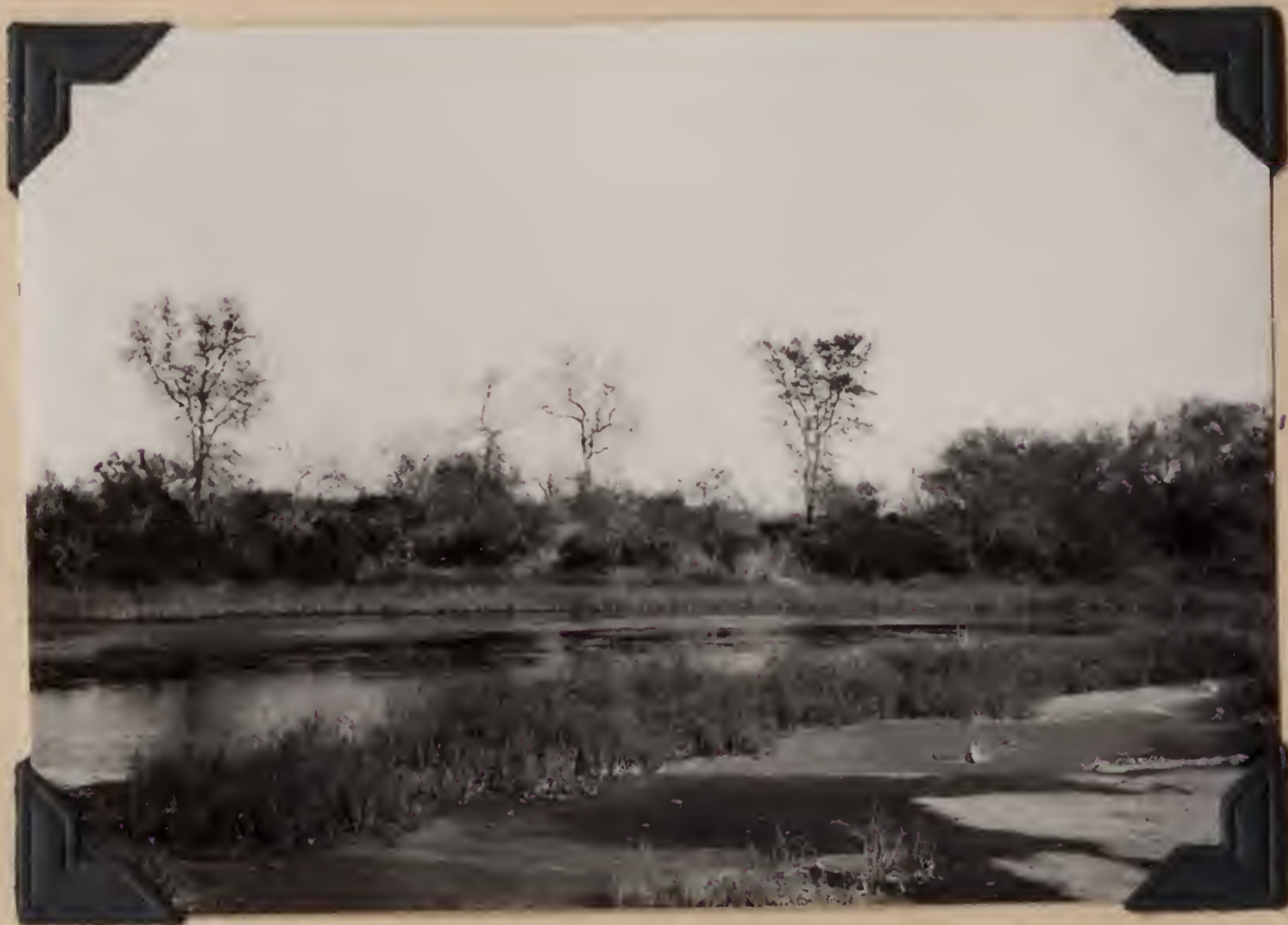
B.S. 22022. Alkaline flats bordering stream known as Riacho Pilaga. In summer this stream runs full. Riacho Pilaga, Formosa, Argentina. August 14, 1920.