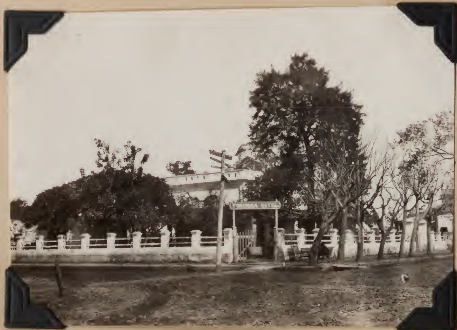
1369. The Formosa Hotel. Formosa, Formosa, Argentina. August 4, 1920.