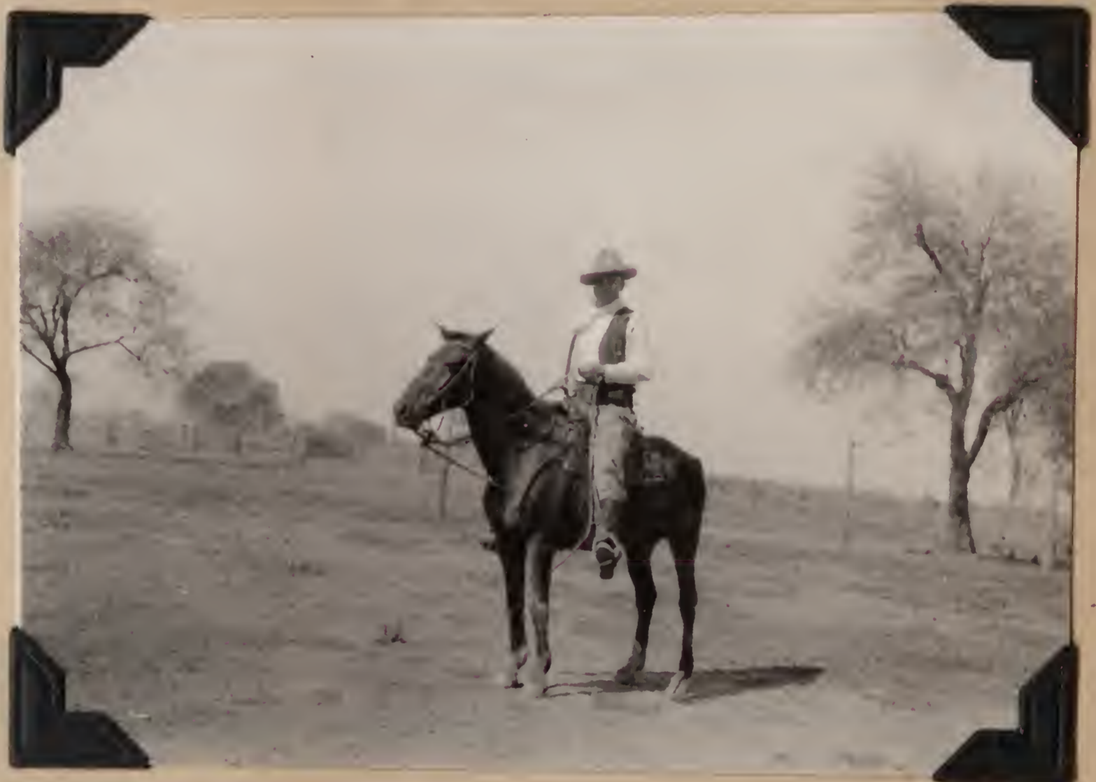
1391. Carl Hettman, at Kilómetro 80, west of Puerto Pinasco, Paraguay. September 14, 1920.