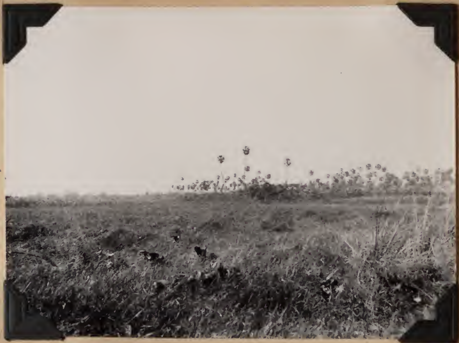
B.S. 22067. View of Laguna Palmas, Kilómetro 80, Puerto Pinasco, Paraguay. September 10, 1920.