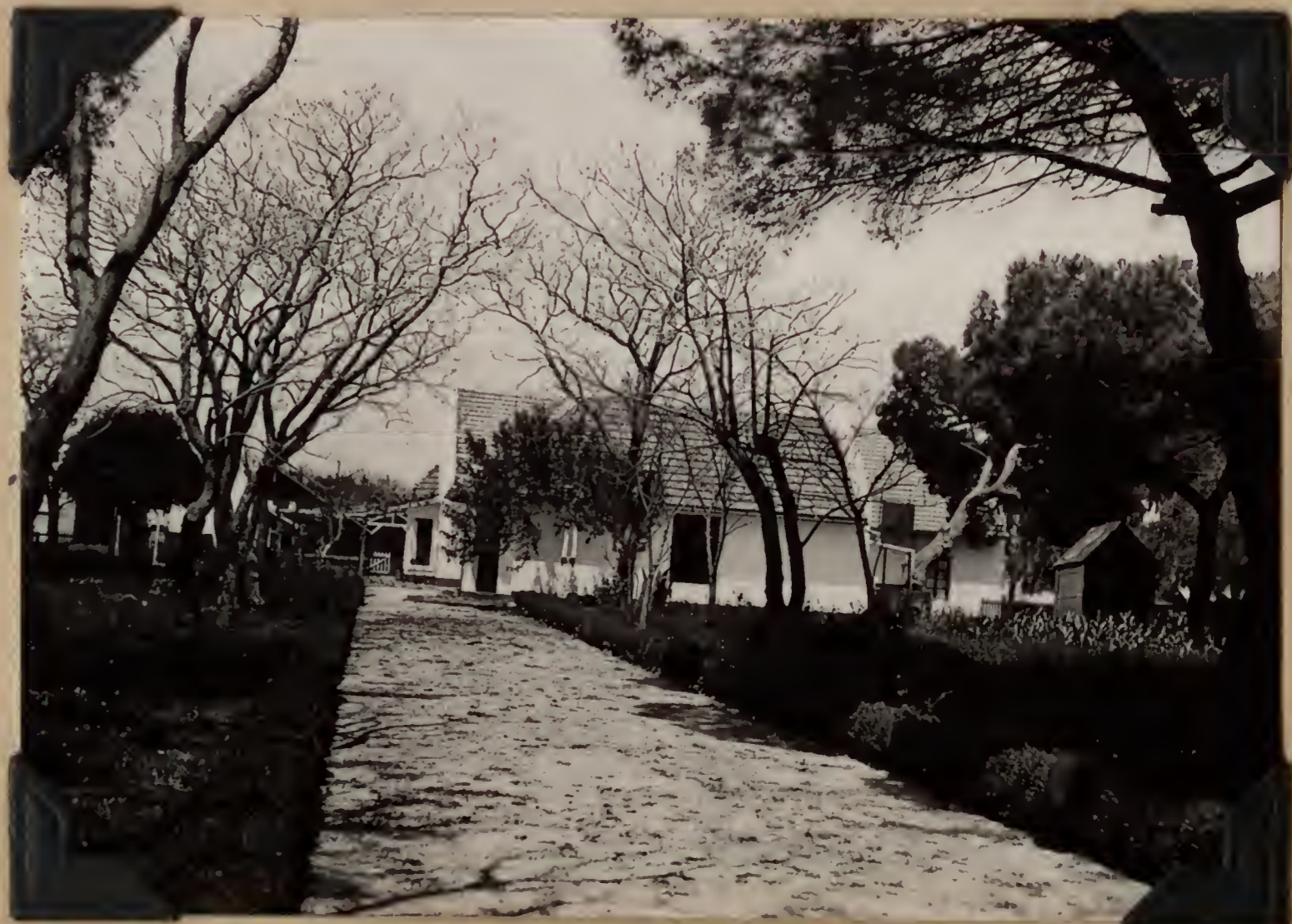
1418. At the Estancia Los Yngléses, Lavalle, Buenos Aires, Argentina. October 30, 1920.