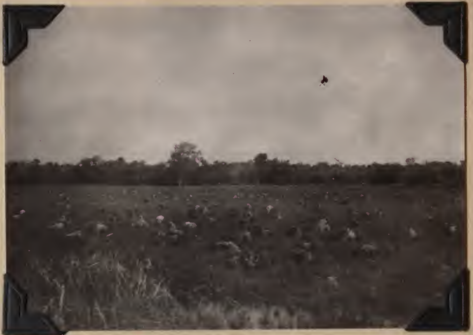
B.S. 22039. Ant hills in marshy ground. Kilómeter 100, Formosa, Argentina. August 21, 1920.