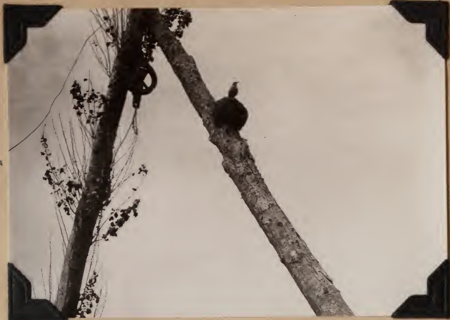
B.S. 22166. The ovenbird or hornero ( Furnarius rufus ) at nest. Estancia Los Ynglesés. Lavalle, Buenos Aires, Argentina. November 10, 1920.