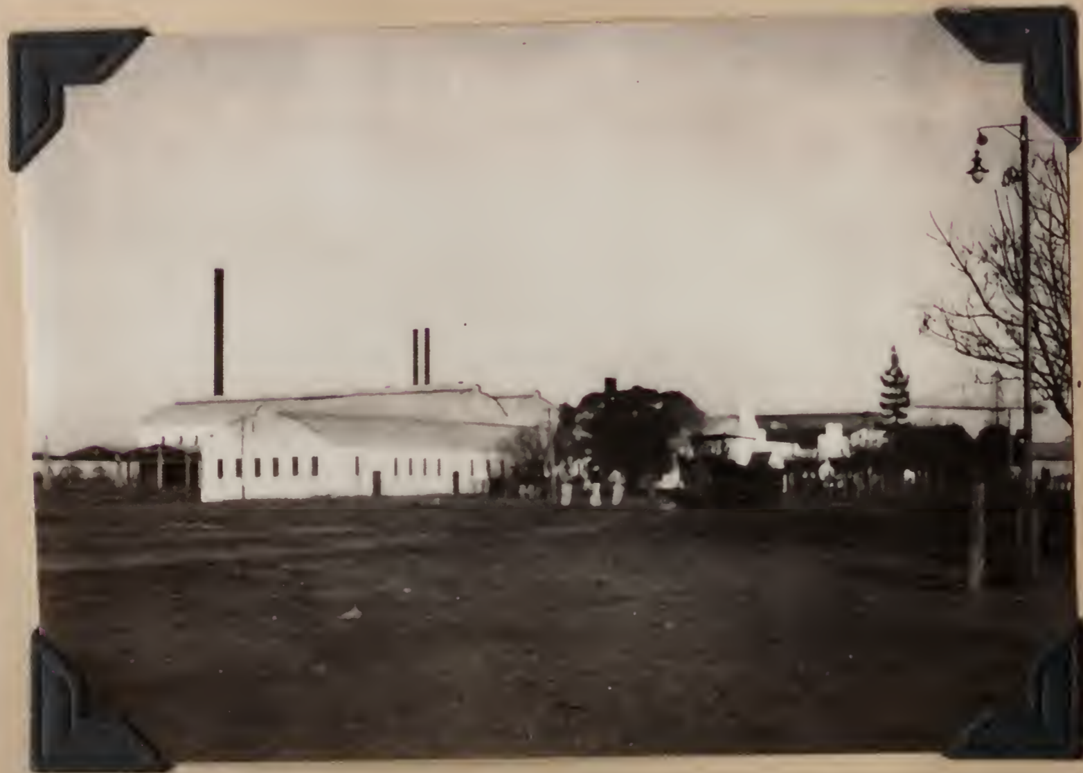
1361. Sugar central and quebracho factory. Las Palmas, Chaco, Argentina. July 29, 1920.