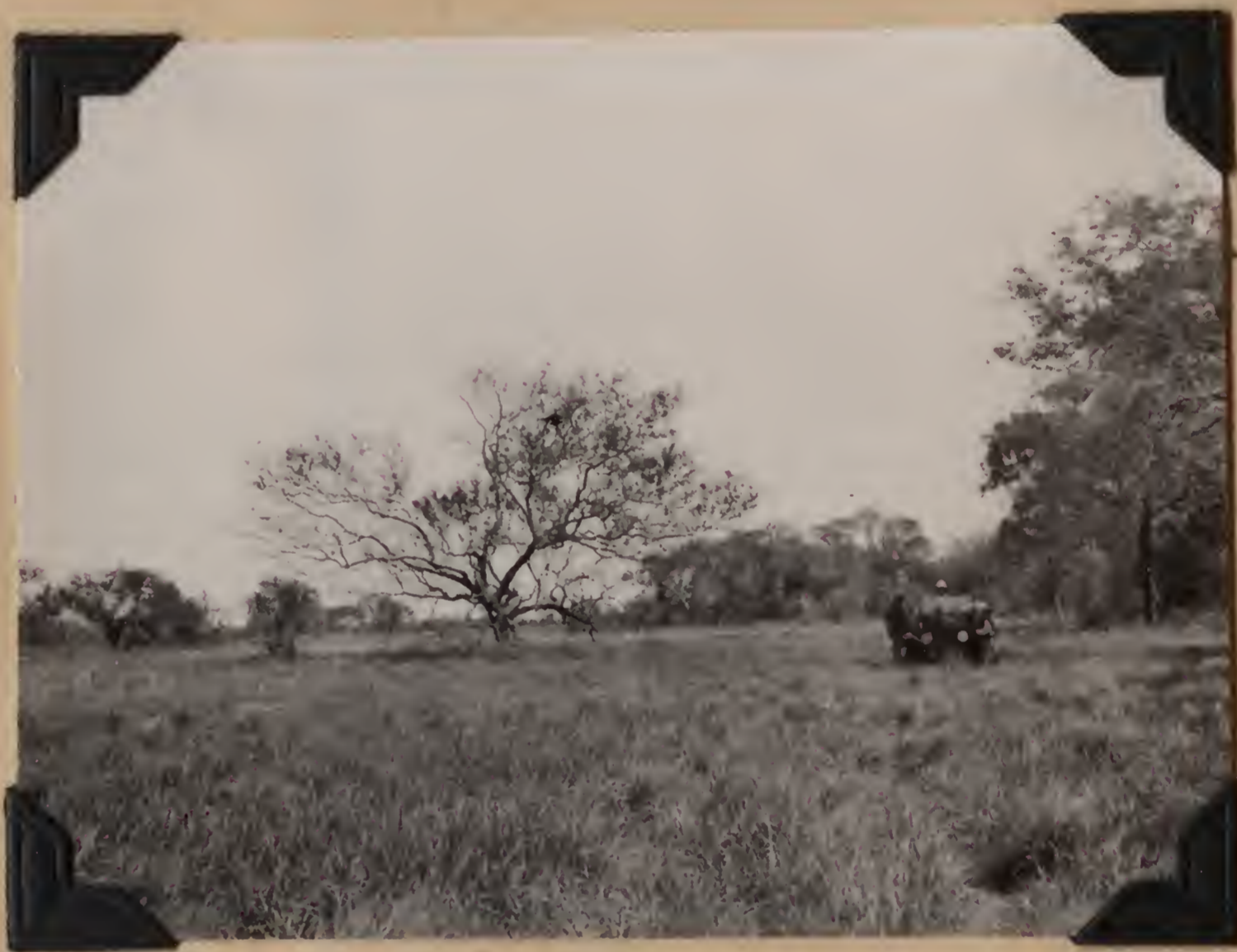
B.S. 22112. Open area east of Riacho Salado, Kilómetro 165. Puerto Pinasco, Paraguay.