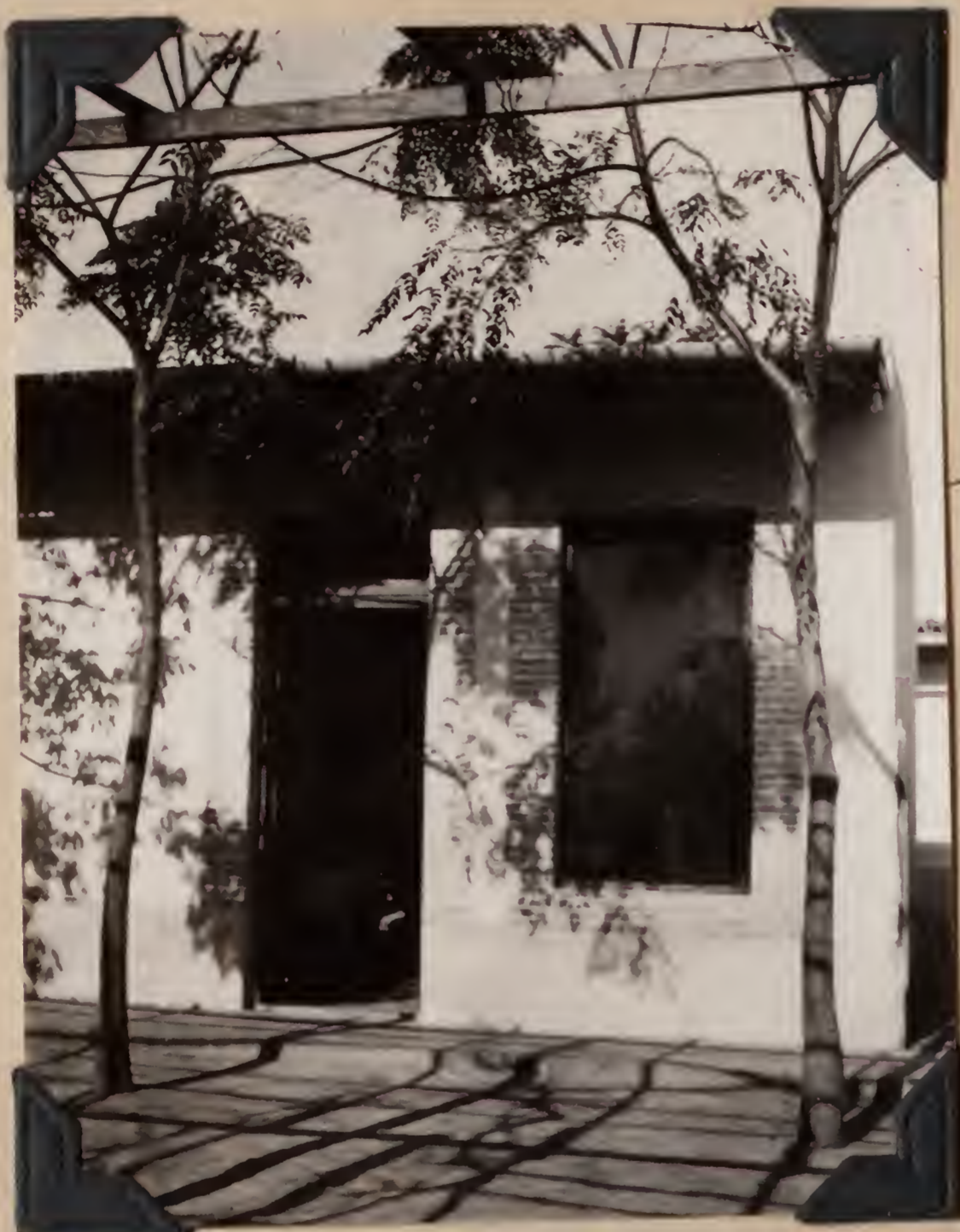
1347. My quarters opening on the patio in the Hotel Europa, Resistencia, Chaco, Argentina.