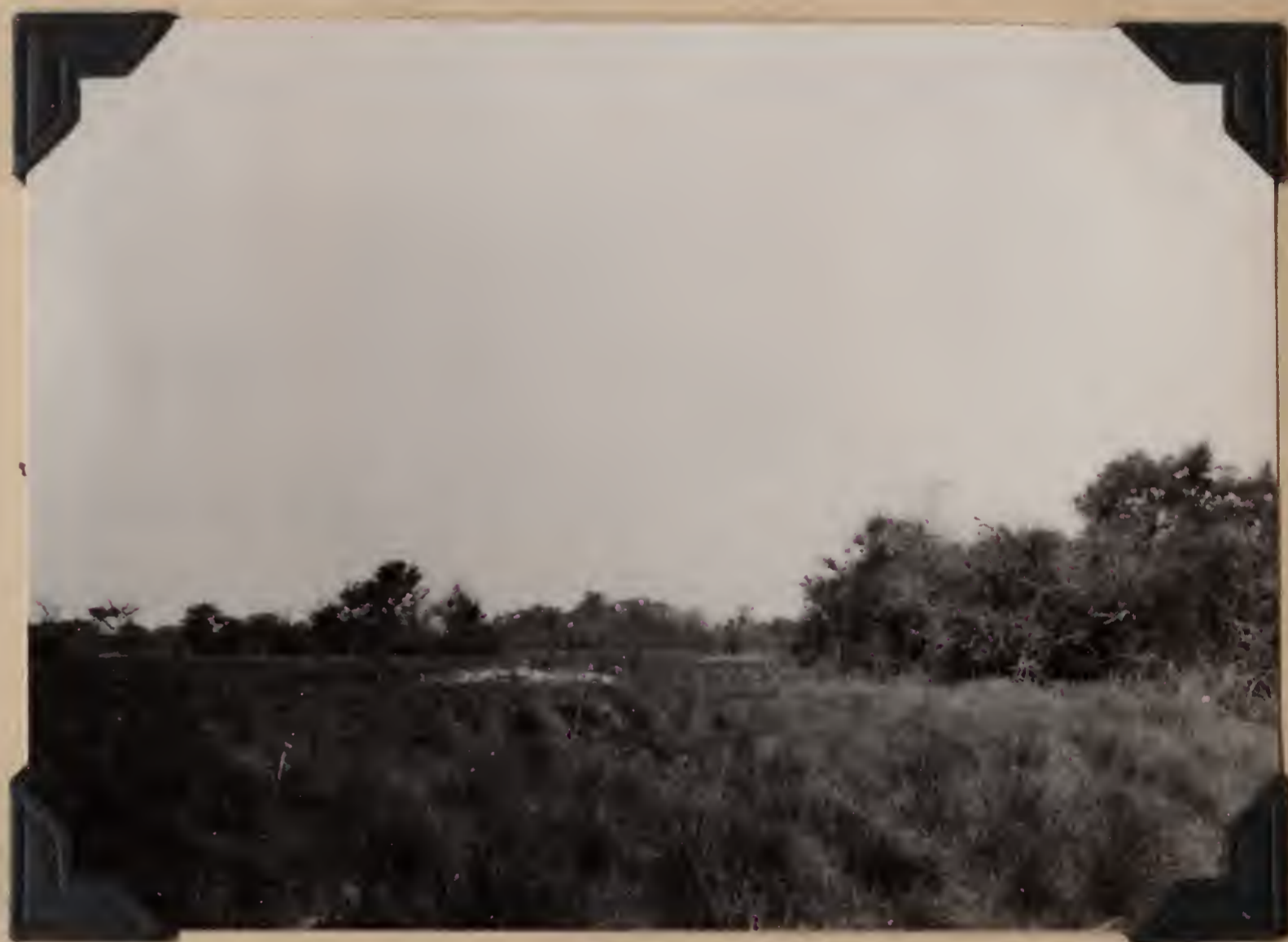
B.S. 22014-1/2. View in open Chaco. Riacho Pilaga, Formosa, Argentina. August 8, 1920.