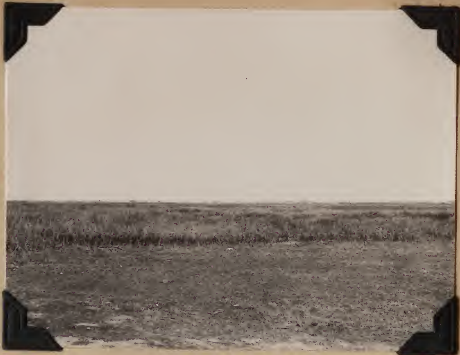
S.I. 36513 C B.S. 22121. Marshes with town, of Dolores in background. Dolores, Buenos Aires, Argentina. October 21, 1920.