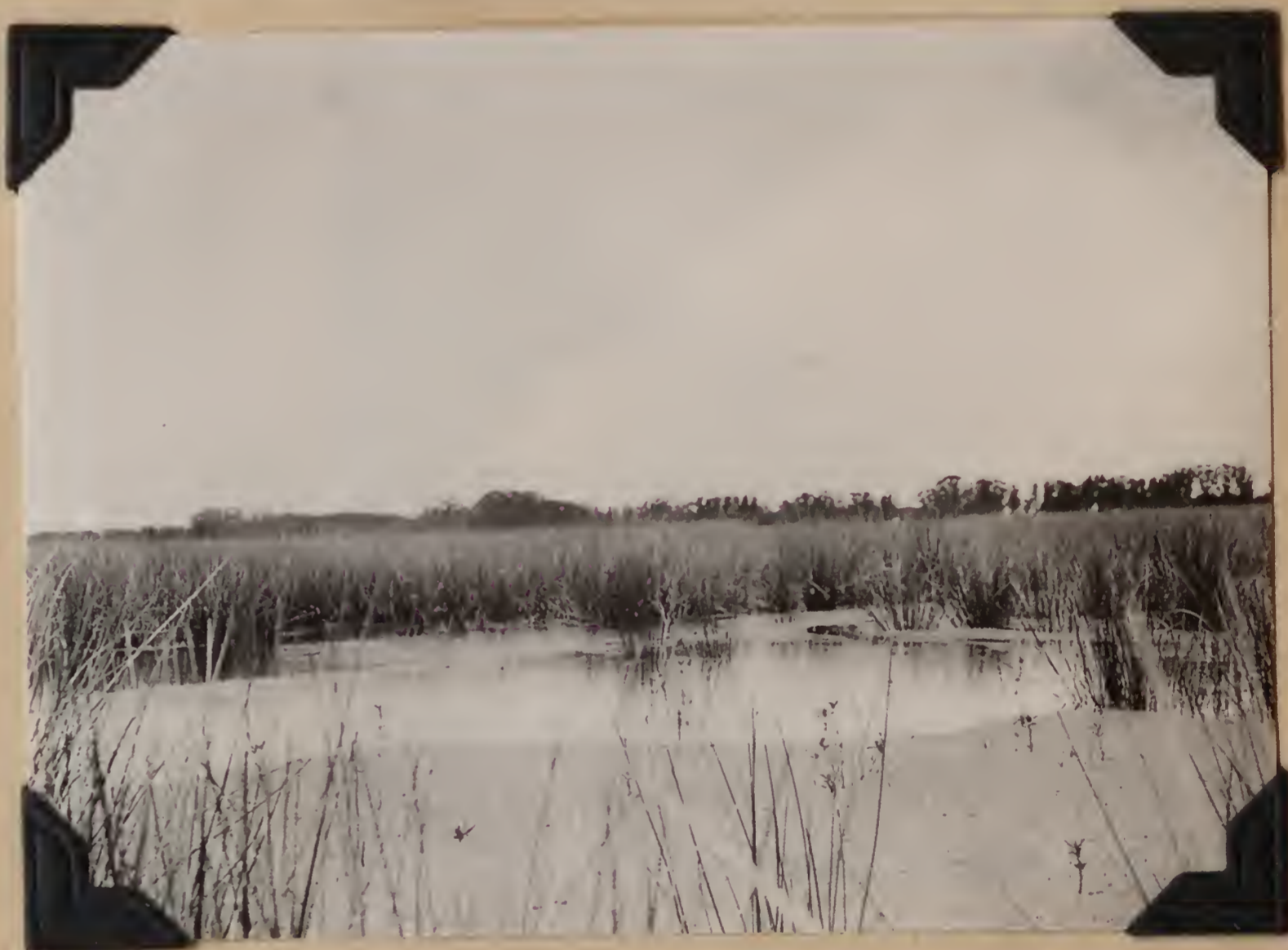
B.S. 22165. View in marsh or cañadon, Estancia Los Ynglesés. Lavalle, Buenos Aires, Argentina. November 10, 1920.