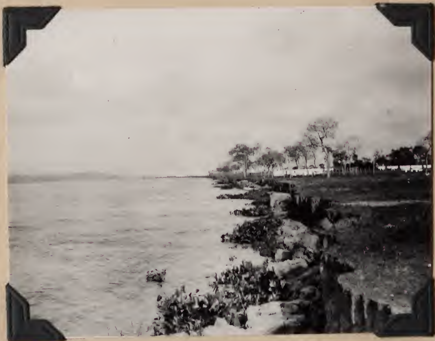
B.S. 22061. Bank of Río Paraguay showing condition of high water with no available shore for sandpipers. Puerto Pinasco, Paraguay. September 3, 1920.