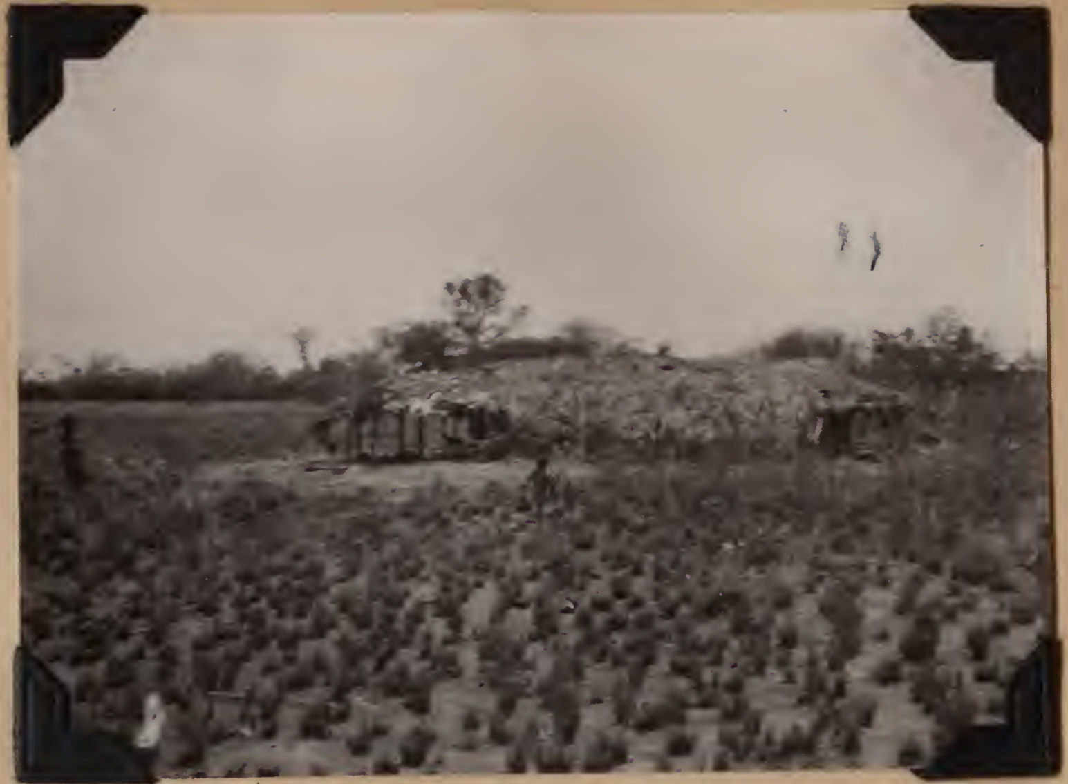
B.S. 22115. Tolda of Angueté Indians near Laguna Lata. Puerto Pinasco, Paraguay. September 26, 1920.