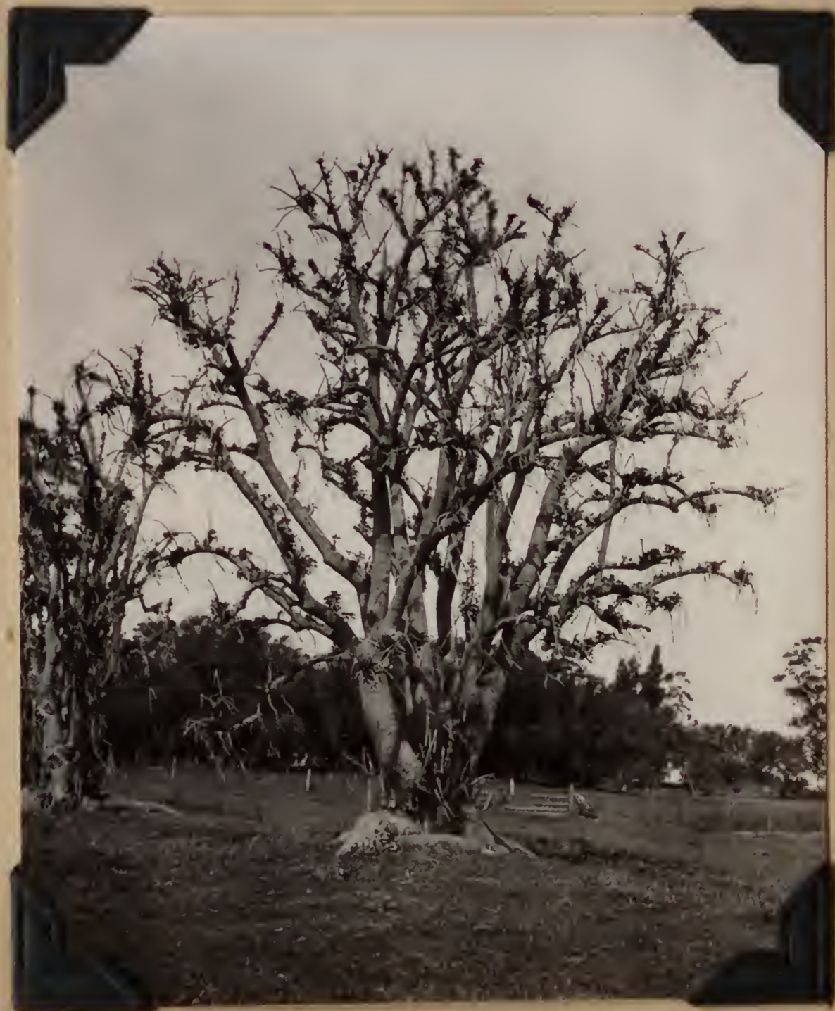
B.S. 22168. Ombú tree. Estancia Los Ynglesés. Lavalle, Buenos Aires, Argentina. November 10, 1920.