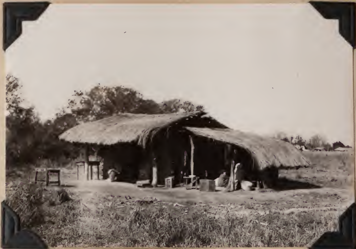
1351. Rancho of partly civilized Toba Indian, Las Palmas, Chaco, Argentina. July 13, 1920.