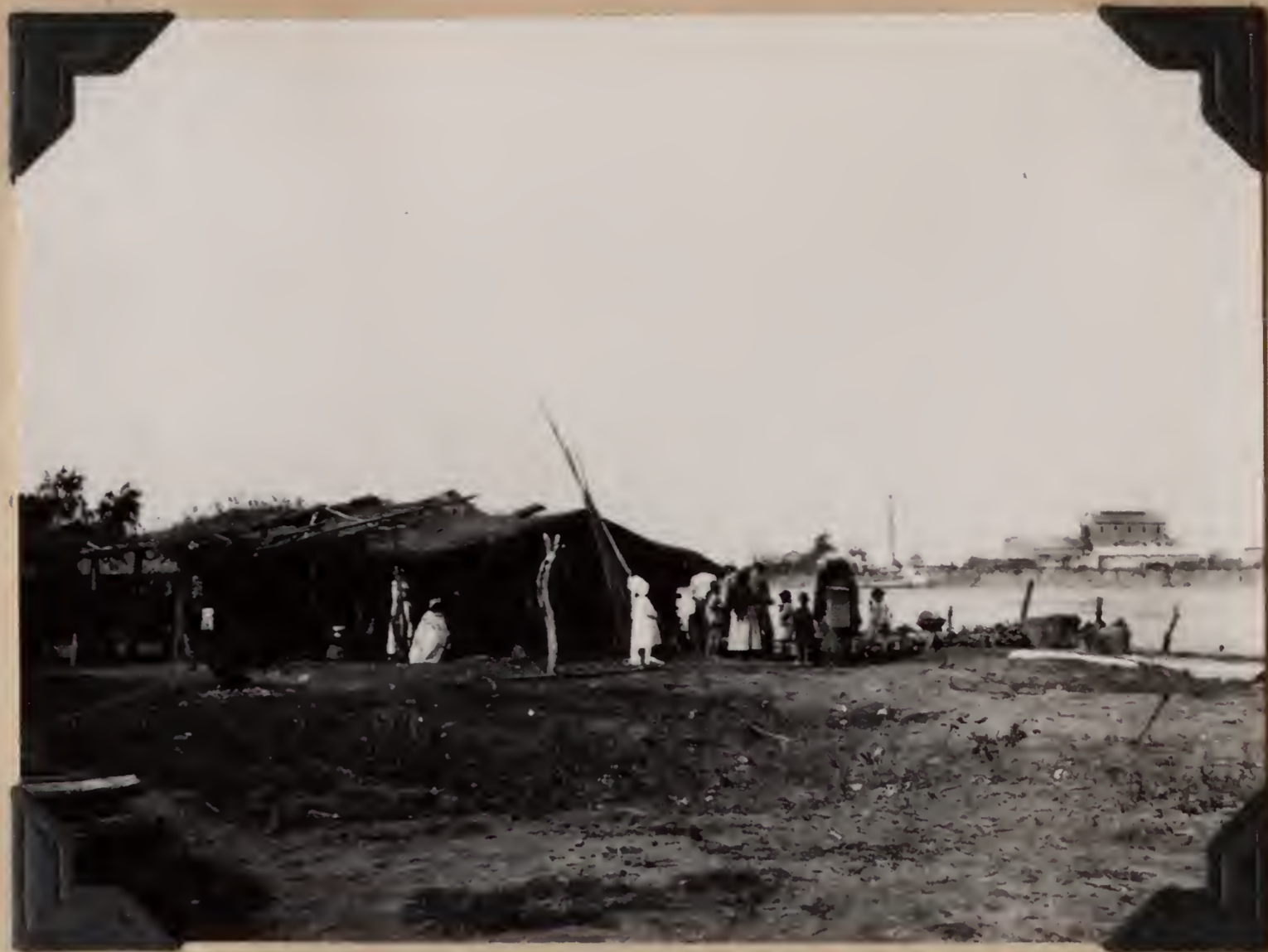
B.S. 22052. Arrival of steamer for Asunción. Alberdi, Paraguay. August 26, 1920.