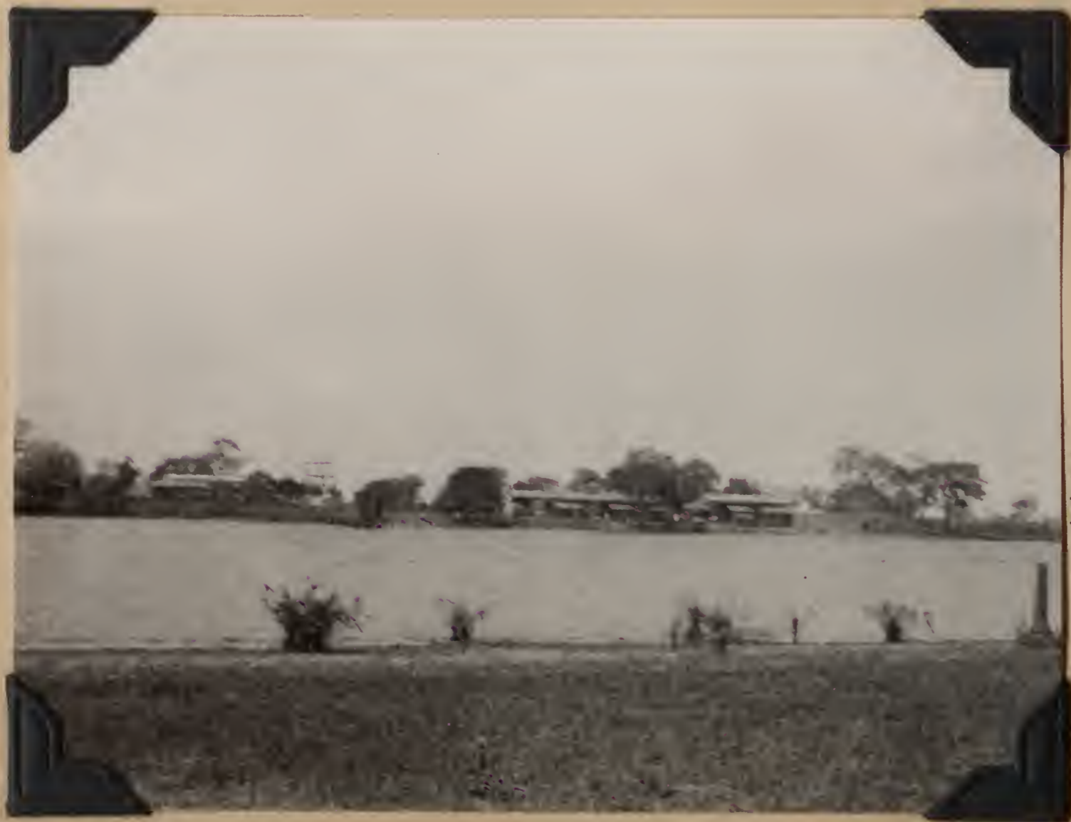
B.S. 22087. View of ranch houses at Kilómetro 80. Puerto Pinasco, Paraguay. September 18, 1920.