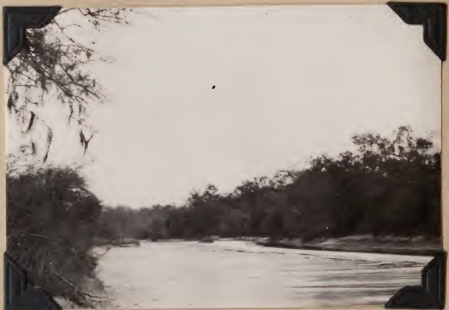
1381. The Riacho Inglés, with alkaline deposits on shore, as seen in the dry season. Riacho Pilaga, Formosa, Argentina. August 18, 1920.