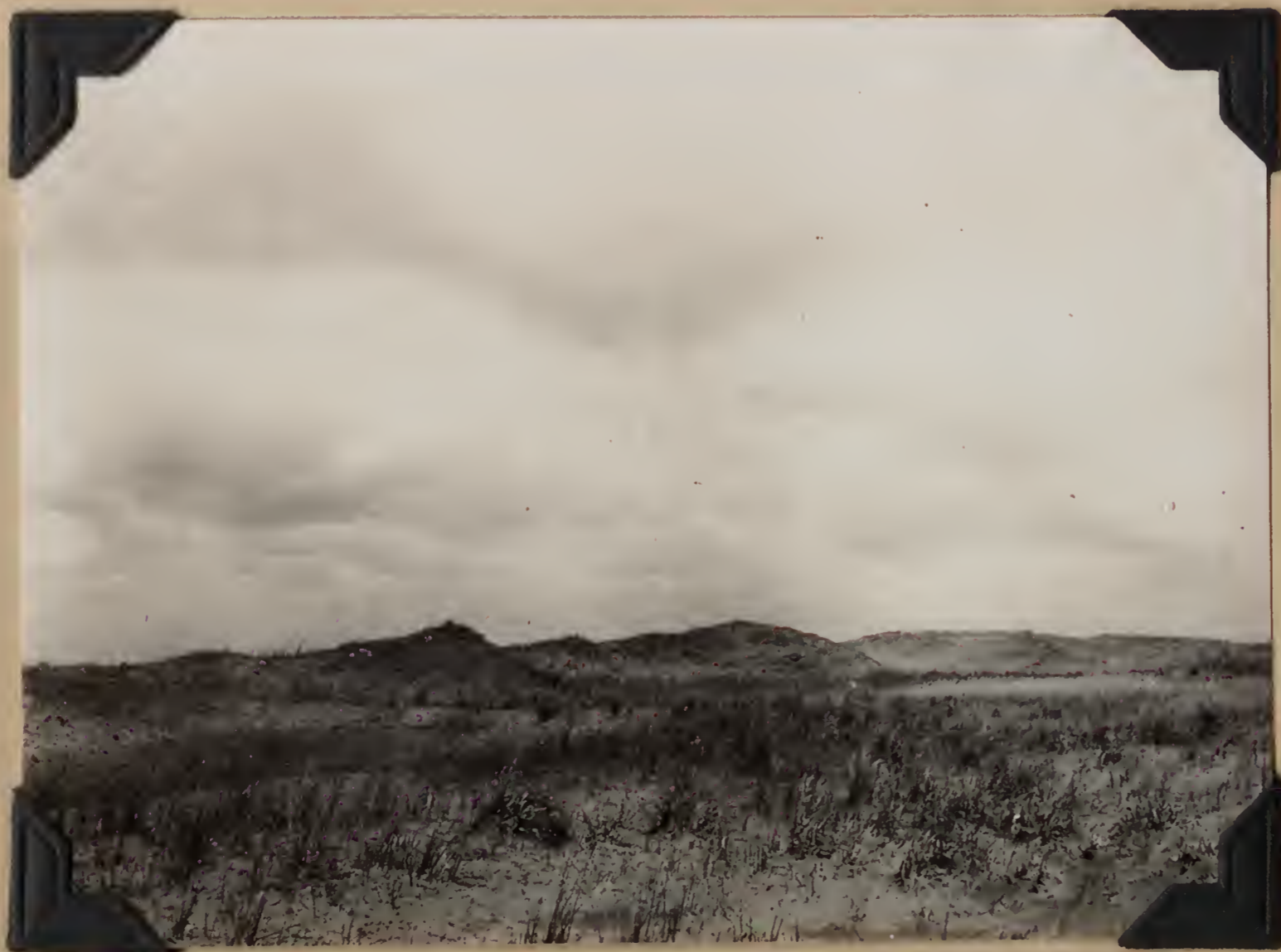
B.S. 22153. Sand dunes 15 miles south of Cabo San Antonio. Lavallo, Buenos Aires, Argentina. November 7, 1920.