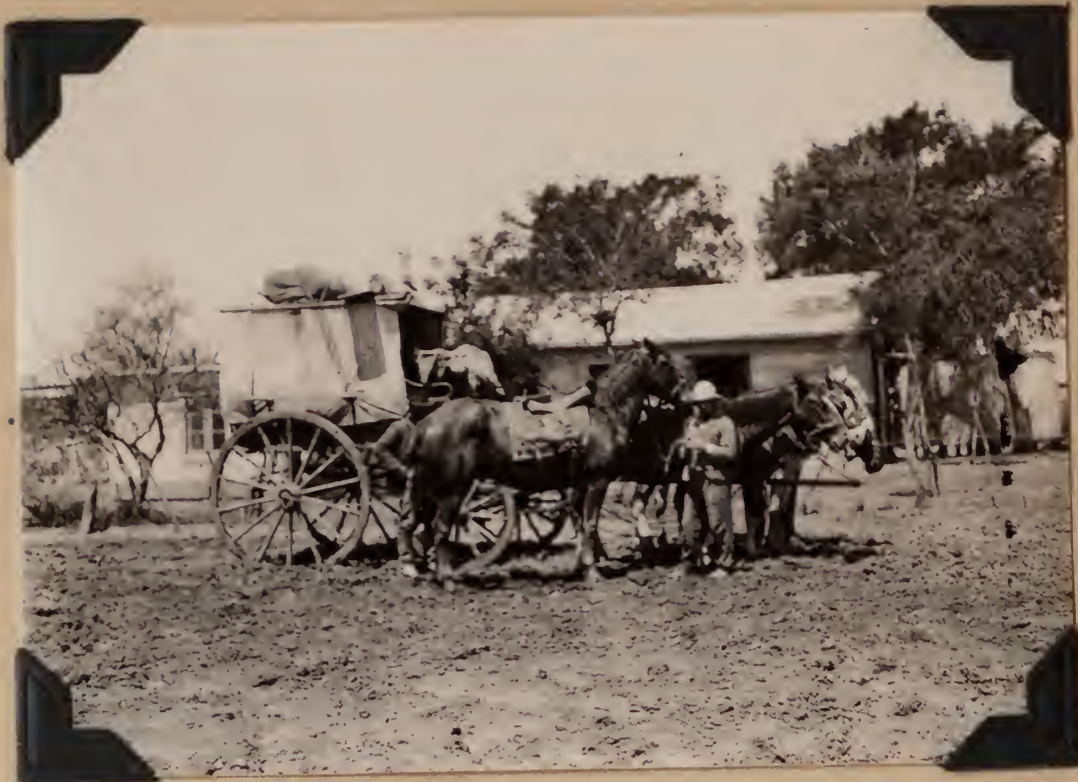
1426. Travel by galera or stage coach between Lavalle and Santo Domingo, Prov. Buenos Aires, Argentina. Nov. 16, 1920