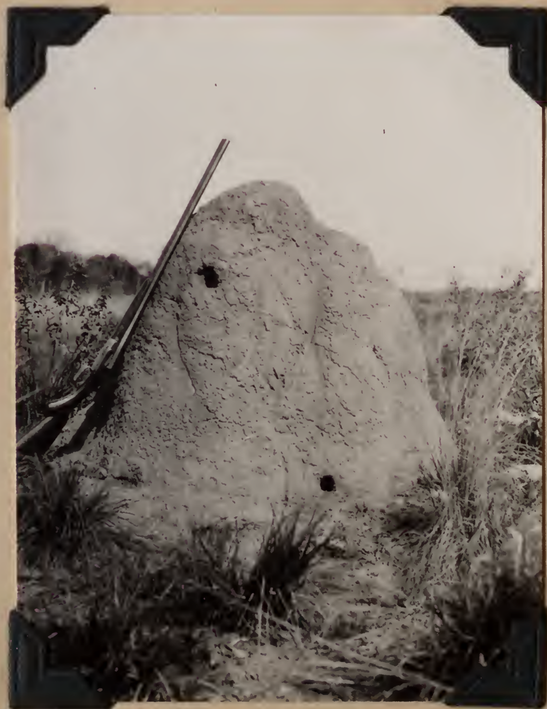
B.S. 21991. A termite hill, opened by flickers. Las Palmas, Chaco, Argentina. July 30, 1920.