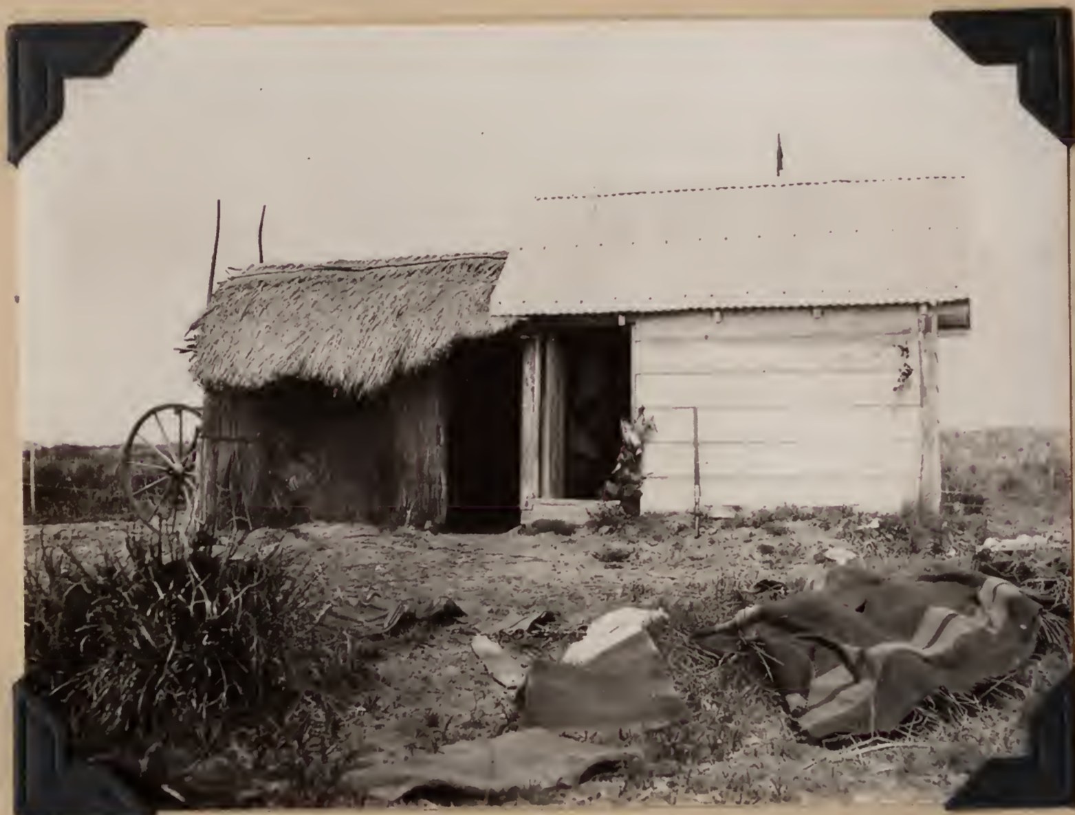
B.S. 22161. Camp in dunes, 15 miles south of Cabo San Antonio. Lavalle, Buenos Aires, Argentina. November 8, 1920.