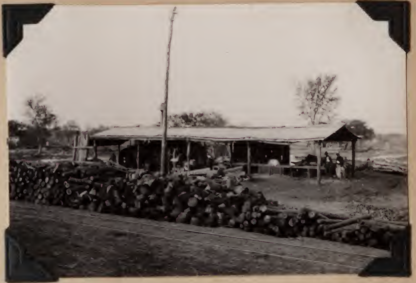
B.S. 21937. Sawmill. Southern Chaco, Argentina. July 5, 1920.