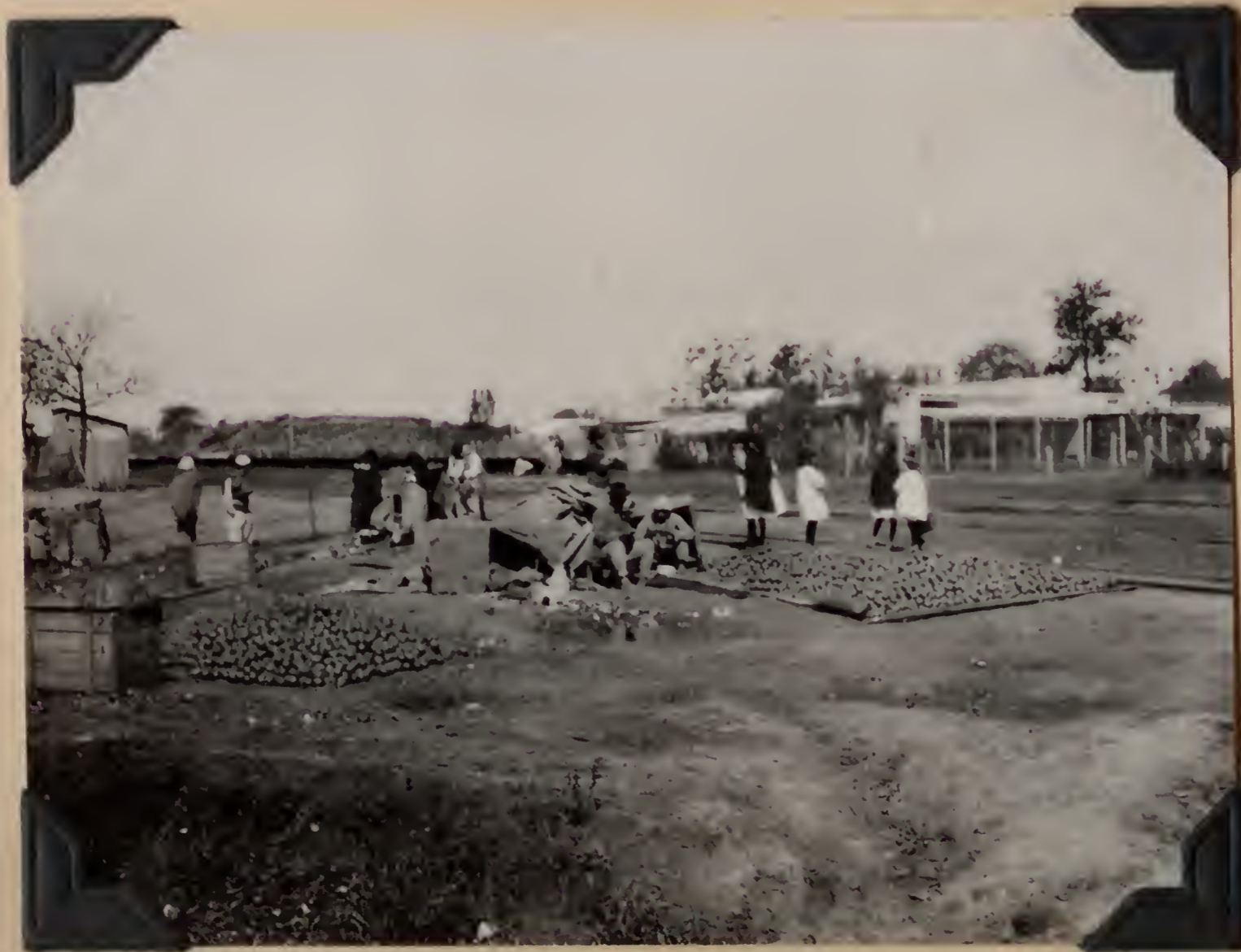
B.S. 22000. Oranges from Paraguay. Puerto Las Palmas, Chaco, Argentina. August 2, 1920.