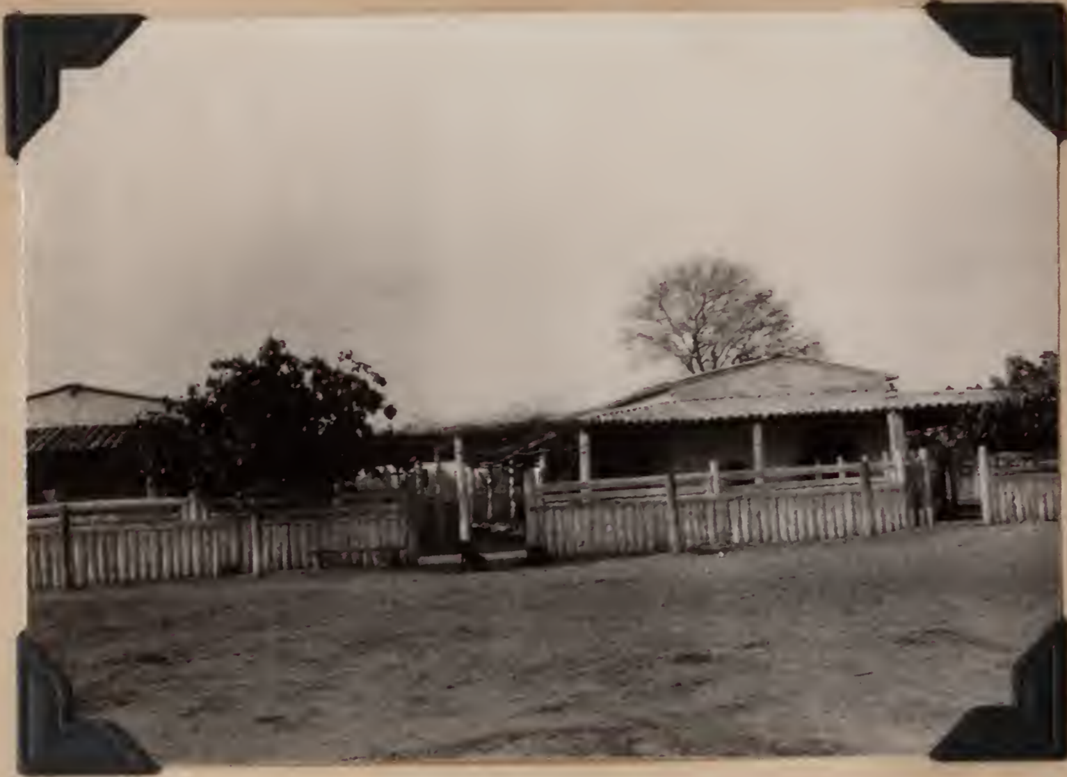
B.S. 22072. Ranch house at Kilómetro 80. Puerto Pinasco, Paraguay. September 14, 1920.