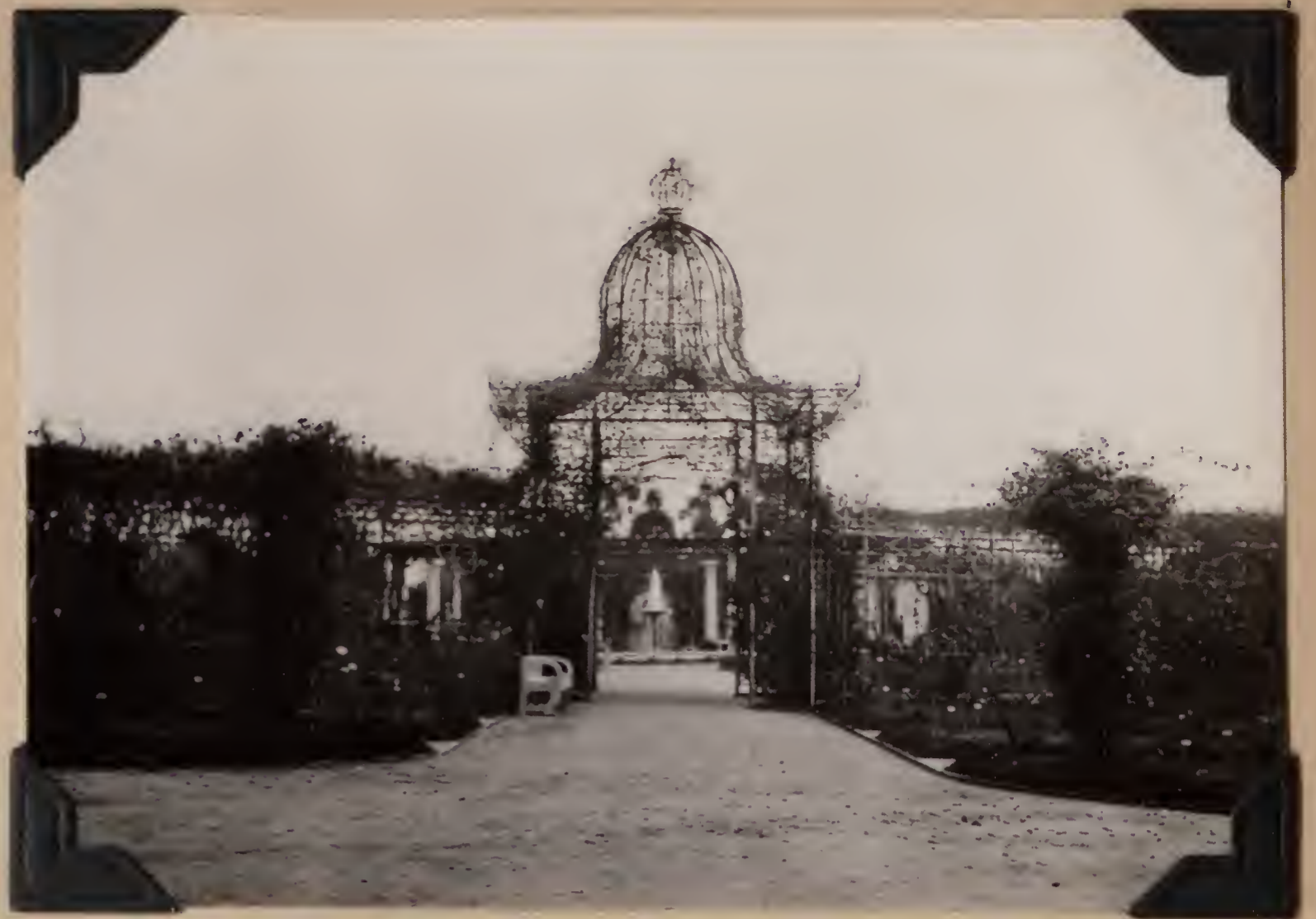
1341. A rose garden in Montevideo, Uruguay. June 20, 1920.