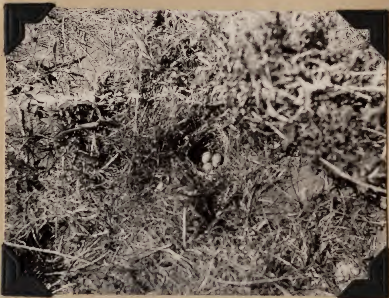
B.S. 22147. Nest and eggs of Brachyospiza capensis argentina . Lavalle, Buenos Aires, Argentina. October 30, 1920.