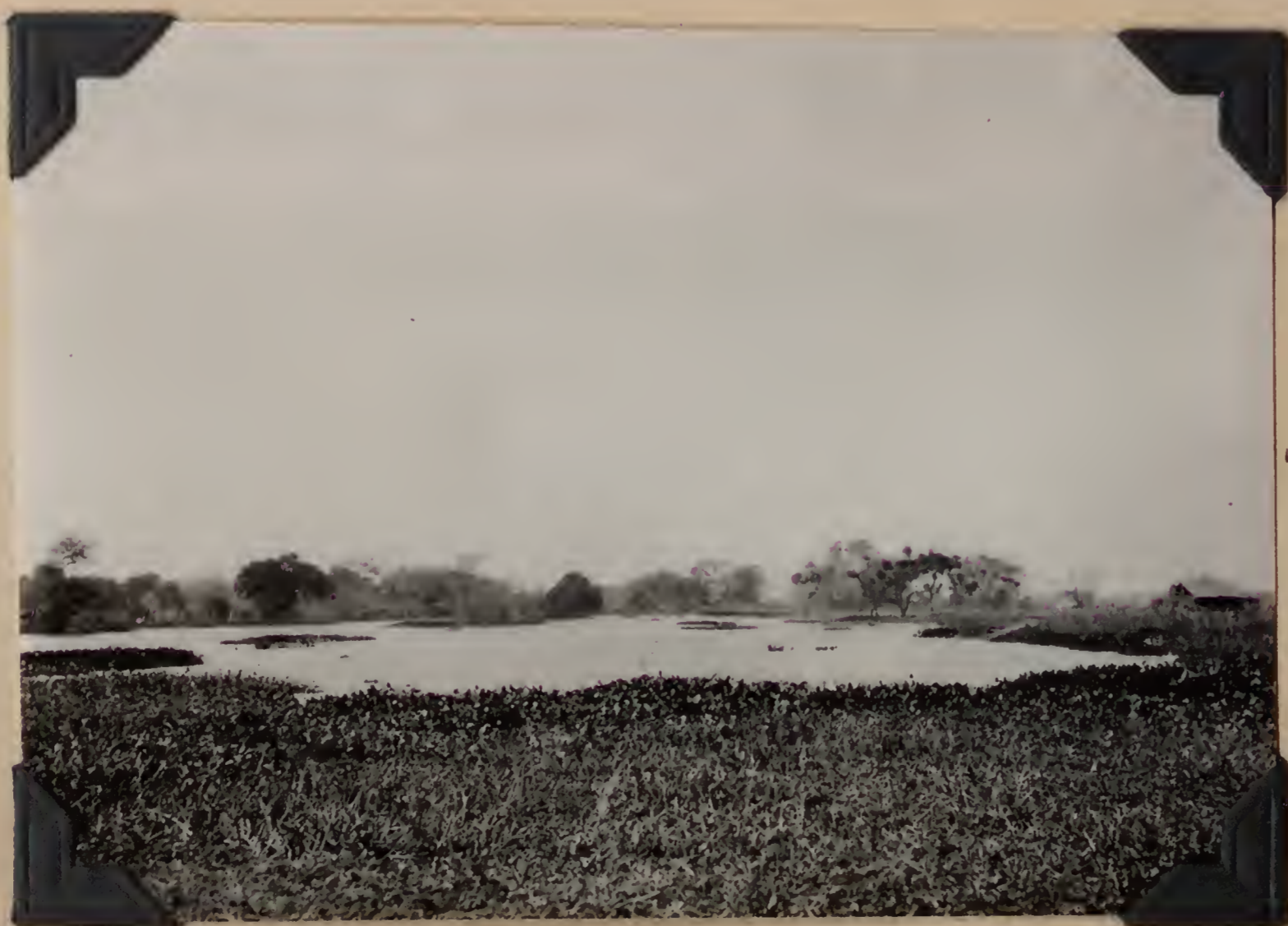
B.S. 22016. Typical lagoon in Chaco with shores clogged by float- ing water hyacinth. Riacho Pilaga, Formosa, Argentina. August 10, 1920.