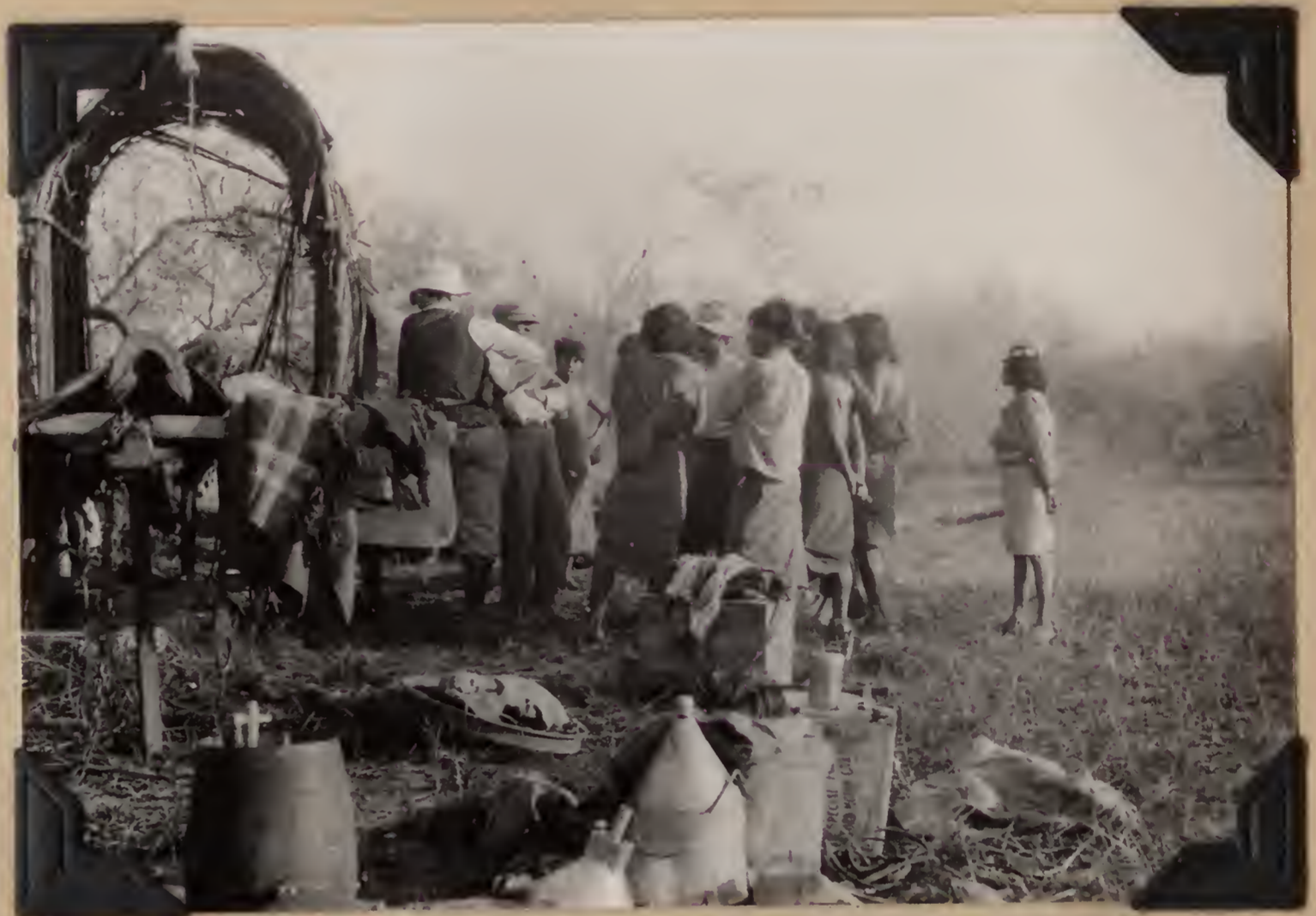
1395. Lengua Indians in our camp at Laguna Wall, Kilómetro 200, west of Puerto Pinasco, Paraguay.