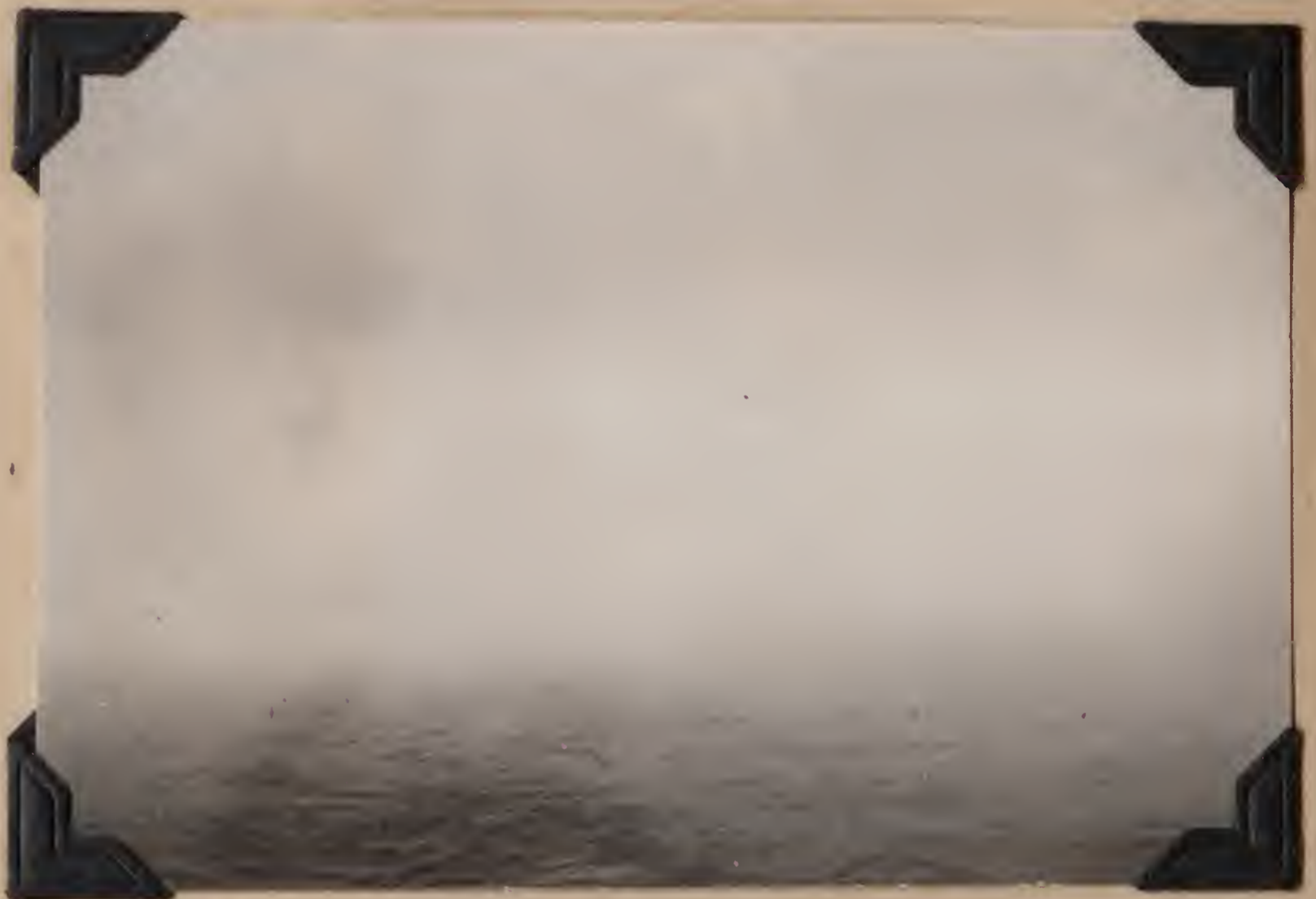
B.S. 21929. Procellaria aequinoctialis over wake of steamer. At sea, off southern Brazil. June 19, 1920.