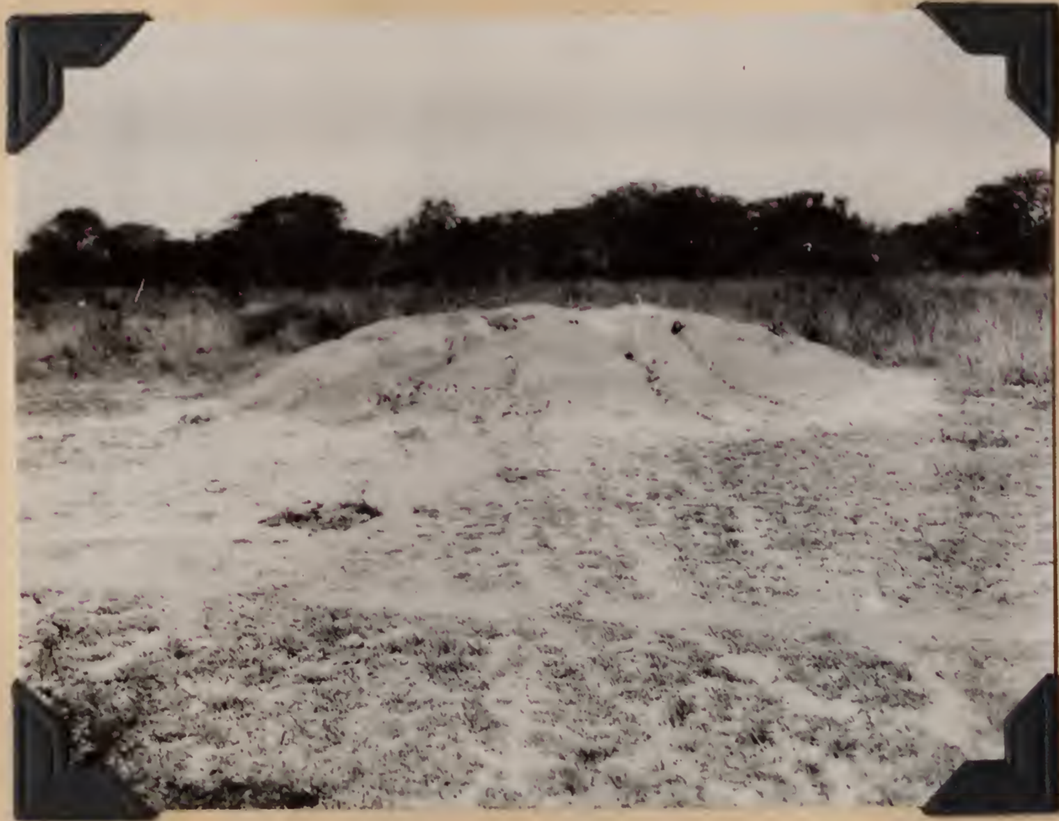
B.S. 21954. Large ant's nest. Las Palmas, Chaco, Argentina. July 13, 1920.