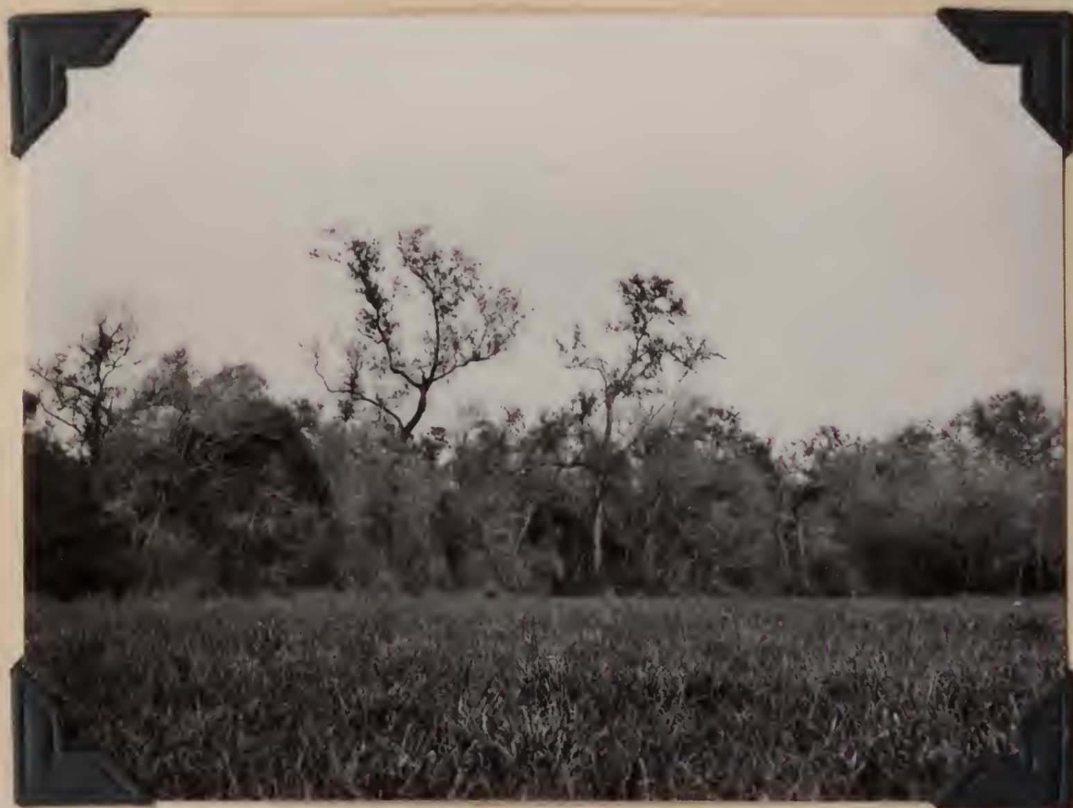
B.S. 22012. Border of forest. Riacho Pilaga, Formosa, Argentina. August 8, 1920.