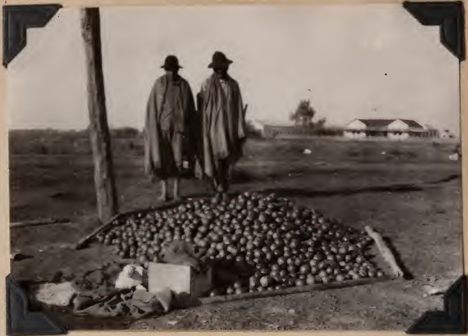
B.S. 21985. Orange market. Las Palmas, Chaco, Argentina. July 29, 1920.