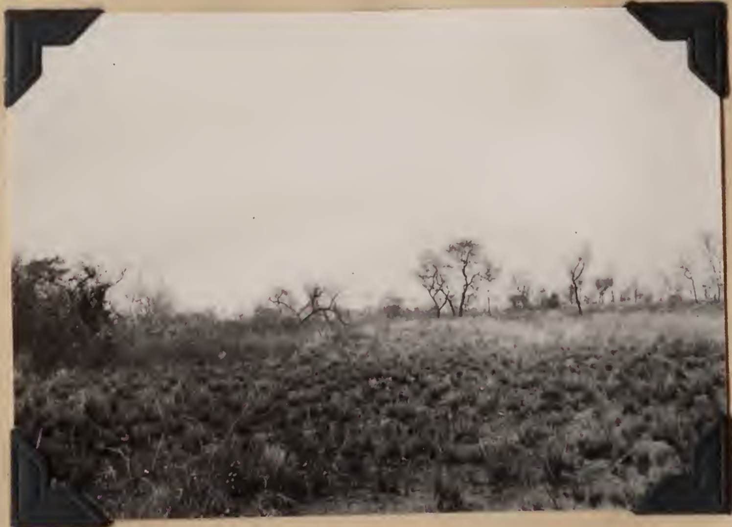
B.S. 22097. Open country with soil of dry sandy loam near Riacho Salado, Kilómetro 170. Puerto Pinasco, Paraguay.