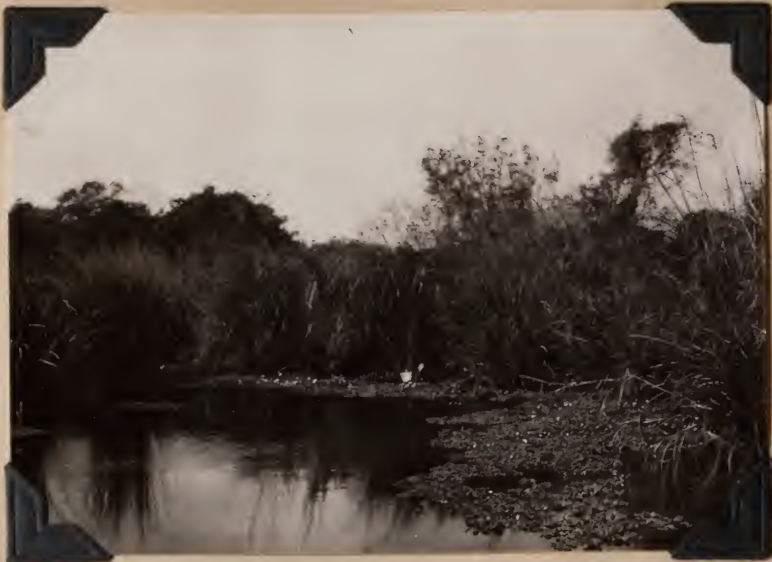
B.S. 21942. Lagoon with vegetation covering entire shore- line. Resistencia, Chaco, Argentina. July 8, 1920.