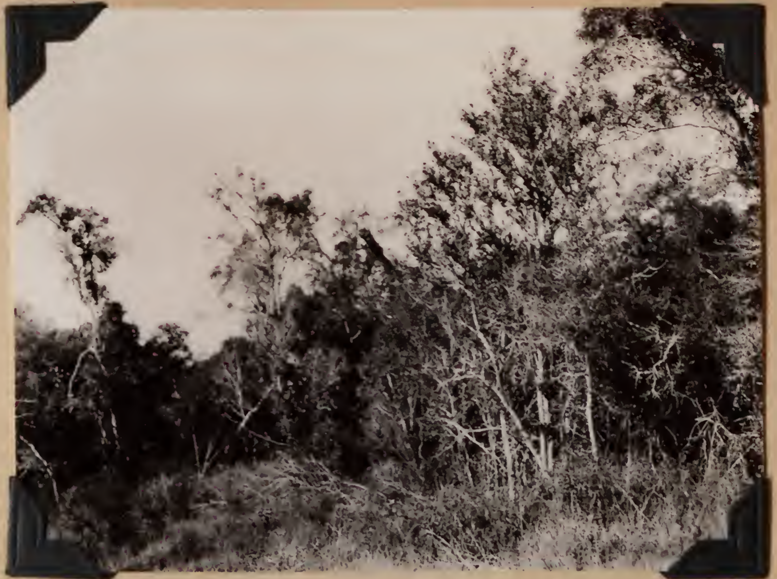
B.S. 21953. Scrub forest. Las Palmas, Chaco, Argentina. July 13, 1920.