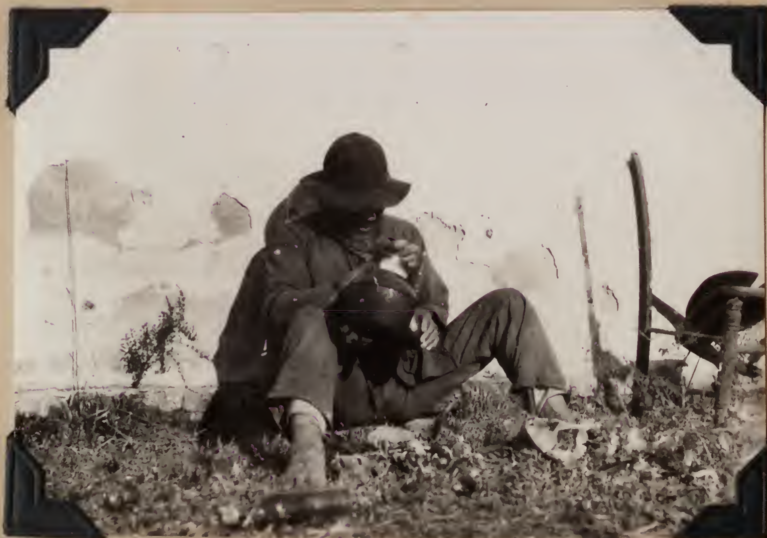
1364. An elderly Toba takes his yerba mate. Las Palmas, Chaco, Argentina. July 29, 1920.