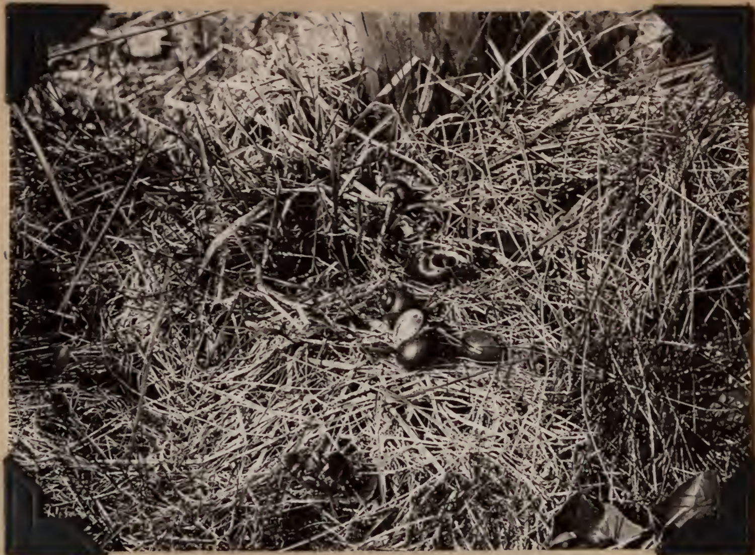
B.S. 22138. Shells of Ampullaria dropped at base of post by everglade kite. Lavalle, Buenos Aires, Argentina. October 29, 1920.