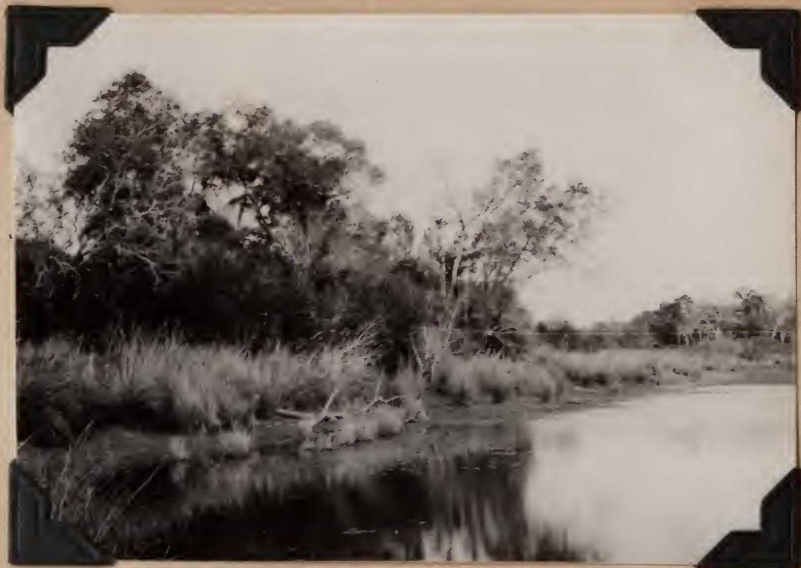
B.S. 21989. Bordering fringe of saw grass on an estero. Las Palmas, Chaco, Argentina. July 30, 1920.