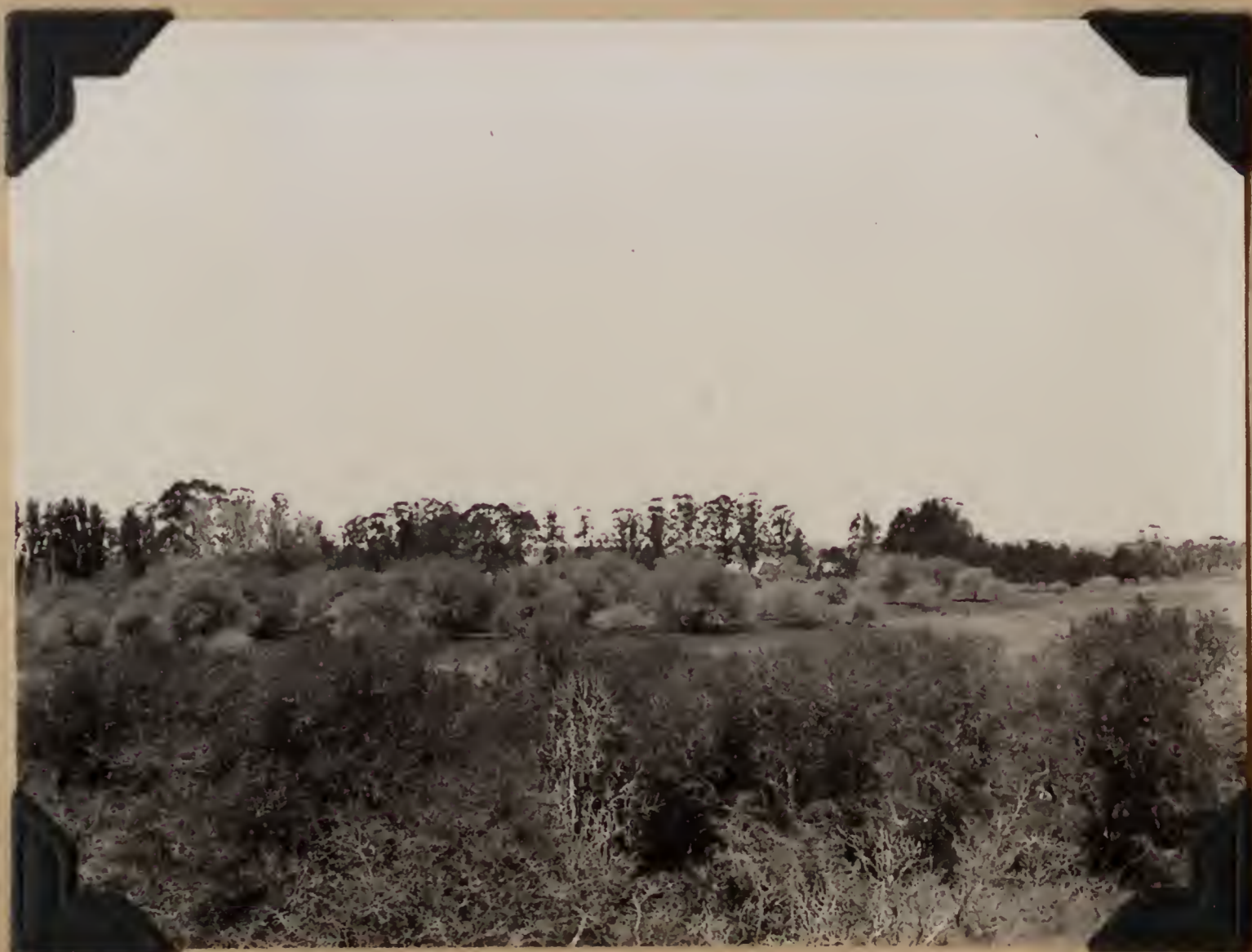
B.S. 22145. View of tala woods and Estancia Los Ynglésés. Lavalle, Buenos Aires, Argentina. October 30, 1920.