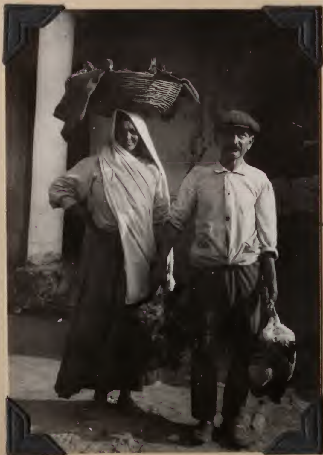
1384. Chicken vendors. Formosa, Formosa, Argentina. August 26, 1920.