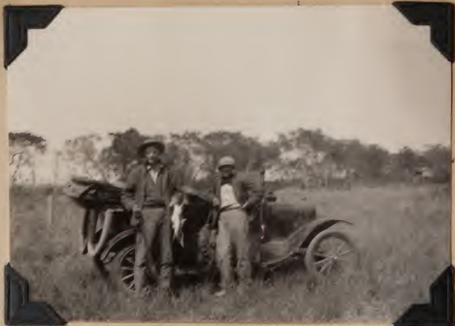
1392. A. Wetmore and Paraguayan boy near the Riacho Salado. Kilómetro 170, west of Puerto Pinasco Paraguay. September 24, 1920.