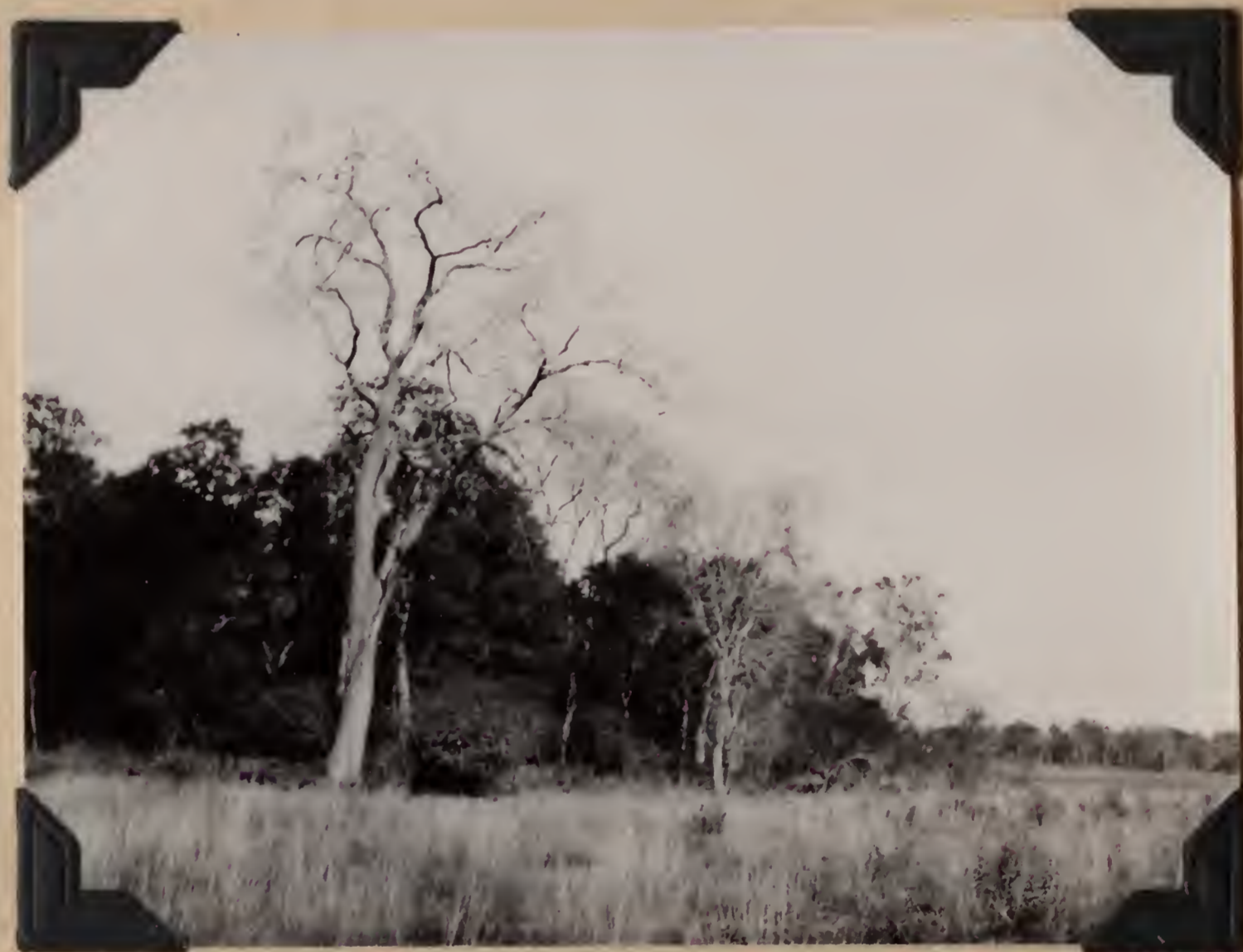
B.S. 21967. Border of grove on open savanna. Las Palmas, Chaco, Argentina. July 19, 1920.