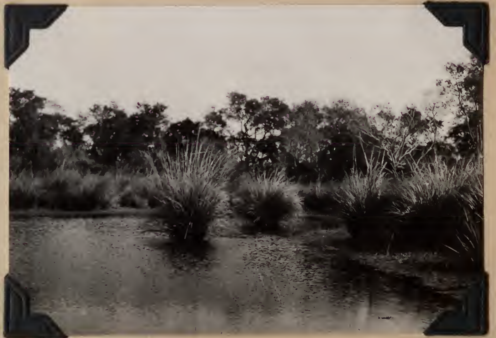
B.S. 21941. Partly dry lagoon bordered by saw grass with somewhat open margins. Resistencia, Chaco, Argentina. July 8, 1920.