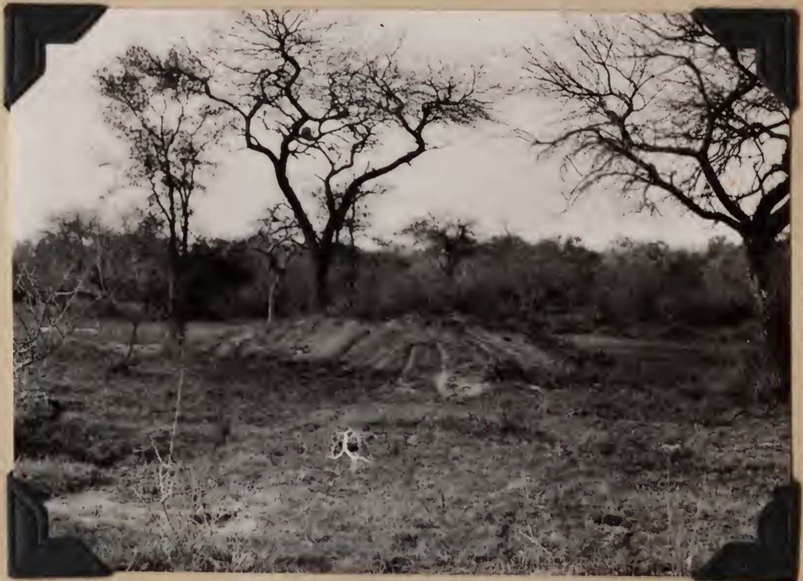
B.S. 21987. Large ant hill. Las Palmas, Chaco, Argentina. July 30, 1920.