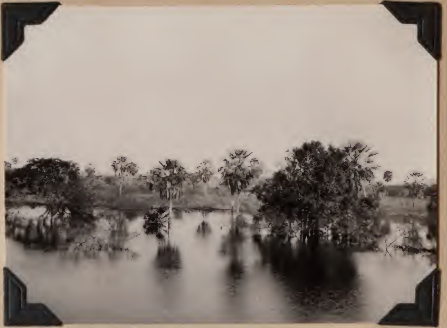
S.I. 36513E B.S. 22042. View in one of the palm grown swamps known as a palmar. Formosa, Formosa, Argentina. August 23, 1920.