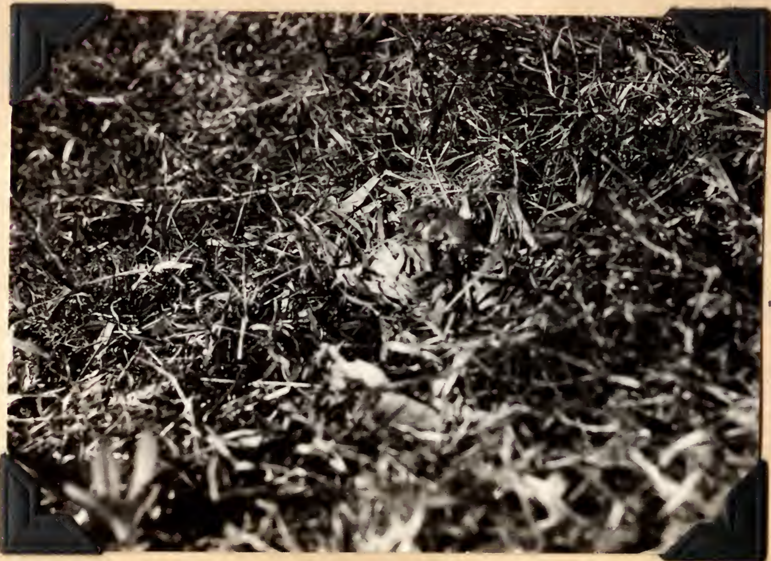
B.S. 21951. Small opossum. Las Palmas, Chaco, Argentina. July 13, 1920.