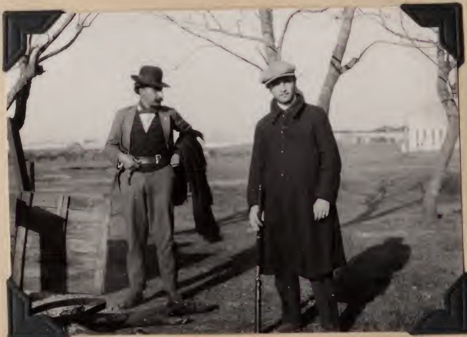
1363. Guards at the factory during a strike. Las Palmas, Chaco, Argentina. July 29, 1920.