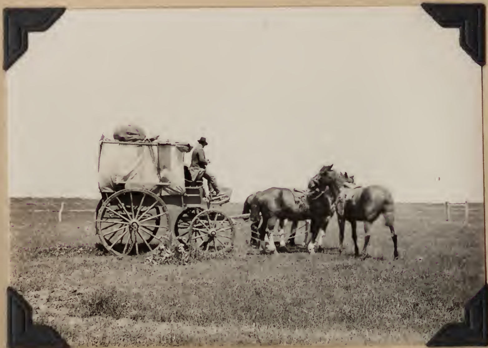
1425. Travel in galera or stage coach between Lavalle and Santo Domingo, Prov. Buenos Aires, Argentina. November 16, 1920.