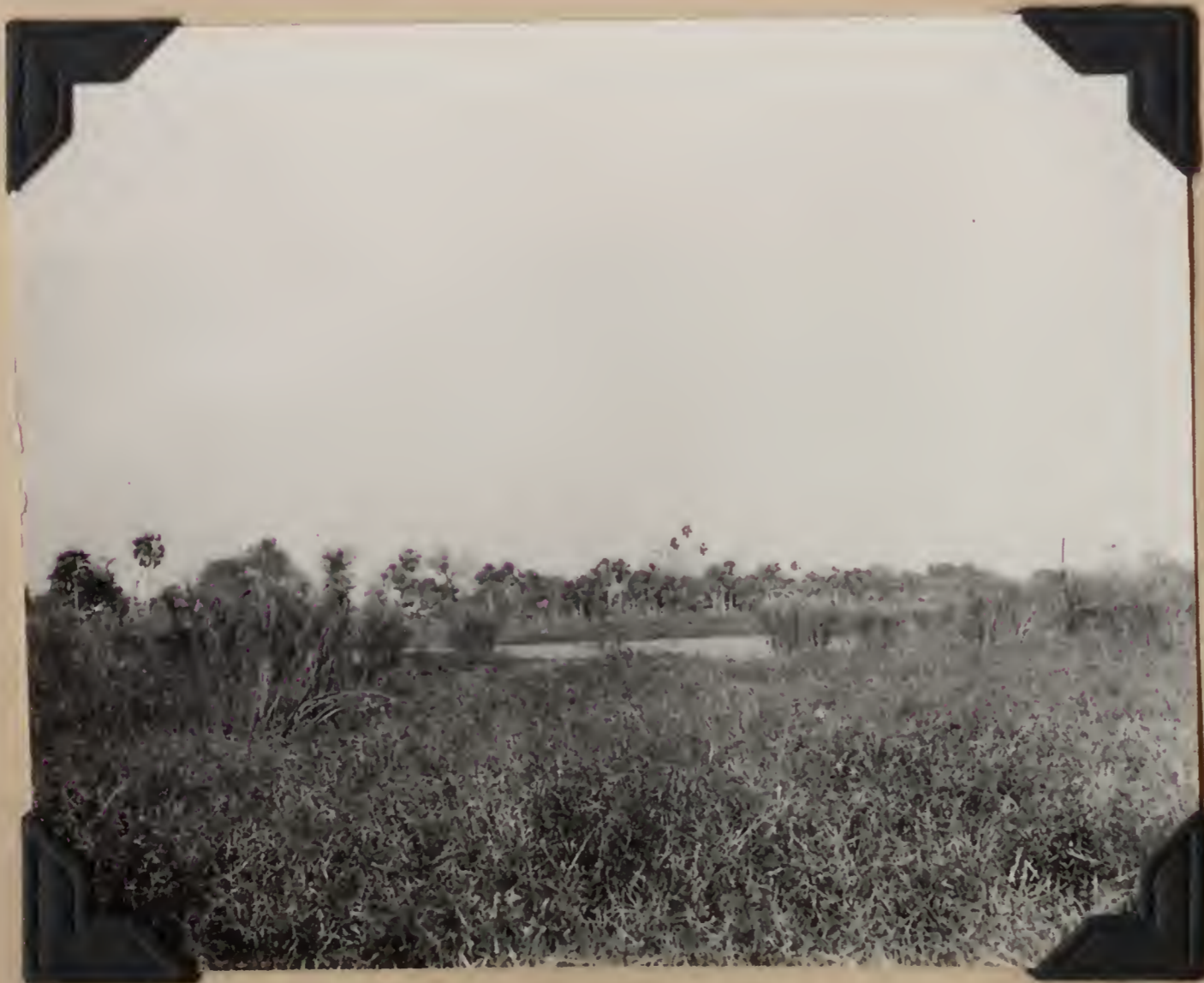
B.S. 22066. Laguna Palmas, Kilómetro 80, Puerto Pinasco, Paraguay. September 10, 1920.