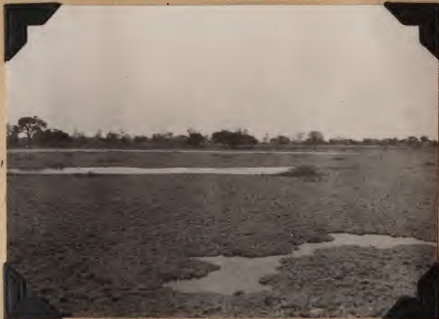
B.S. 22076. Lagoon filled with floating vegetation, Kilómetro 80. Puerto Pinasco, Paraguay. September 15, 1920.