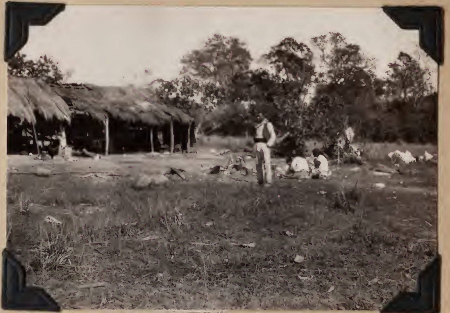
1357. A Toba Indian family near Las Palmas, Chaco, Argentina. July 23, 1920.