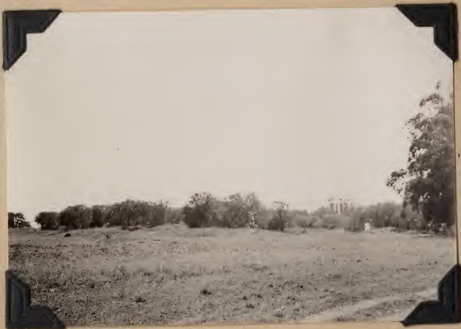
1415. Old dunes grown with vegetation. Estancia Los Ynglésés, Lavalle, Buenos Aires, Argentina. October 30, 1920.