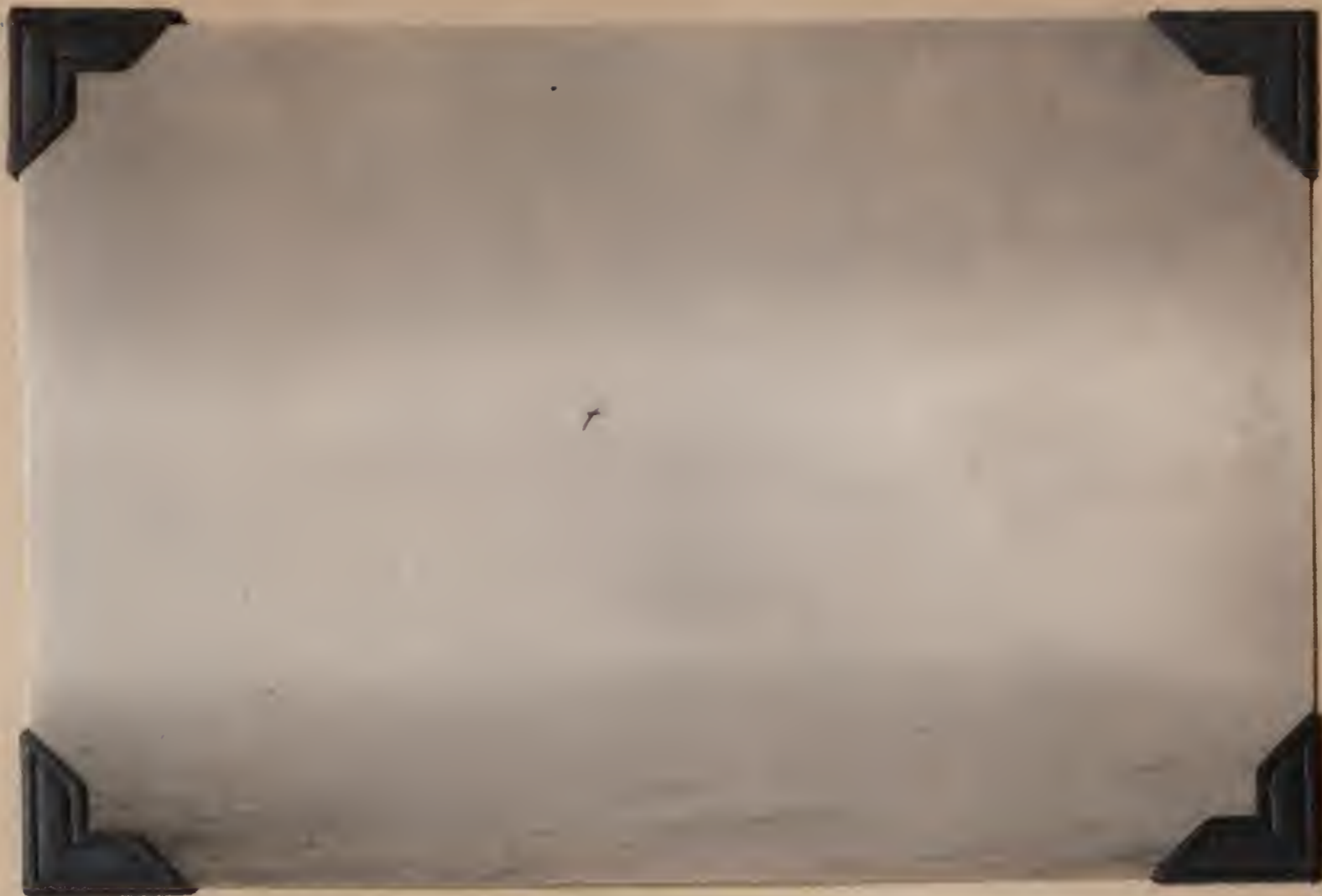
1337. Procellaria aequinoctialis over wake of steamer. At sea off southern Brazil. June 19, 1920.