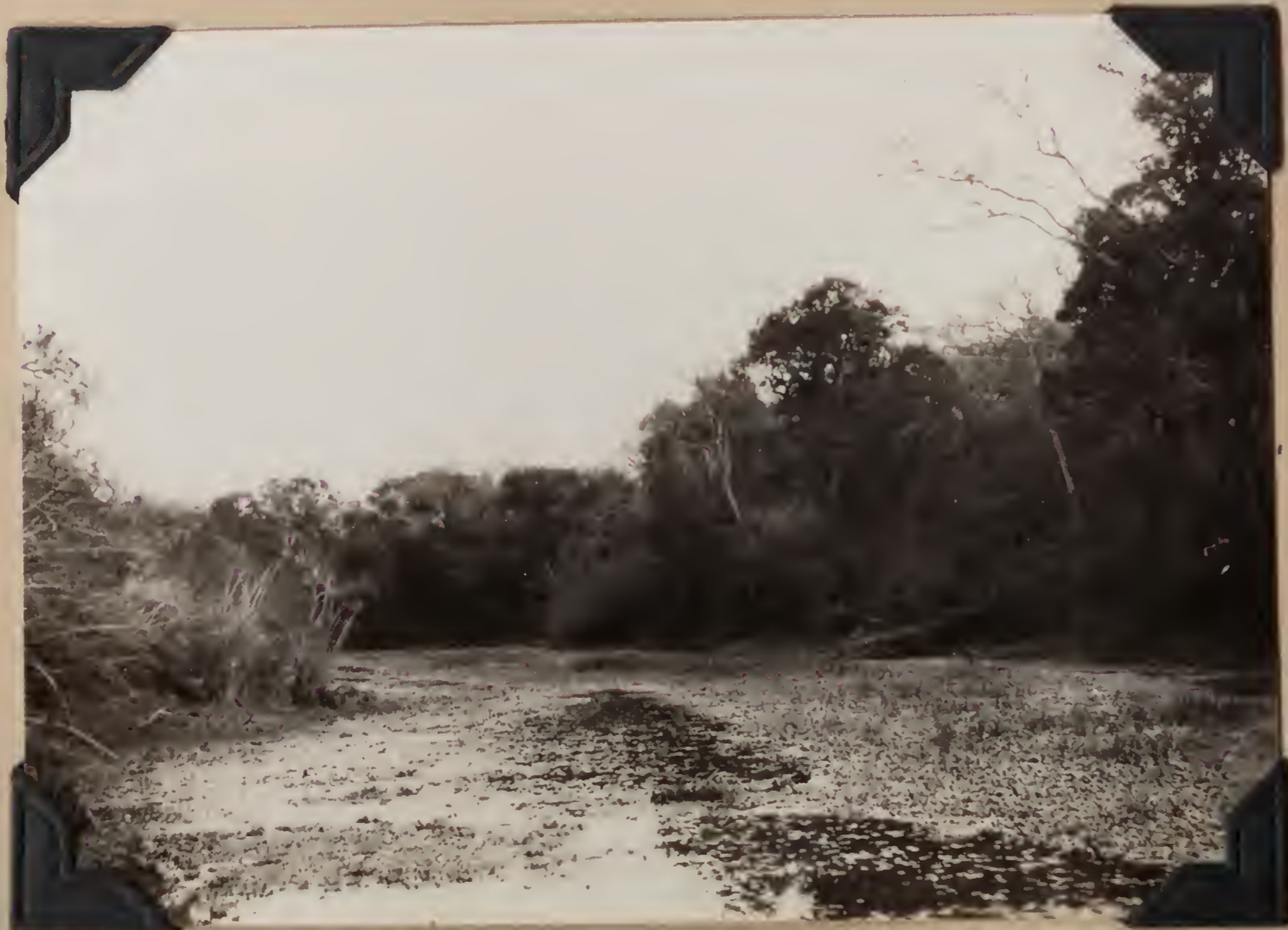
1365. An old river channel (an ox-bow loop) bordered by forest. Haunt of Jacanas. Las Palmas, Chaco, Argentina. July 30, 1920.