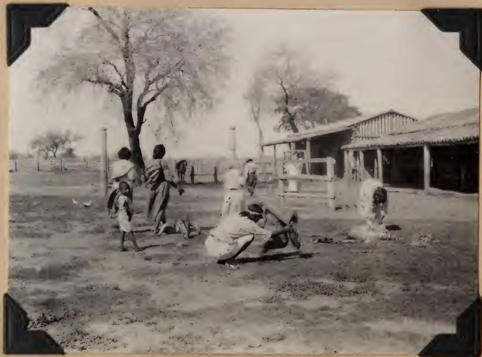
B.S. 22071. Angueté Indians gathering offal from a butchered cow. Kilómetro 80. Puerto Pinasco, Paraguay. September 14, 1920.