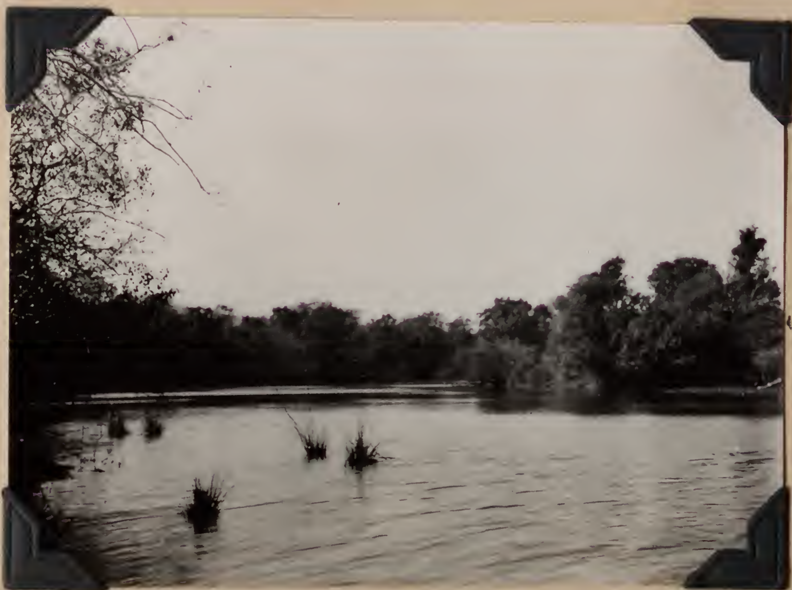
B.S. 21944. The Río Negro, a typical sluggish stream, near the Río Paraguay. Resistencia, Chaco Argentina. July 8, 1920.