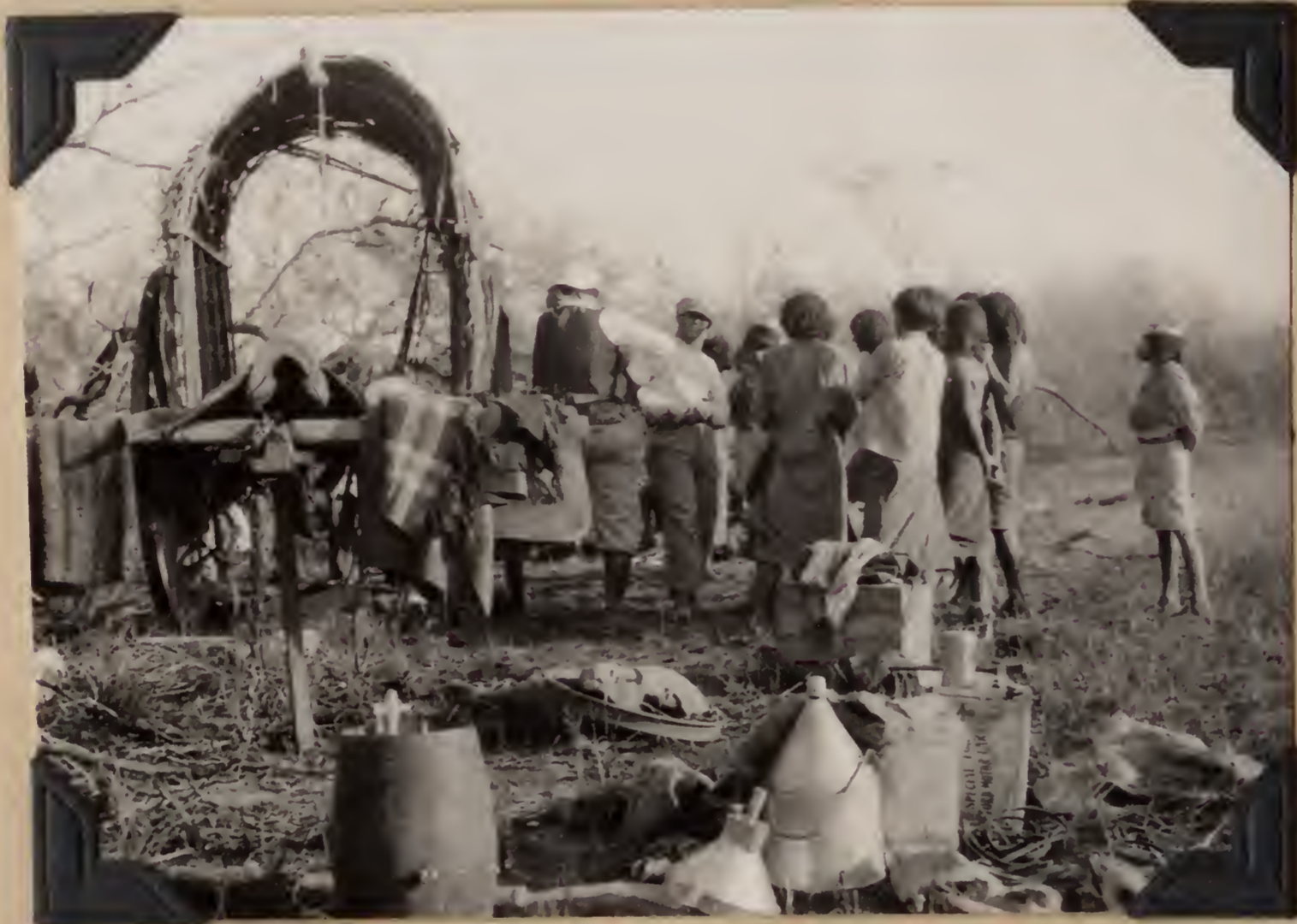
1396. Carl Hettman talking to Lengua Indians in our camp at Laguna Wall. Kilómetro 200, west of Puerto Pinasco, Paraguay. September 25, 1920.