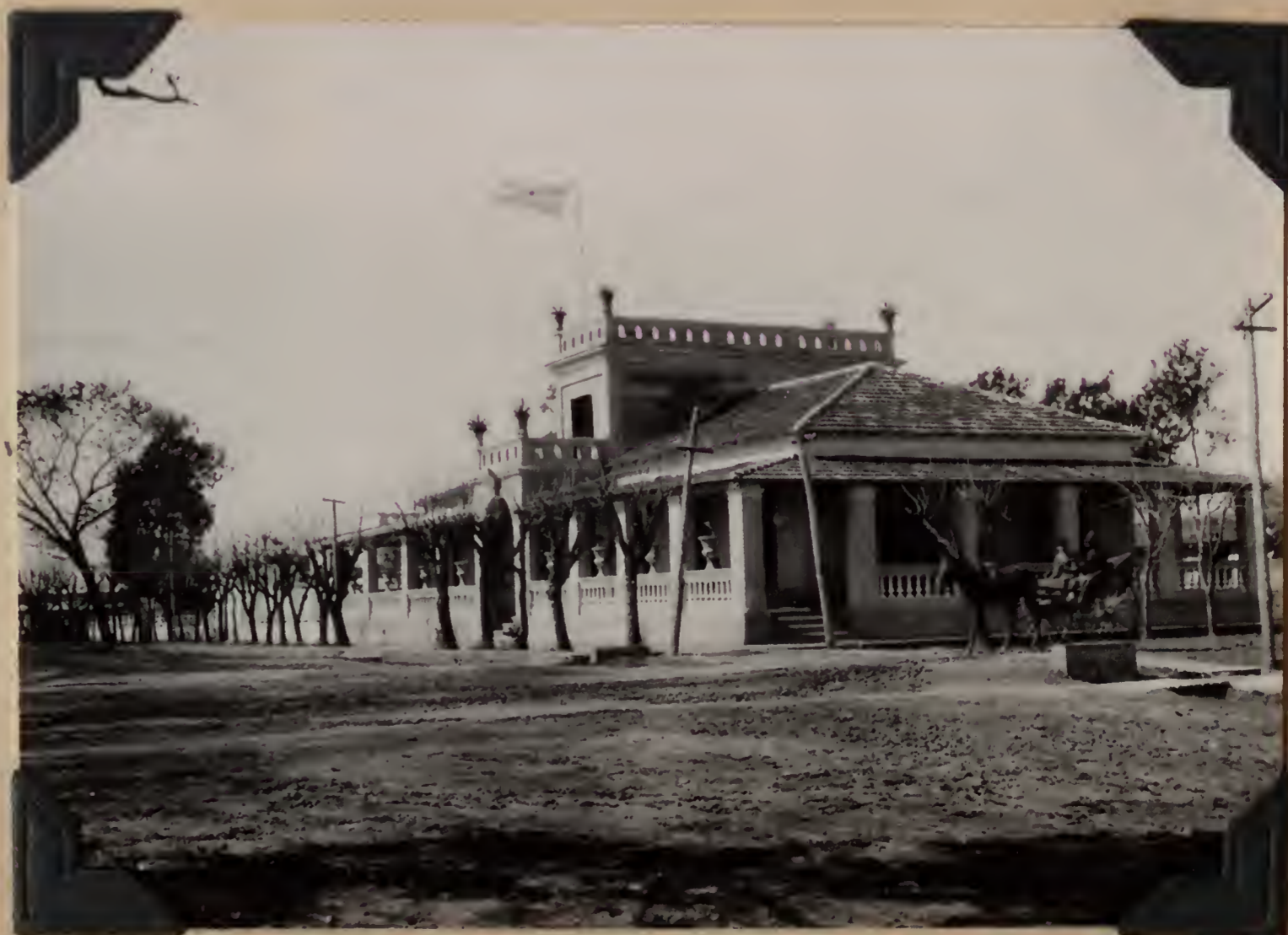
B.S. 22006. Residence and offices of Governor of Formosa. Formosa, Formosa, Argentina. August 4, 1920.