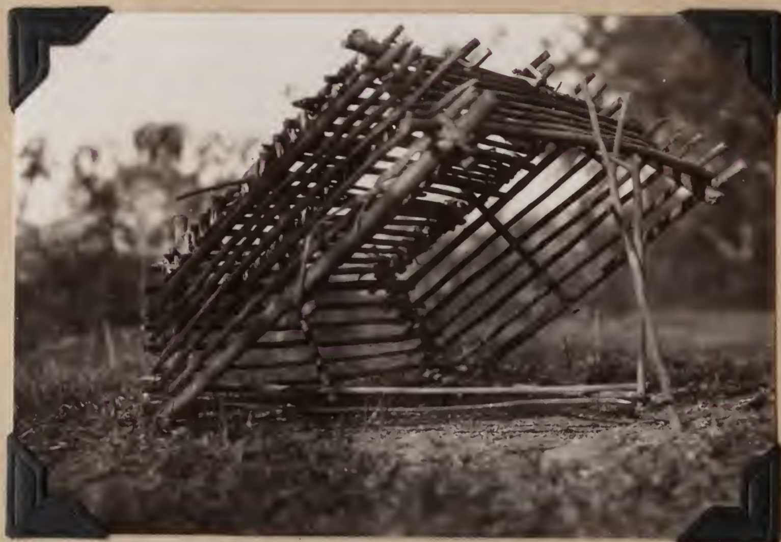
1383. Near view of bird trap to show arrangement of set. Formosa, Formosa, Argentina. August 24, 1920.