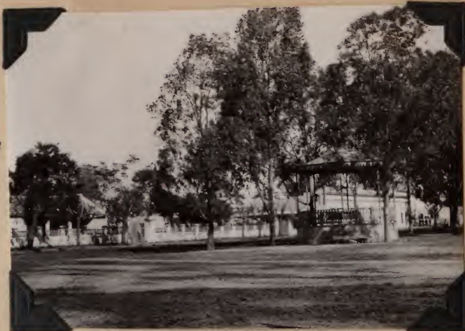
1370. On the avenida de Majo, Formosa, Formosa, Argentina. August 4, 1920.