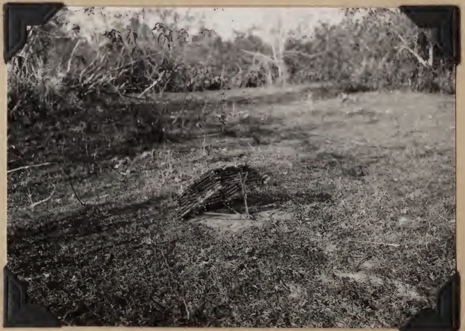
B.S. 22044. A native bird trap set for seed-eaters. Formosa, Formosa, Argentina. August 24, 1920.