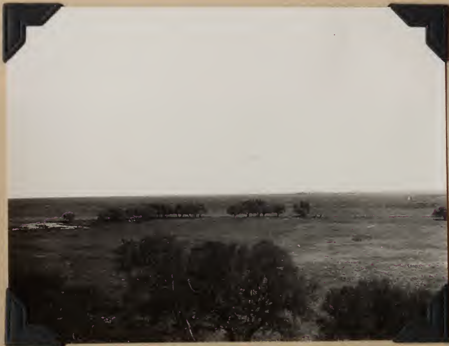
S.I. 36513J B.S. 22148. View across pampa from mirador at Estancia Los Ynglesés. Lavalle, Buenos Aires, Argentina. October 30, 1920.