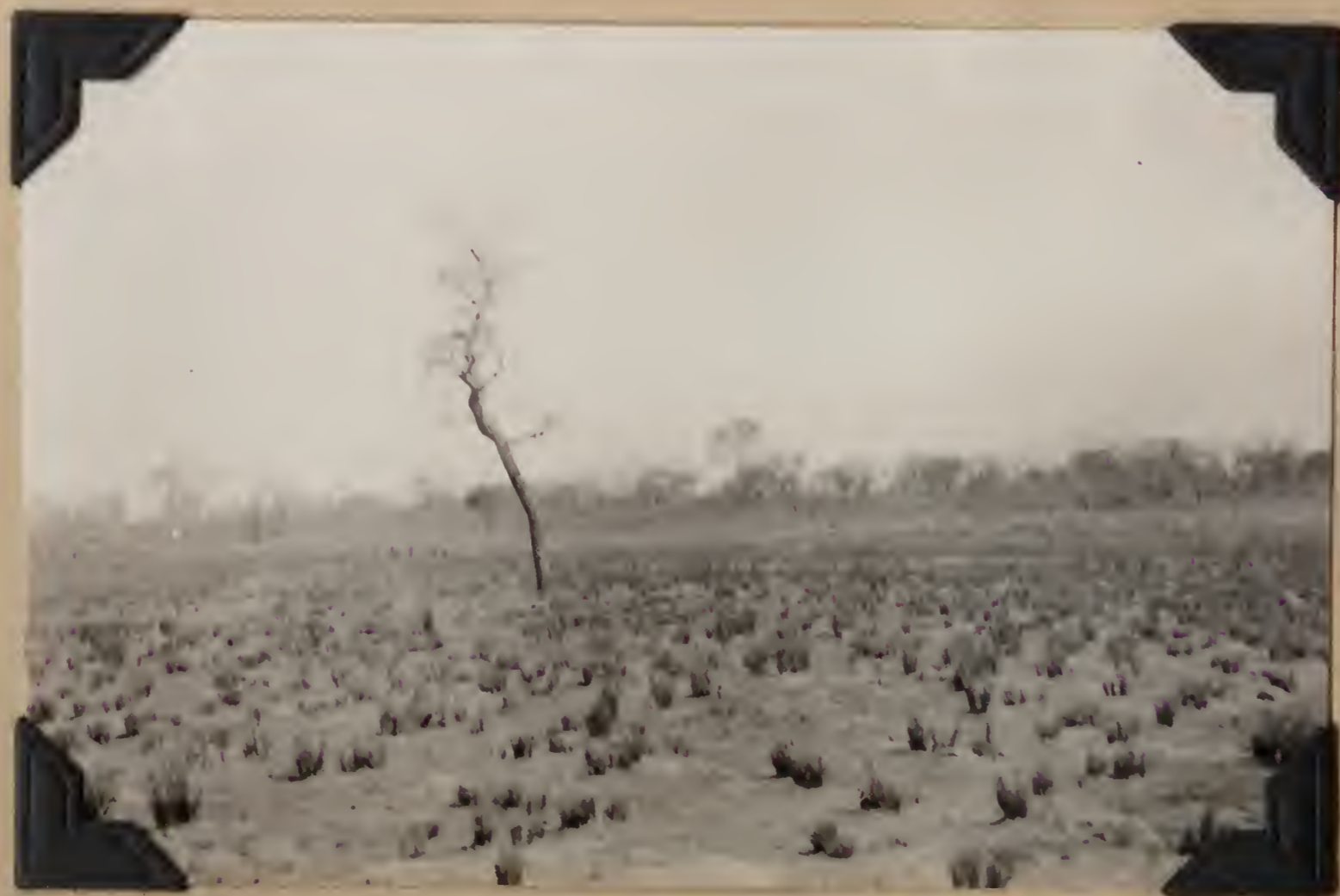
1394. Rolling open country in Chaco at Kilómetro 170 west of Puerto Pinasco, Paraguay. September 24, 1920.