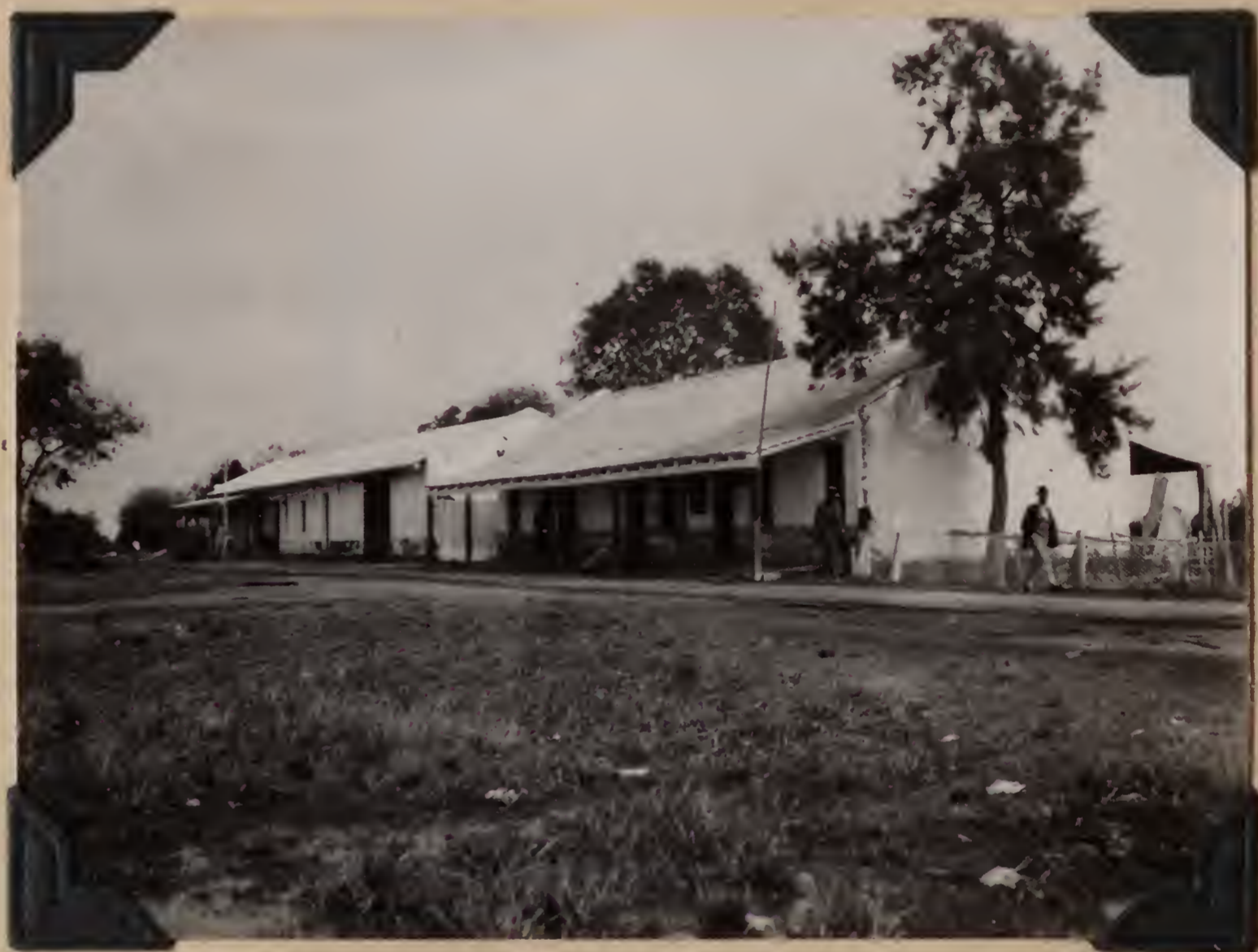
B.S. 21998. The Río Paraguay. Puerto Las Palmas, Chaco, Argentina. August 2, 1920.