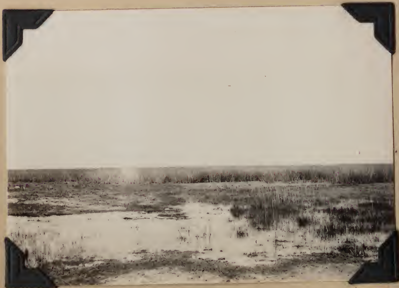
1422. View of extensive cañadon on Estancia Los Ynglesés, Lavalle, Buenos Aires, Argentina. November 10, 1920.