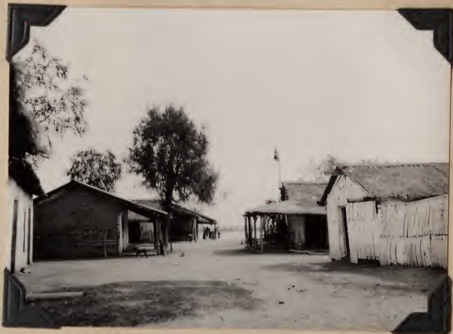
B.S. 22049. Steamship office, indicated by flag. Alberdi, Paraguay. August 26, 1920.