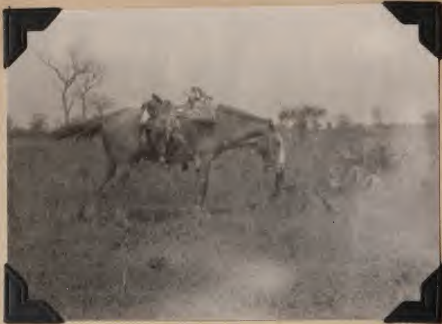
1390. My horse Baldy, with the saddle loaded with birds. Kilómetro 80, west of Puerto Pinasco, Paraguay. September 10, 1920.