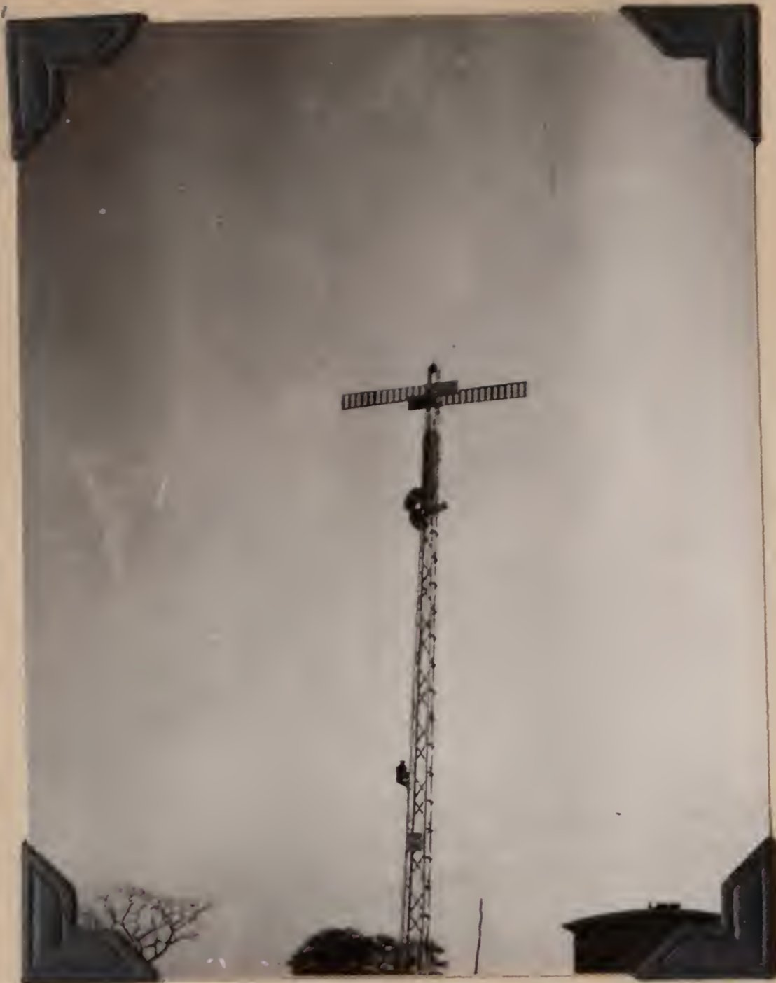
B.S. 22038. Nest of Leñatero Anumbius anumbi in top of railroad semaphore. Kilómeter 182, Formosa, Argentina. August 21, 1920.