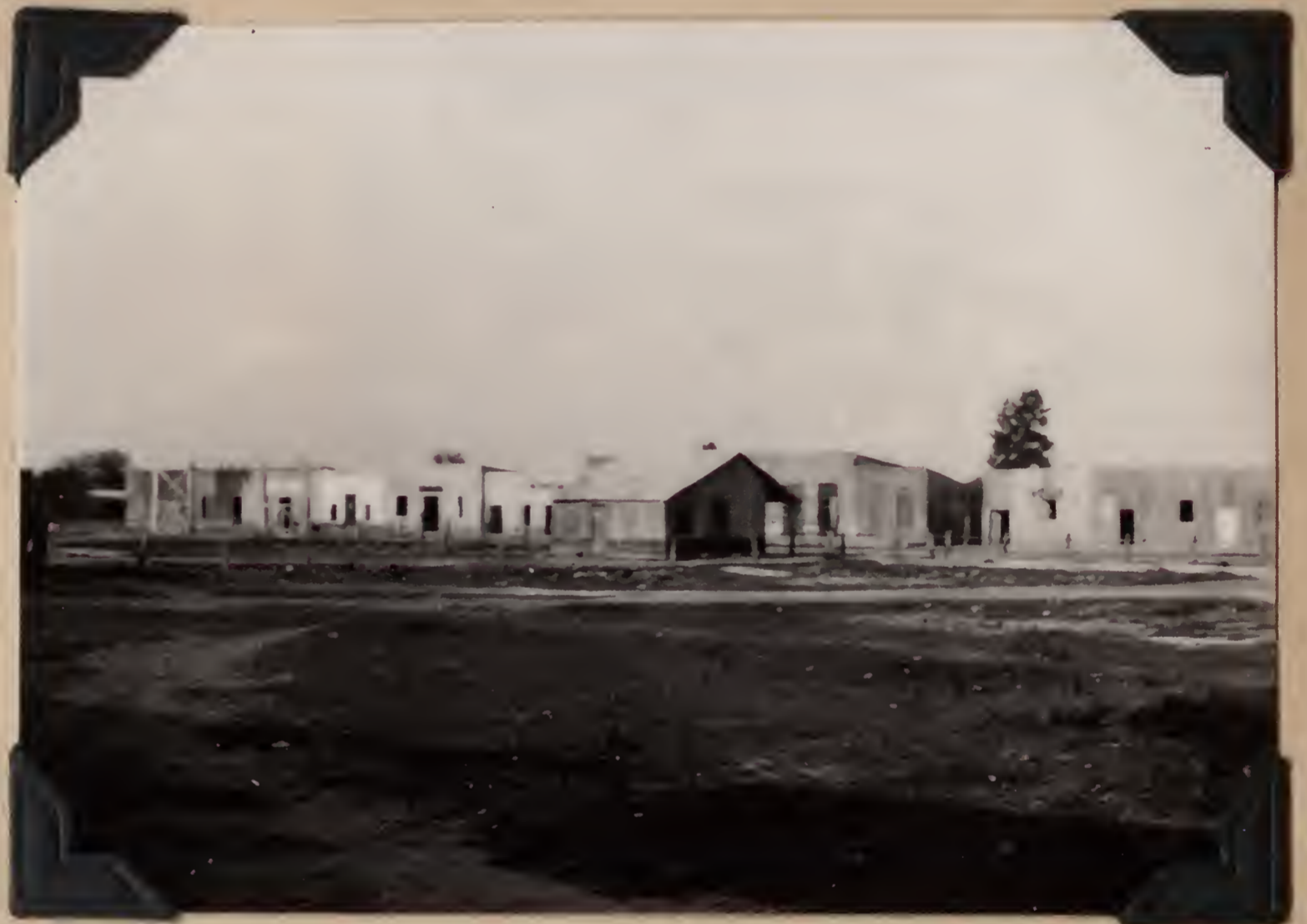
1344. Charadrai, a typical town in the newly settled section of the Chaco, Argentina. July 5, 1920.