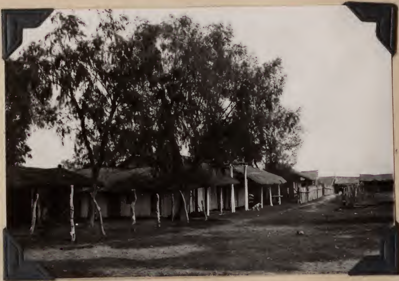
1385. A view in Alberdi, Paraguay. August 26, 1920.