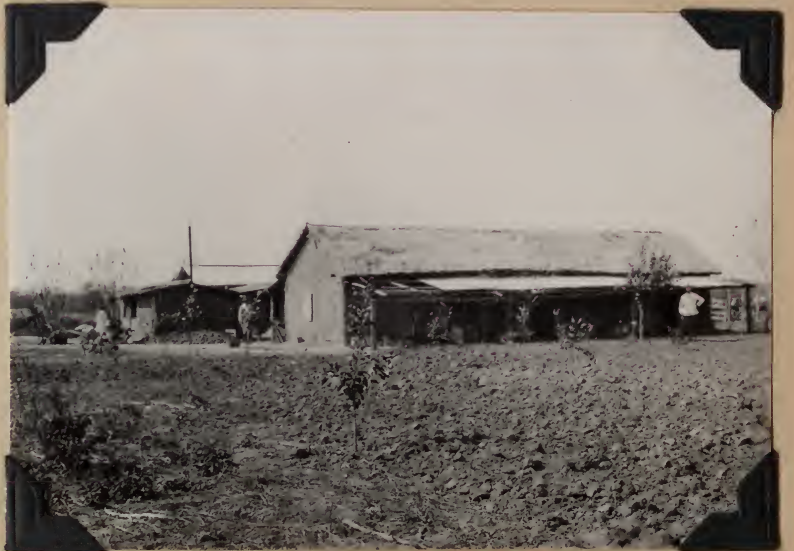
1375. Hacienda Linda Vista, Riacho Pilaga, Formosa, Argentina. August 14, 1920.