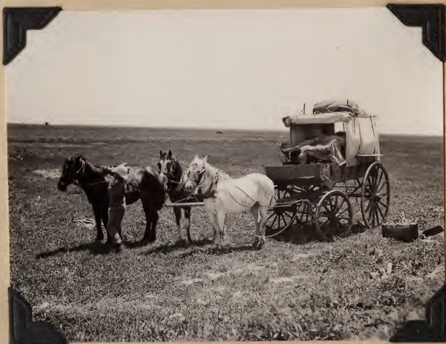
B.S. 22176. Changing horses on galera between Lavalle, and Buenos Aires, Province of Buenos Aires, Argentina. November 16, 1920.