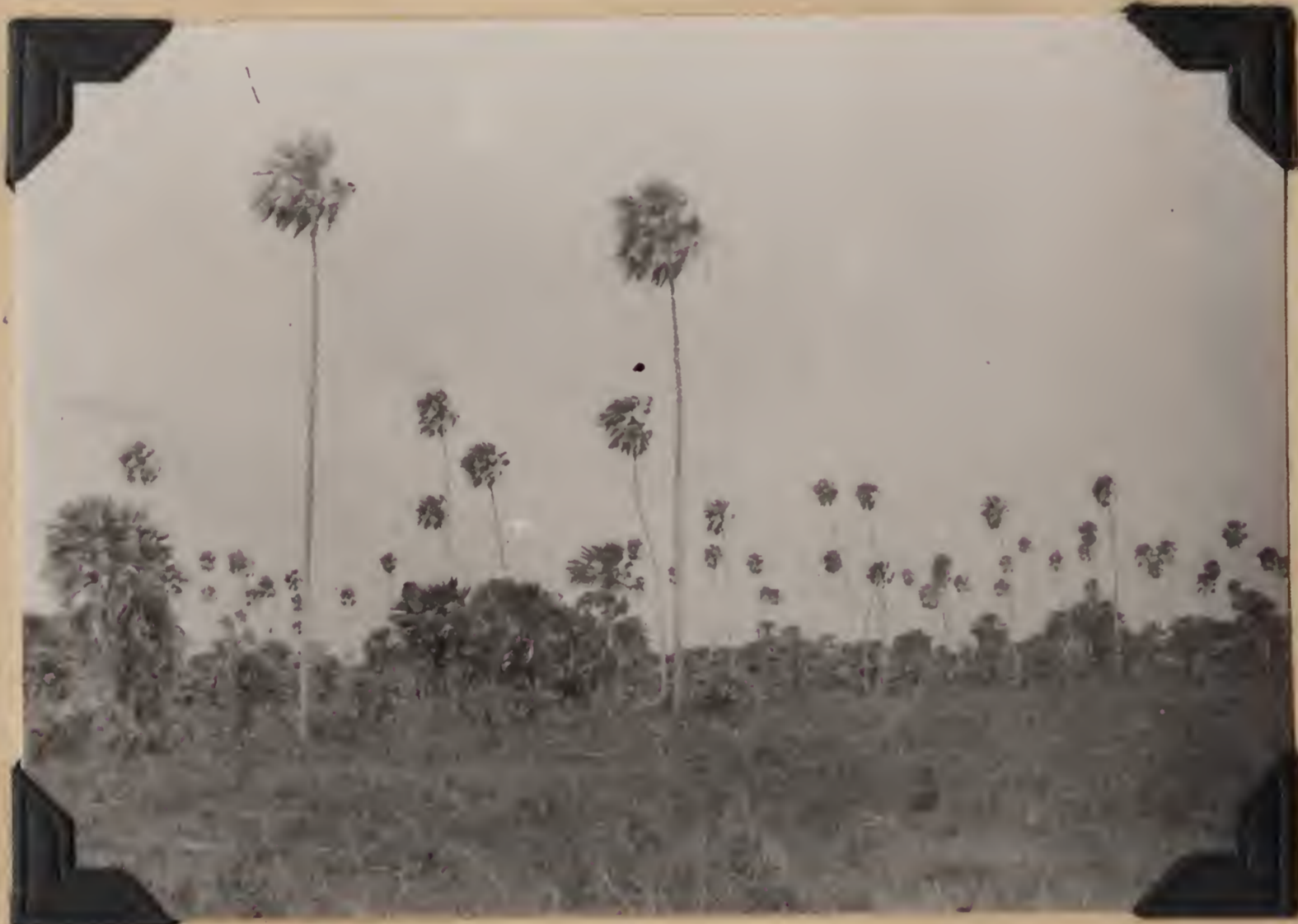
B.S. 22068. View in grove of palms. Kilómetro 80, Puerto Pinasco, Paraguay. September 10, 1920.