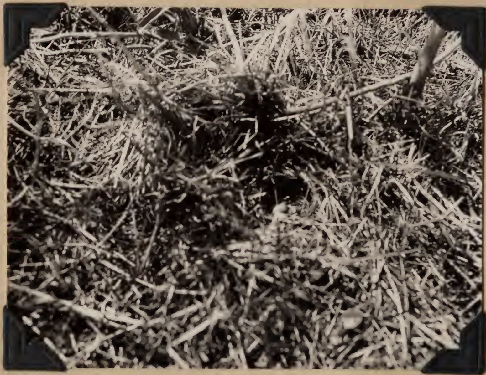
B.S. 22125. Nest and eggs of Anthus correndera exposed by re- moval of concealing herbage. Dolores, Buenos Aires, Argentina. October 21, 1920.