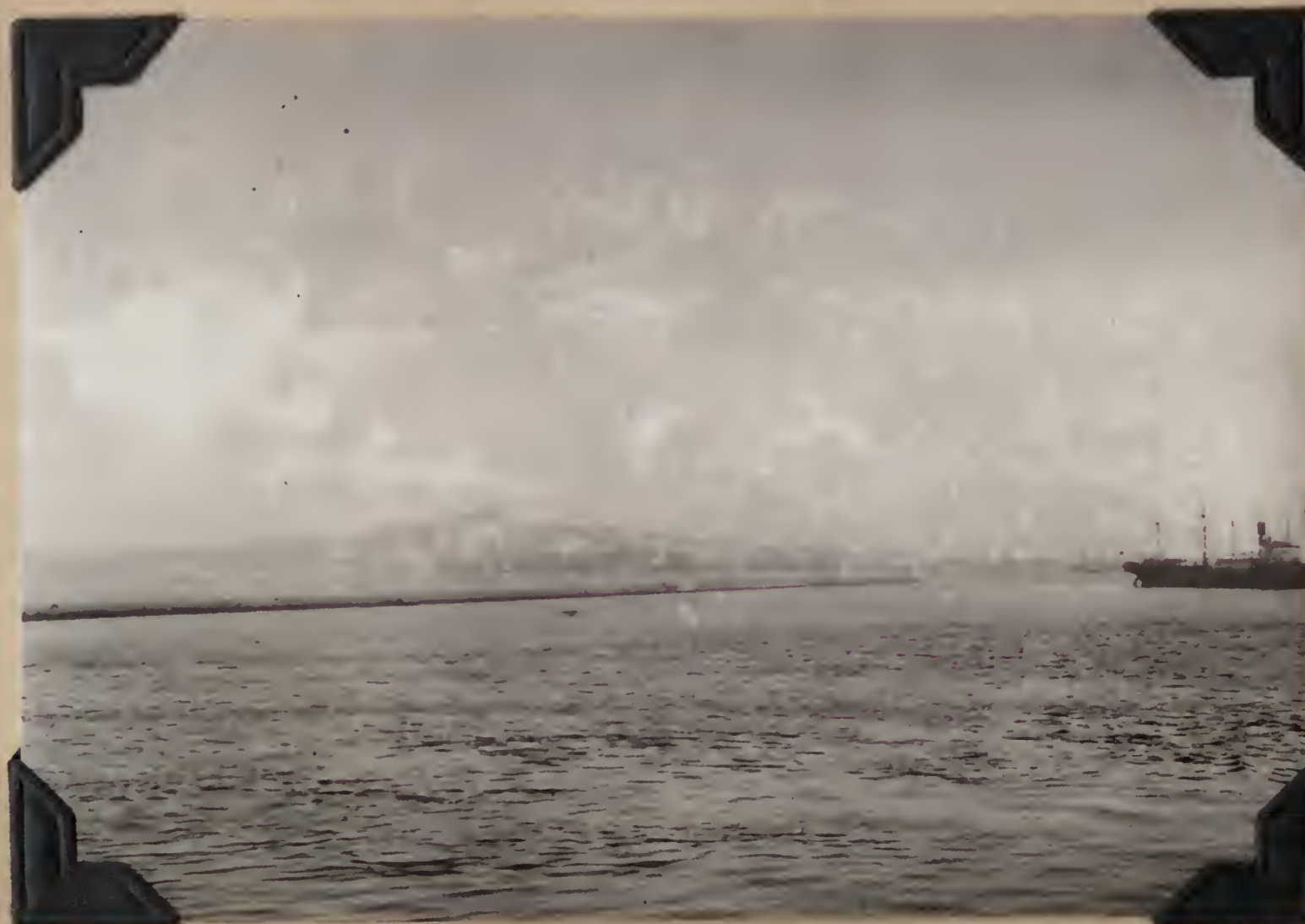
B.S. 21932-1/2. Low fortified hill from which Montevideo received its name. Montevideo, Uruguay. June 20, 1920.