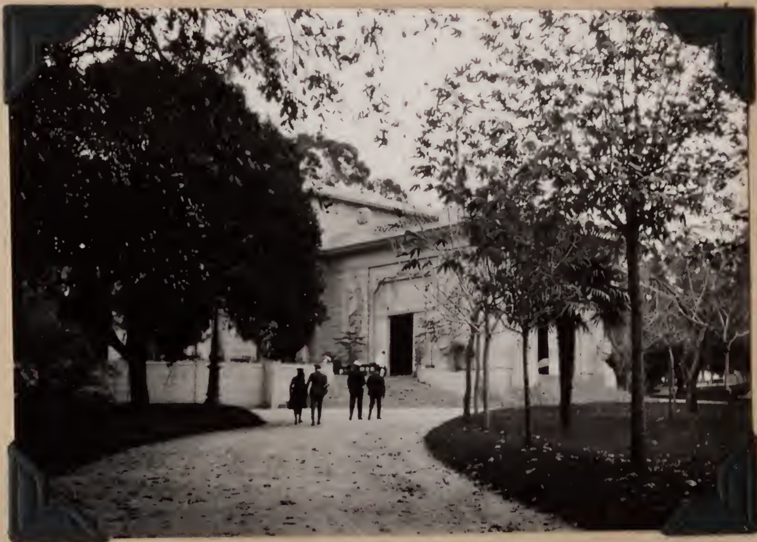
1339. Park in Montevideo, Uruguay. June 20, 1920.