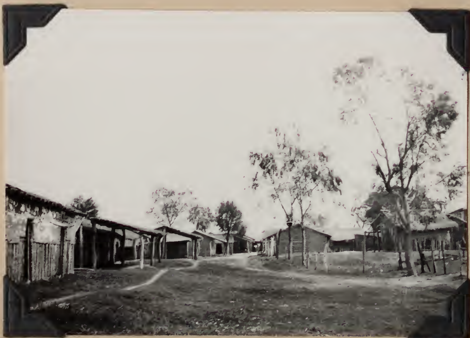
B.S. 22050. A rambling street. Alberdi, Paraguay. August 26, 1920.