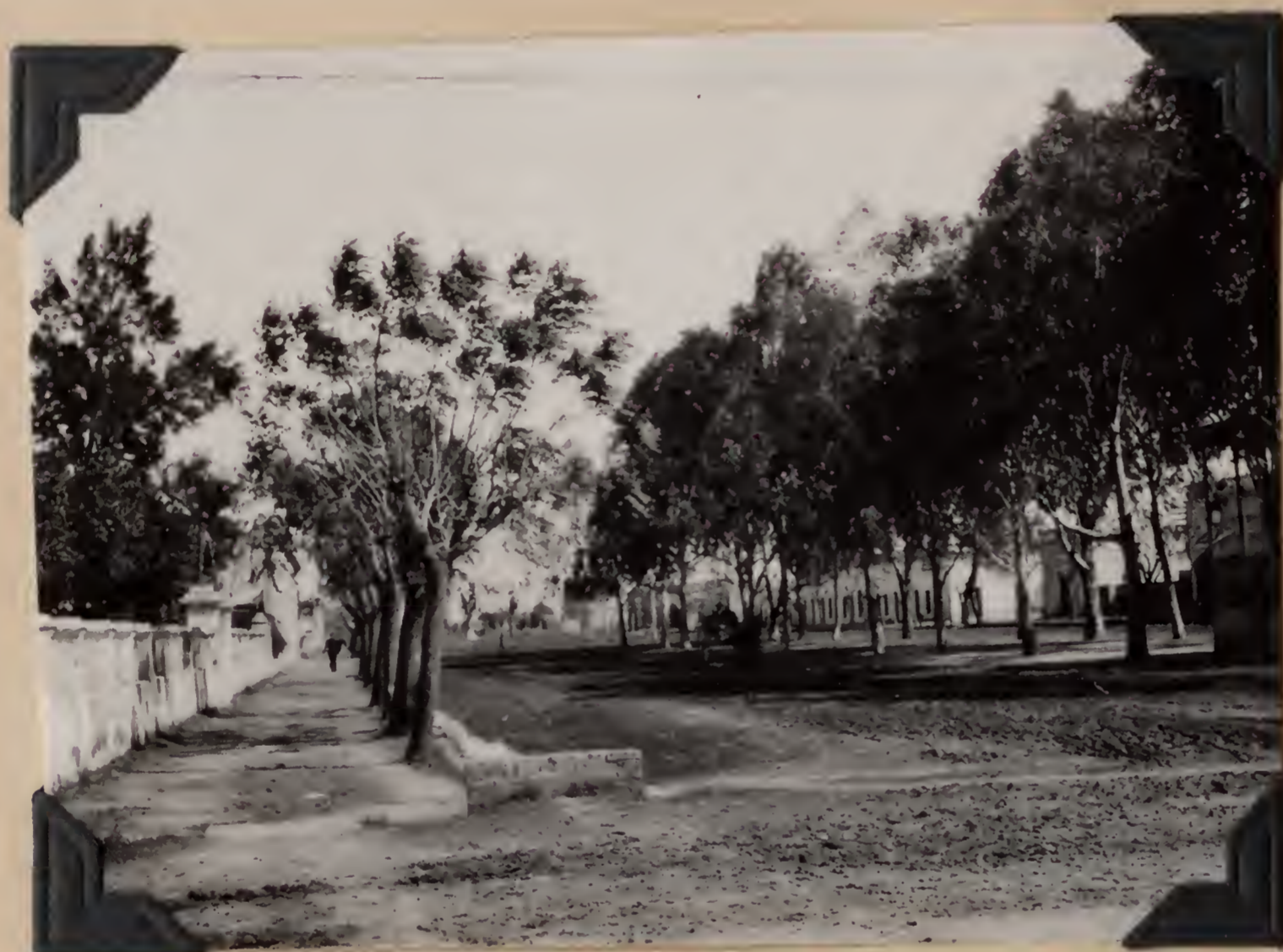
1371. On the avenida de Mayo, Formosa, Formosa, Argentina. August 4, 1920.