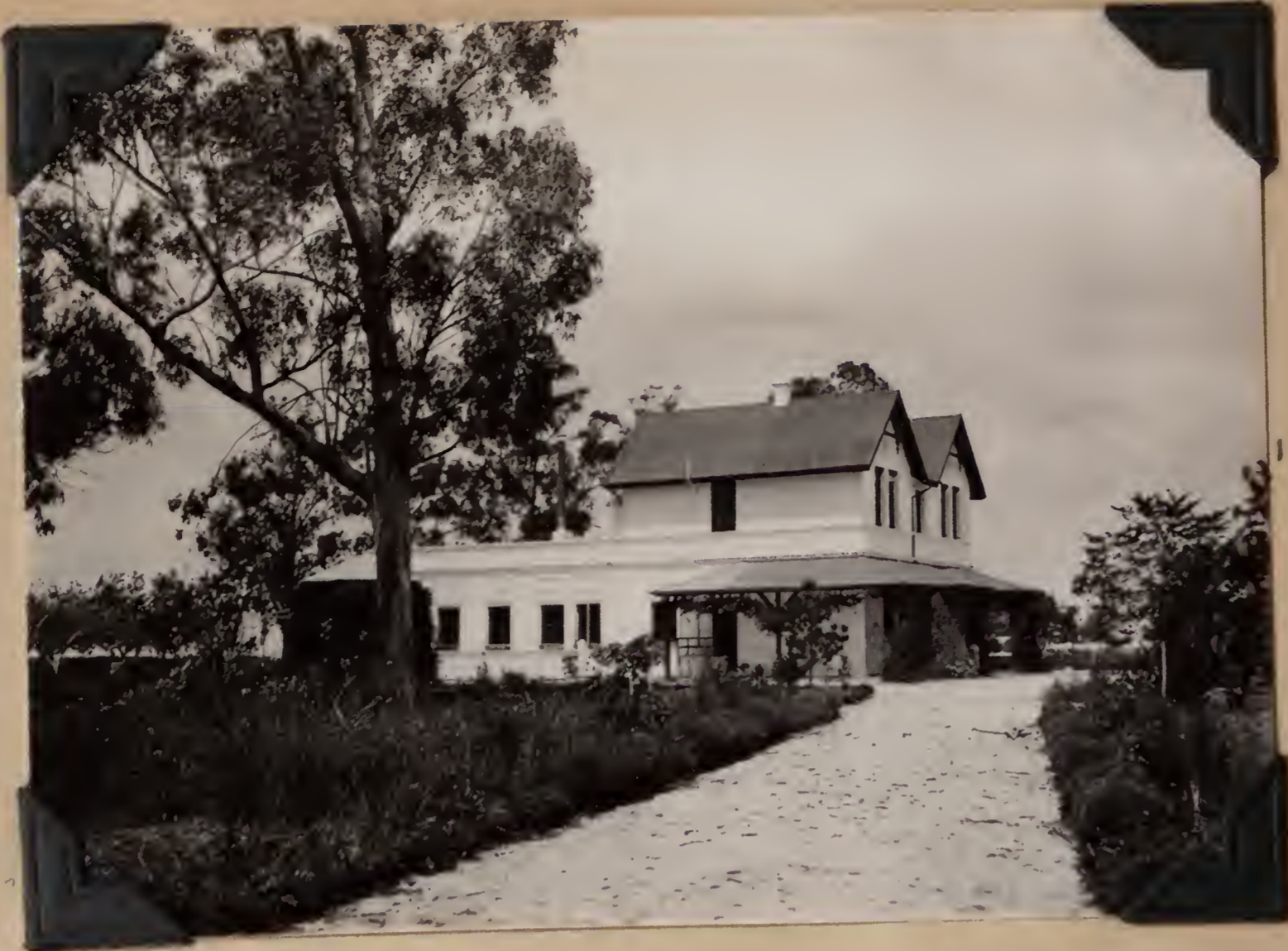
1419. The main house at the Estancia Los Ynglesés, Lavallo, Buenos Aires, Argentina. October 30, 1920.