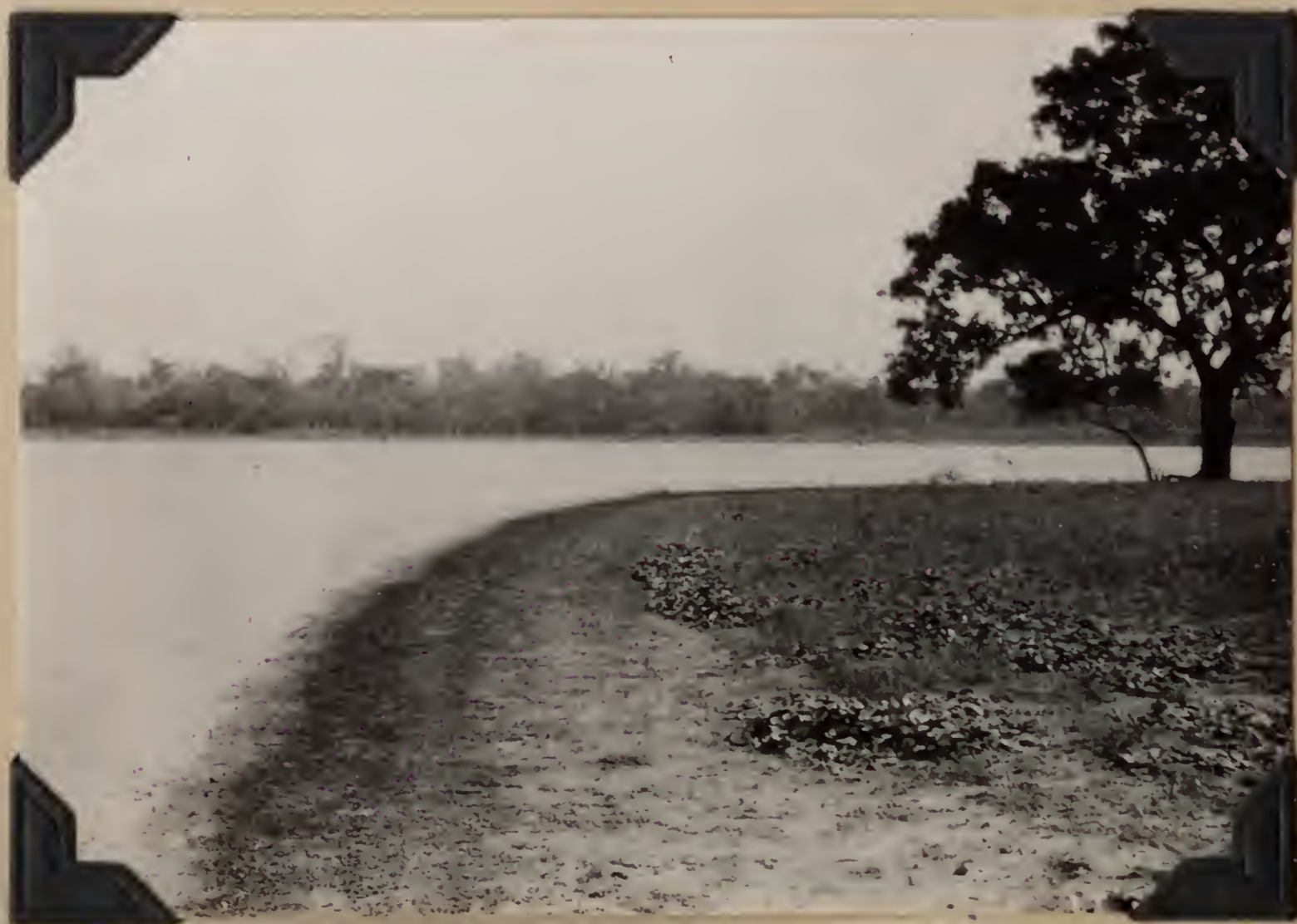
B.S. 22074. Open shore of lagoon at Kilómetro 80, suitable for shorebirds. Puerto Pinasco, Paraguay. September 14, 1920.