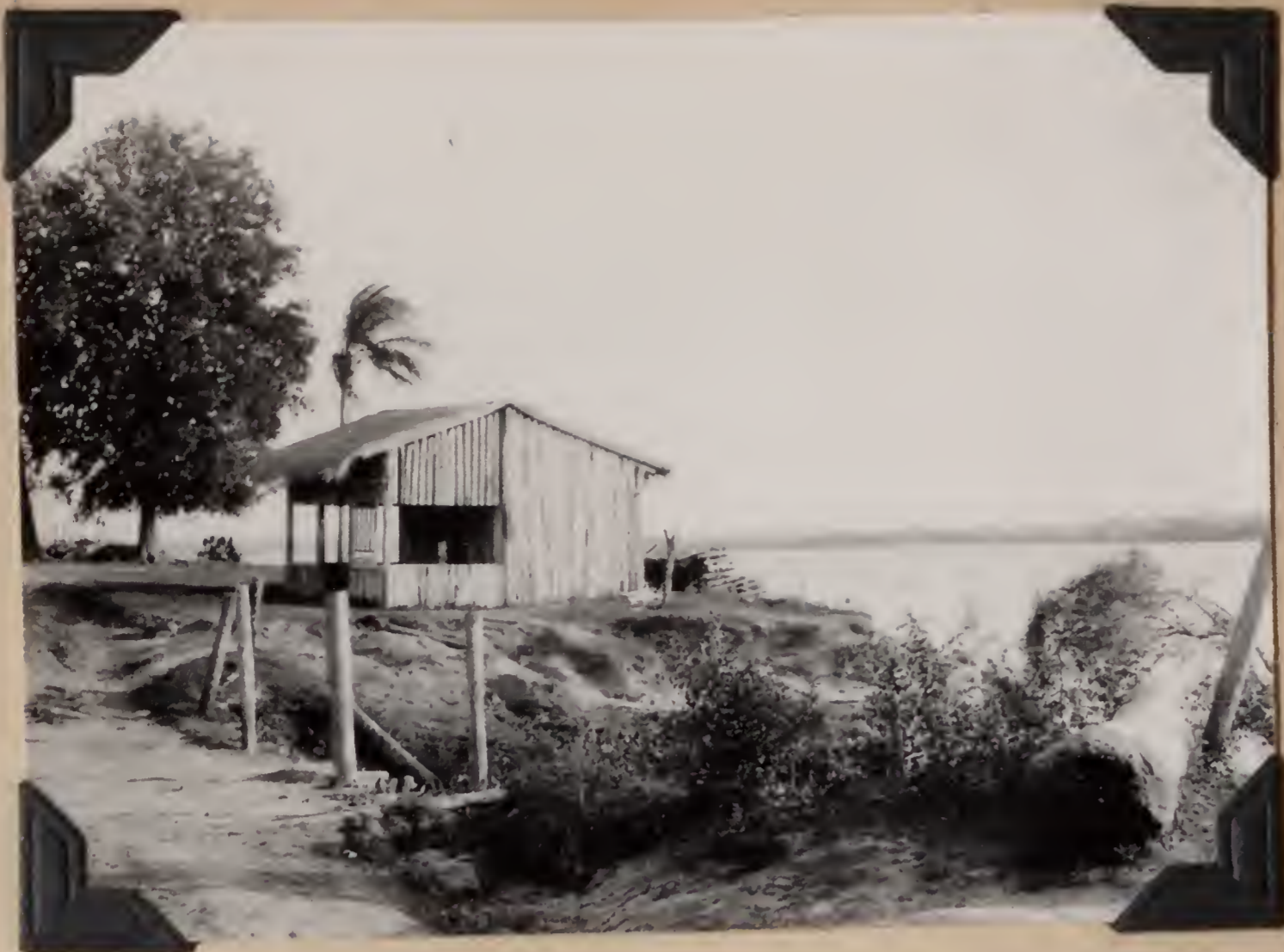
B.S. 22056. Hut built of palm trunks on bank of Río Paraguay. Antioquera, Paraguay. August 29, 1920.