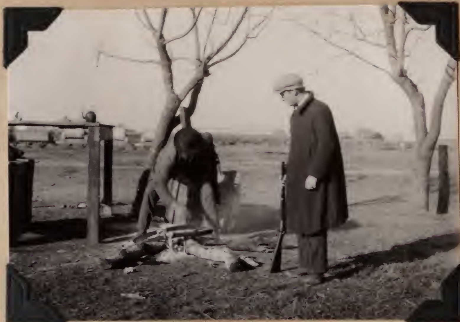
1362. Guards at the factory. Las Palmas, Chaco, Argentina. July 29, 1920.