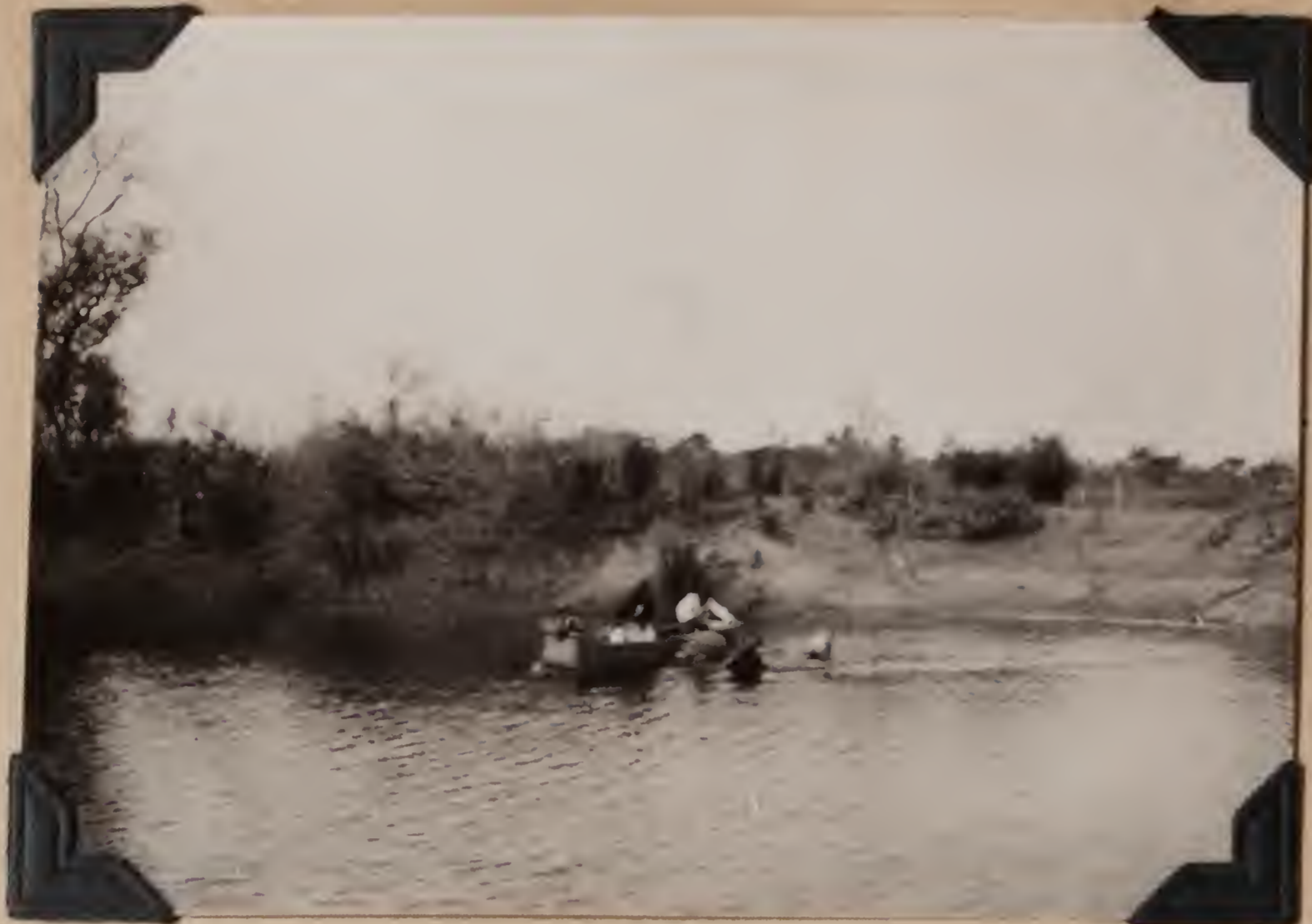
(No Negative). Crossing a Riacho. Las Palmas, Chaco, Argentina. July 20, 1920.