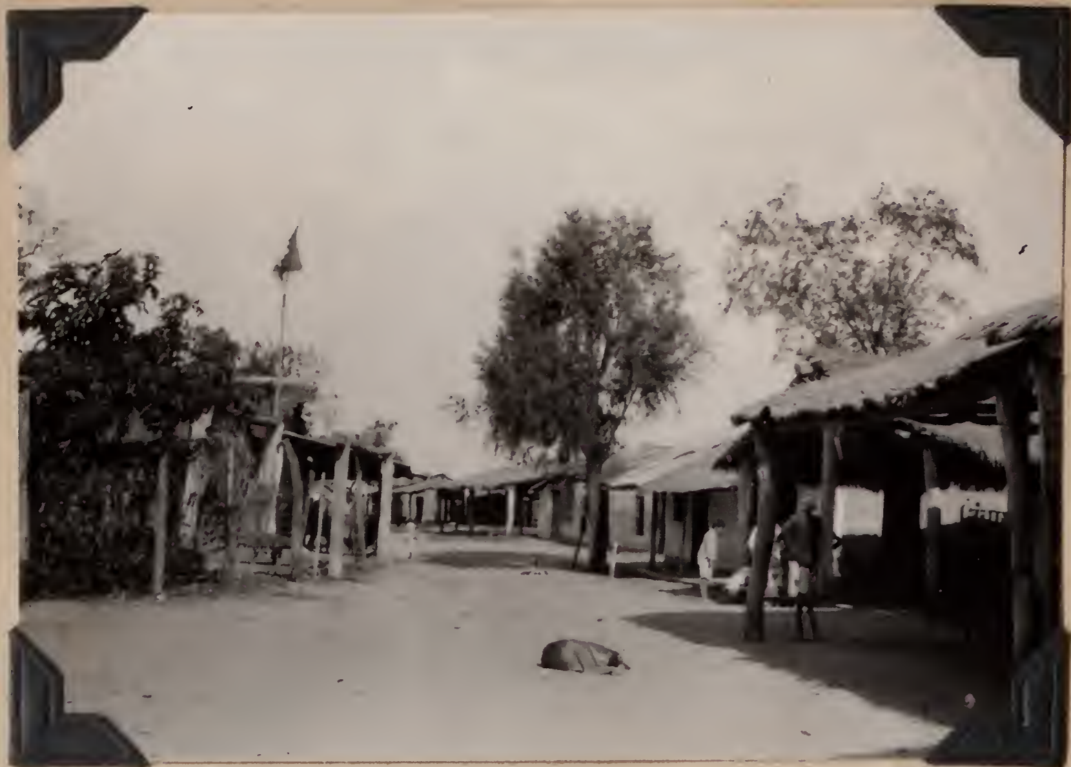
1387. A street in Alberdi, Paraguay, at high noon. August 26, 1920.