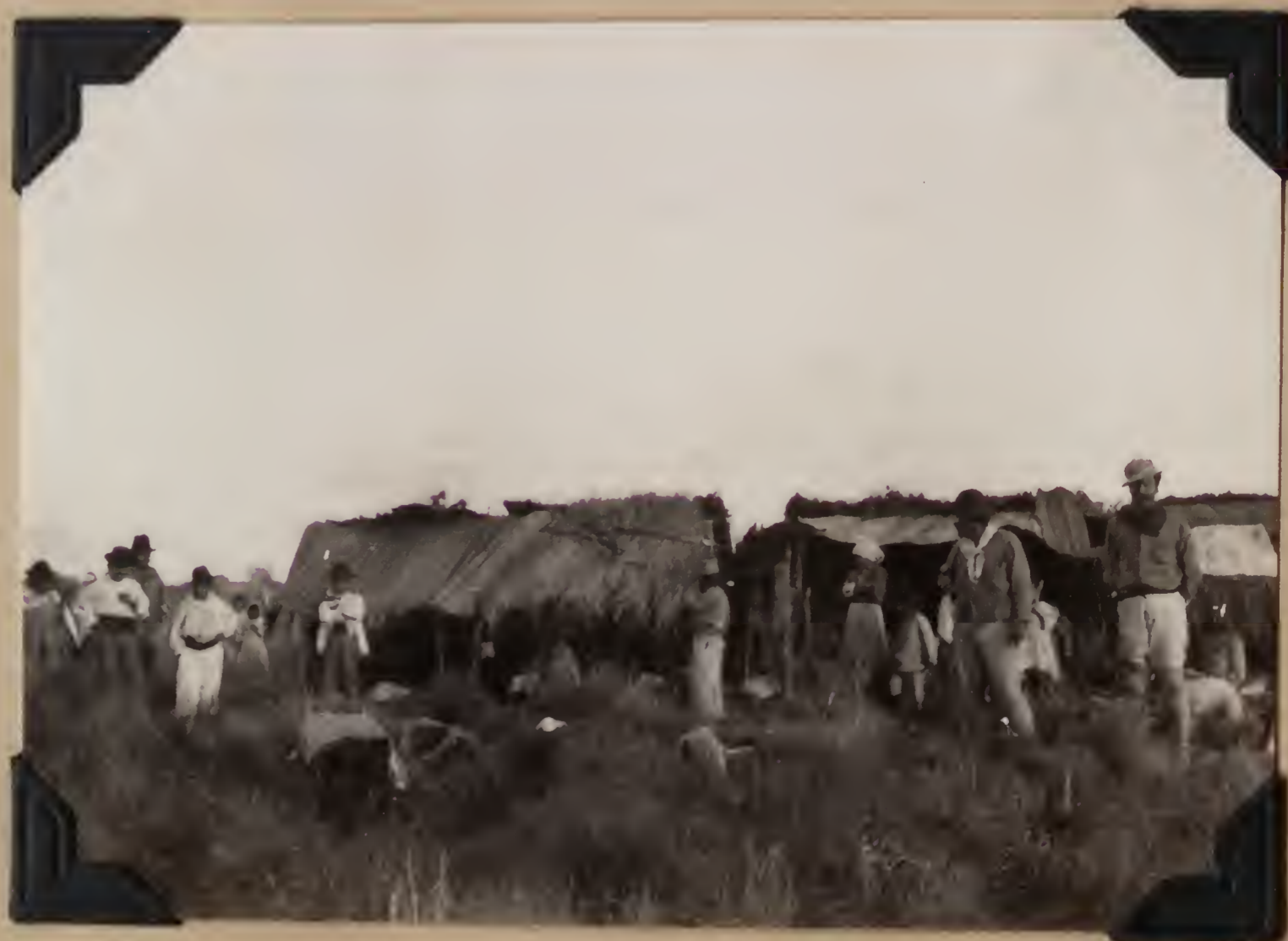
1366. A group of Toba Indians with their portable huts. Las Palmas, Chaco, Argentina. August 1, 1920.