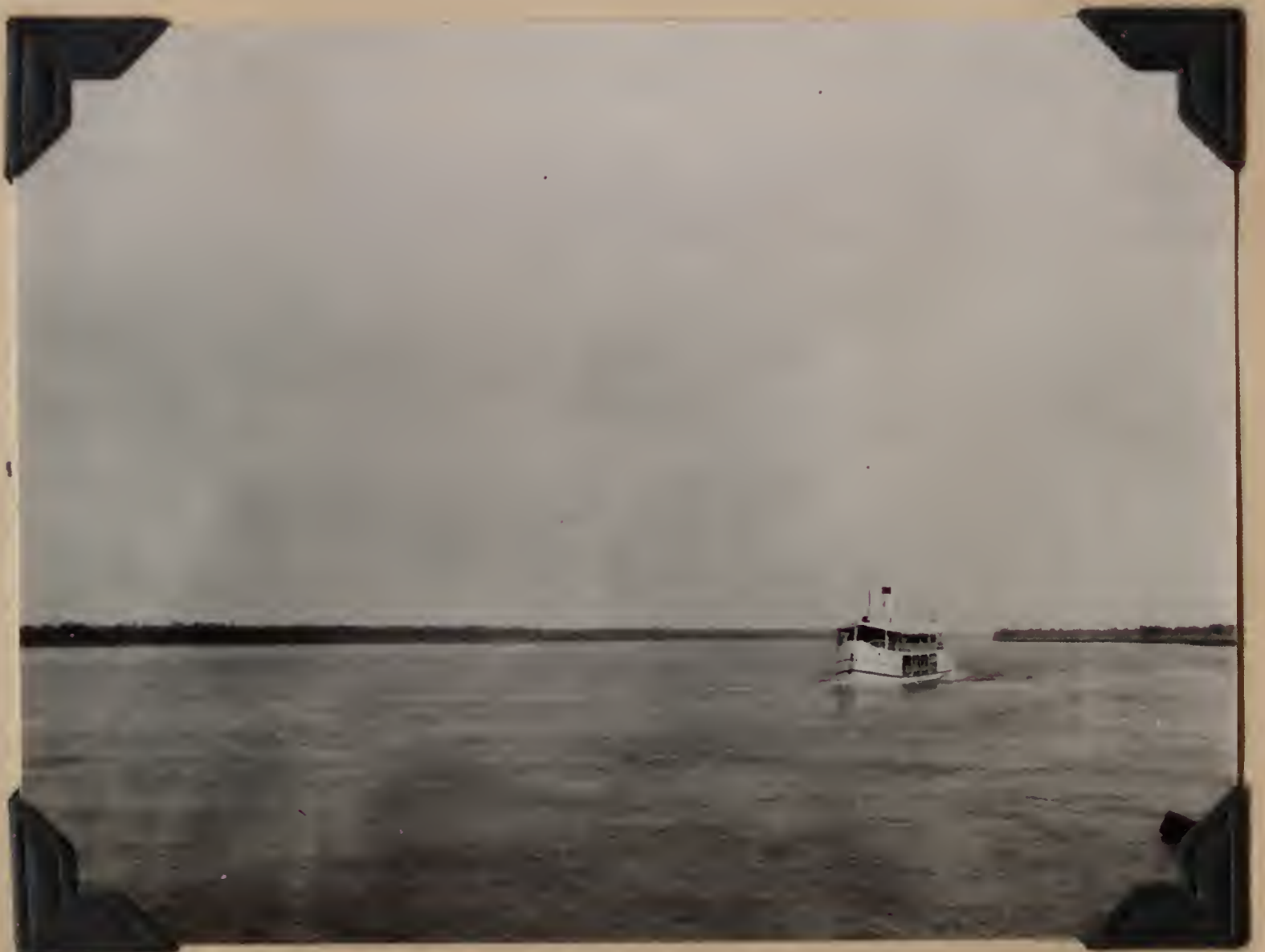
B.S. 22002. Police boat carrying passengers and mail for Formosa. Puerto Las Palmas, Chaco, Argentina. August 2, 1920.