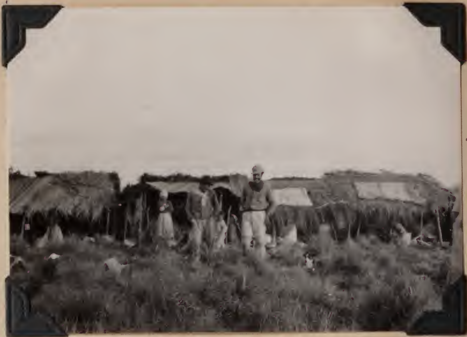
1367. Temporary camp of Toba Indians. Las Palmas, Chaco, Argentina. August 1, 1920.