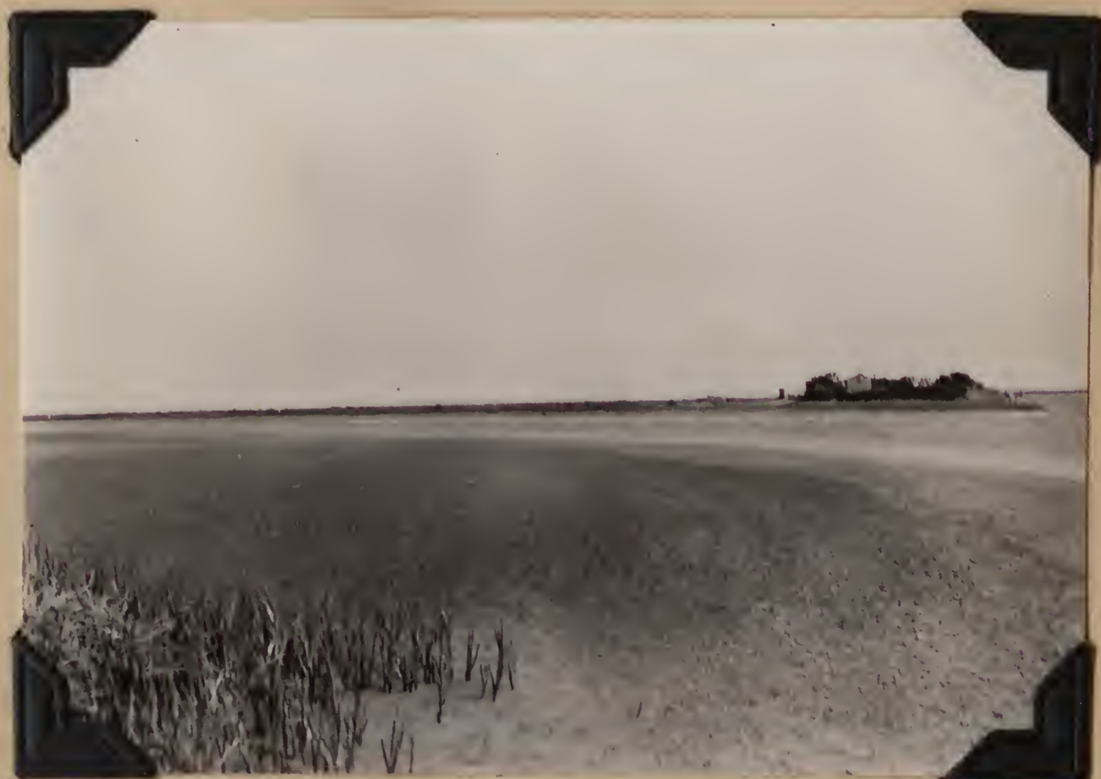
1411. Near the mouth of the Río Ajó, below Lavalle, Buenos Aires, Argentina. October 25, 1920.