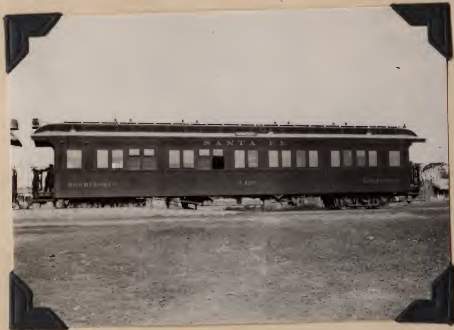
1342. Sleeping car - Coche Dormitorio - Ferrocarril Santa Fe. July 5, 1920.