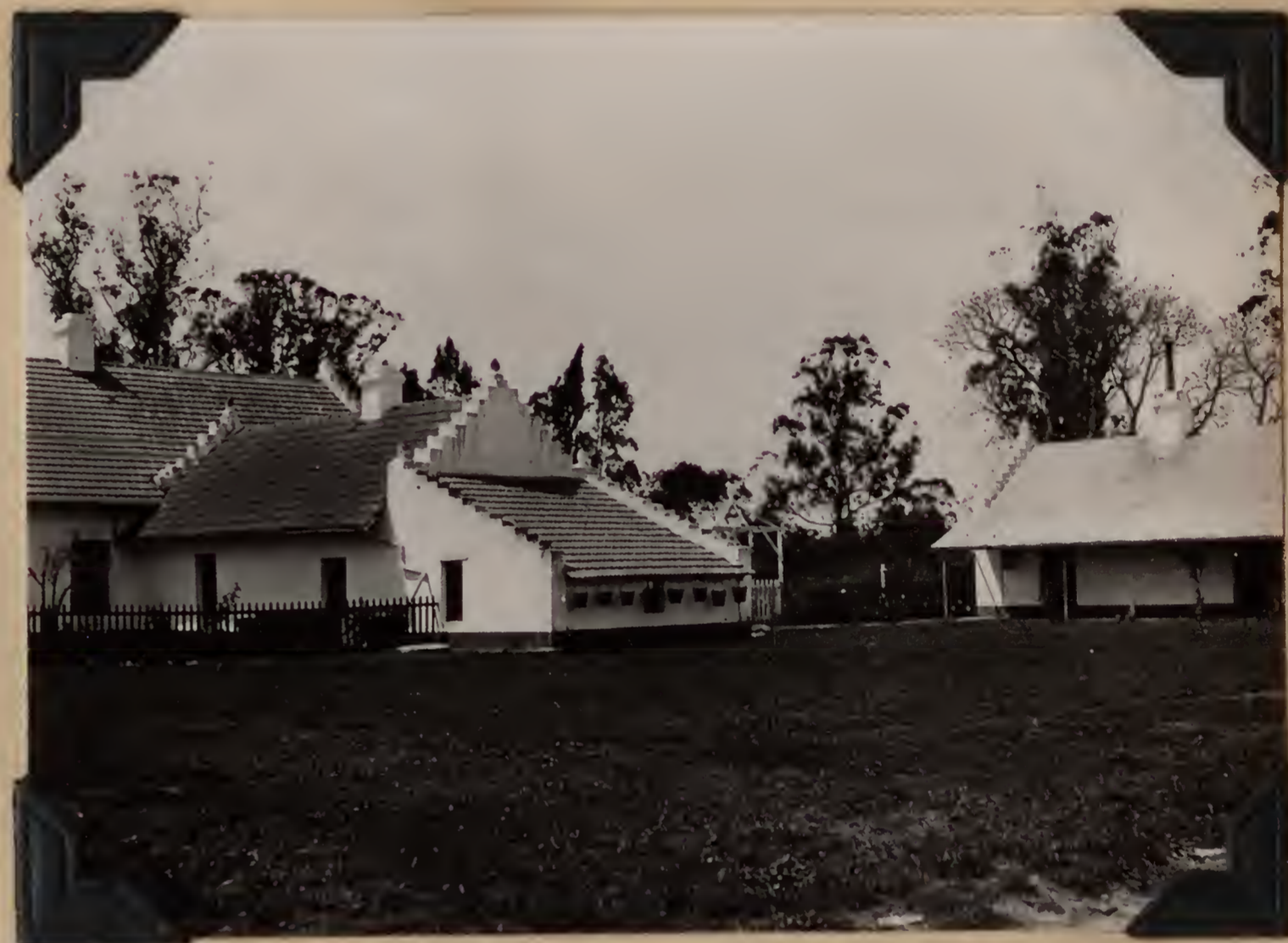
1420. At the Estancia Los Ynglesés, Lavallo, Buenos Aires, Argentina. October 30, 1920.