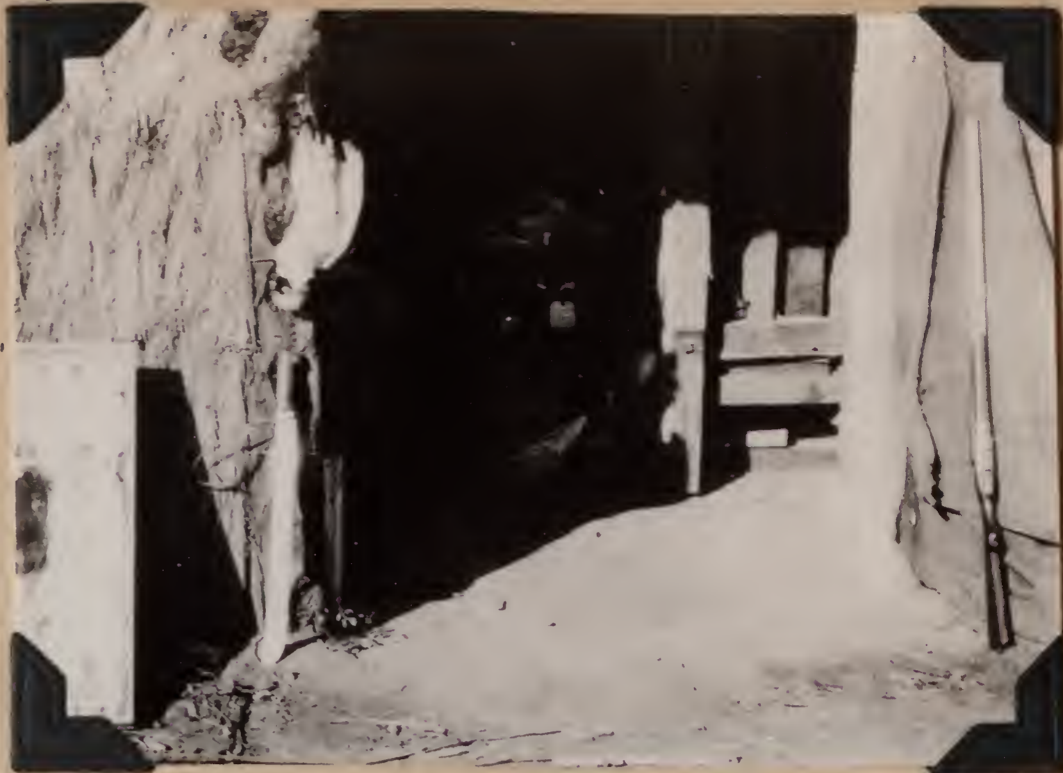
B.S. 22021. Work quarters at Hacienda Linda Vista. Riacho Pilaga, Formosa, Argentina. August 14, 1920.