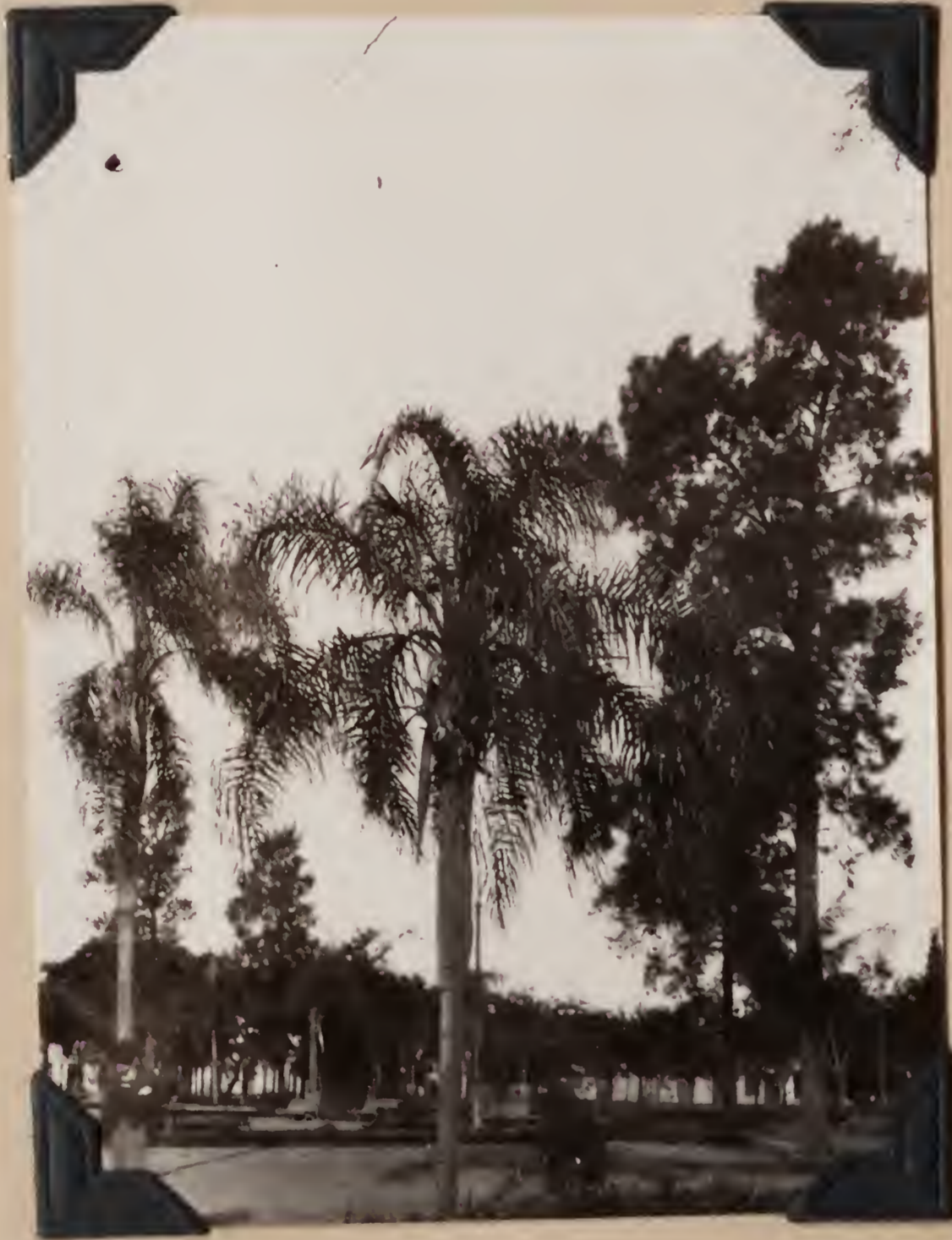
1345. Plaza in Resistencia, Chaco Argentina. July 6, 1920.