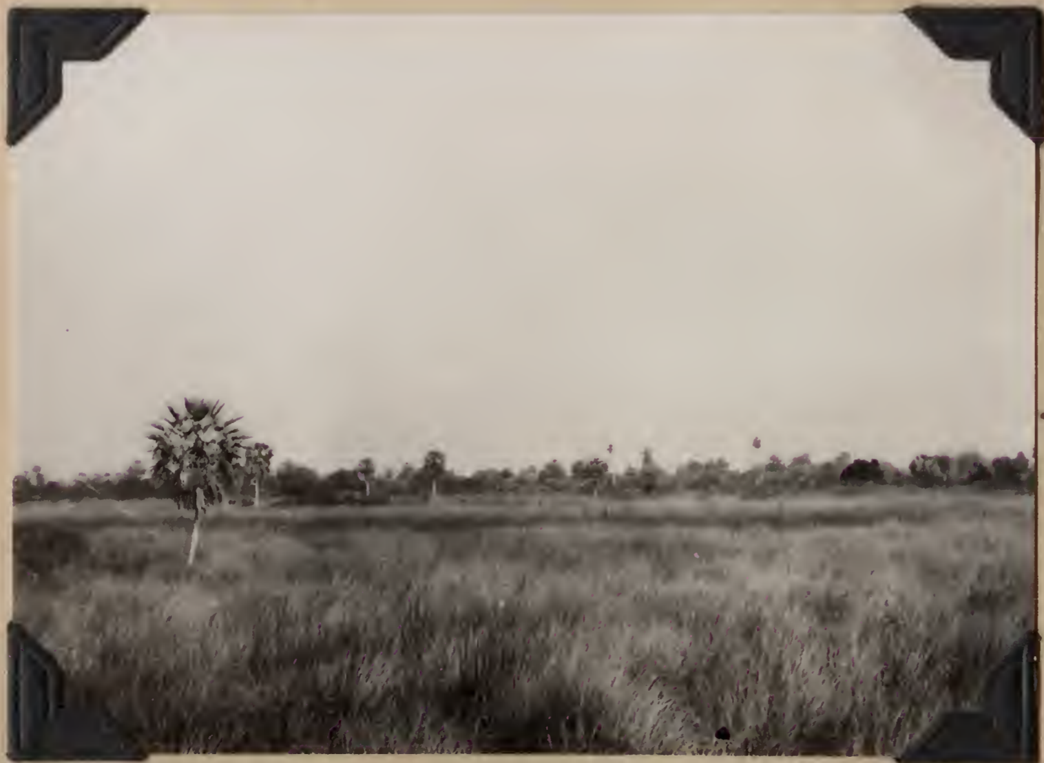
B.S. 22041. View in one of the palm grown marshes known as a palmar. Formosa, Formosa, Argentina. August 23, 1920.