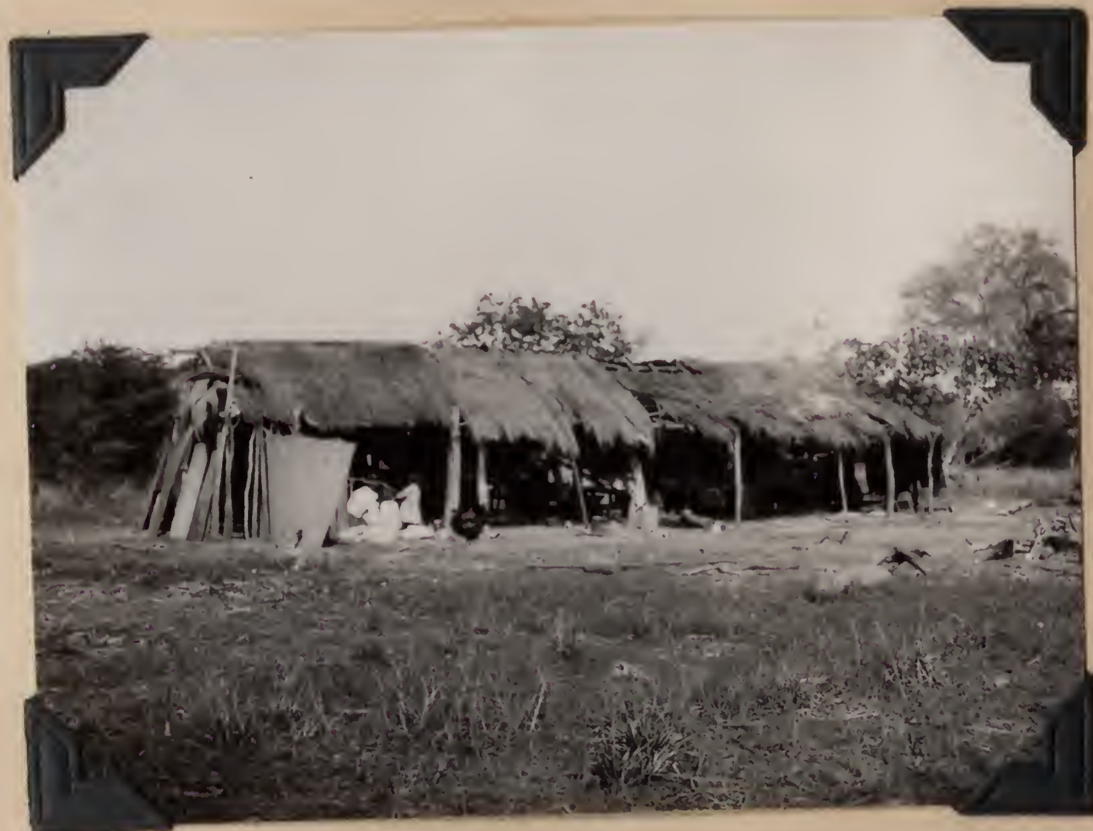
B.S. 21976. Hut of Toba Indians. Las Palmas, Chaco, Argentina. July 23, 1920.