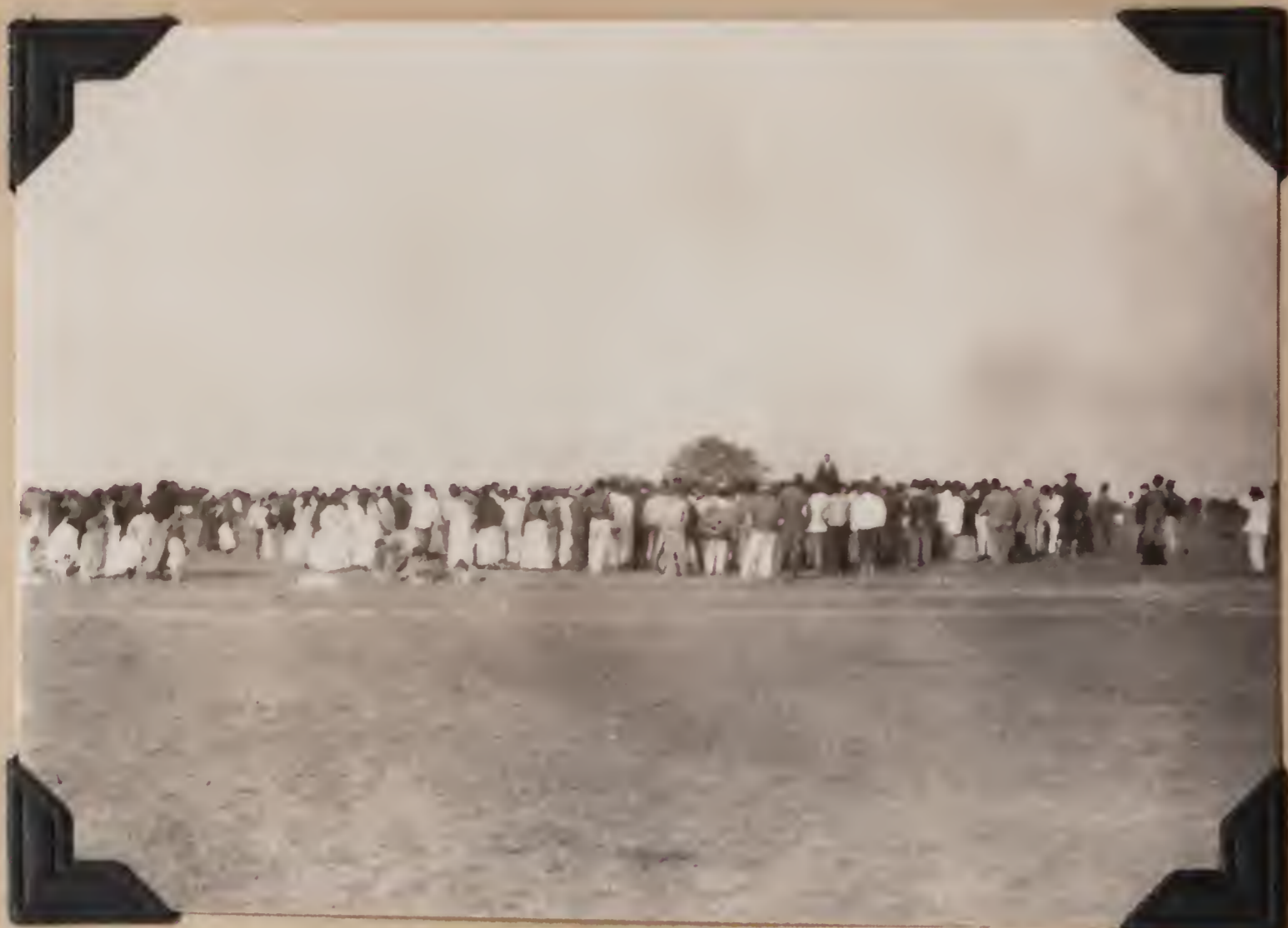
1359. A speaker exhorting peones on strike at the sugar mill and quebracho factory. Las Palmas, Chaco, Argentina. July 23, 1920.