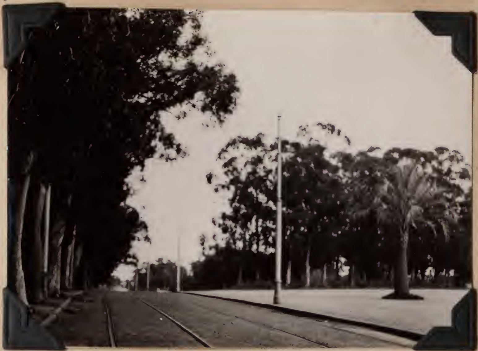
1338. Street near park in Montevideo, Uruguay. June 20, 1920.