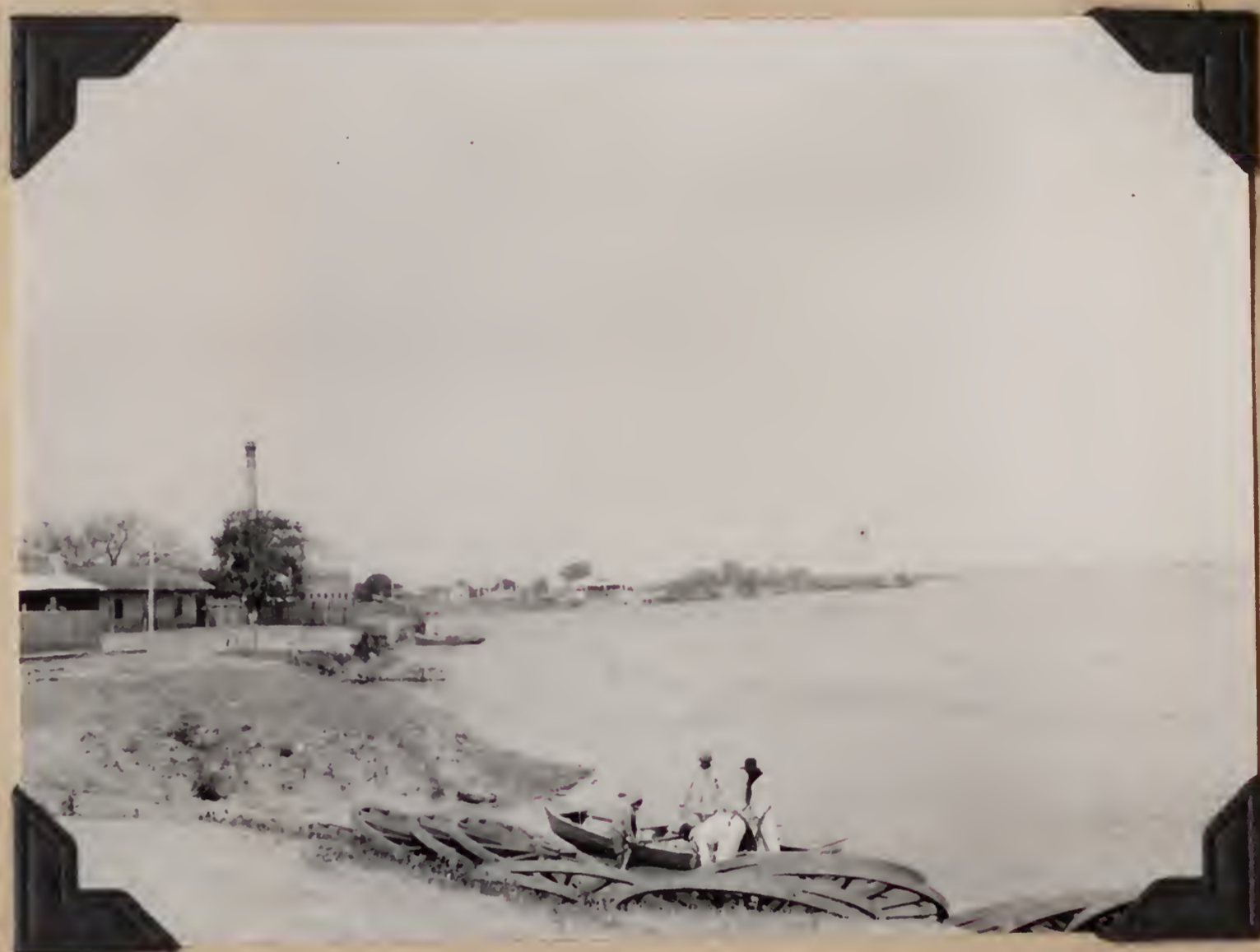
B.S. 22057. Water front on Río Paraguay, Villa Concepción, Paraguay. August 30, 1920.