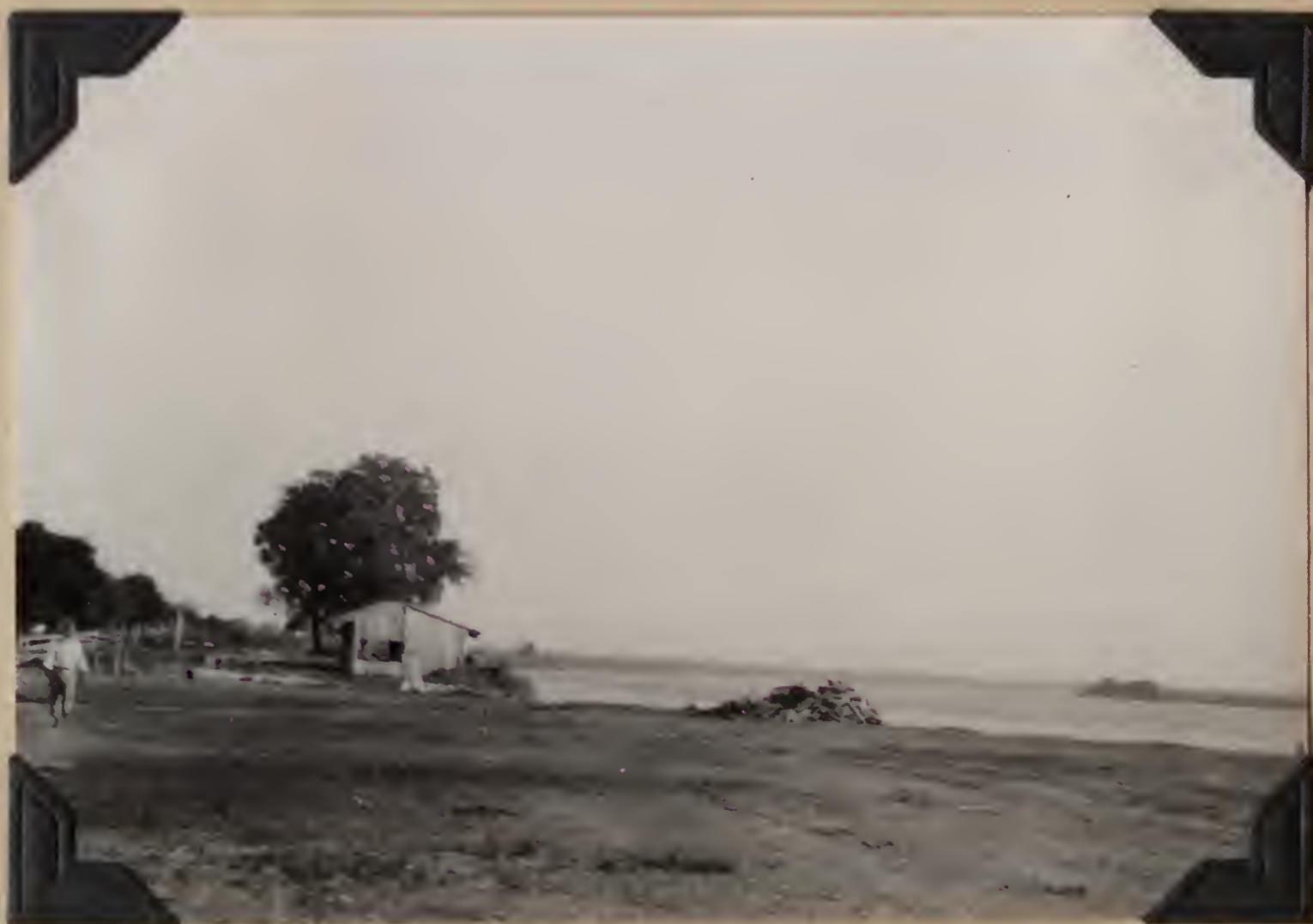
1388. The Río Paraguay at Antioquera, Paraguay. August 29, 1920.