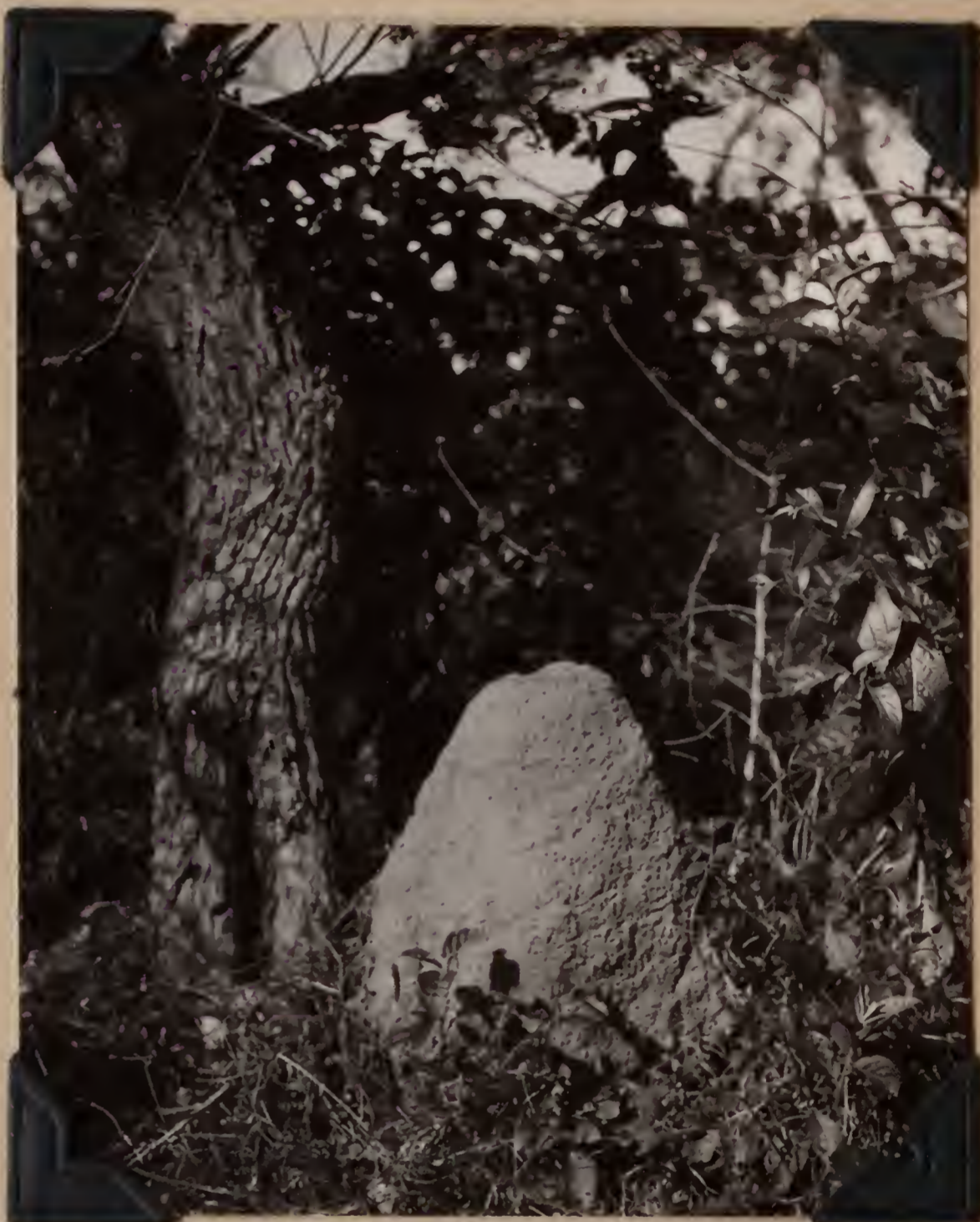
B.S. 21943. Termite nest. Resistencia, Chaco, Argentina. July 8, 1920.