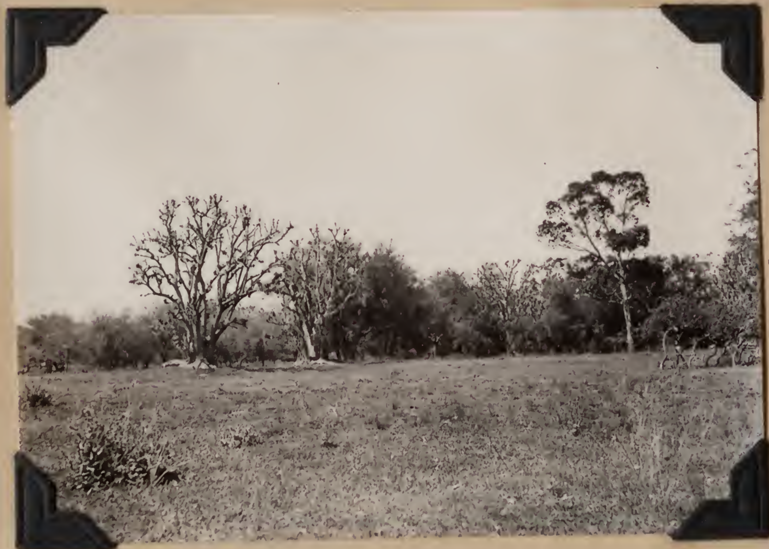
B.S. 22167. View of monte at Estancia Los Ynglesés. Ombú trees at left. Lavalle, Buenos Aires, Argentina. November 10, 1920.