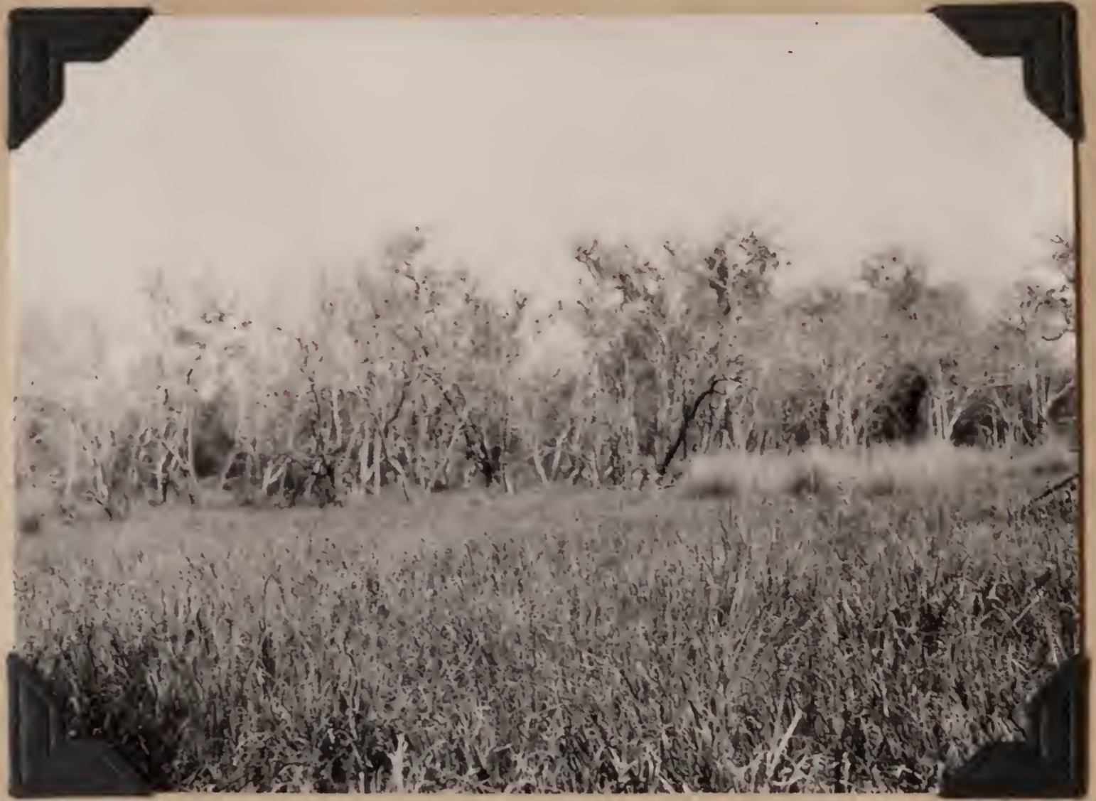
B.S. 22034. Small opening, marshy in character, in forest known as El Monte Inglés. Riacho Pilaga, Formosa, Argentina. August 18, 1920.