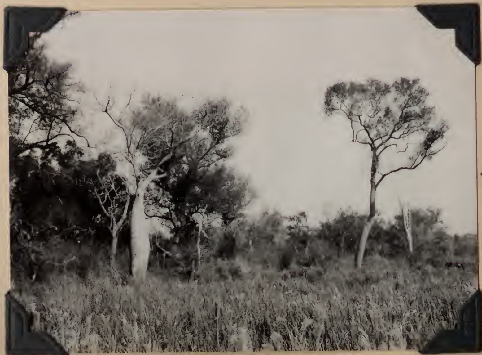
B.S. 22010. Palo Borracho or Sam-o-oo at left, Quebracho at right. Border of forest in Chaco. Riacho Pilaga, Formosa, Argentina. August 8, 1920.