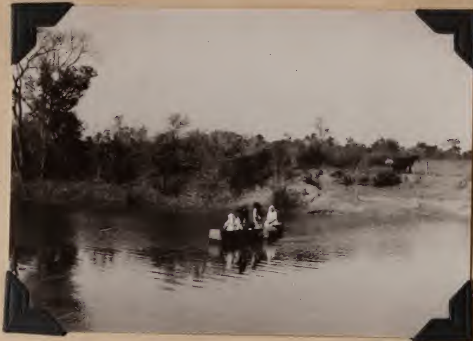
1352a B.S. 21960. Ferry across Riacho Quia. La Palmas, Chaco, Argentina. July 19, 1920.