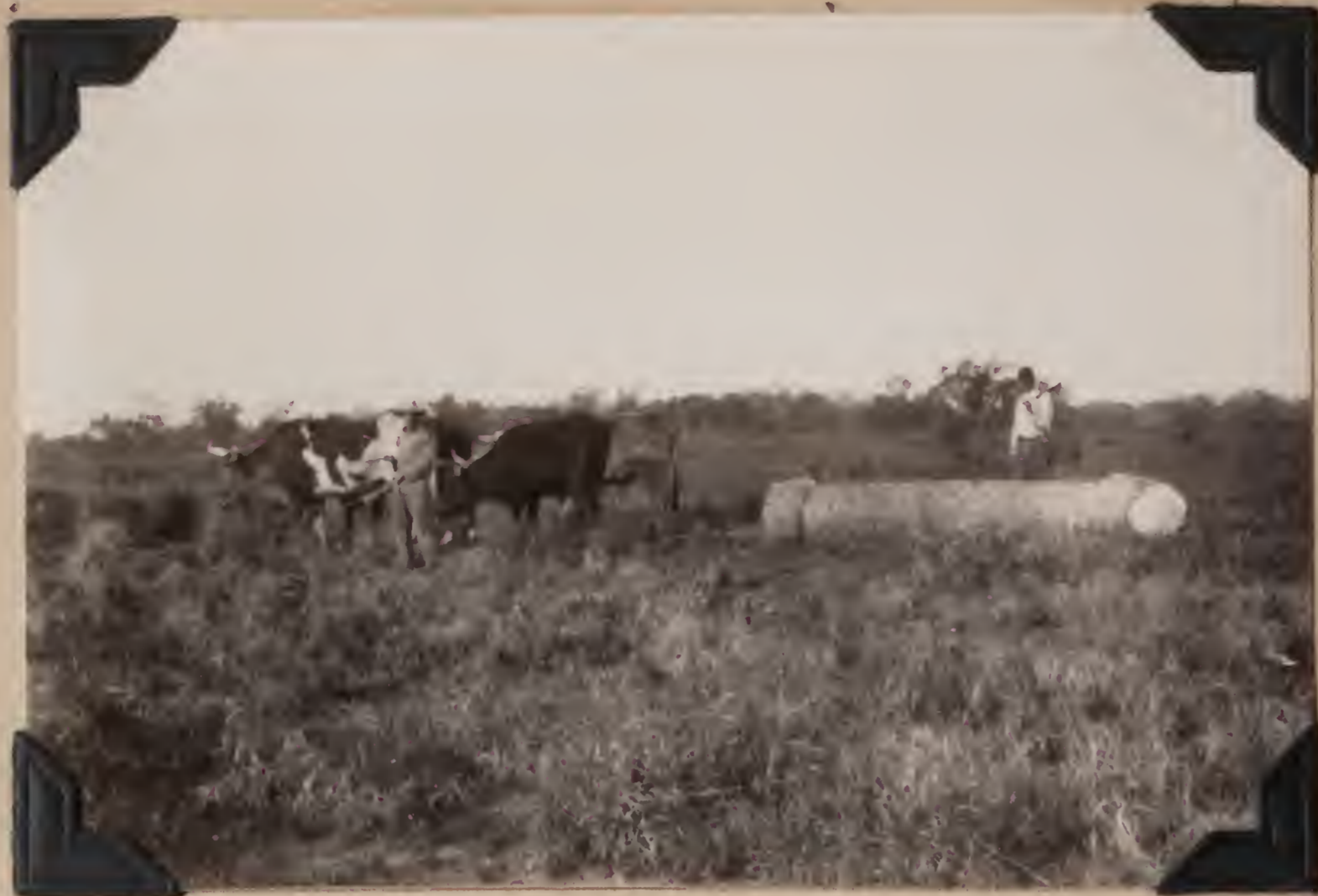
1378. Hauling the cachiveo made from the trunk of a palo borracho to the lagoon. Riacho Pilaga, Formosa, Argentina. August 14, 1920.