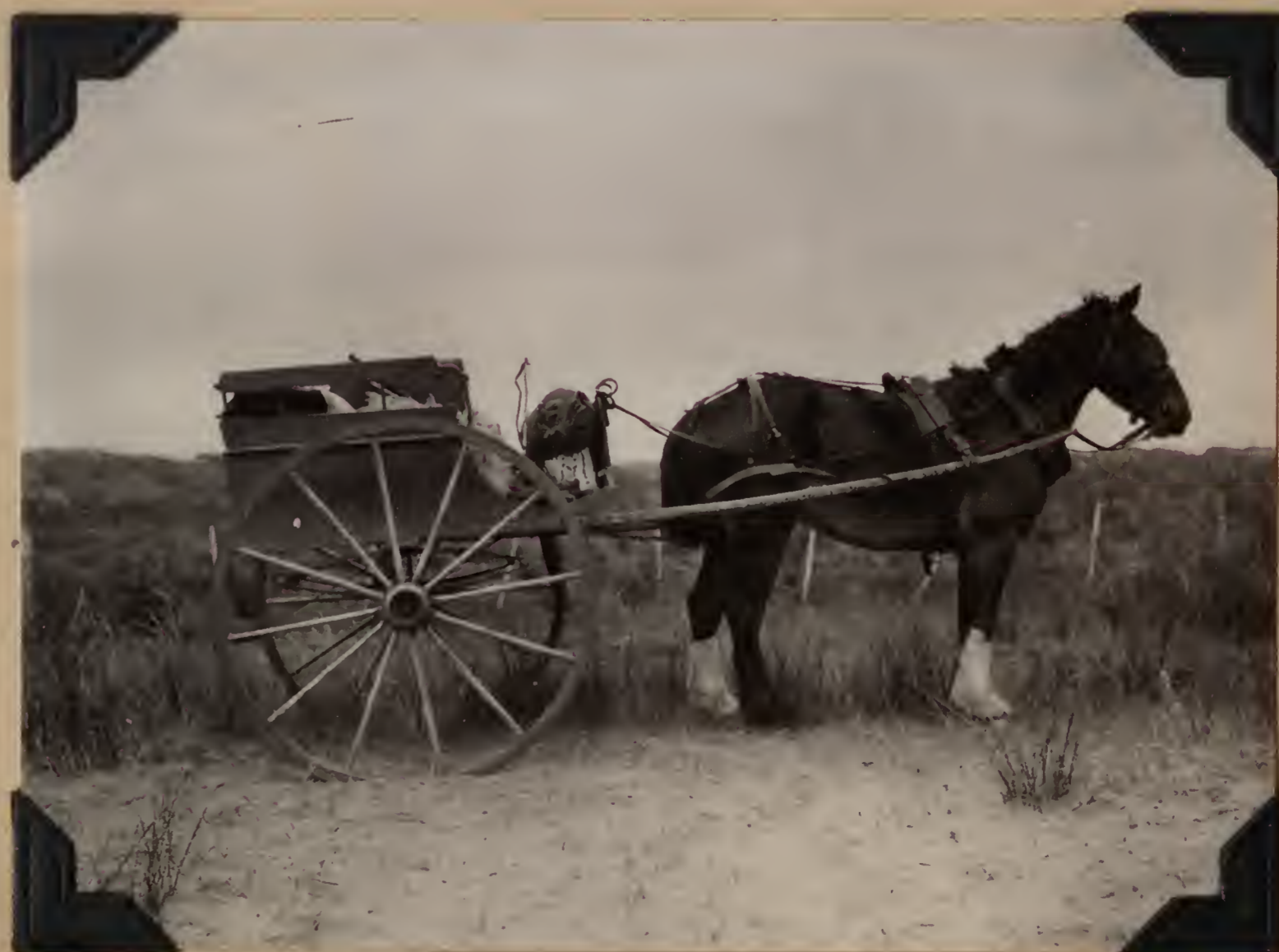
B.S. 22162. Collecting out- fit and sulky ready to leave camp, 15 miles south of Cabo Antonio. Lavalle, Buenos Aires, Argentina. November 8, 1920.