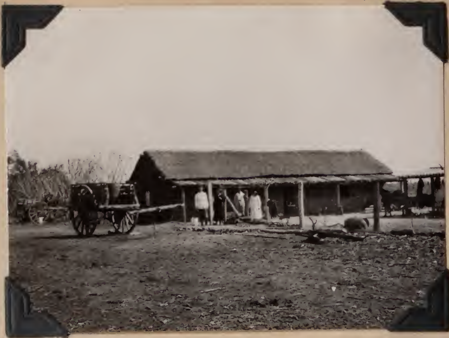
B.S. 22019. Hacienda Linda Vista. Riacho Pilaga, Formosa, Argentina. August 14, 1920.