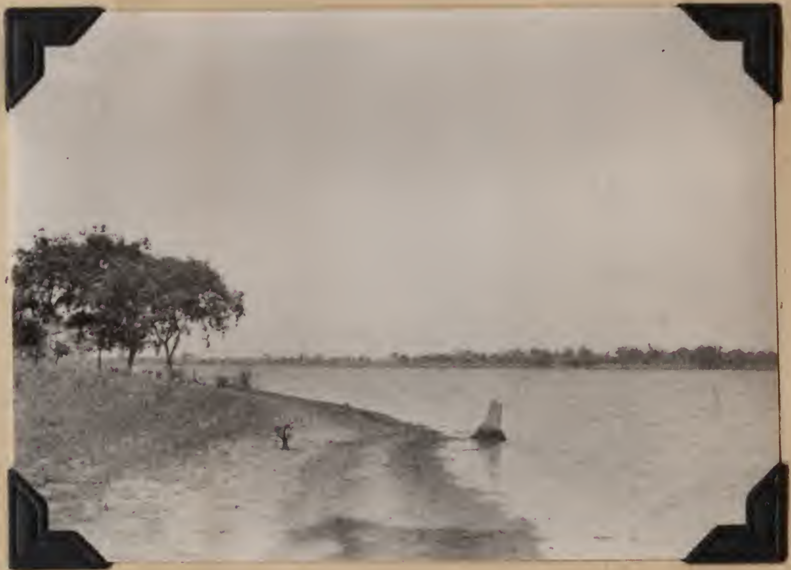
B.S. 22084. Open shore of lagoon frequented by shorebirds. Kilómetro 80. Puerto Pinasco, Paraguay. September 18, 1920.