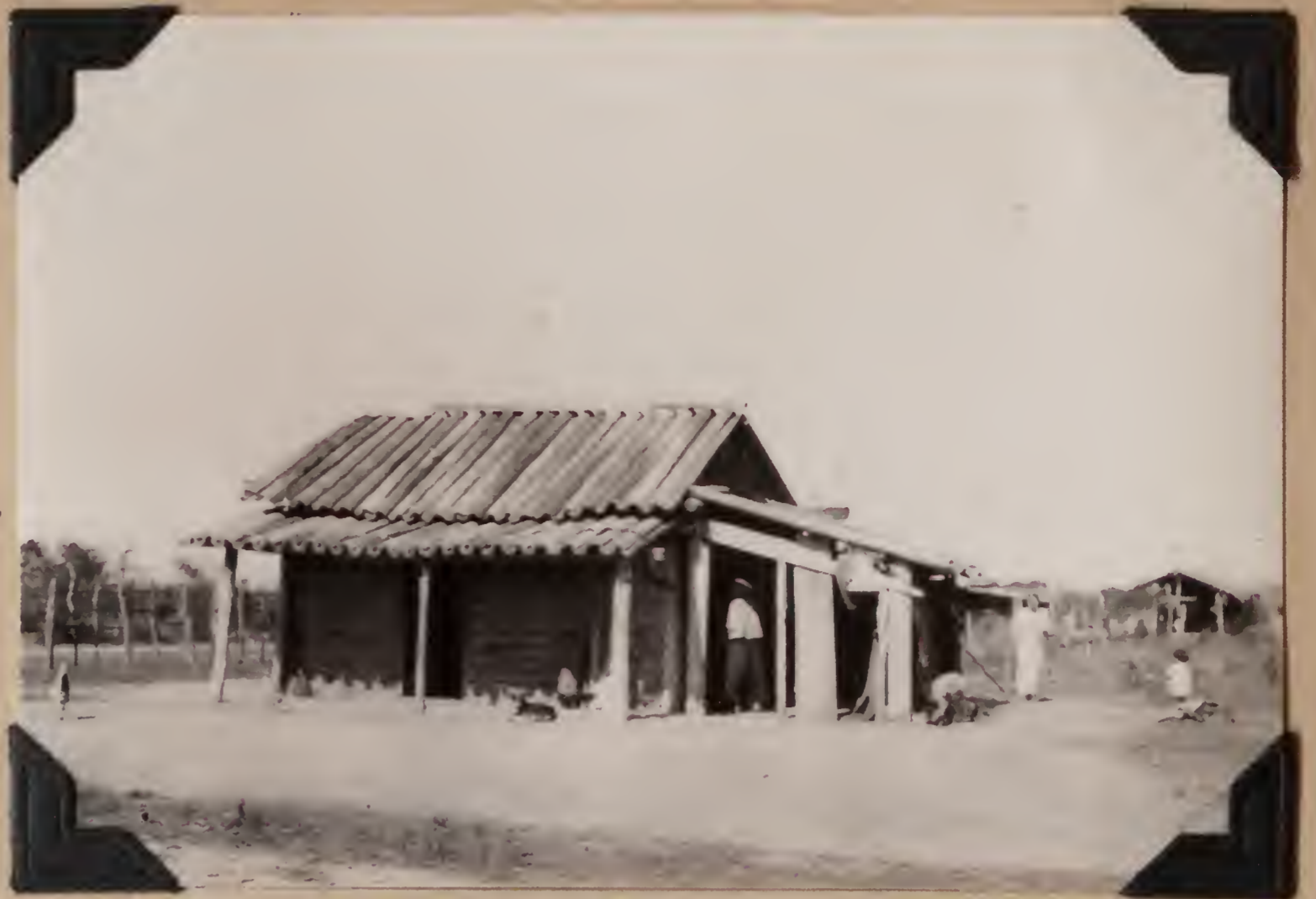
1353. House with roof of split palm trunks. Las Palmas, Chaco, Argentina. July 19, 1920.