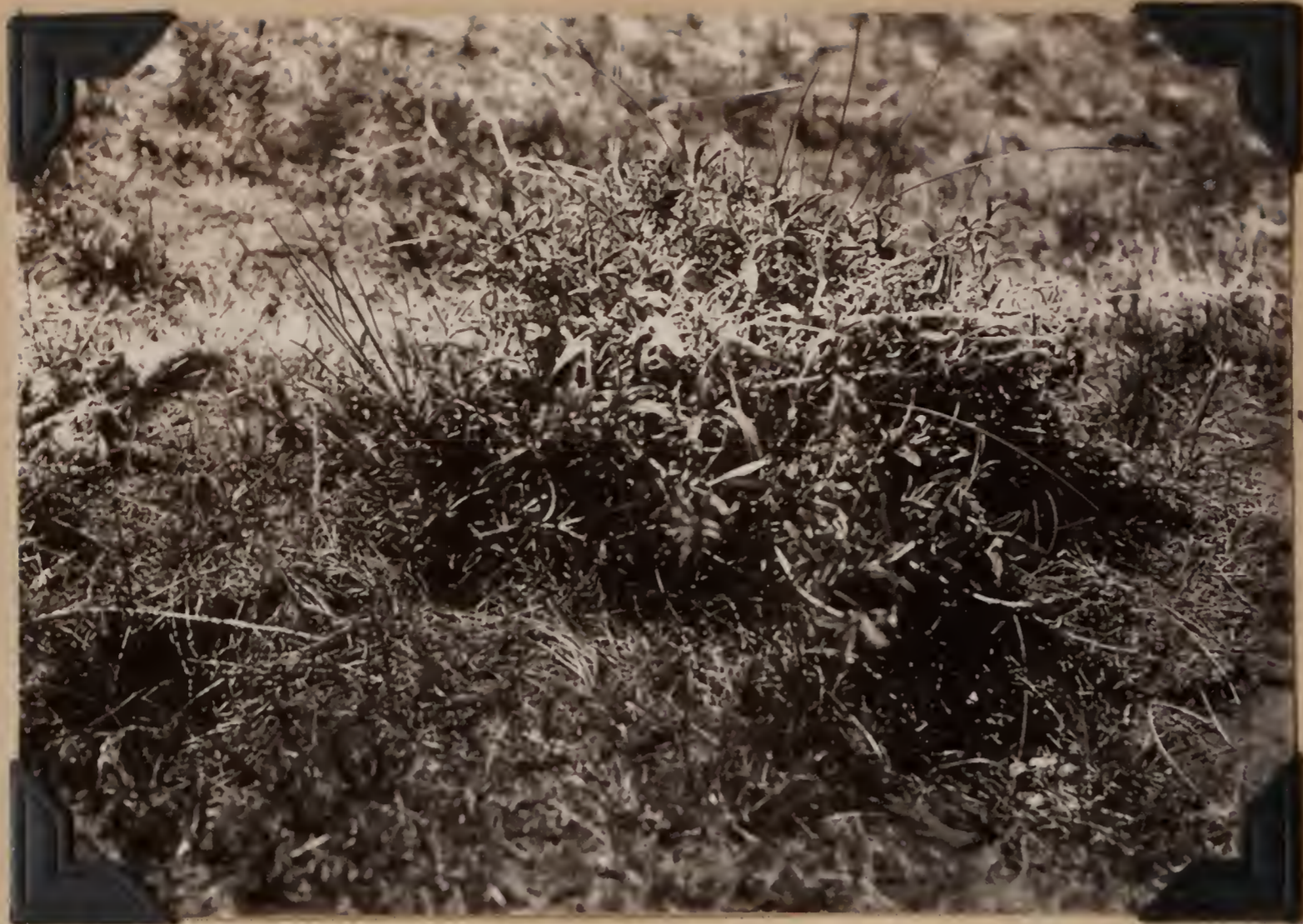
1416. Site of nest of Chingolo, Brachyospiza capensis argentina under plant in center. Estancia Los Ynglesés, Lavalle, Buenos Aires, Argentina. October 30, 1920.