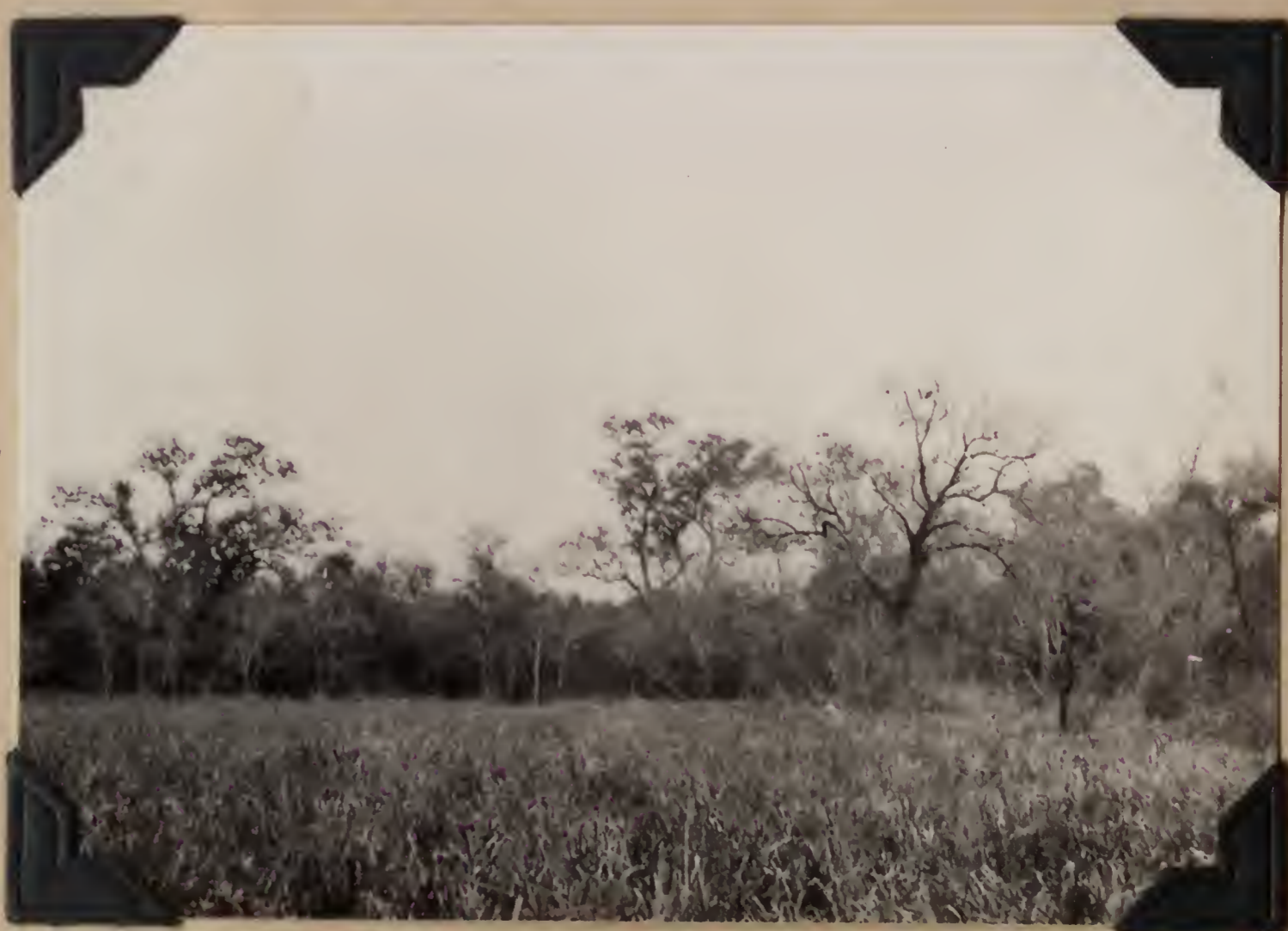
1372. Looking across a savanna to the border of forest. Riacho Pilaga, Kilómetro 182, Formosa, Argentina. August 8, 1920.