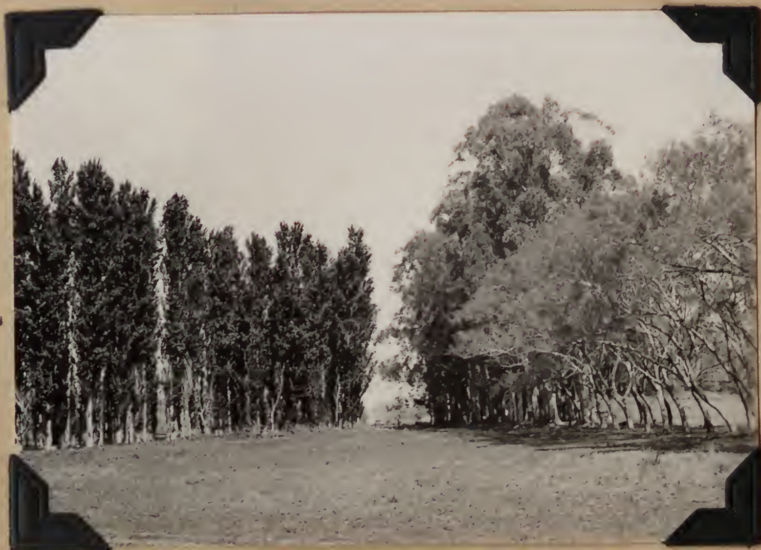
1413. Plantation of trees on the Estancia Los Ynglésés, Lavalle, Buenos Aires, Argentina. October 30, 1920.