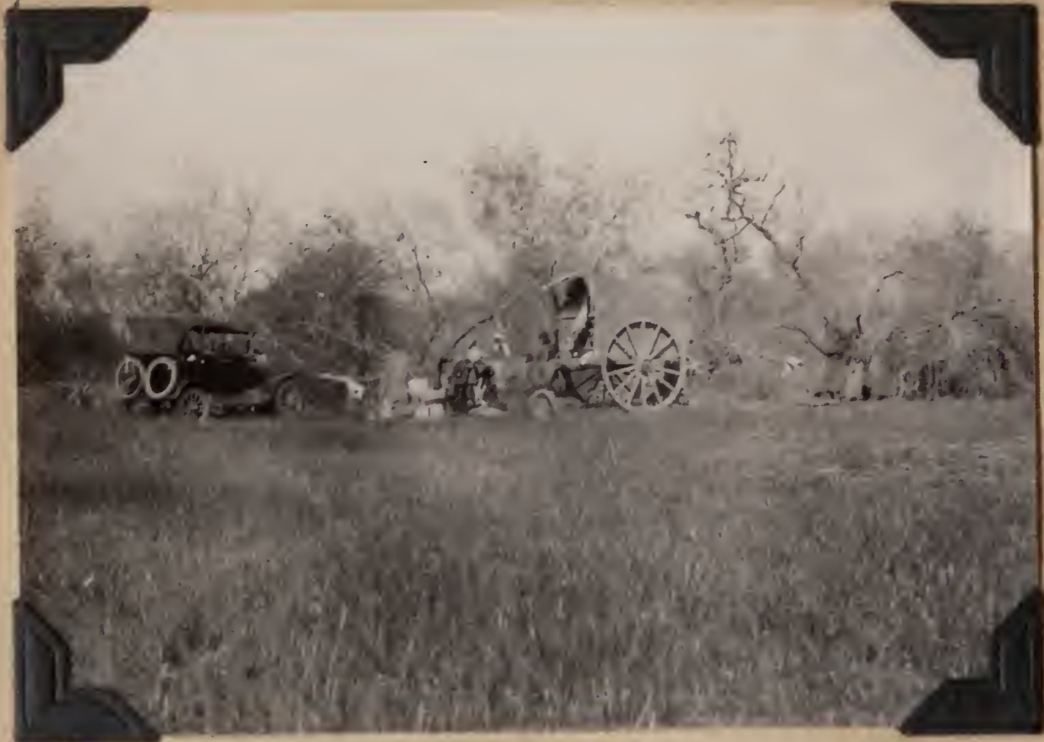
B.S. 22099. Camp at Laguna Wall in territory of Lengua Indians, Kilómetro 200. Puerto Pinasco, Paraguay.