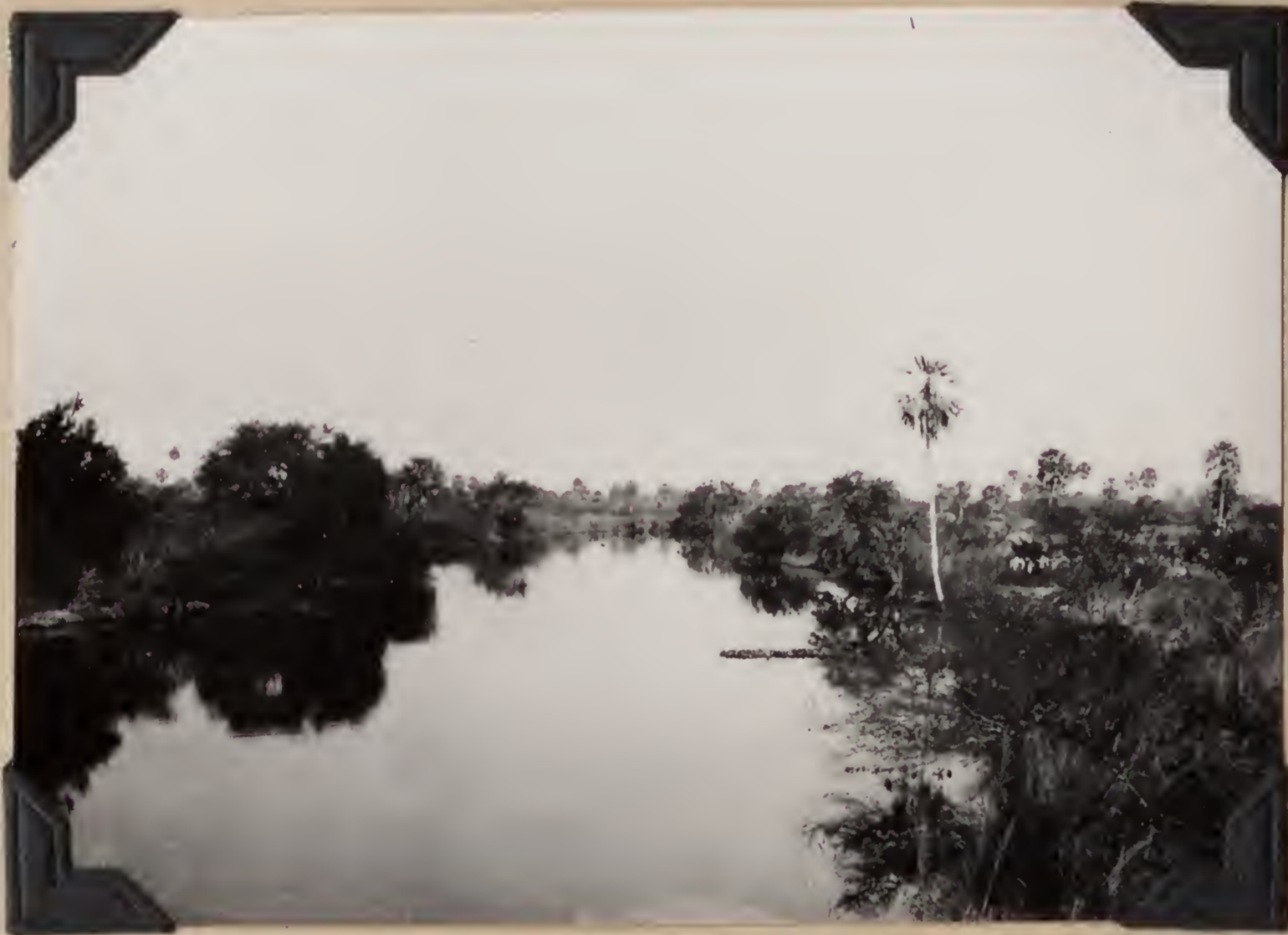
B.S. 22043. Sluggish stream running through a palm grown swamp. Formosa, Formosa, Argentina. August 23, 1920.