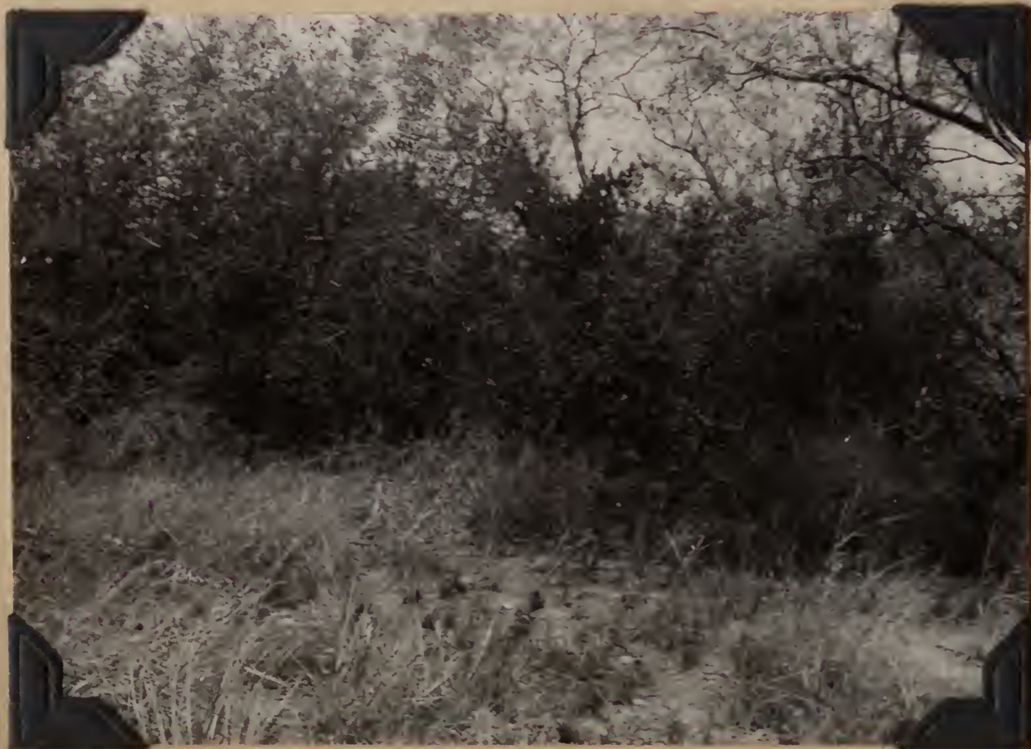
B.S. 22106. Entrance of Indian trail in monte, Laguna wall, Kilómetro 200. Puerto Pinasco, Paraguay.