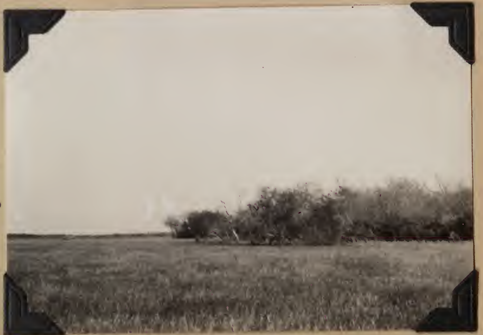
1397. Border of great monte of vinal at Laguna Wall. Kiló- metro 200, west of Puerto Pinasco, Paraguay. September 25, 1920.