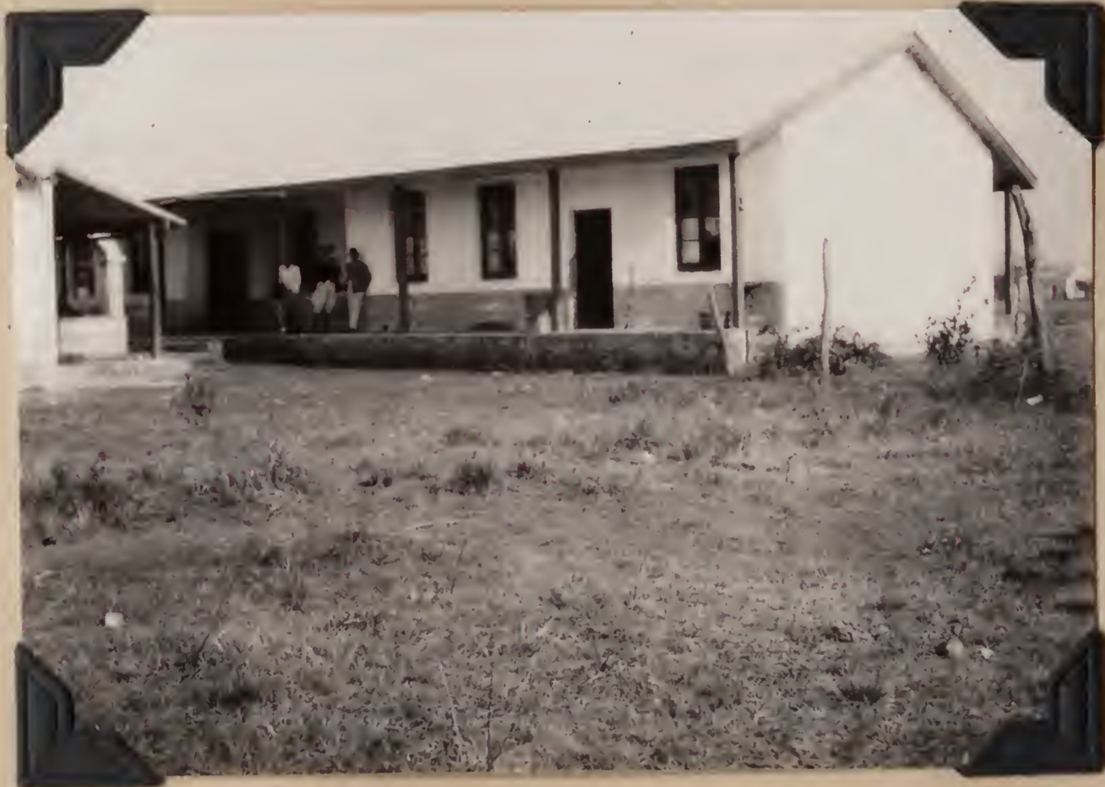
1354. My quarters in the fonda at Las Palmas, Chaco Argentina. July 19, 1920.