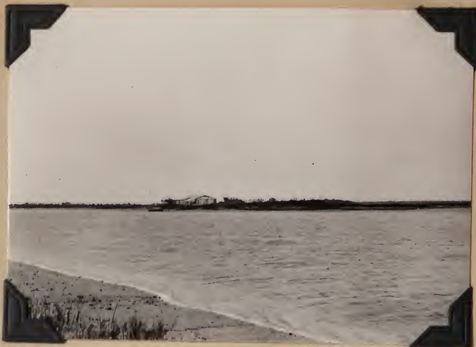
1410. Near the mouth of the Río Ajó, Lavalle, Buenos Aires, Argentina. October 25, 1920.