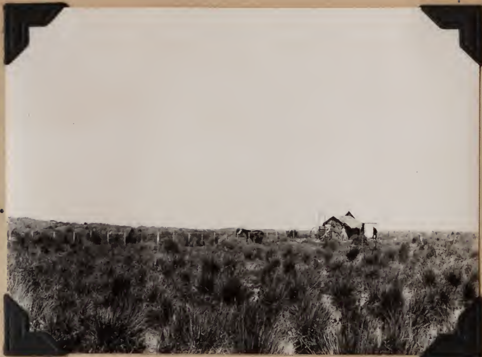
B.S. 22160. Camp in dunes 15 miles south of Cabo San Antonio. Lavalle, Buenos Aires, Argentina. November 8, 1920.