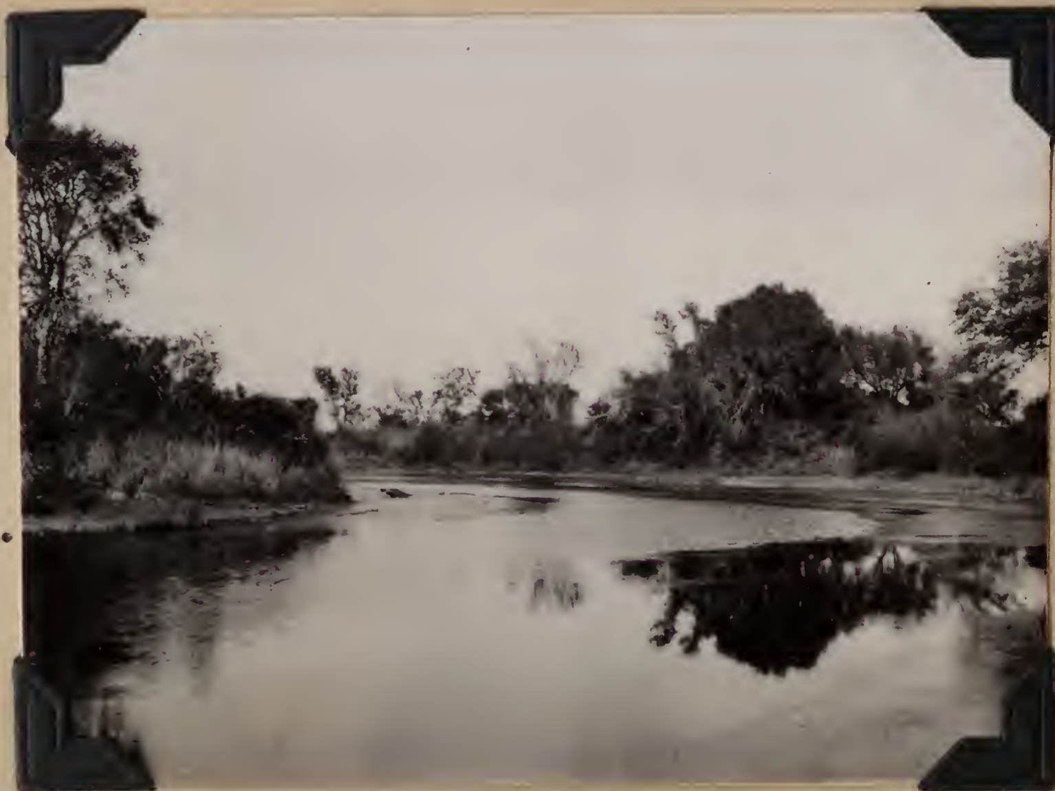
B.S. 22023. The Riacho Pilaga at low water stage. Riacho Pilaga, Formosa, Argentina. August 14, 1920.