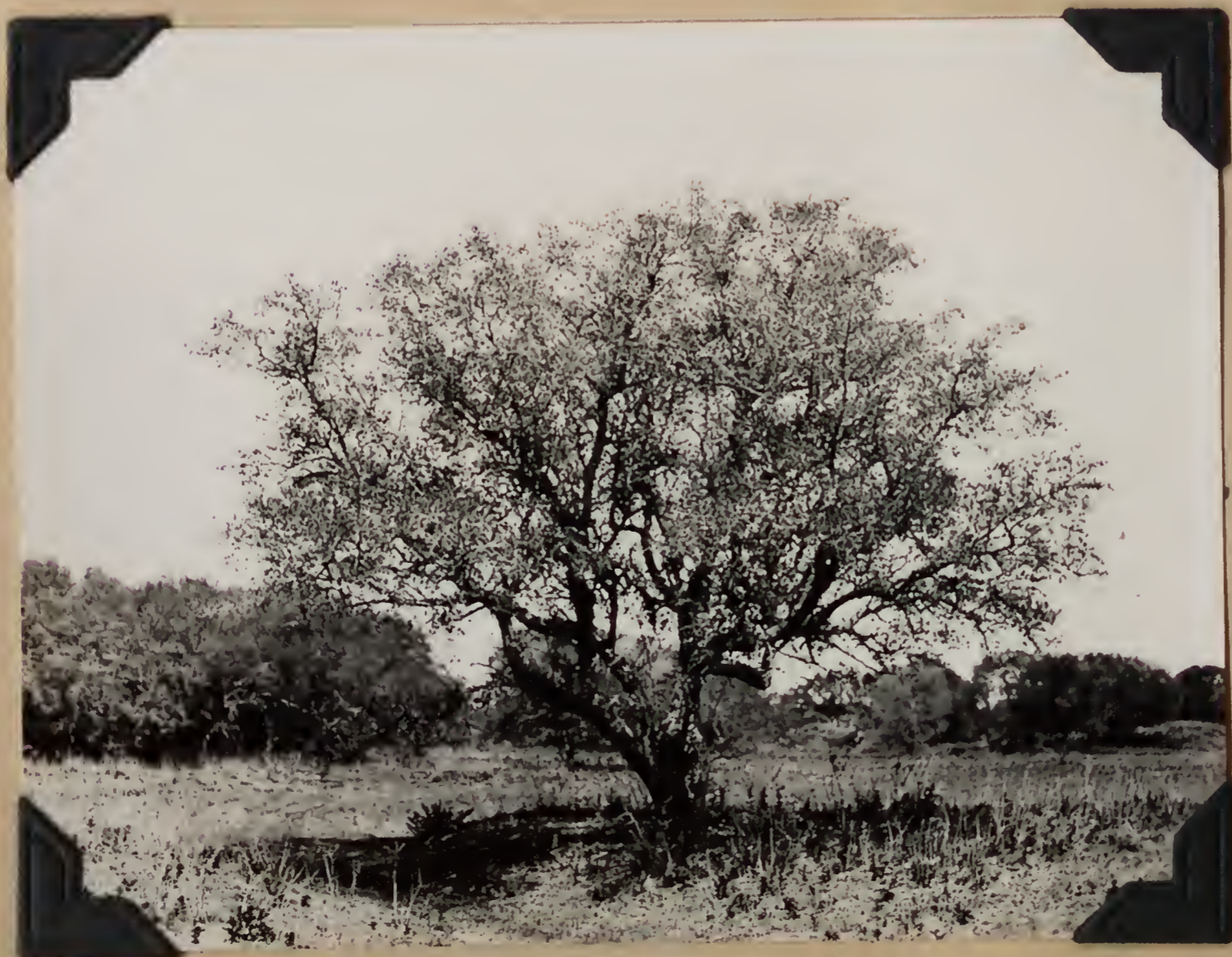
B.S. 22142. Tala Celtis tala , Estancia Los Ynglesés. Lavalle, Buenos Aires, Argentina. October 30, 1920.