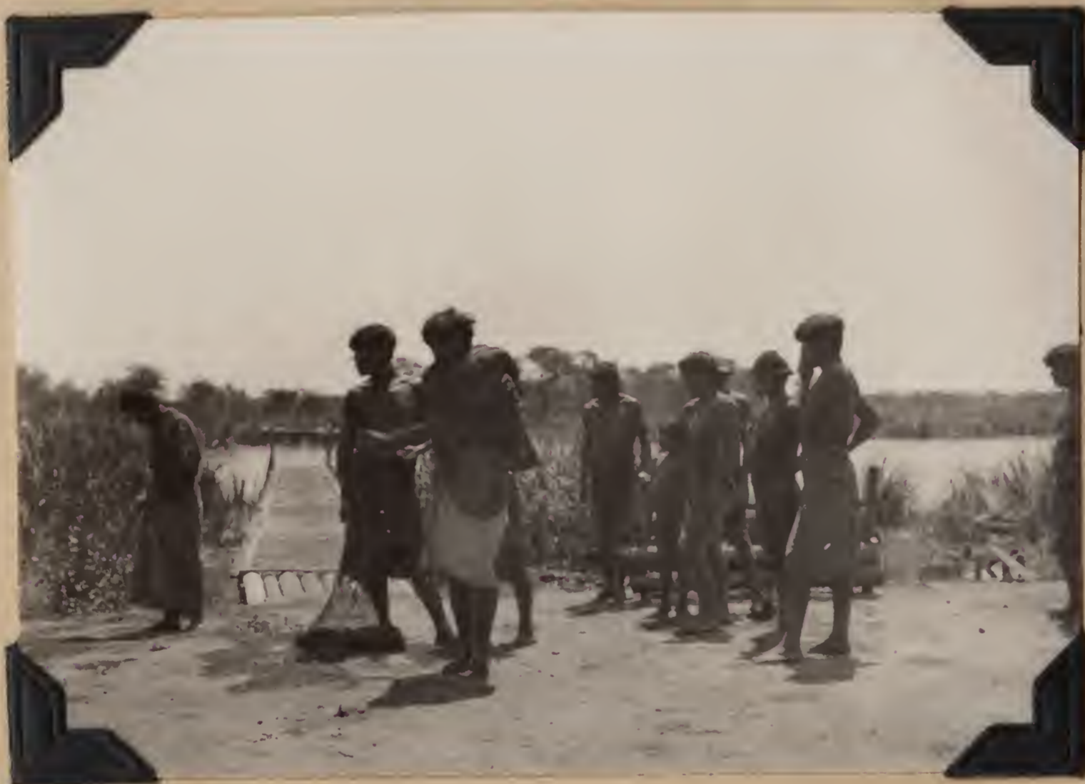
1406. Angueté fishermen at Kilómetro 110, west of Puerto Pinasco, Paraguay. September 26, 1920.