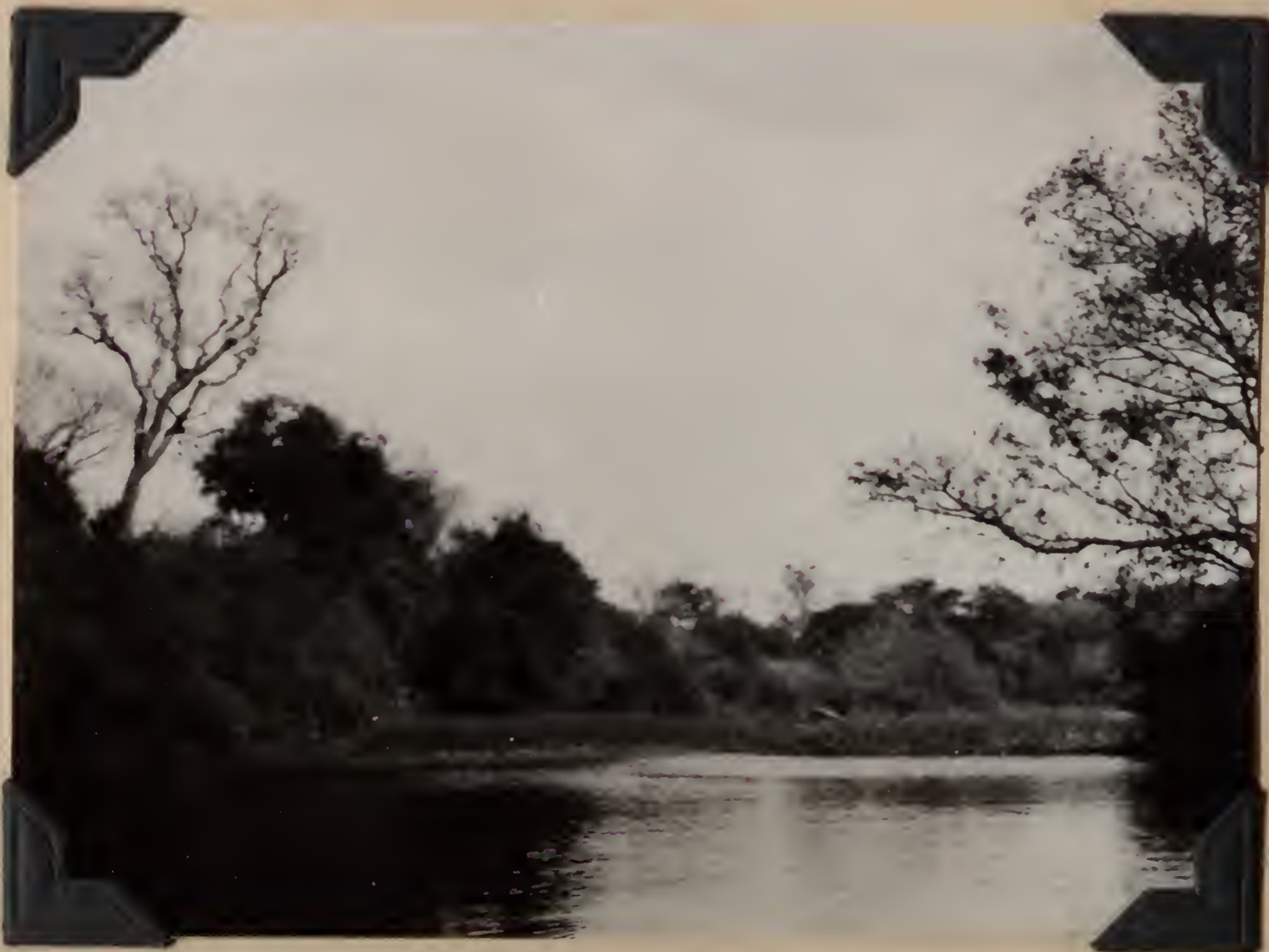
B.S. 21958. The Riacho Quia (Dirty Creek) floating vegetation in distance. Las Palmas, Chaco Argentina. July 19, 1920.