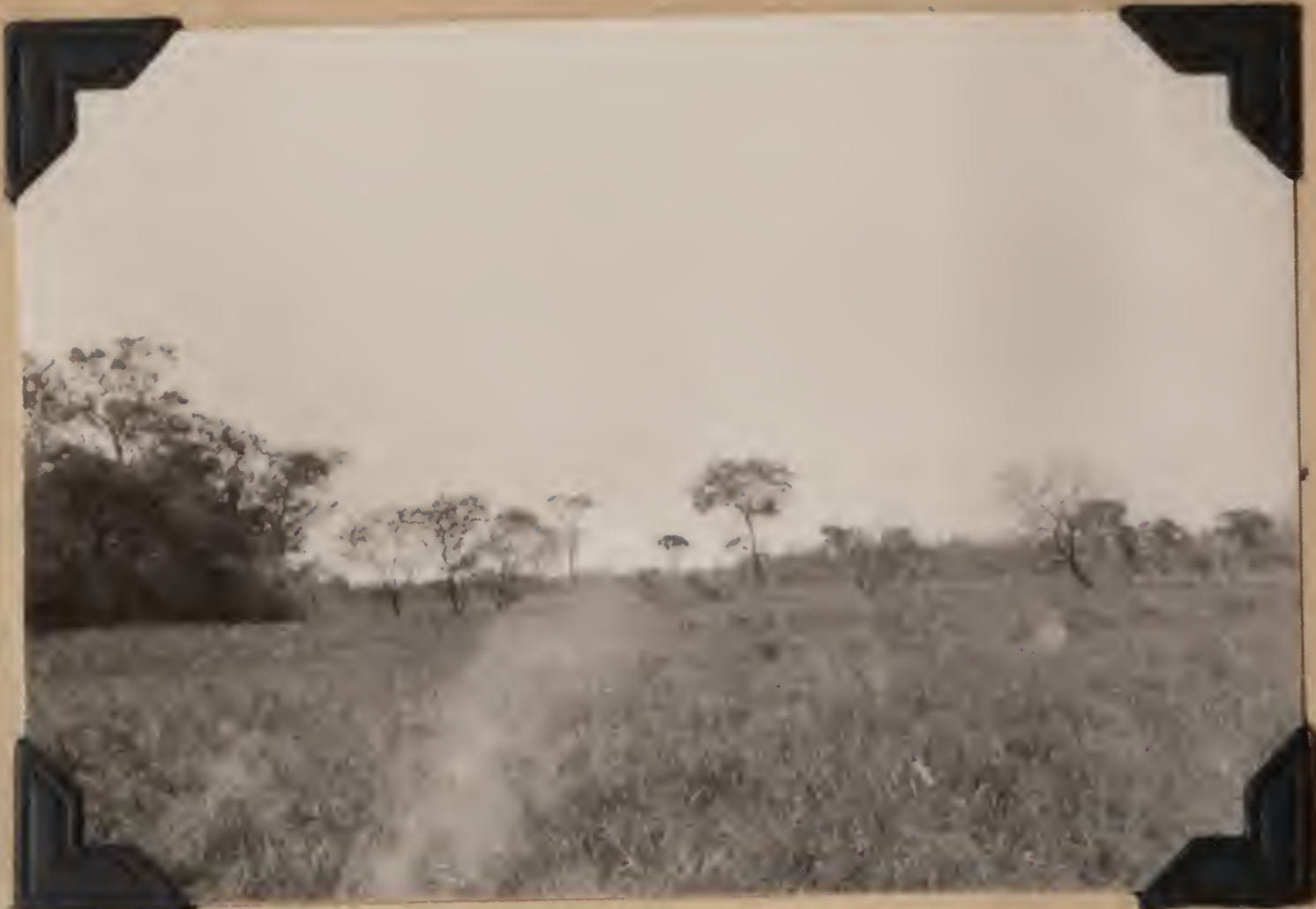
1404. Open country in the Chaco east of Riacho Salado. Kilómetro 165, west of Puerto Pinasco, Paraguay.