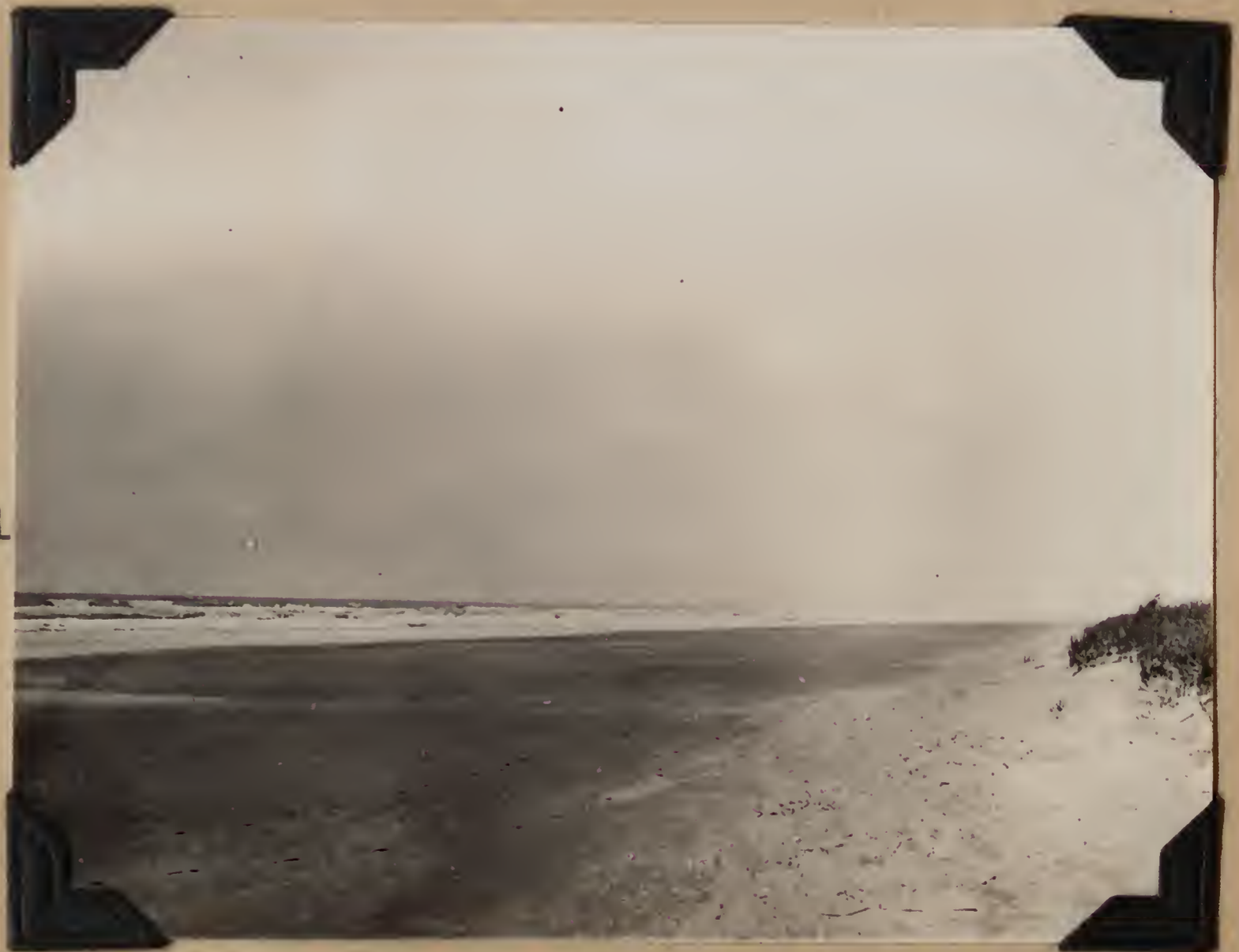
B.S. 22156. Ocean beach 15 mil below Cabo San Antonio. Lavalle, Buenos Aires, Argentina. November 7, 1920.