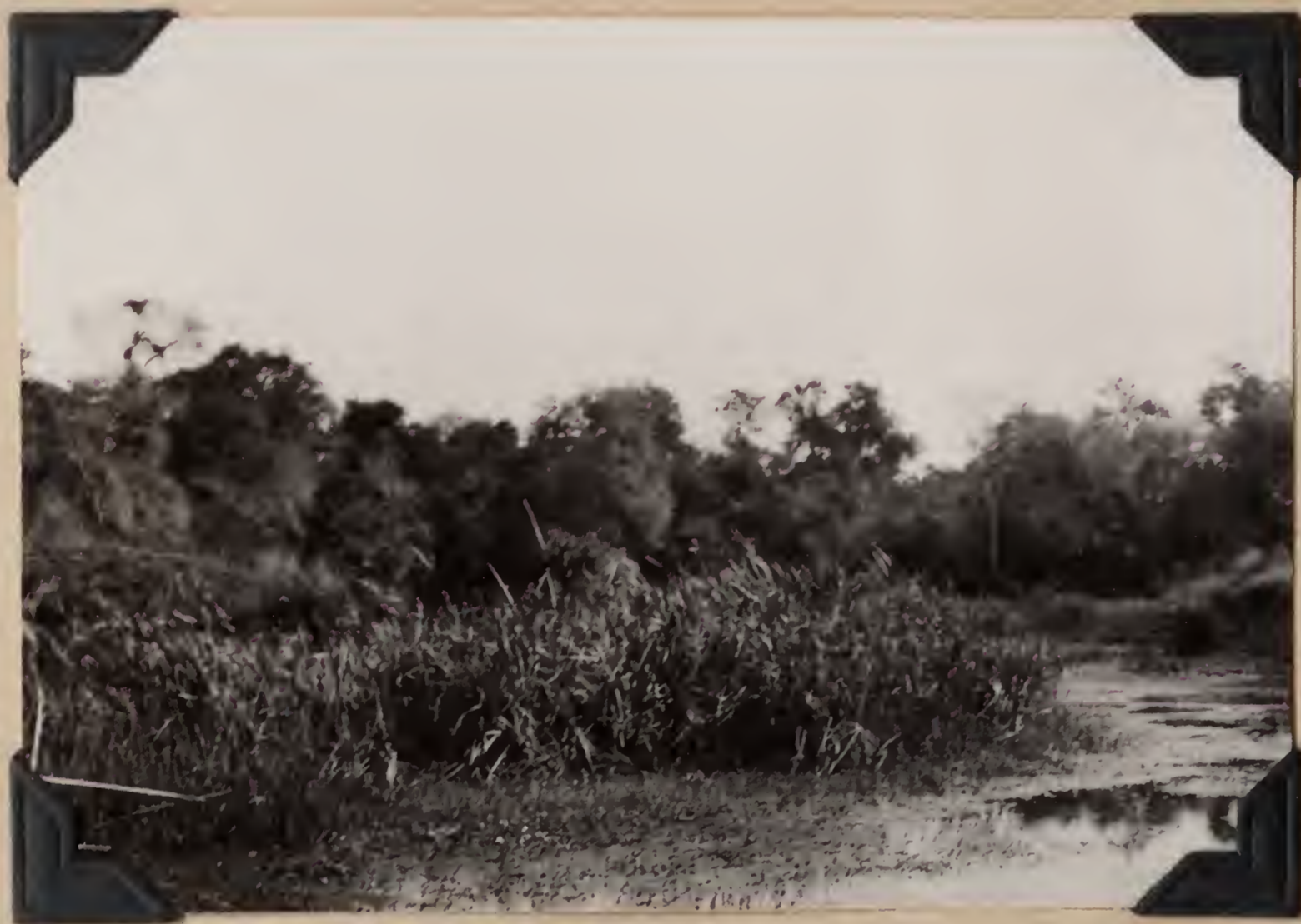
B.S. 21990. Vegetation in an estero. Las Palmas, Chaco, Argentina. July 30, 1920.