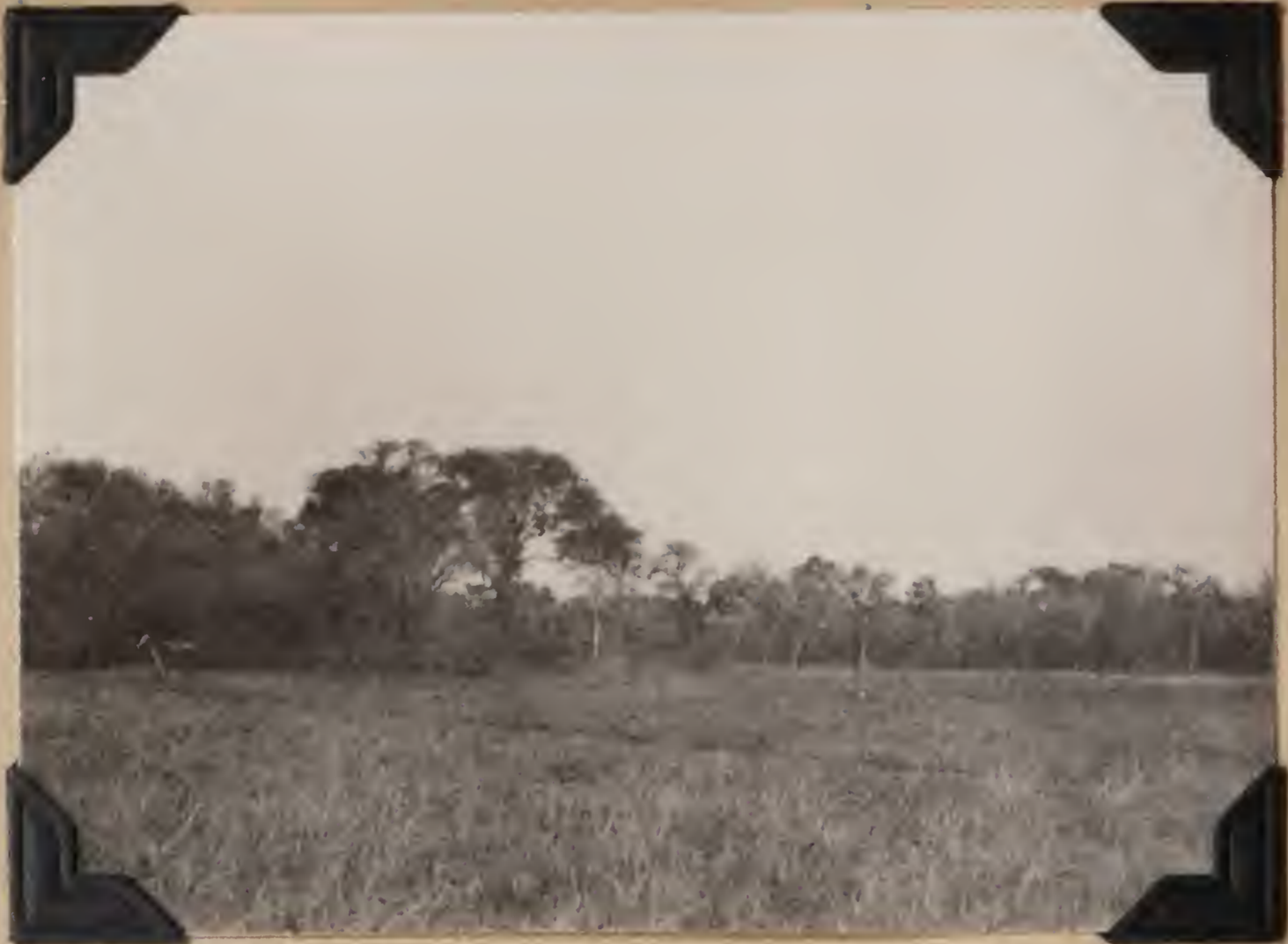
B.S. 22082. Open savanna and forest in Chaco, Kilómetro 80. Puerto Pinasco, Paraguay. September 16, 1920.