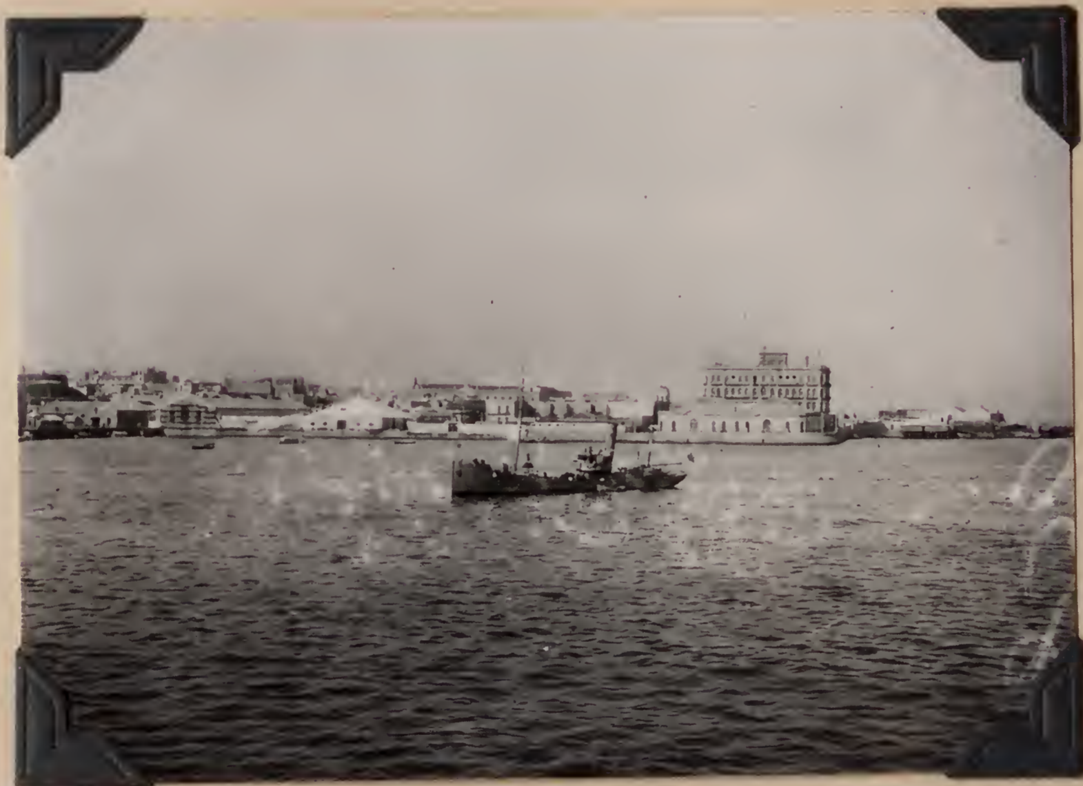
B.S. 21932. Waterfront. Montevideo, Uruguay. June 20, 1920.