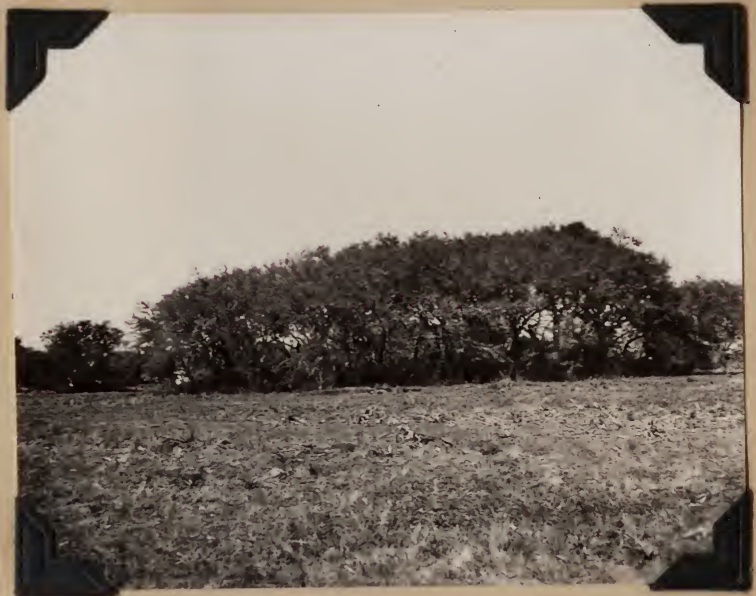
B.S. 22141. Tala ( Celtis tala ) trees in monte at Estancia Los Ynglesés. Lavalle, Buenos Aires, Argentina. October 30, 1920.