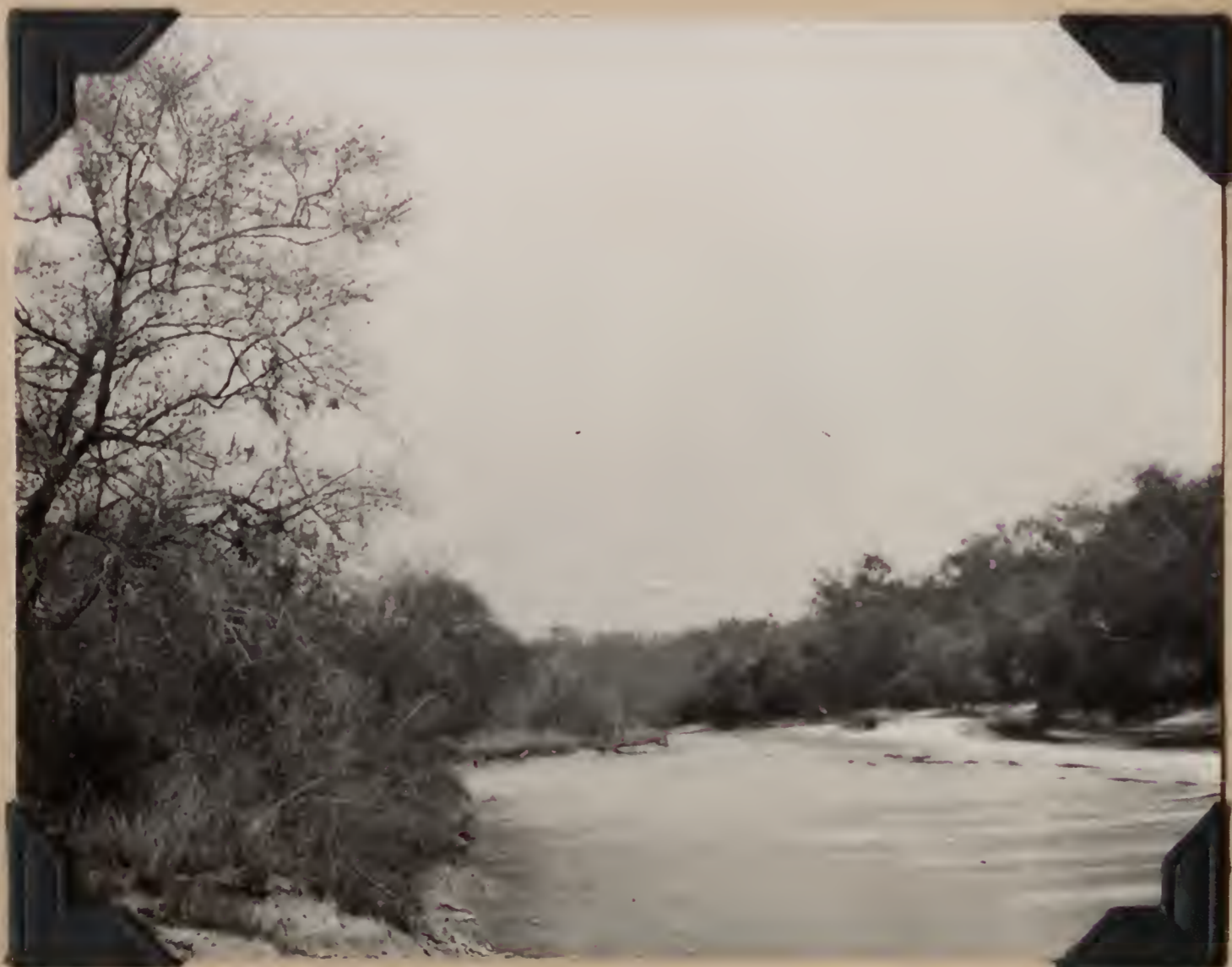
B.S. 22032. Alkaline bed of Riacho Inglés when water is low in winter. Riacho Pilaga, Formosa, Argentina. August 18, 1920.