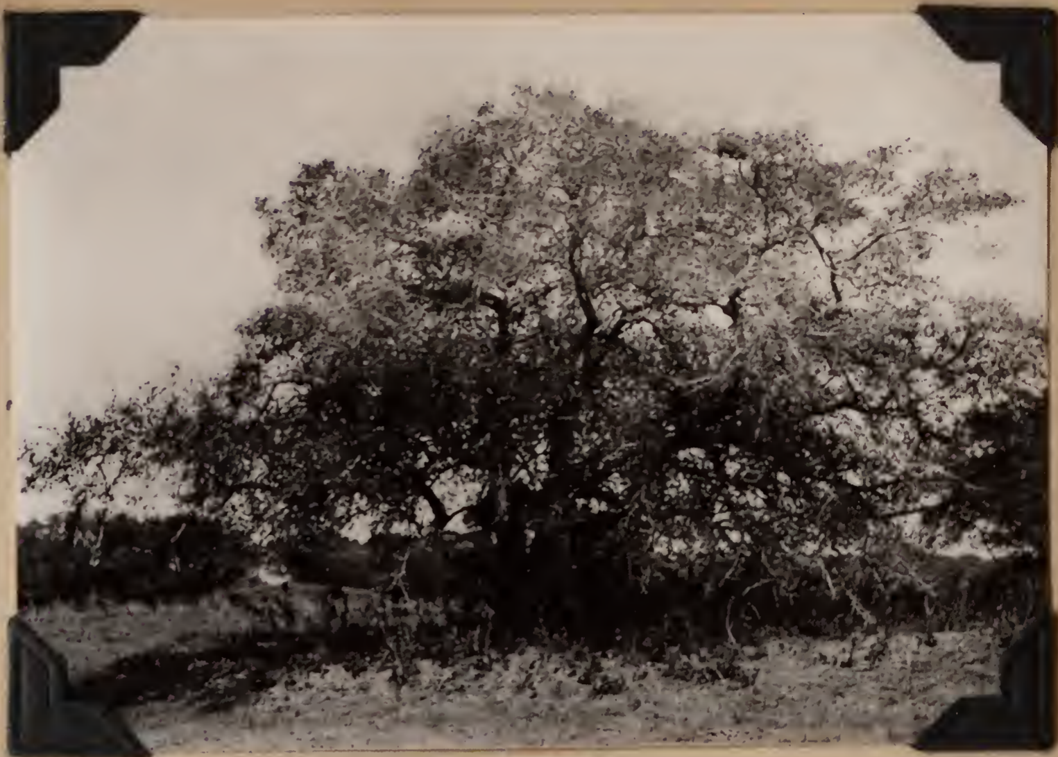
1414. A tala tree Celtis tala . Estancia Los Yngléses, Lavalle, Buenos Aires, Argentina. October 30, 1920.