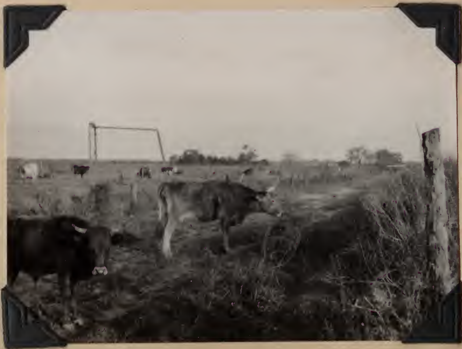
B.S. 21993. A flycatcher Machetornis rixosa perched on a cow. Las Palmas, Chaco, Argentina. August 1, 1920.