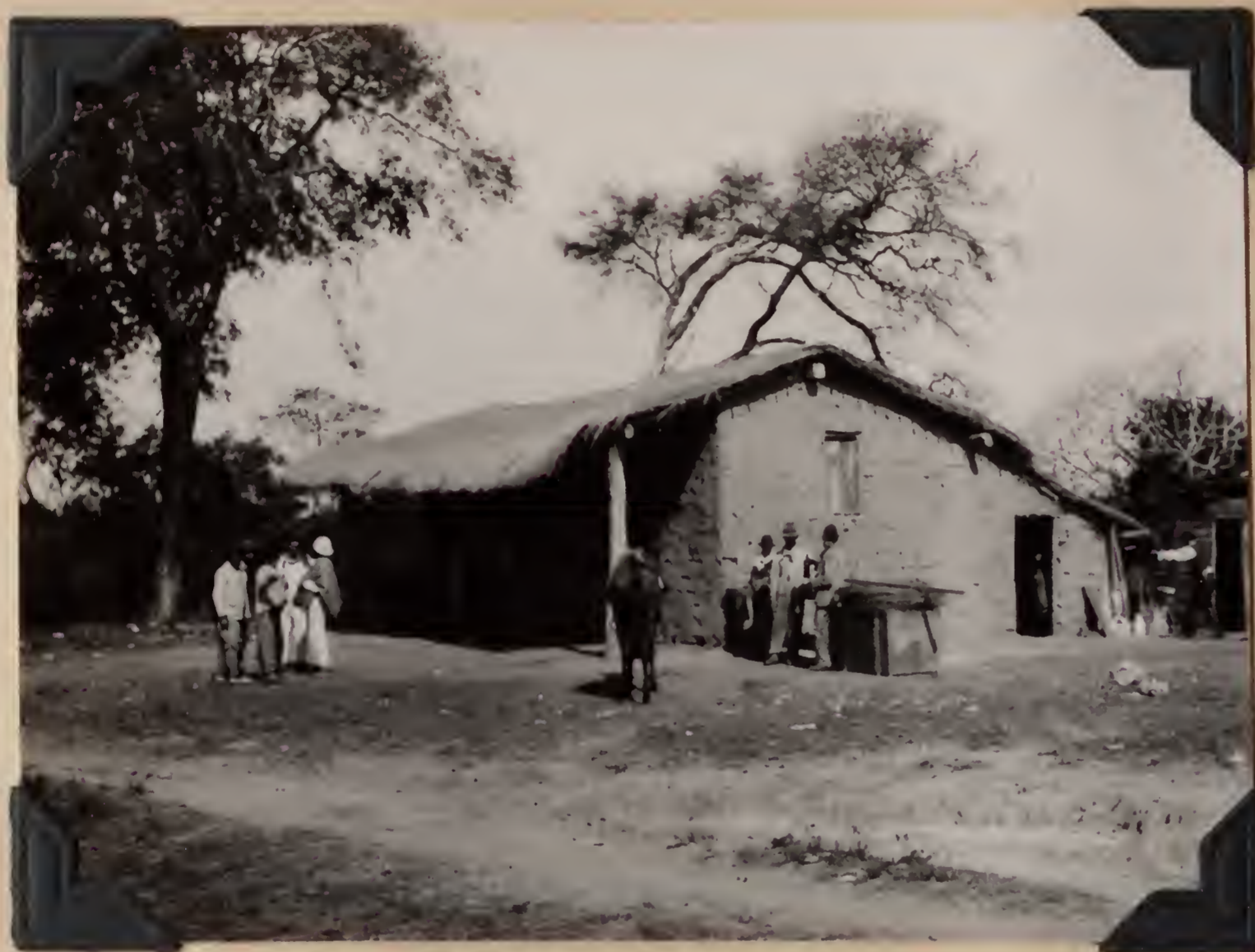
B.S. 21961. A wayside boliche (combination store and drinking place). Las Palmas, Chaco, Argentina. July 19, 1920.