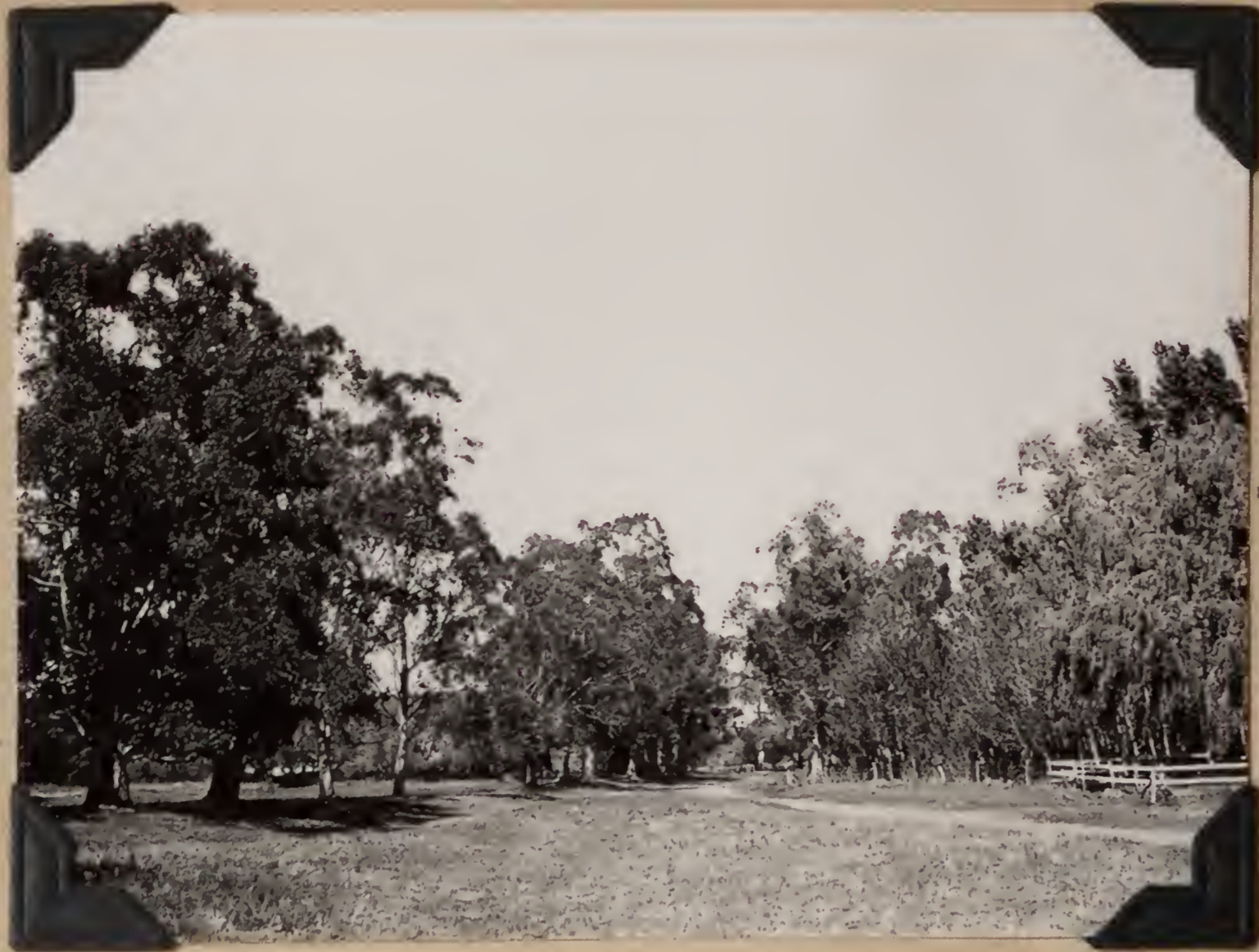
B.S. 22140. Typical planted grove on eastern pampas. Estancia Los Ynglesés. Lavalle, Buenos Aires, Argentina. October 30, 1920.