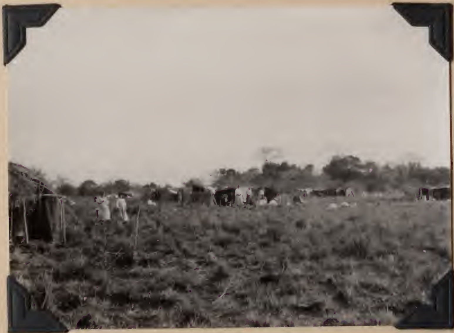
B.S. 21997. Toba village. Las Palmas, Chaco, Argentina. August 1, 1920.