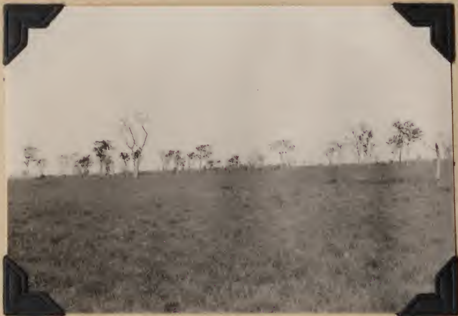
1402. Rolling land in the Chaco at Kilómetro 200, west of Puerto Pinasco, Paraguay.