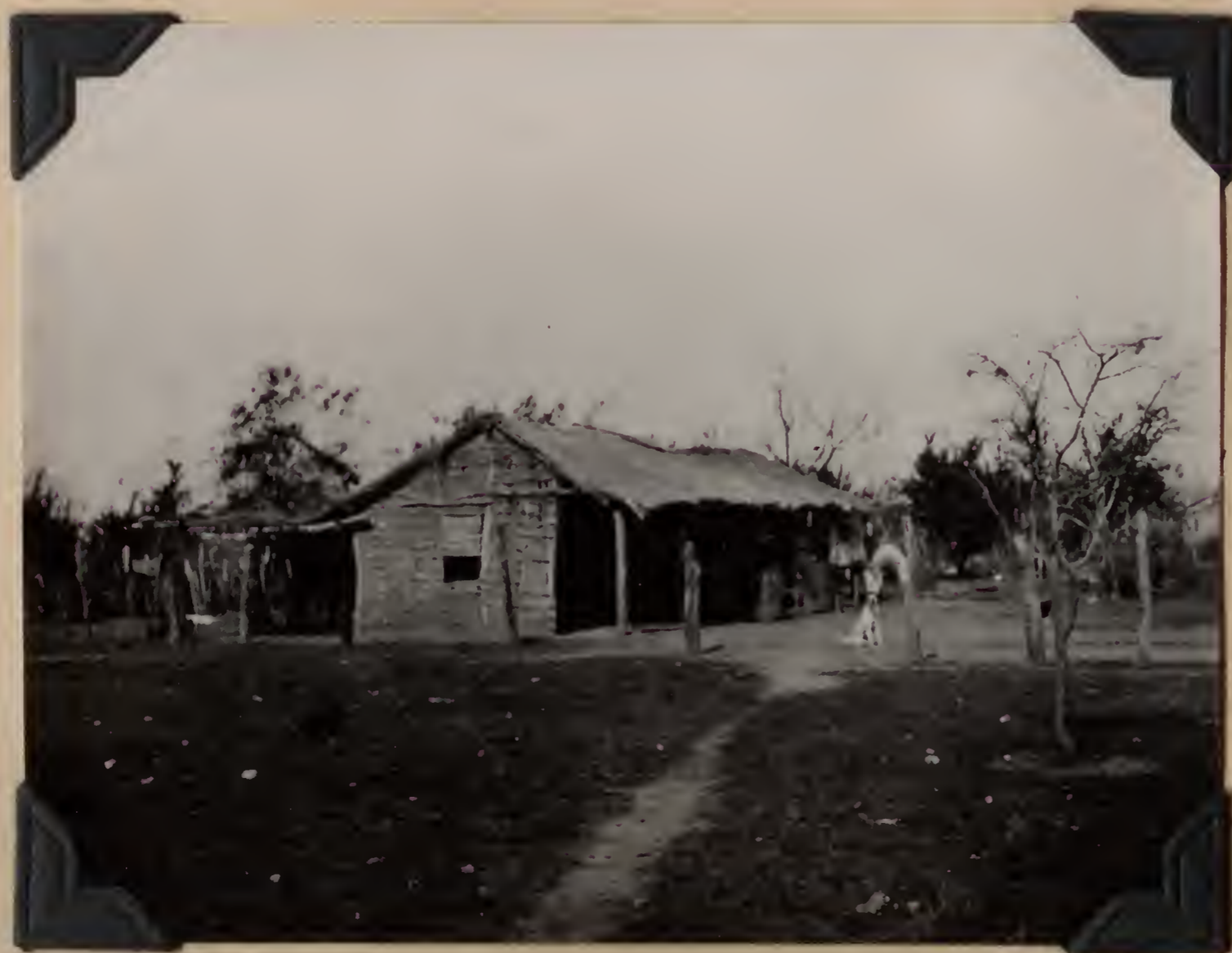
B.S. 21968. A grass-thatched hut built of mud plastered on a frame of wood. Las Palmas, Chaco Argentina. July 19, 1920.