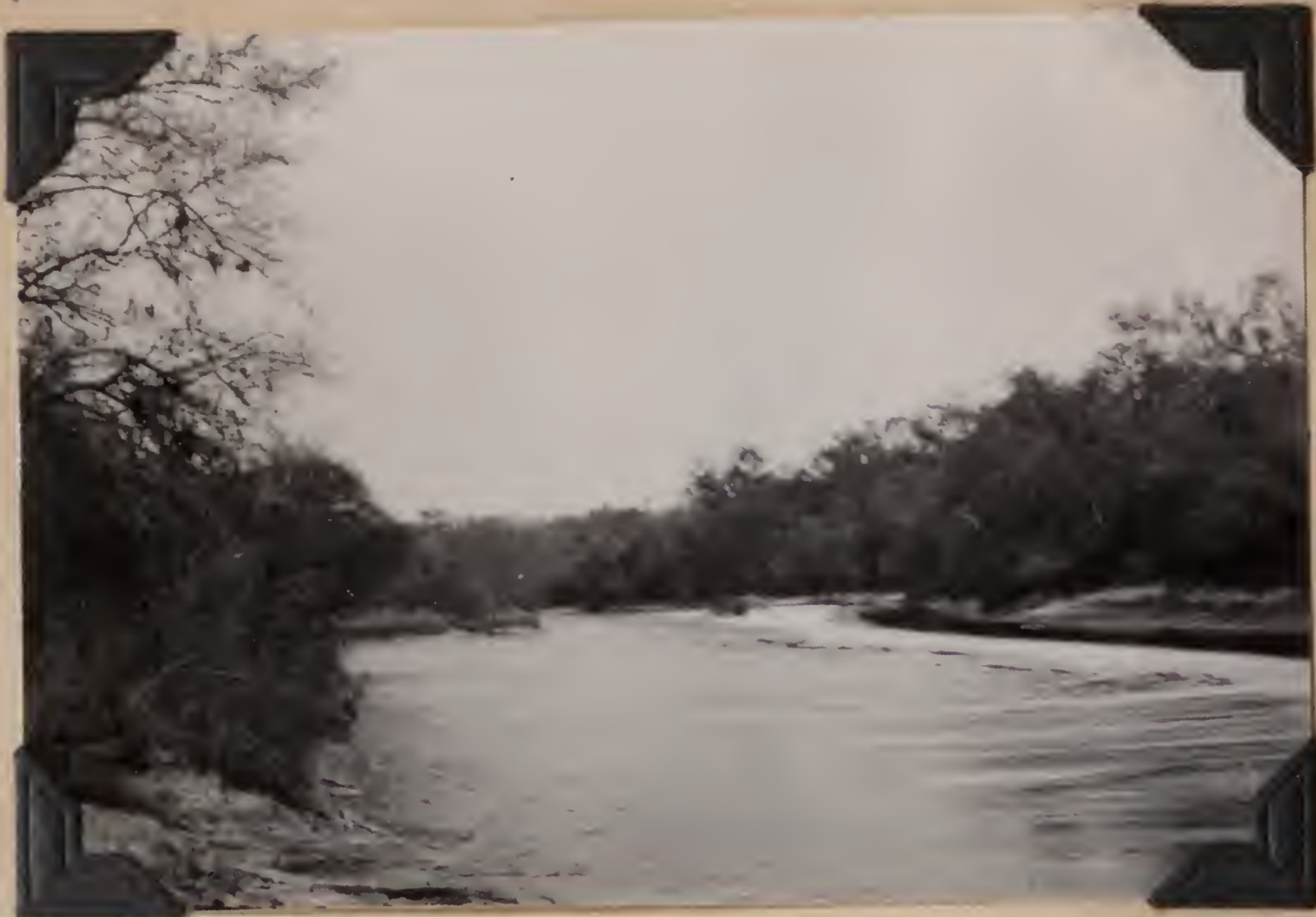
1380. Riacho Inglés, near the Hacienda Linda Vista, Formosa, Argentina. August 18, 1920.