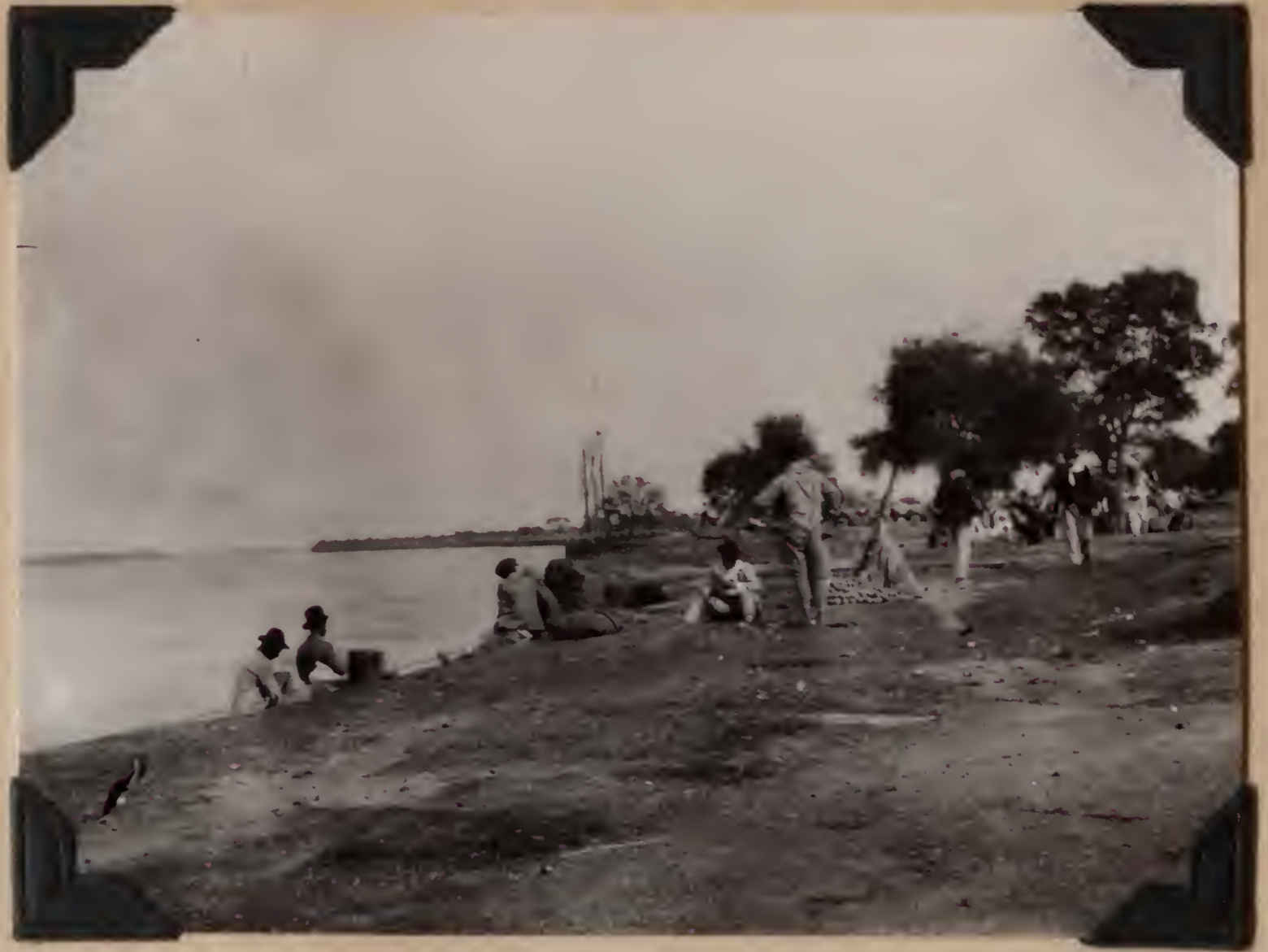
B.S. 22001. Río Paraguay. Puerto Las Palmas, Chaco, Argentina. August 2, 1920.