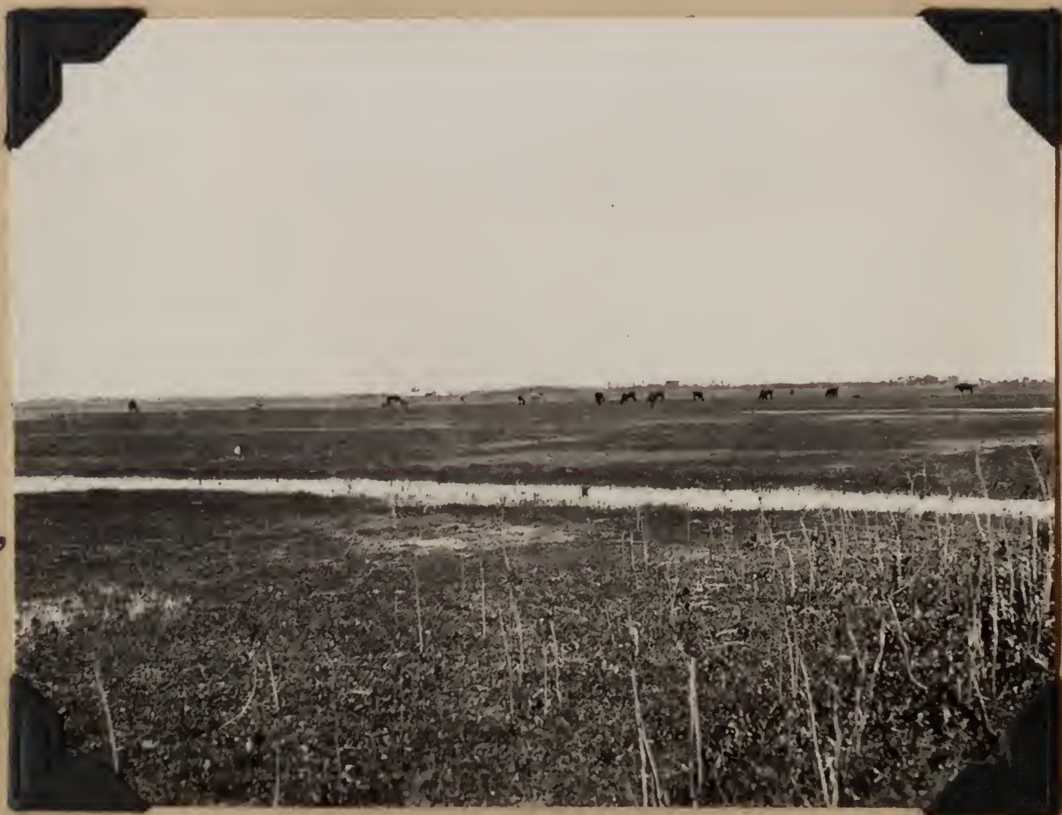
B.S. 22127. Small channel on low ground flooded by rain. A few greater and lesser yellowlegs and golden plover noted here. Conessa, Buenos Aires, Argentina. October 22, 1920.