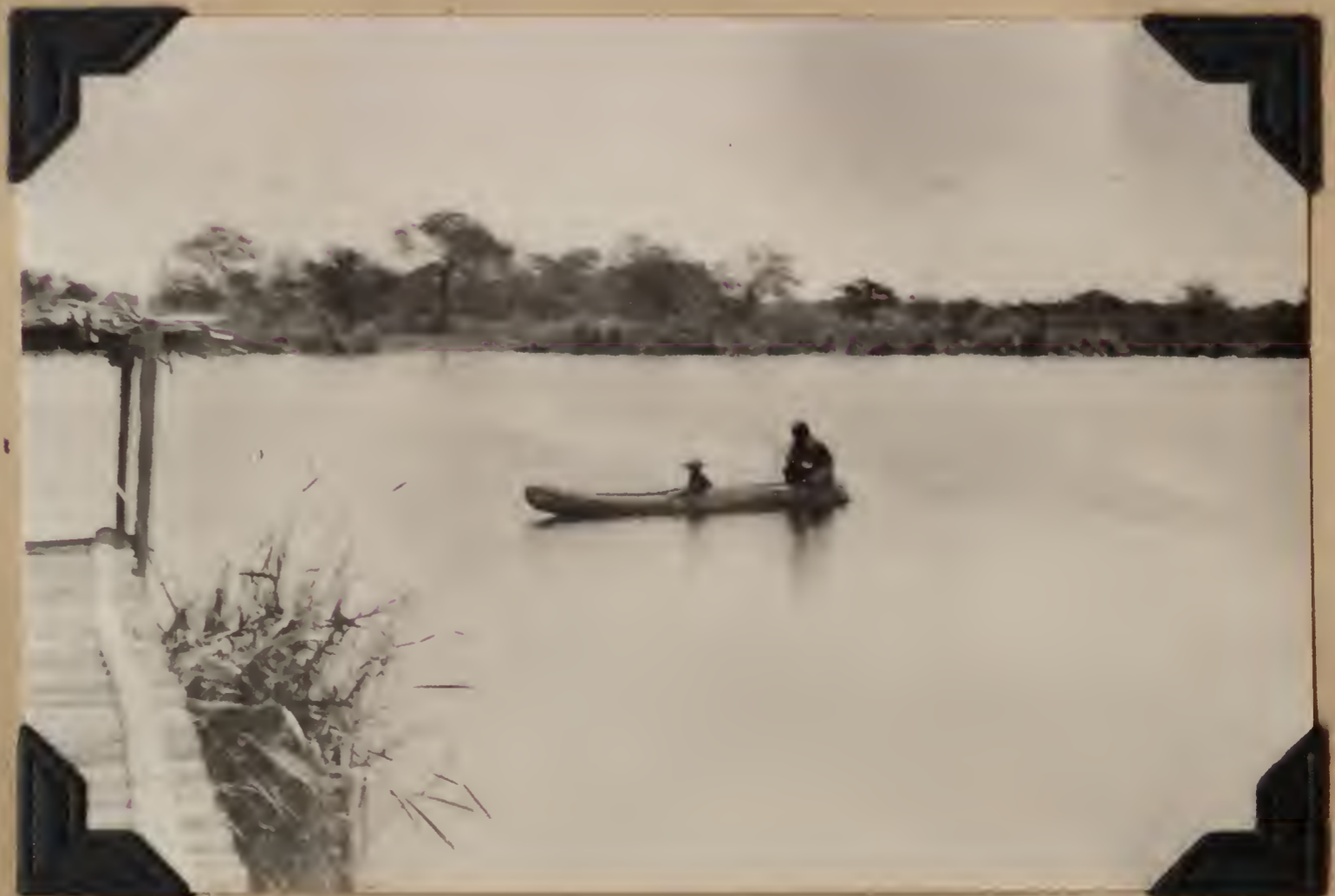
1407. Angueté Indians in a cachiveo at Kilómetro 110, west of Puerto Pinasco, Paraguay. September 26, 1920.