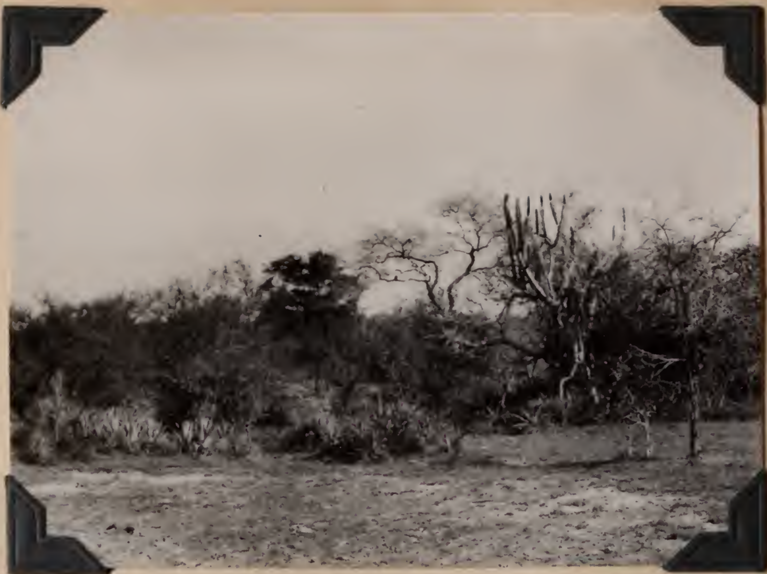
B.S. 21965. Cacti and scrubby forest. Las Palmas, Chaco, Argentina. July 19, 1920.