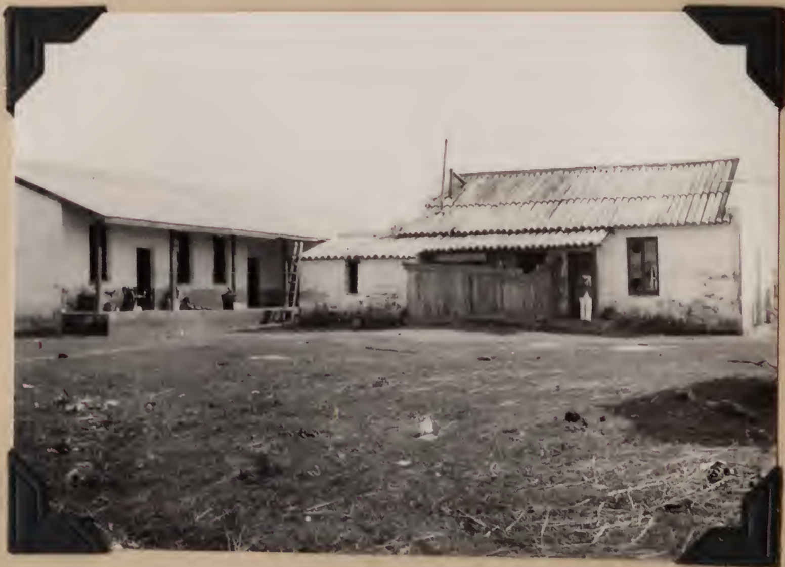
1360. The fonda at Las Palmas, Chaco, Argentina. July 29, 1920.