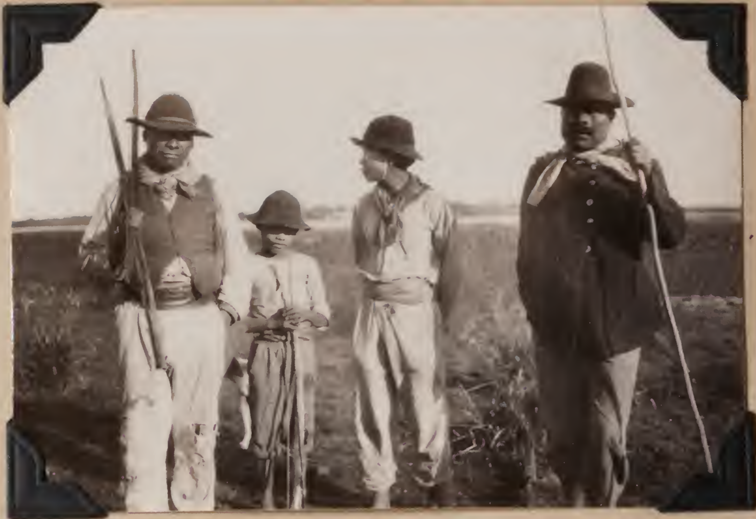
1356. Toba Indians on a fishing expedition. Las Palmas, Chaco, Argentina. July 23, 1920.