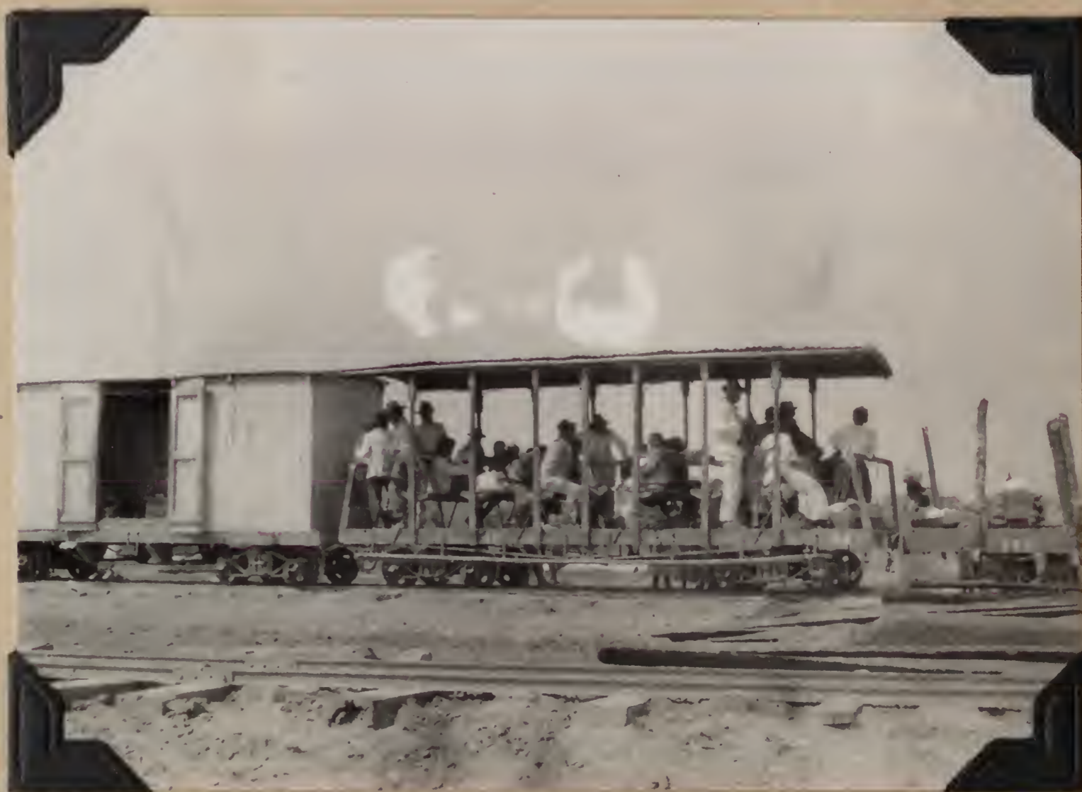
1389. Passenger coach on the ranch railroad running into the interior from the Río Paraguay at Puerto Pinasco, Paraguay. September 4, 1920.