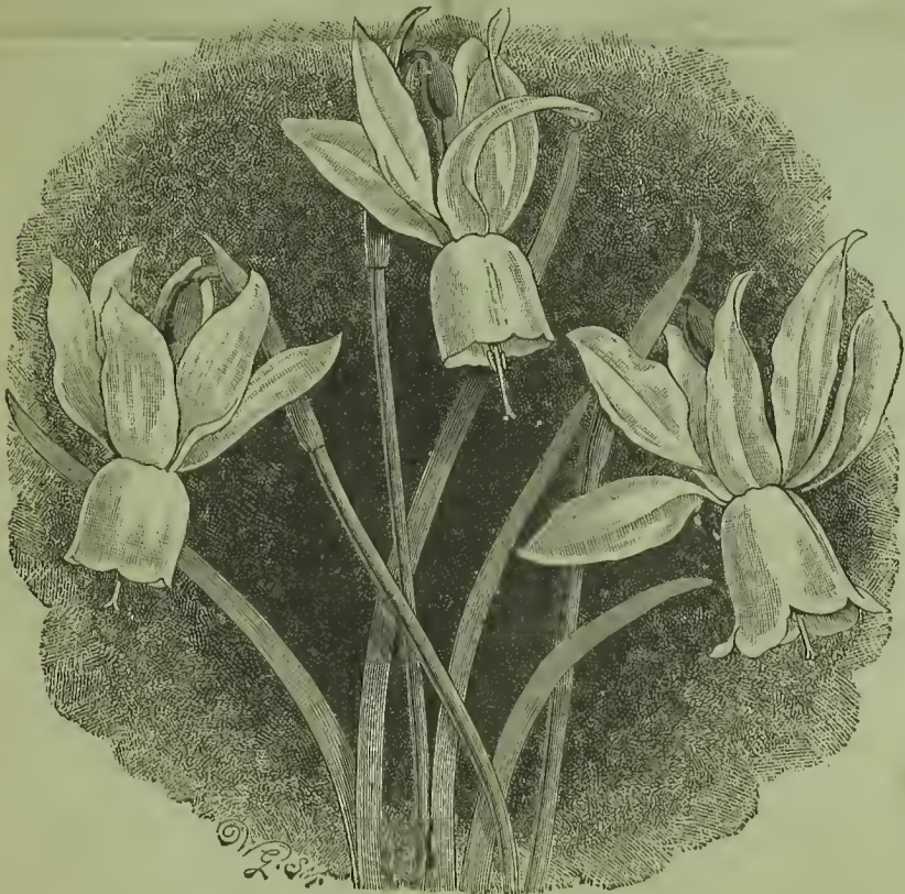
NARCISSUS TRIANDRUS ALBUS (ANGEL'S TEARS).