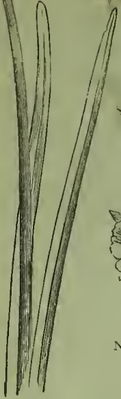
NARCISSUS AJAX CYCLAMINEUS.