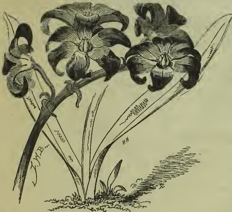
Established bulbs of Chionodoxa Luciliae have from 10 to 20 blossoms on a spike. The new species, C. sardensis, is even more floriferous.

"The Chionodoxa Luciliae is, without doubt, the finest addition that has recently been made to our list of hardy spring-flowering dwarf bulbous plants. Its habit at once reminds one of the two-leaved Squill ( Scilla bifolia ), as it rarely develops more than a pair of leaves. The blossoms, from five to ten in number, are produced on gracefully arched stems, from 4 to 8 inches high, and are each nearly one inch across, star-like in form, and of a beautiful blue tint on the outside, gradually merging in to pure white in the centre. As to the hardiness of Chionodoxa Luciliae there can be no doubt, as it has withstood the past trying winter with impunity, and flowered freely during March and April."