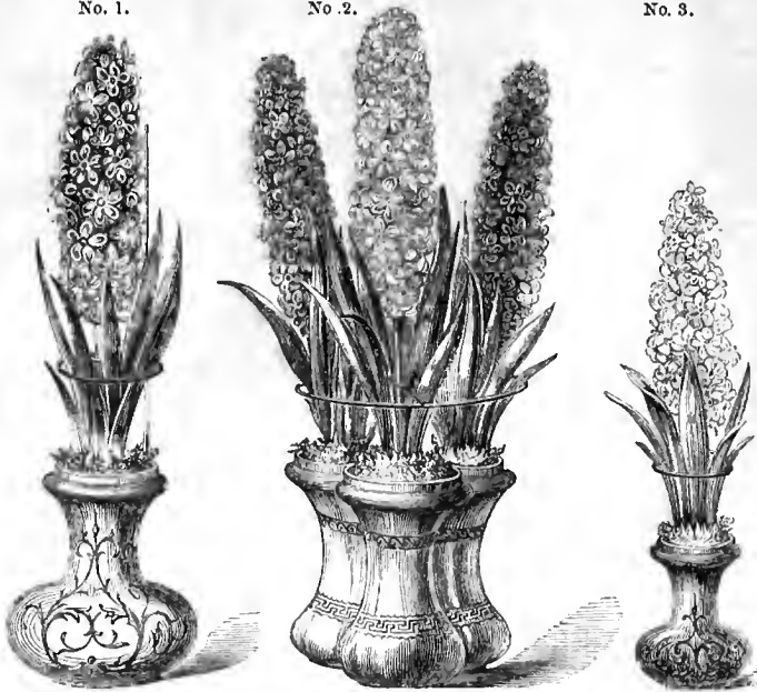
The following (No. 1) Hyacinth Glasses hold one Bulb.