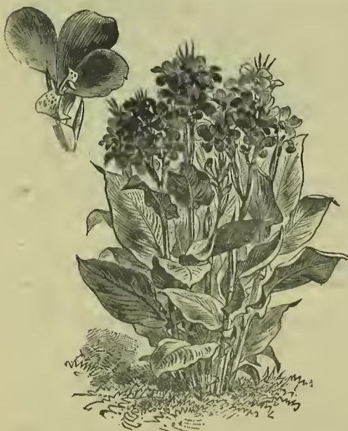
CROZY'S LARGE-FLOWERED DWARF CANNAS.

Crozy's New Large-flowered named varieties per doz, 10s. 6d. & 15 0... —