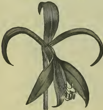
AMARYLLIS FORMOSISSIMA (JACOBEA LILY.)

AMORPHOPHALLUS , curious and ornamental bulbous plants from the tropics, interesting as pot plants and valuable for sub-tropical bedding. The tubers should be kept dry and away from frost during winter, and planted outdoors March to April, 4 inches deep, or, if for indoor decoration, be potted earlier.