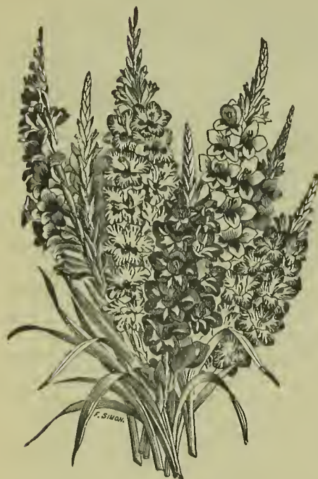
A GROUP OF BARR'S GLADIOLUS GANDAVENSIS.

PLANTING TO ADVANTAGE. —Gladioli are most effective when planted in clumps of three to twelve; for a bold handsome effect plant in groups of fifty, a hundred, or more. In Rhododendron beds and amongst shrubs they are exceedingly effective, especially when associated with Lilies, Cannas, Tritomas, Hyacinthus candicans, Plantain Lilies, &c.