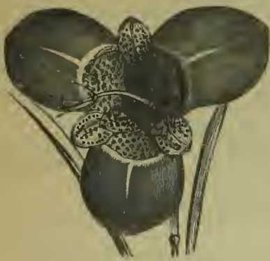
TIGRIDIA GRANDIFLORA RUBRA.

No flower is more gorgeously coloured or more beautiful. The bulbs can be planted out-doors March, April, or May in a sunny situation; but for indoor decoration put up as soon as bulbs are received and plunge in a cold frame, withholding water till the foliage appears, and then giving sparingly at first. Those bulbs intended for out-doors should be stored in dry soil or sand, away from frost till time for planting. ( Beautiful Coloured Plate of T. Alba , price 6d.)