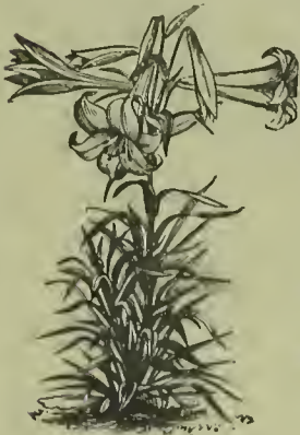
LILIUM LONGIFLORUM ROBUSTUM.