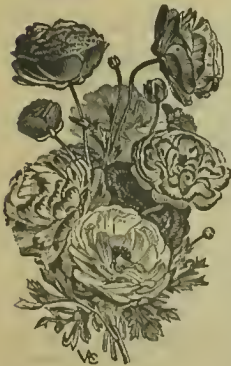
BARR'S TURCO-PERSIAN RANUNCULI.

CULTURE. —Plant the Turban and Turco-Persian Ranunculus from October to March, and the Persian varieties from January to April in light richly manured soil. Select a dry day for planting and draw drills two inches deep and five or six inches apart ; at the bottom of the drill sprinkle a little sand, press the tubers firmly into the soil, claws downwards , and cover them with sand, then with soil, keeping the crown of the tuber two inches under the surface. Cover the early plantings with long straw, cut heather, or other light material , which remove in spring when danger of severe frosts is gone. In April and May, during dry weather, water the beds freely, two or three times a week, if necessary, and when the flower-buds appear, water daily if required, and continue doing so while the plants are blooming ; this will insure fine flowers. In watering, wet the foliage as little as possible . While in growth the plants must be protected from cutting winds, and this can be managed by sticking in the bed cut evergreen branches. If grown as pot-plants put three tubers in a 4-inch pot and plunge out of doors until well rooted.