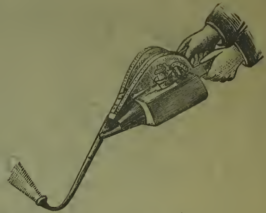
THE MALBEC BELLOWS DISTRIBUTOR Price 7/6 each.