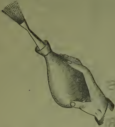
INDIA-RUBBER DISTRIBUTOR. Price 2/6 and 3/6 each.