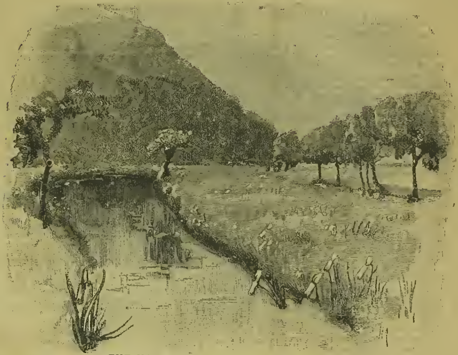
THE HOME OF NARCISSUS CYCLAMINEUS.

AWARDED THE ONLY GOLD MEDAL, AT THE SECOND GREAT DAFFODIL CONFERENCE, APRIL 15th to 18th, 1890.