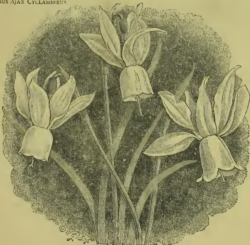
NARCISUS TRIANDRUS ALBUS (ANGEL'S TEARS).

BARR & SON, 12 and 13 King Street, Covent Garden, London.