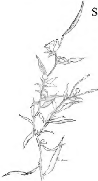
Dirubromicon rigida

Regional Parks Botanic Garden Tilden Regional Park, Berkeley