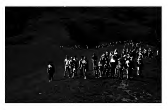
Manny is hard to pick out but Las Trampas grasslands stretch as far as the eye can see.