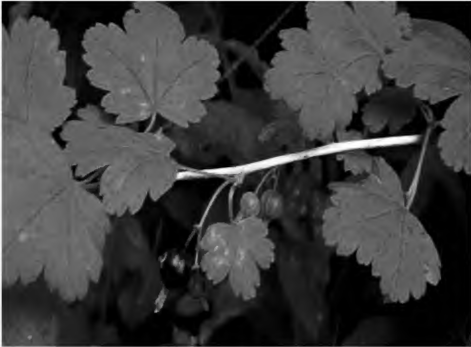
Ribes divaricatum var. pubiflorum

value, this is an excellent choice. For the month of February, buy one Ribes divaricatum at the regular price and get a second one (same or smaller size) for one dollar!