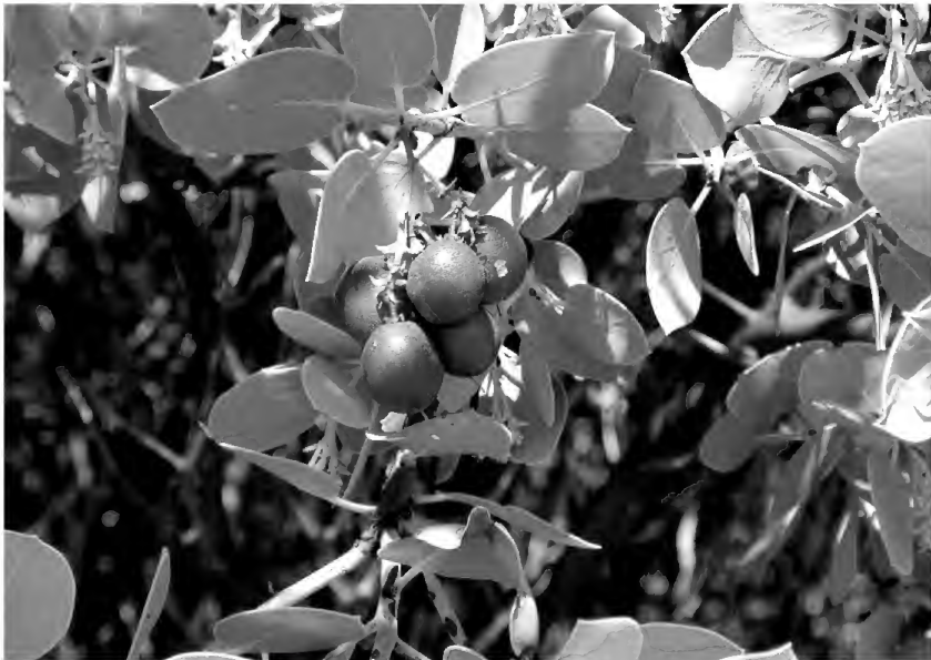
Arctostaphylos auriculata (Mt. Diablo manzanita)

A. auriculata is limited in range to Mt. Diablo. It is listed by CNPS as IB.3, rare, threatened, or endangered in CA and elsewhere.