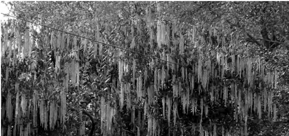
Garry elliptica (coast silk tassel), Piedmont